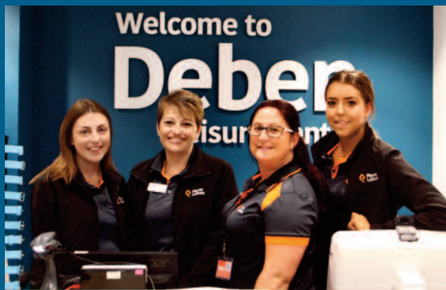
The dedicated team at Deben Leisure Centre.