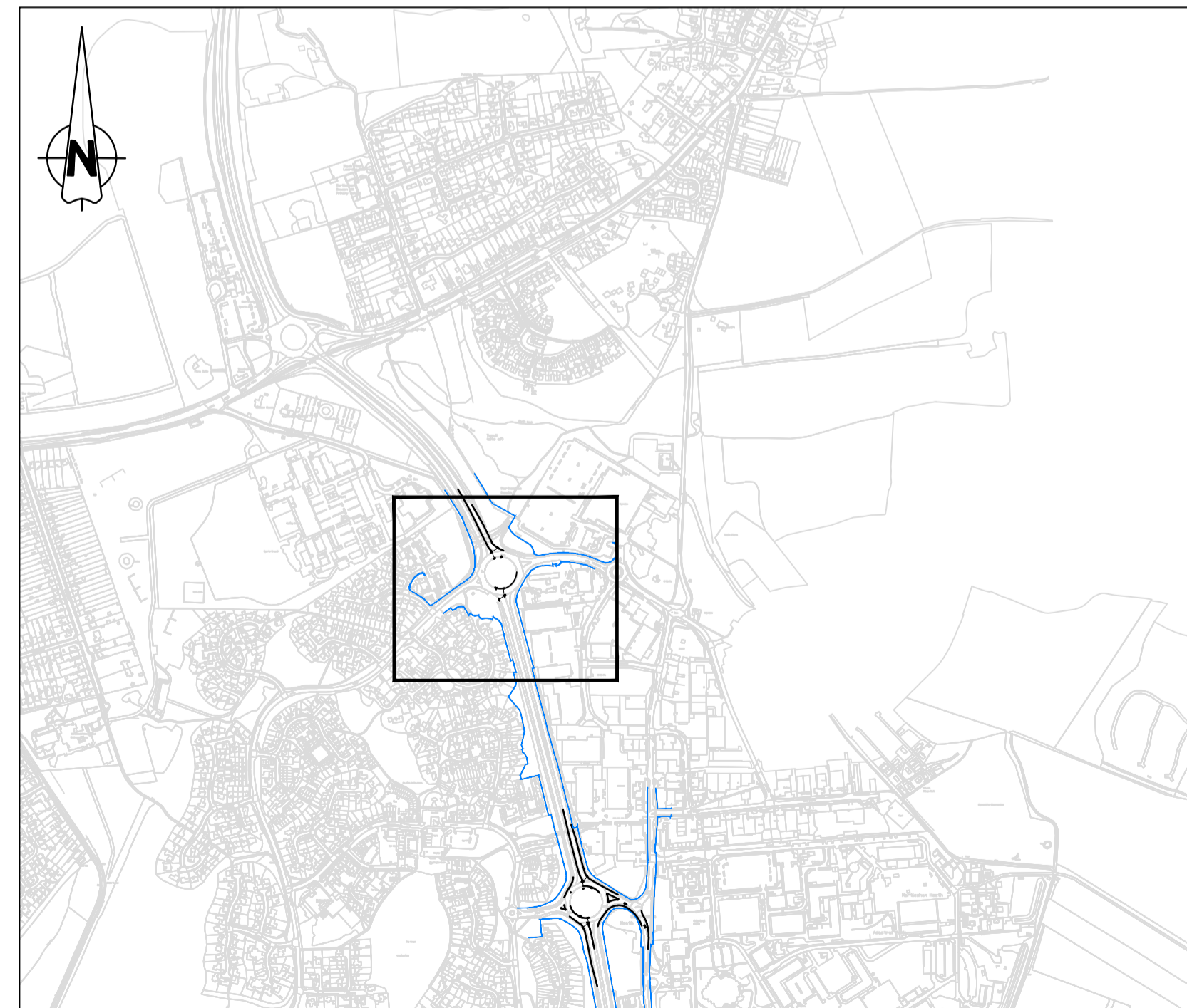
Context Plan Scale: 1:10000