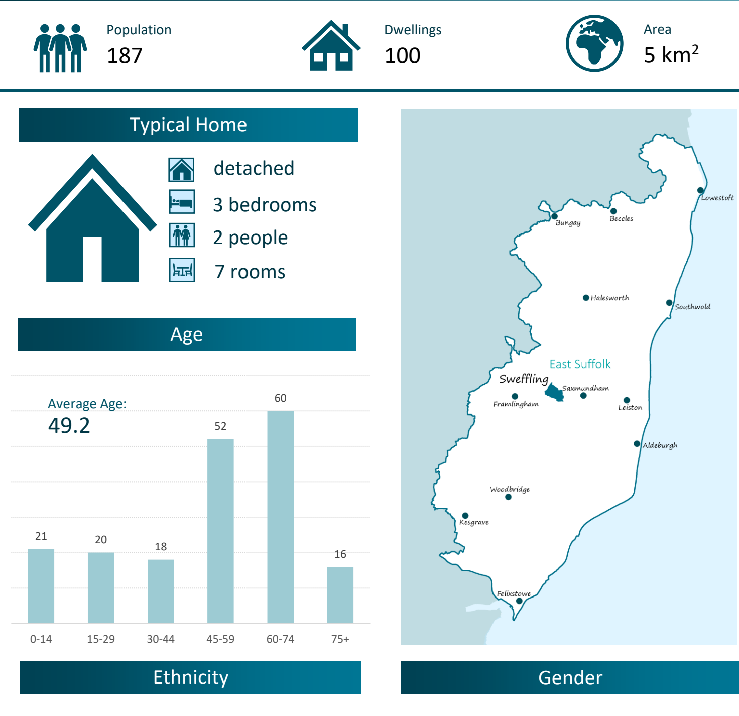
Published October 2019