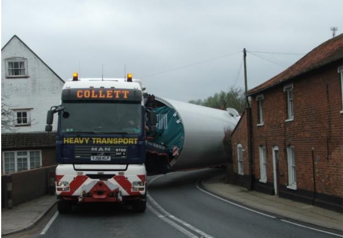
Large load negotiating the "Farnham Bend" on the A12

The Suffolk Energy Coast Delivery Board has been set up by the local authorities and Government Departments (led by Energy and Climate Change) principally to act as a forum to enable close co-operation between levels of government in maximising the economic opportunities offered by Sizewell C and other energy developments. The need to have a conversation with Government on A12 transport issues emerged from the meetings of this Board.