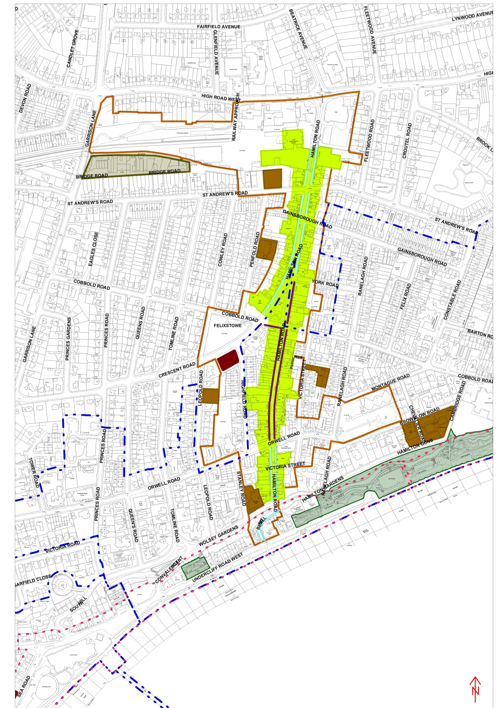
Town Centre Inset Map - not to scale