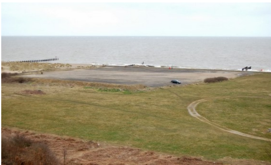
View of Area D from Gunton Cliff