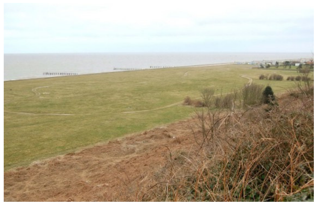
View over Area A from the north west

2.7 Area B , marked and shown edged in green on Plan 2, forms part of the middle of the Site and measures approximately 3.12 acres (1.26 hectares). The boundary line between this area and Area A will follow the present fence line. The area is made up of grassed areas and surfaced roads. Also located in this area are a toilet and shower block, an administrative office and shop. Area B (along with Area C) has planning permission for use as a static caravan site for up to 275 caravans. This area is not subject to any restrictive covenants concerning its use.