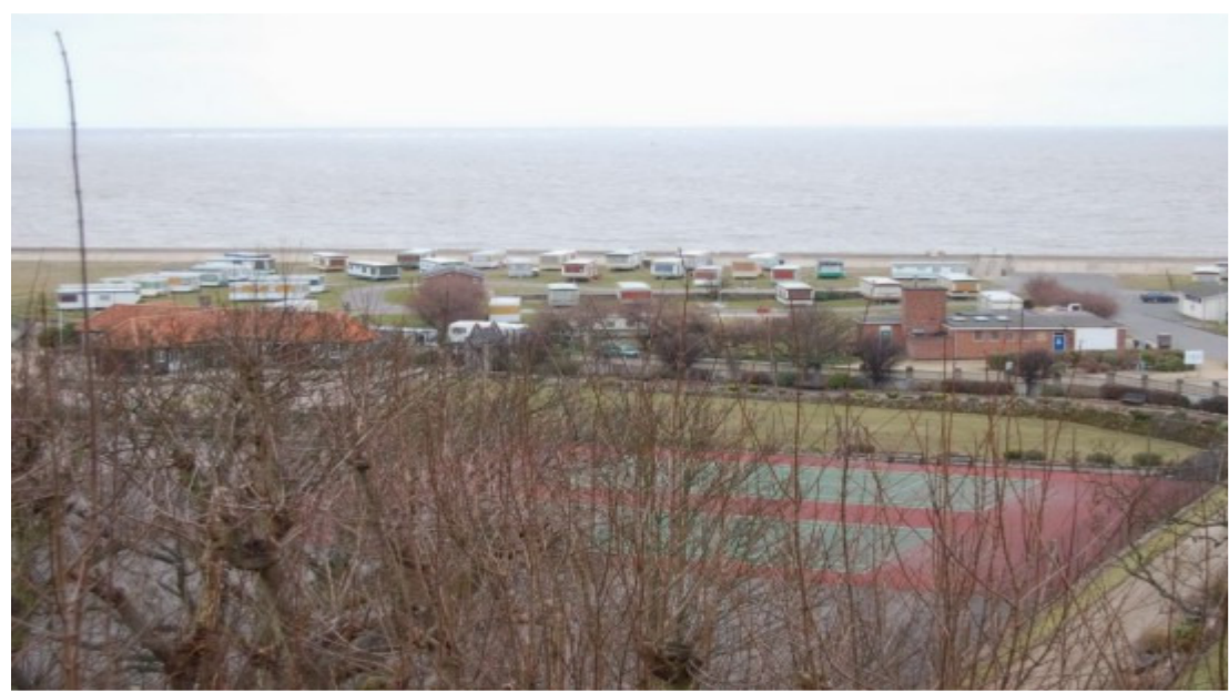
View of Area B from Gunton Cliff

2.7 Area B , marked and shown edged in green on Plan 2, forms part of the middle of the Site and measures approximately 3.12 acres (1.26 hectares). The boundary line between this area and Area A will follow the present fence line. The area is made up of grassed areas and surfaced roads. Also located in this area are a toilet and shower block, an administrative office and shop. Area B (along with Area C) has planning permission for use as a static caravan site for up to 275 caravans. This area is not subject to any restrictive covenants concerning its use.