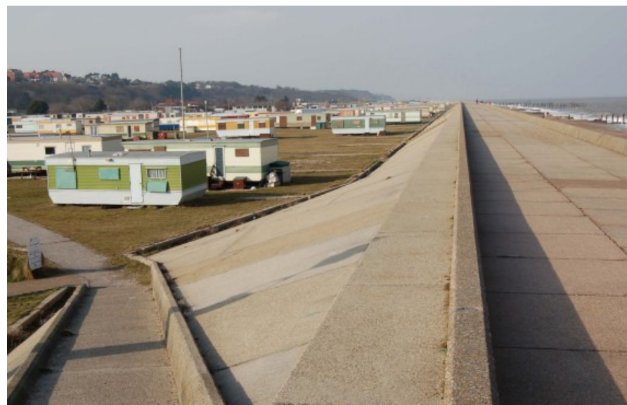
View of Area C looking from the southeast sea wall

2.8 Area C , marked and shown edged orange on Plan 2, is the southern part of the site and measures approximately 7.95 acres (3.22 hectares). The area is made up of grassed areas and surfaced roads. The Ravine road continues through this part of the site (and the part that runs through the caravan park is known as Swimming Pool Road), although it is not adopted. This road has already been closed off to vehicular access to the public (albeit access is still allowed by the public on foot and by bicycle). This road forms the northern boundary and gives the emergency services access to the sea wall area. Also located in this area are toilets and a shower block. Area C has planning permission for use as a static caravan site for up to 275 caravans (in conjunction with Area B). This area is not subject to any restrictive covenants concerning its use.