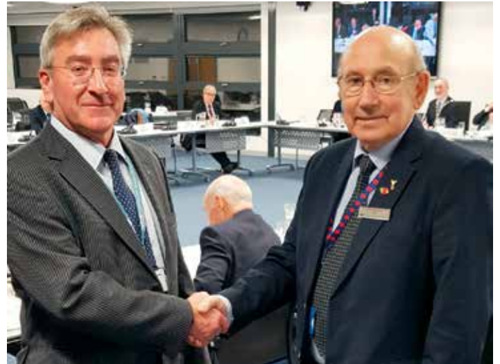
Suffolk Coastal and Waveney District Councils agreed to proposals in January