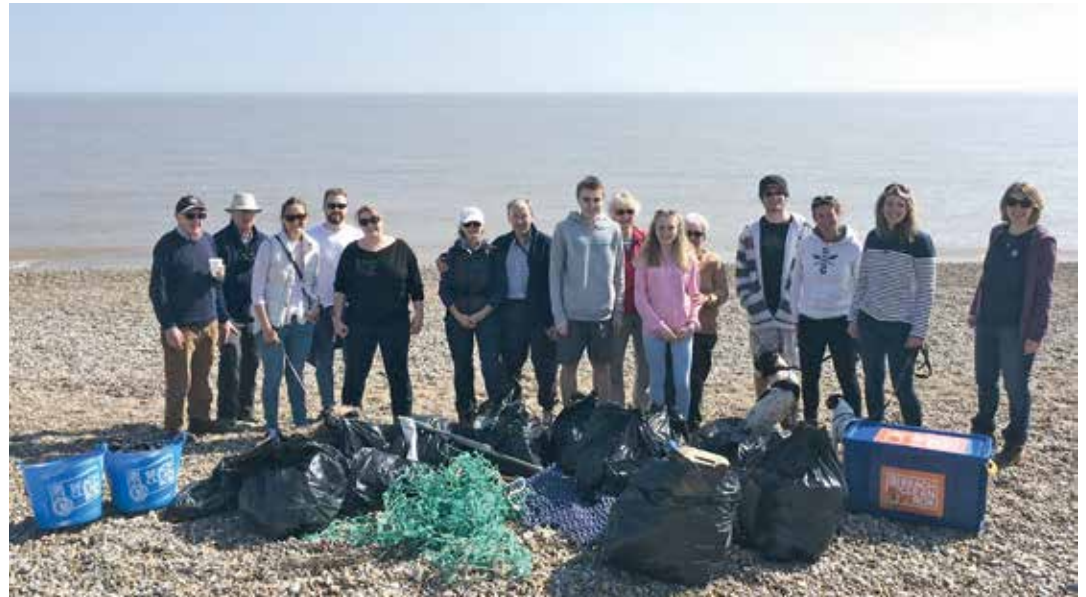
Thanks to Surfers Against Sewage who’ve helped clean up Aldeburgh beach

All registered groups who took part during this period have also be entered into a prize draw, with prizes of £200 awarded to winning groups in each of five “neigh-