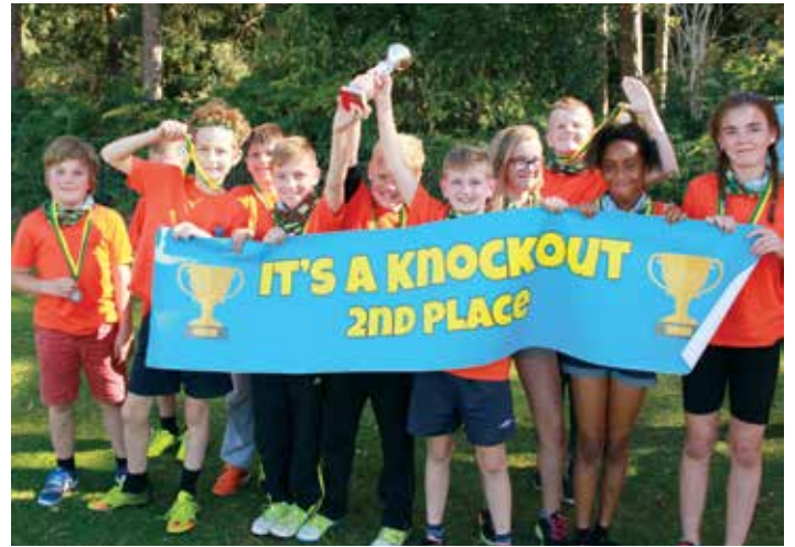
Kids can take part in the summer activity from 8-11 August

To take part contact Active Communities, by calling: