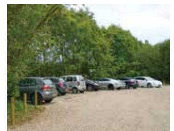
Work to improve the Melton Riverside car park was completed in January

to receive ongoing maintenance by Suffolk Coastal Norse.