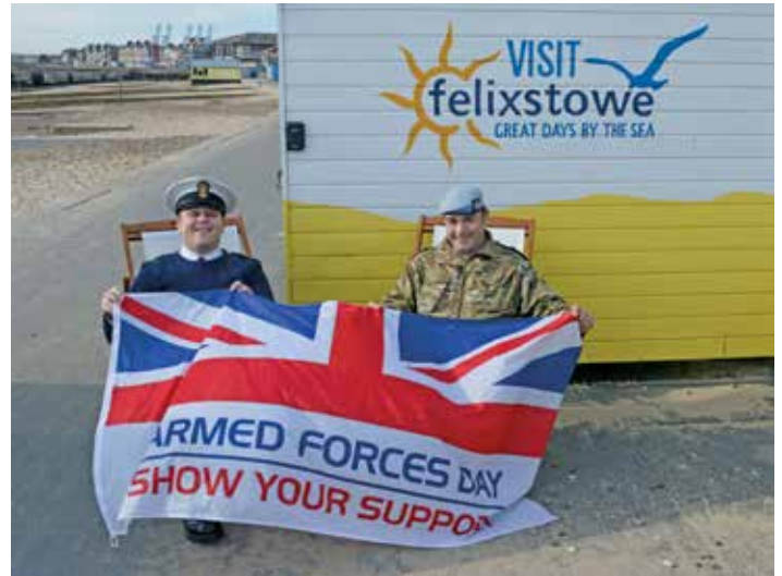
Celebrate our Armed Forces on 24 and 25 June!

The weekend is being organized by the Suffolk Armed