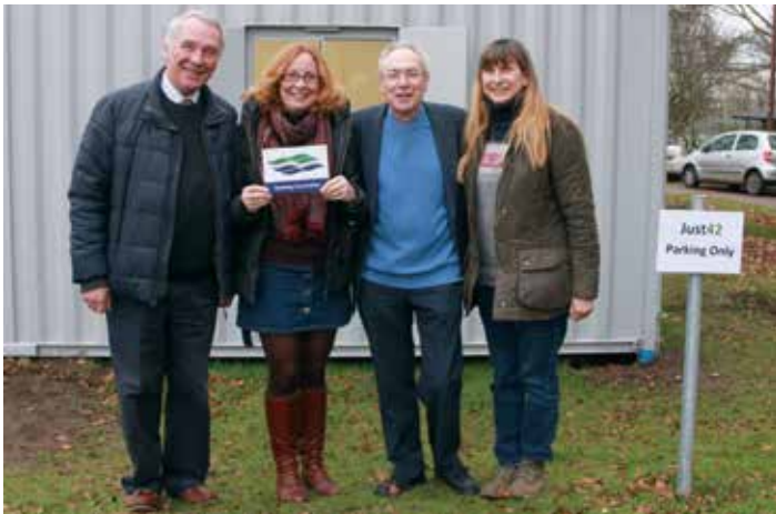
Just42 now has a new home!

Funding from Suffolk Coastal's Enabling Communities Budget has helped a local youth charity secure accommodation in Woodbridge for the next five years.