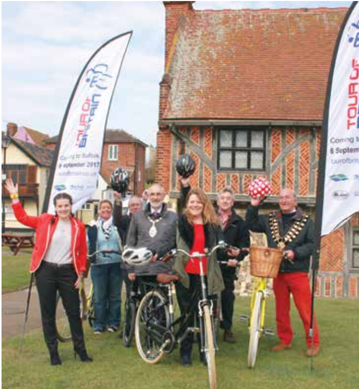
Stage Six finishes on Aldeburgh's High Street on Friday 8 September