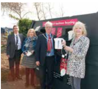
You can now recycle small electrical appliances in Woodbridge and Saxmundham

It is now even easier for residents in and around Woodbridge to recycle their electronic and textile waste.