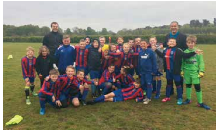
Funding is also supporting AFC Kesgrave's Futsal team

have become a popular addition for members of the football club and I hope the technical skills and creativity that come with this growing sport will help develop players ability and