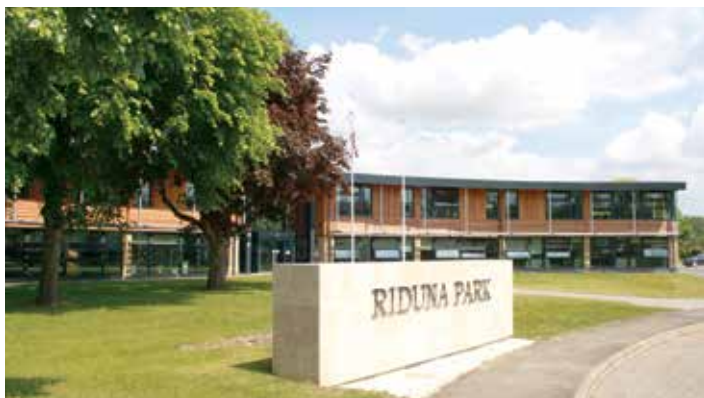
Our new office premises at Riduna Park, Melton

Suffolk Coastal moved into new office premises at Riduna Park in Melton in December.