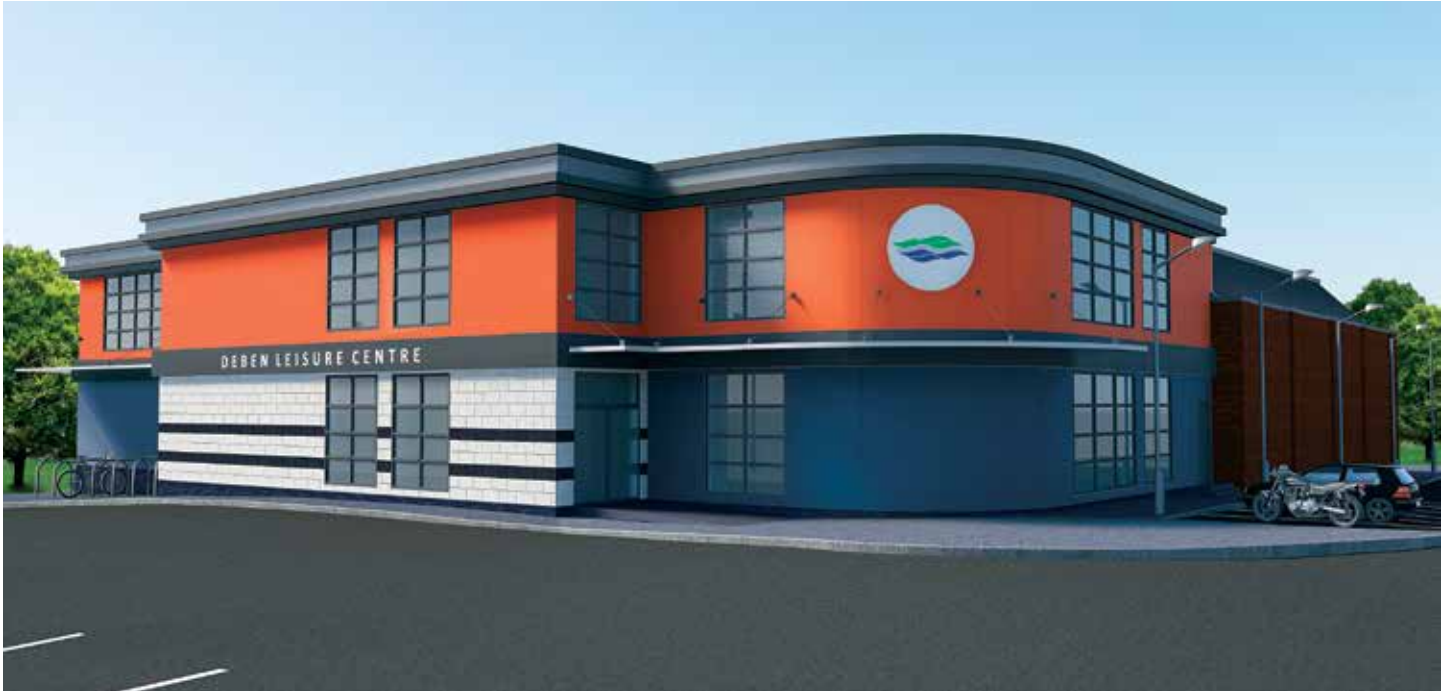
An artist's impression of the new Deben Leisure Centre

A five-year programme to reinvent leisure facilities in Suffolk Coastal is set to start this autumn.