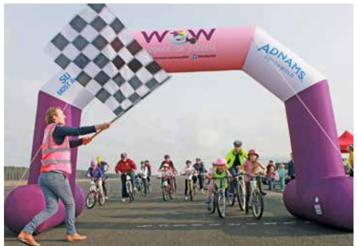
Girls and women of all ages are invited to take part in WOW 2017!

www.eastsuffolk.gov.uk/development/women-on-leisure/sportandleisure-wheels