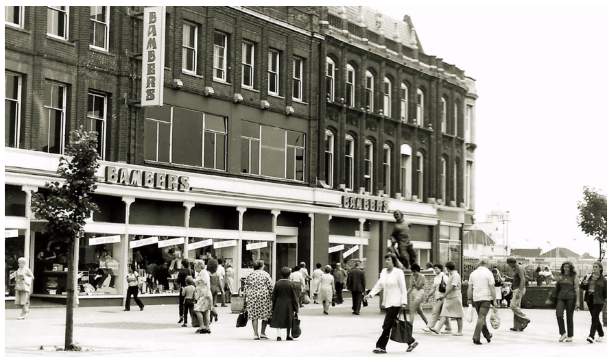
Bambers, Station Square early 1980's.

So, if you have any photographs or memories which you wish to share, please get in touch with Poetry People on Facebook (@thosepoetrypeople), Heritage Action Zone social media channels, or by emailing economicregen@eastsuffolk.gov.uk