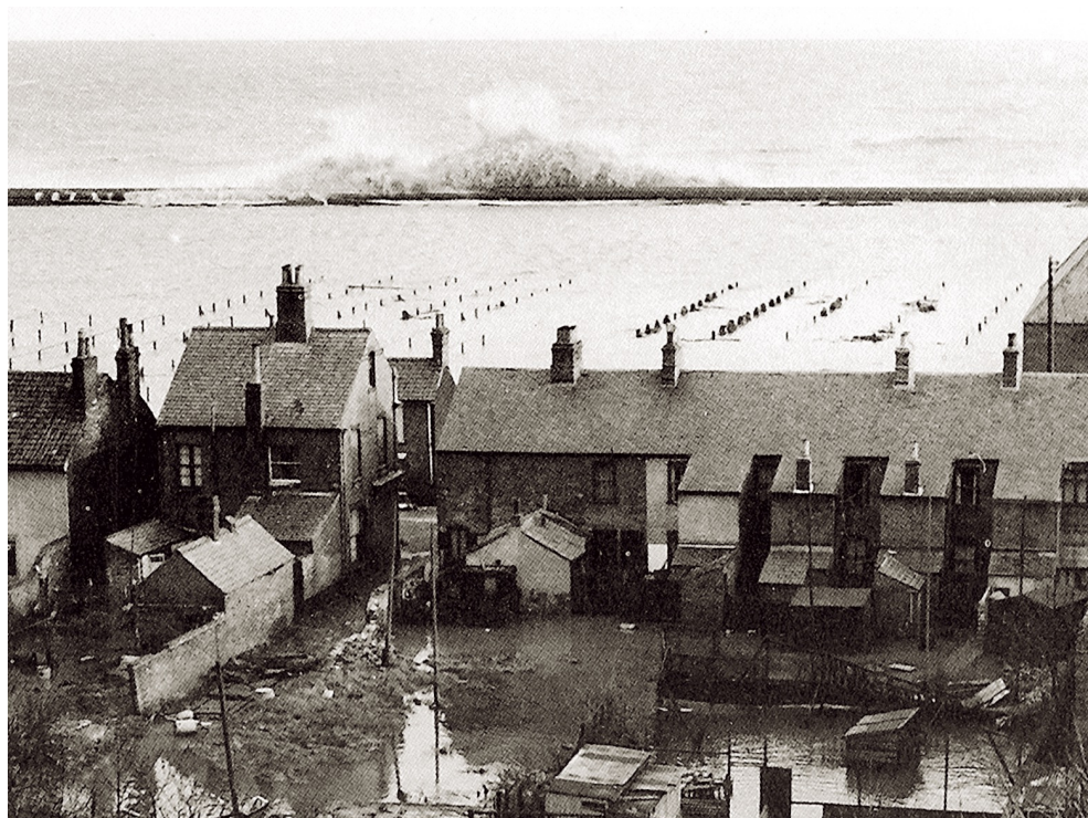
Whapload Road, 1st Feb 1953 after the flood.