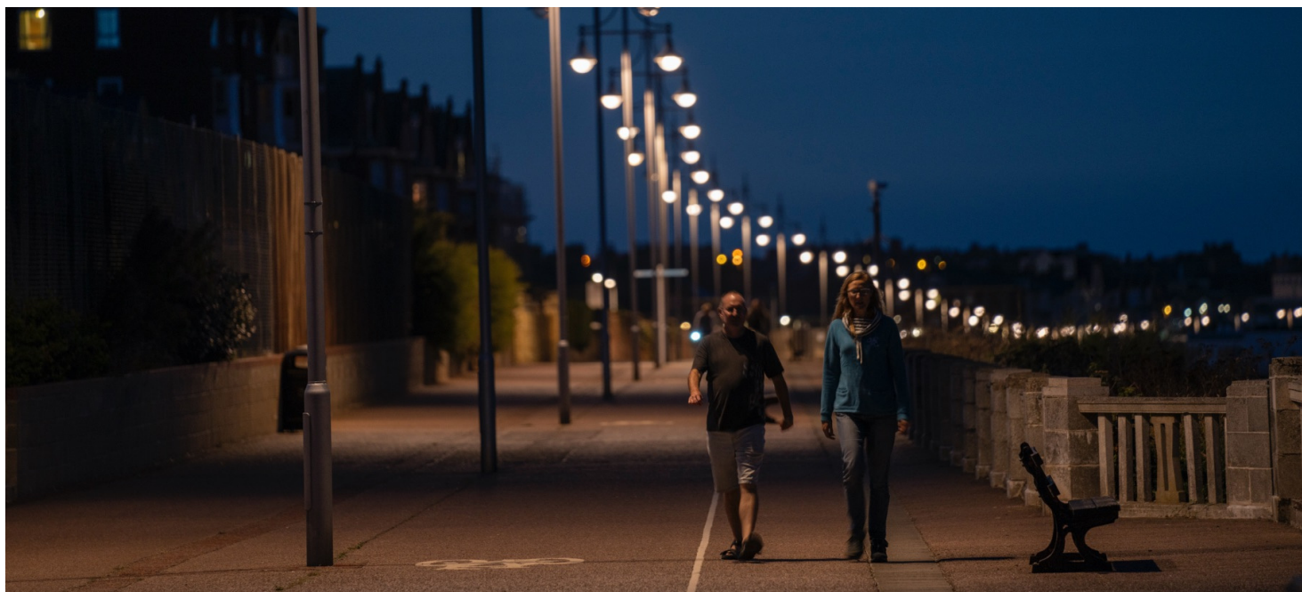
Lowestoft Seafront, taken as part of East Suffolk Council's place branding.

NEWS FROM THE LONDON ROAD, (SOUTH) LOWESTOFT HIGH STREET HERITAGE ACTION ZONE