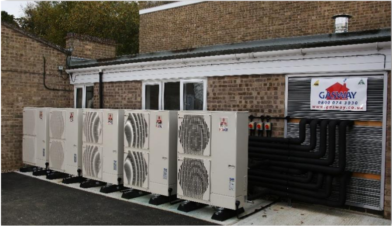
Example of a retired living scheme in East Suffolk that was fitted with a commercial air source heating system to improve the energy efficiency of the building.