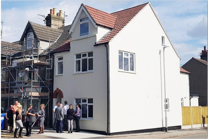
Example of a property in East Suffolk that has been renovated with external insulation applied and rendered. The property was also installed with double glazing to improve energy efficiency and a 6 bike cycle rack to increase the opportunity for sustainable travel.