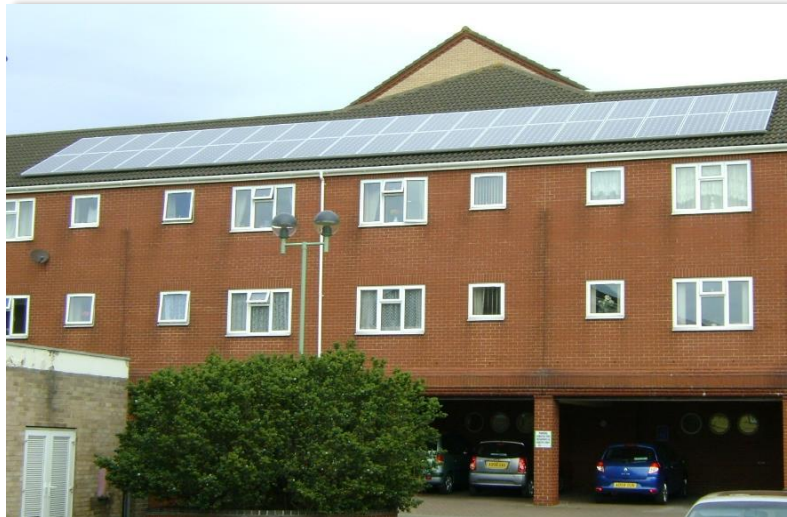
Example of a retired living scheme in East Suffolk where a south facing roof face provided an opportunity to install Solar PV panels to improve the energy efficiency of the building.