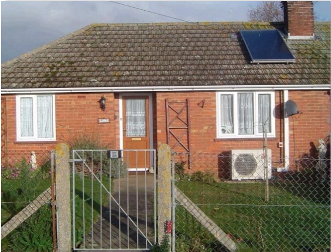
Example of a property in East Suffolk that has installed a solar thermal heating system to reduce the amount energy the property consumes.