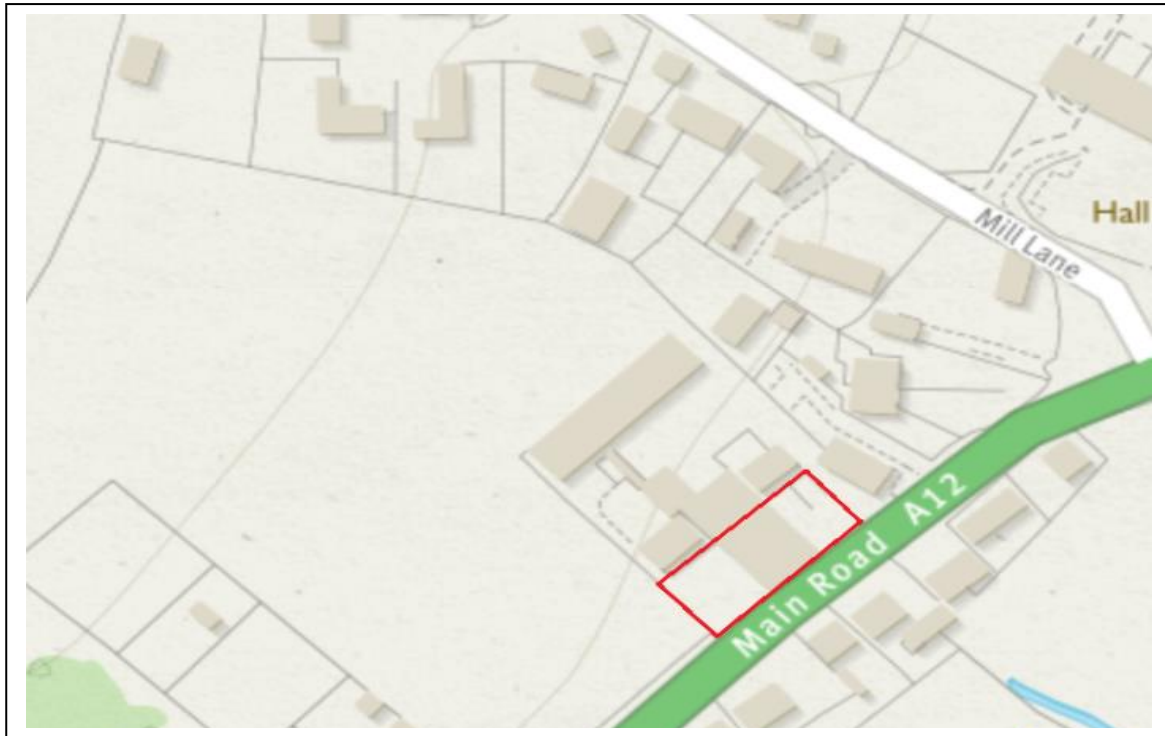
Location of Permitted Installation