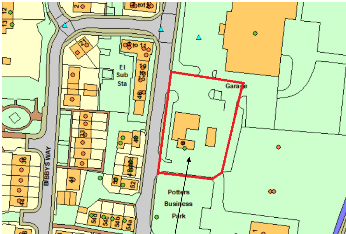
CO-OP Petrol Filling Station, Station Road, Framlingham, Suffolk, IP13 9EE