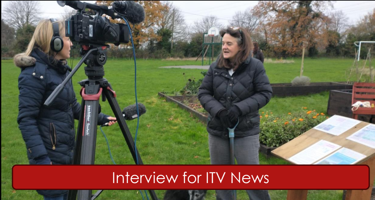
Interview for ITV News