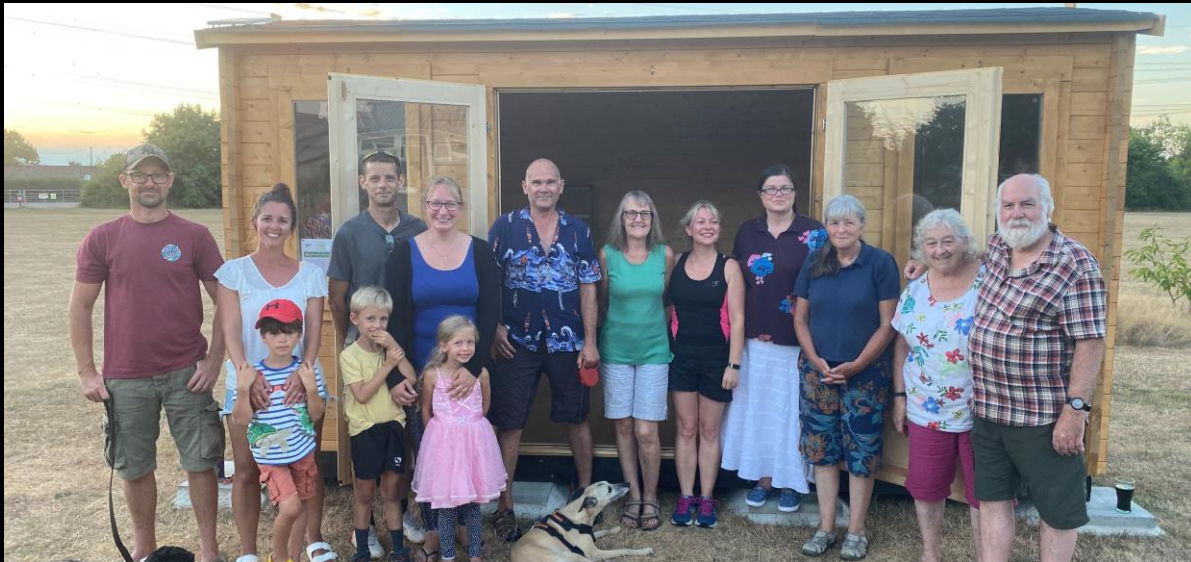
We try to meet up on Sunday afternoons in spring and summer and have a rota for daily monitoring