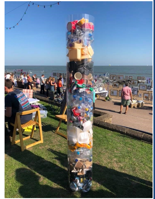
Re-used plastic crafts, waste-free pebble art and litter fishing game; community litter action; community litter art

A plastic action champion is a volunteer (or indeed a group of volunteers) who: