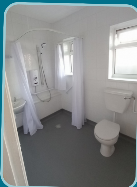
Typical Level Access Shower