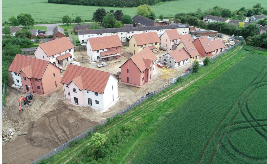
Lavenham CLT, Suffolk

PEEK CLOSE DEVELOPMENT