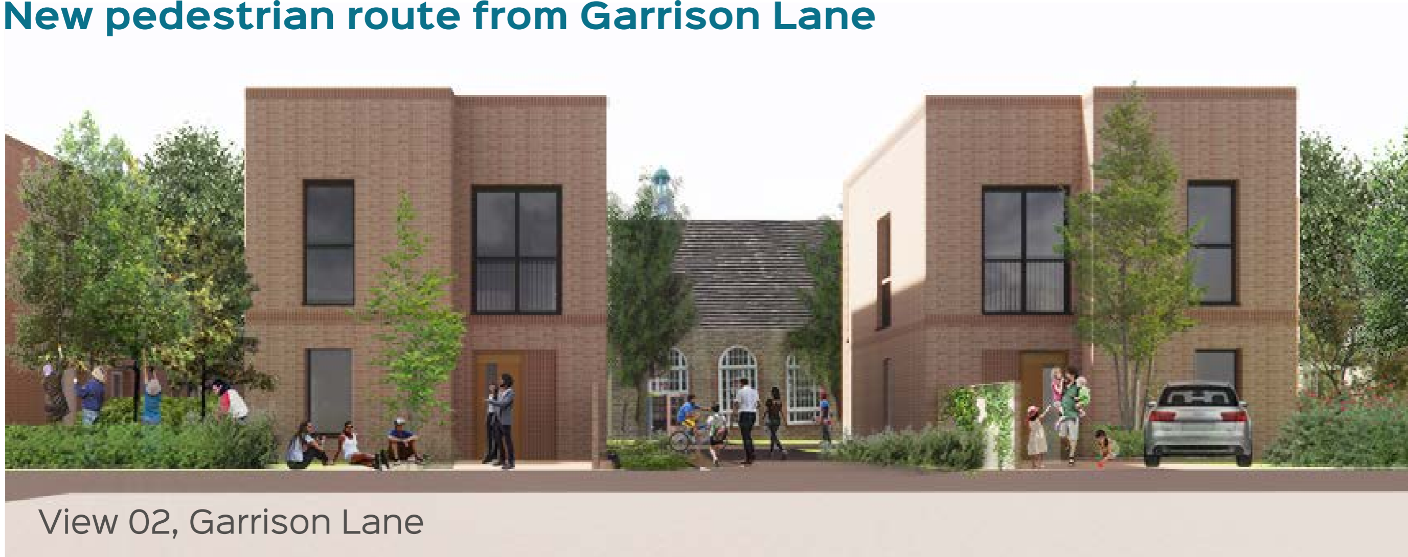
View 02, Garrison Lane