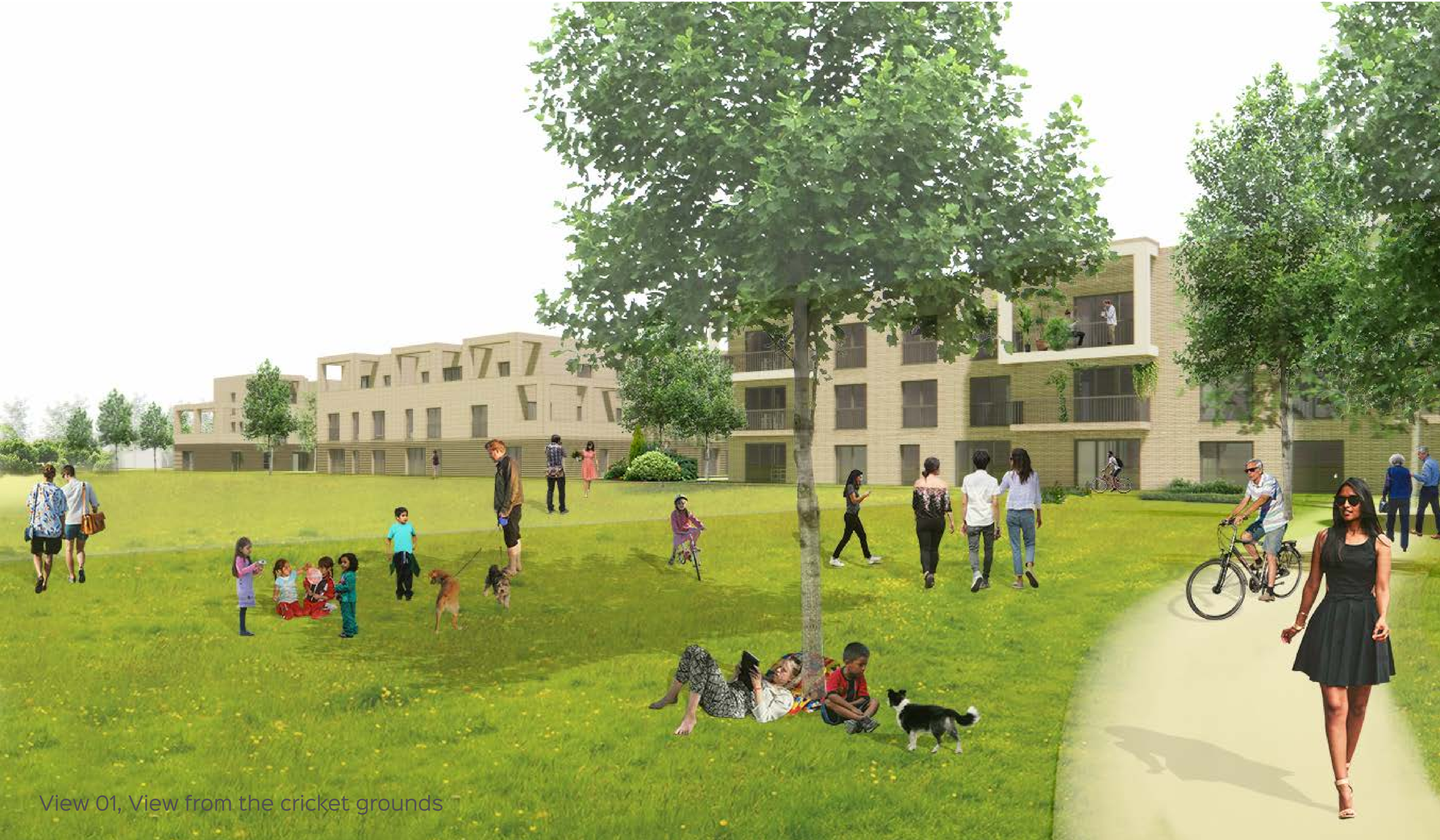
View 01, View from the cricket grounds