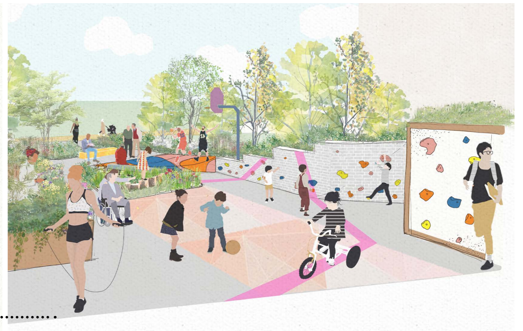
View into one of the Playstreets