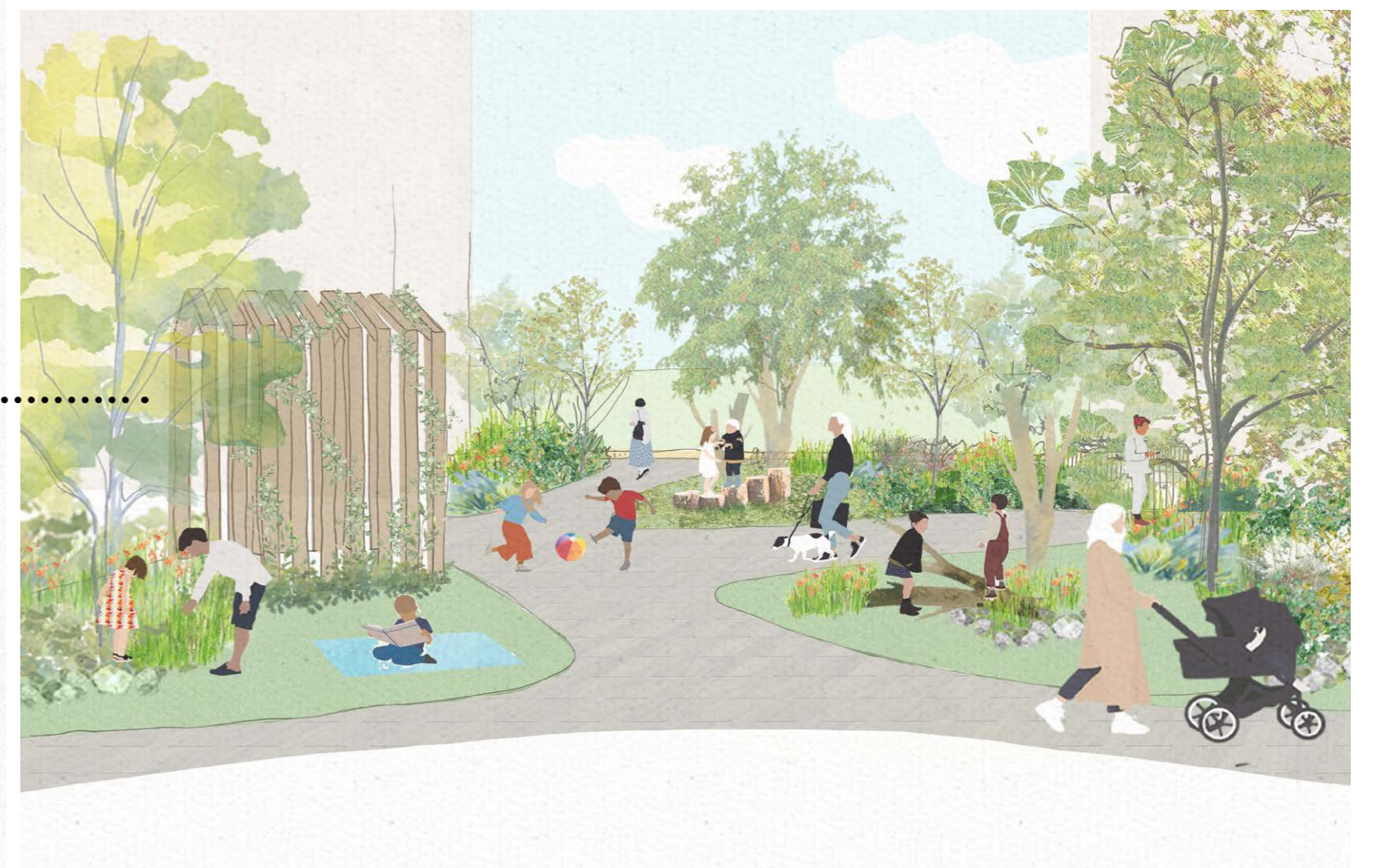
View into a verdant and playable courtyard garden