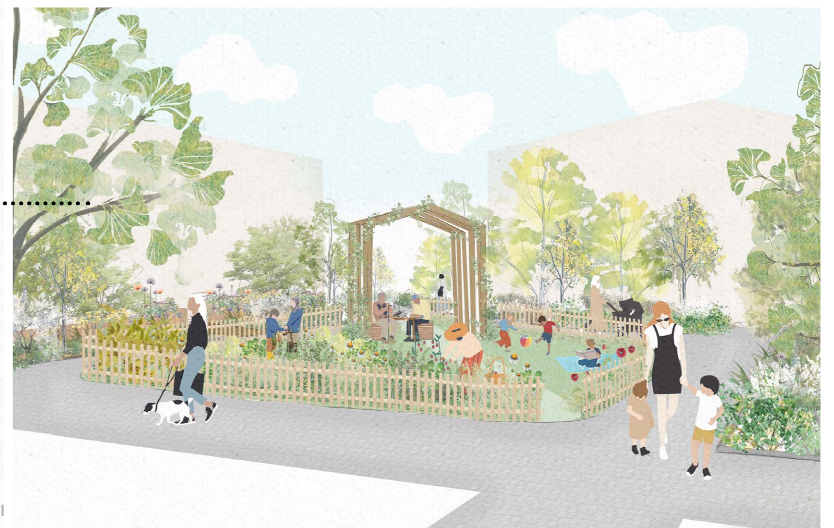
View into the community Garden by The Hall