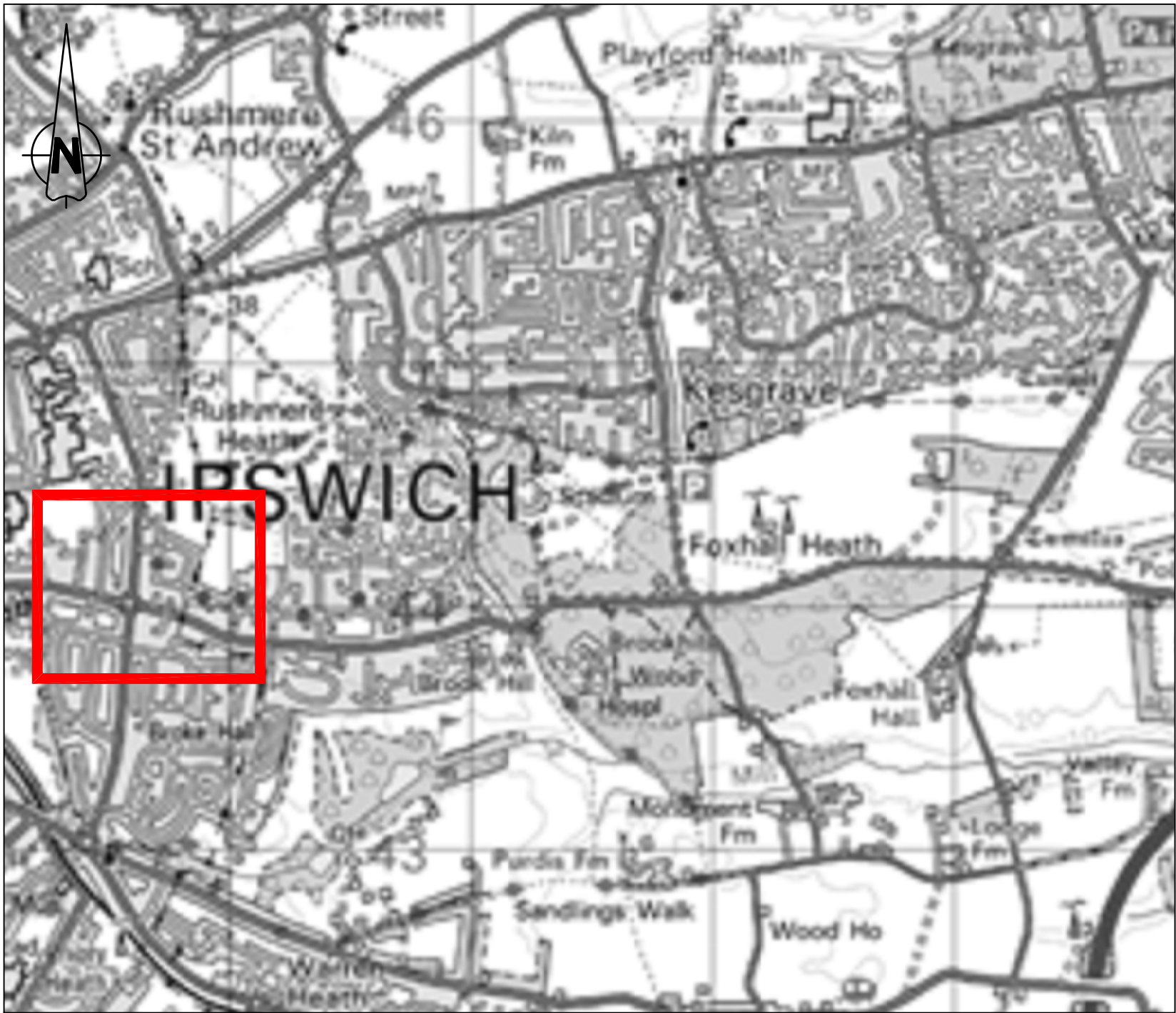
Context Plan Scale: 1:10000