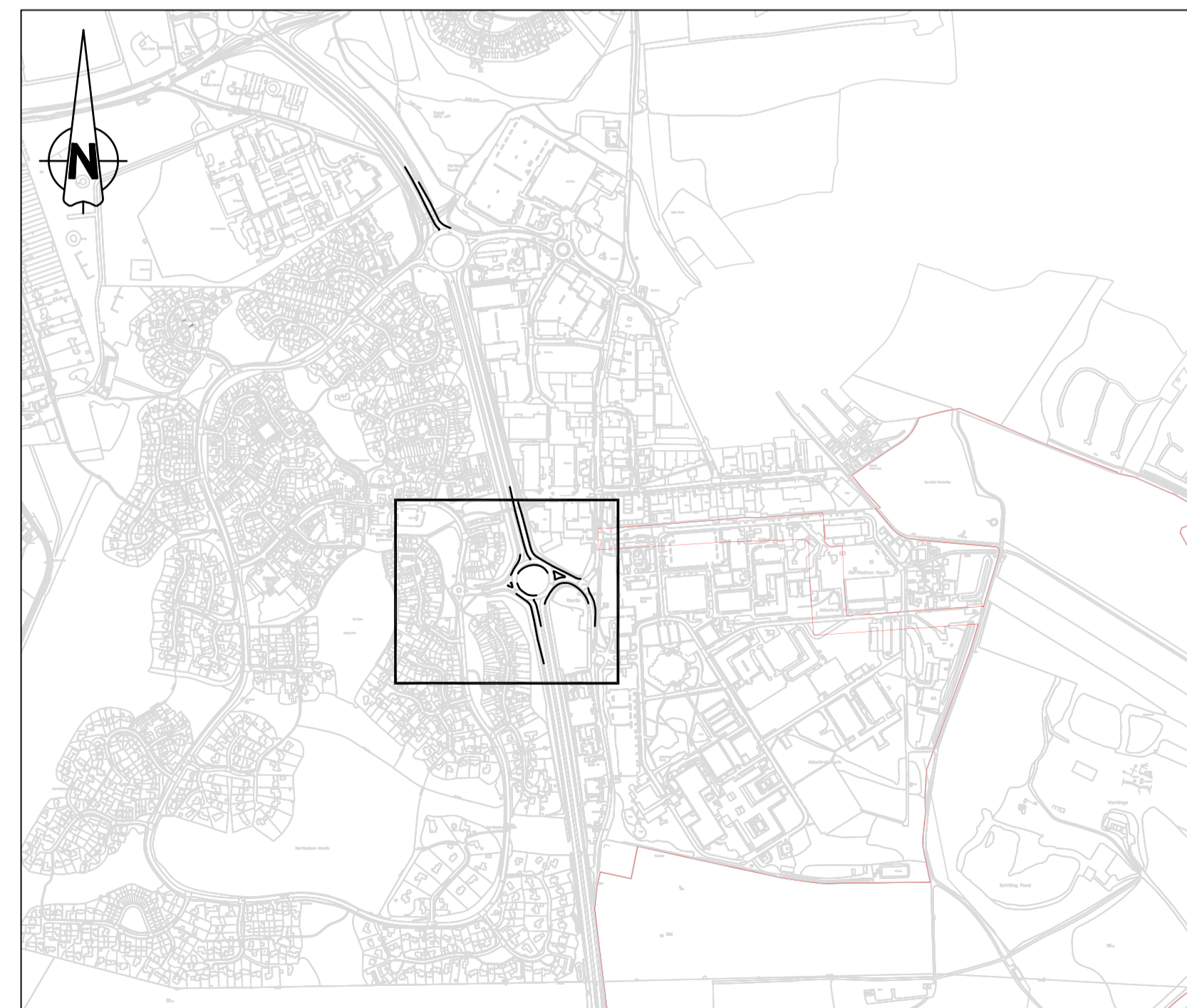
Context Plan Scale: 1:10000