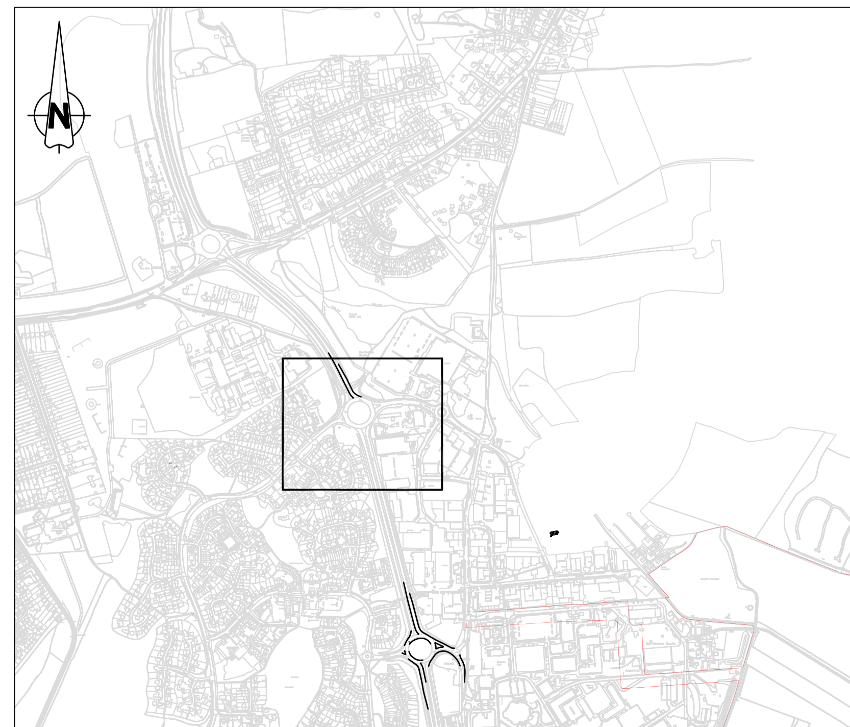
Context Plan Scale: 1:10000