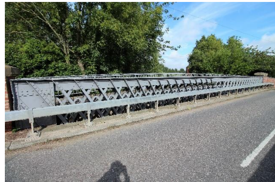
Falcon Bridge, Bridge Street

No.45 Bridge Street (grade II). A seventeenth century, two storey brick building, with a twentieth century cement rendered ground floor. Timber framed, plastered and with twentieth century applied half-timbering to the first floor. Red pan tiled roof. Three, three-light casement windows to the first floor. Small former shop window to ground floor right probably of later nineteenth century date. Four panelled front door of probably twentieth century date with near-flush frame. Gabled return elevation to the bridge with applied timber framing and casement windows. Lower outshot to rear. Nos.29 to 45 (odd) form a group.