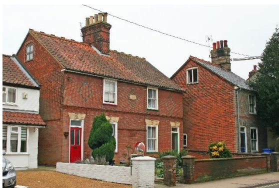
'Laurel Villas', Nos.38-40 Lower Olland Street

Subsidiary Structures Low red brick boundary wall to Lower Olland Street with square-section piers.