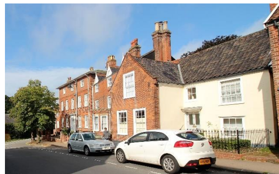
No.48 Earsham Street

No.44 Earsham Street. An early nineteenth century terraced house formerly attached to the hall of Bungay Grammar School but now free standing. Red brick, which was formerly rendered, with external joinery sympathetically replaced late twentieth century. Edwardian photographs show that the first-floor window was formerly of three lights with small leaded panes within. The door had glazed upper panels as today.