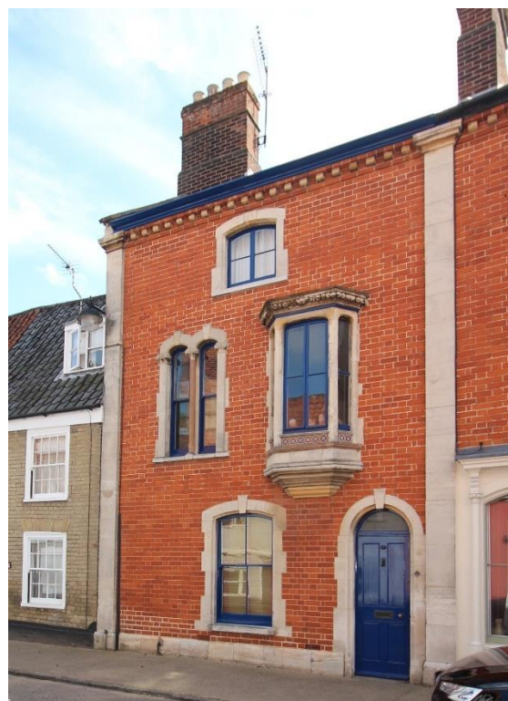
No.38 Bridge Street

No.36 Bridge Street (local list). A substantial later nineteenth century red brick former shop and dwelling with painted stone dressings, dentilled eaves cornice and full height pilasters. Plate glass sash windows. Three storey, two bay principal façade. Arched doorcase with keystone and four panelled door within rendered later nineteenth century former shop fascia. Simple semi-circular fanlight. Twin shallow arched windows to left with keystones beneath a corbelled cornice. Passage way with boarded door within shallow arched opening to right. Substantial red brick chimneystack. Forms part of a semi-detached pair with No.36.