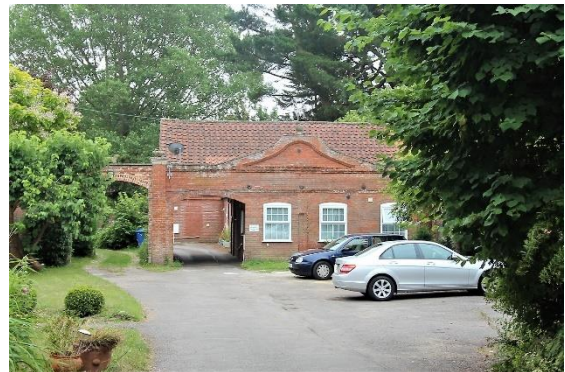
Former outbuildings Bridge House, Bridge Street

Earlier portion at rear, of two storeys and an attic, three dormers with segmental pediments. Brick, rendered. Tiles. Five flush-frame sash windows with glazing bars, and a canted oriel. four-panelled central door in wooden case with consoles. Second door, right, with six flush panels and a pedimented hood. Chateaubriand resided here in 1795 when the house was occupied by the Reverend J Clement Ives. Nos. 2, 4, 6a & 6b, 12 to 20 (even), 24 to 34 (even) 40 to 44 (even), 48 and 50 form a group. Bettley, J, and Pevsner, N, The Buildings of England, Suffolk: East (London, 2015) p.156-157.