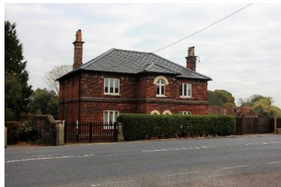
No.55 St John's Road

floor. The full height gabled and jettied porch projection has a similar first floor window and a small sash in the gable. The oak door is in original condition, divided into ten panels by moulded battens, in heavy moulded frame with enriched stop-chamfer. Original wooden case lock, bolts and fittings remain. Twentieth century multiple splayed bay window to ground floor, right. The stair is a fine example of the period in oak with turned balusters, moulded rail, strings, and newels. No. 53, has its entrance on the south-eastern face, it is of two storeys and an attic which is lit by a window within the gable. Timber-framed and plastered, mullioned and transomed casements, (one blocked but showing frame). The St John's Road façade has hornless sash windows in flush frames in the gabled wing. Six-panelled door with an arched radial bar fanlight. Twentieth century bay window ground floor. Good Adam type mantel. Bettley, J, and Pevsner, N, The Buildings of England, Suffolk: East (London, 2015) p.158.