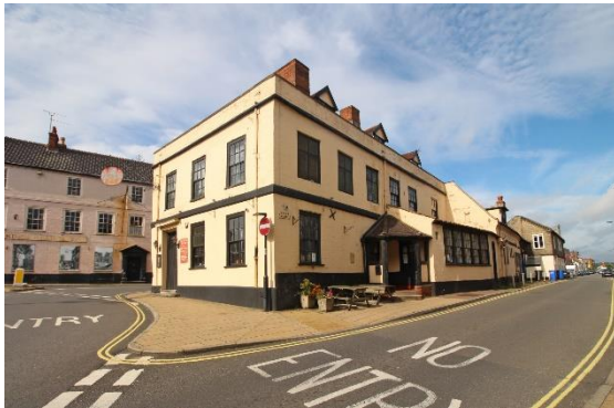
Broad Street and Market Place facades of The Three Tuns, No.2 Earsham Street

twentieth century and is not included within the listing. Hipped plain tile roof with two massive red brick ridge stacks, and three flat roofed dormers to the Earsham Street façade. Faced in painted red brick with a plat band below the first-floor windows, and a high plinth. Four first floor original leaded mullion transom windows to Broad Street front, the rest being sashes in flush frames in replacement of the originals, flat arches. At ground floor, former garage, and butcher's shop with wood fronts. Earsham Street façade of seven bays with a centrally placed six-panelled door with an arched fanlight (now blank) in a wooden case with Doric columns and an open pediment.