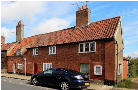
Nos.54 & 56 Broad Street

Nos.54 & 56 Broad Street A pair of cottages with early nineteenth century facades and steeply pitched red pan tile roofs. Shared central ridge stack. Possibly a re-fronting of an earlier structure. Casement windows. Those to No.56 are of late twentieth century date, however the first-floor window of No.54 may be earlier. Twentieth century front doors. Wedge shaped lintels to door and window openings. No.54 has a single storey late twentieth century addition to the rear and a rendered return elevation.