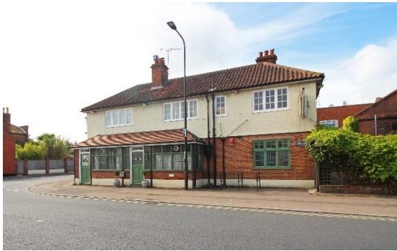
The Green Dragon Public House, No.29 Broad Street

No.21 Broad Street. Formerly a pair of early nineteenth century cottages, now a single dwelling. Red brick with a dentilled eaves cornice and a black pan tiled roof. Boarded door at northern end and a blocked door opening at the southern end. Twentieth century casement windows. Despite alteration this dwelling contributes positively to the adjoining grade II listed Nos.15-19 (odd).