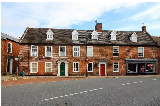
Nos. 4-8 (even) Earsham Street

No.4a Earsham Street. A structure of c1870 consisting of a shop with living accommodation above which replaced a timber-framed gabled building which is shown on early photographs. Of two storeys and two bays and faced in red brick with a red plain tile roof and terracotta ridge pieces. Southern gable with finials and dentilled cornice. Its present façade is radically different from that shown in Edwardian photographs, which show a central canted bay window at first floor level and a central doorway flanked by two small pane sashes below. Four light horned plate glass sashes at first floor level. Dentilled eaves cornice. Early to mid-twentieth century shop fascia, with late twentieth century partially glazed door inserted post 1977 within the original fascia. Reeve C, Bungay Through Time (Stroud, 2009) p38.