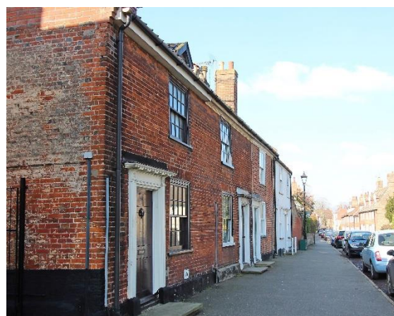
Nos.40-44 (even) Upper Olland Street

No.38 Upper Olland Street (grade II). Eighteenth century, of two storeys and an attic. Limewashed brick with a black pan-tiled roof. Two hornless, flush-framed twelve-light sash windows to each floor, cambered arched lintels to ground floor openings. Six-panelled door in wooden case with roundels and a mutular cornice. Nos.30 to 34 (even), Emmanuel church and Nos.38 to 52 (even) form a group.