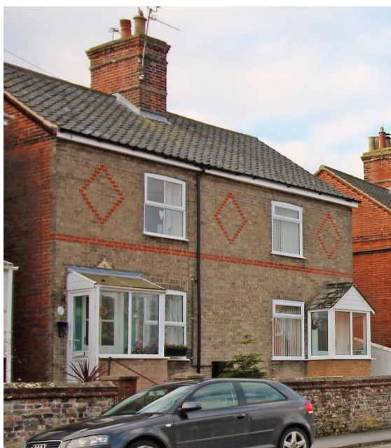
Nos.30-32 (even) Staithe Road

Kimberley Terrace Nos.12-28 (even) Staithe Road . Two terraces of red brick cottages of c1902. Gault brick cambered lintels to ground floor windows. Black pan tiled roof. Most external joinery replaced but original openings preserved. Contemporary red brick boundary wall to Staithe Road.