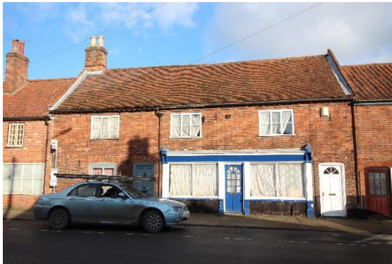
No.30 and 30a Broad Street

Nos.22-24 (even) Broad Street. A terrace of three two storey cottages, now two. Faced in red brick with gault brick lintels to door and window openings. Late twentieth century black pan tile roof covering. Red brick ridge stack to spine wall between cottages. A further ridge stack has probably been removed. No.22 has metal casements within original window openings and a glazed metal door. No.24 with four light horned sashes in heavy moulded frames. Return elevation has red brick lintels to openings and plain bargeboards. This short terrace forms an important part of the setting of the grade II listed Nos.20 and No.18.