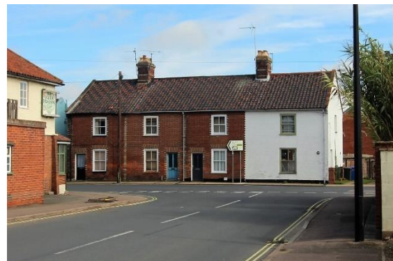
Nos.40-46 (even) Broad Street

No.38 Broad Street. A mid to late nineteenth century red brick two storey structure standing to the rear of No.40 Broad Street, also visible from Nethergate Street. Possibly built as a workshop. Four bay principal elevation with gault brick lintels to arched casement windows. Single storey red pan tile roofed projecting range. Return elevation to Broad Street has blocked arched window openings at first floor level and a larger blocked arched opening to the ground floor. Return elevation to Nethergate Street rendered. Red pan tile roof, red brick stack to rear. Good tall red brick boundary wall attached to rear gable. A building is shown on this site on the 1885 1:2,500 Ordnance Survey map.