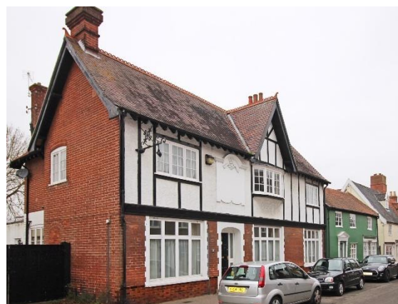
No.28 Upper Olland Street

No.26 Upper Olland Street . Probably of early nineteenth century date but much altered. Painted and rendered red brick. Red pan tiled roof. Three small pane casement windows to first floor. Late twentieth century pedimented doorcase and shop fascia. Whilst much of the external joinery has been replaced the openings correspond to those shown on early twentieth century photographs. The building has significant group value with neighbouring properties.