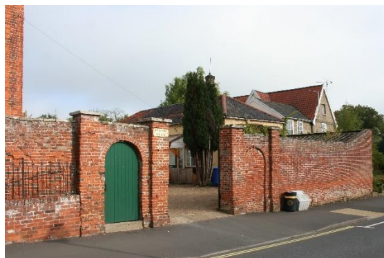
Front wall of courtyard, Trinity Hall, Staithe Rd

Entrance piers of front garden of Trinity Hall Staithe Rd (grade II). A later eighteenth-century pair of red brick piers, flanking the central entrance of the house. Stone caps and ball finials and pedestrian Gate of wrought iron with scroll ornament.