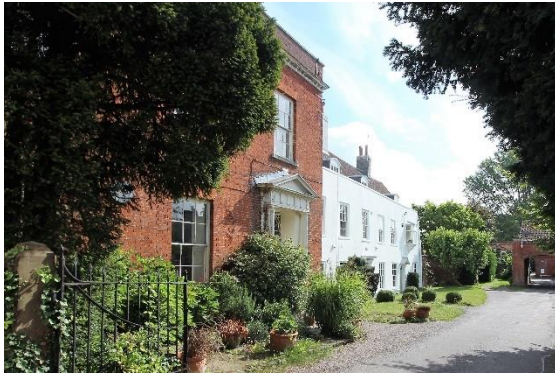
Bridge House No.34 Bridge Street

painted brick with a coved cornice. Nos.30-32 with platt band below first floor windows. Sash windows to Nos.28 and 30 now horned late twentieth century replacements. Those to No.32 nineteenth century plate-glass sashes. Early nineteenth century bowed shop windows to Nos.28 & 32, but the original glazing bars to No.28 only. Doorcase to No.28 replaced in twentieth century and containing a partially glazed twentieth century door. Nos.30-32 have c1800 wooden doorcases, No.30 with a six-panelled door with cornice frieze and architrave. No.32 door with 4 flush panels. Low cobble boundary wall with red brick dressings between Nos.26 & 28. Large altered outbuilding to rear of No.28 of two storeys with a gable end to Bridge Street. Nos.2, 4, 6a & 6b, 12 to 20 (even), 24 to 34 (even) 40 to 44 (even), 48 and 50 form a group.