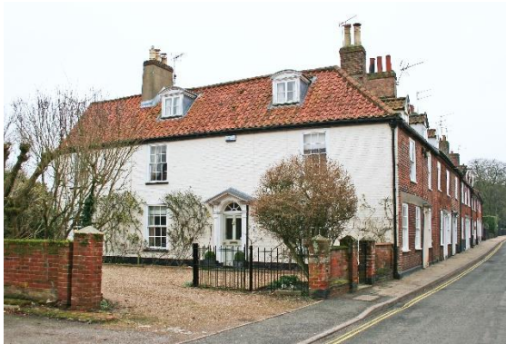
Nos.21 & 23 Upper Olland Street

brick chimneystacks with paired flues. Canted bay window to Upper Olland Street façade. Black pan tiled roof with large twentieth century dormer in southern elevation. Most external joinery replaced.