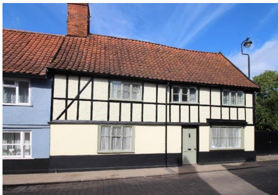
No. 45 Bridge Street

Nos.39-43 (odd) Bridge Street (grade II). A group of three seventeenth century cottages. Two storeys, with an attic which was formerly lit by dormers according to the statutory list. Red pan tiled roof and a centrally placed red brick ridge stack. Rendered brick ground floor, with a timber framed and plastered first floor. Continuous drip mould band at first floor level. Row of five casements in flush frames to the first floor, mostly of later twentieth century origin. Horned sash windows with margin lights to ground floor of Nos.41 & 43, No.39 with twentieth century casement windows in flush frames at ground floor level. Four-panelled front door to No.39. Nos.41 & 43 with panelled doors with glazed upper panels. Heavy flush door frames for Nos.39 and 43. Nos.29 to 45 (odd) form a group.