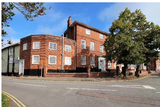
St Mary's House, No.54, Earsham Street

Nos.50-52 (even) Earsham Street. A pair of red brick terraced houses probably of early nineteenth century date. Left hand house of two bays and three storeys, right hand house of a single bay. Four light plate-glass sashes to first floor beneath wedge shaped gauged brick lintels. Similar windows above with later barge-boarded dormers above. Crenelated bow windows to ground floor with curved four light sashes. (Nb. These are not shown on c1900 photographs but are on views of c1914). Panelled doors with glazed upper lights within simple wooden door surrounds. They form part of a good group with the grade II listed, St Mary's House, No.54, Earsham Street and No.44.