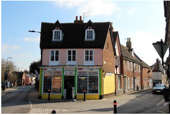
No.56 St Mary's Street

No.56 St Mary's Street (grade II). An eighteenth-century structure of two storeys and an attic, standing in a prominent location at the junction of St Mary's Street, Upper Olland Street, and Lower Olland Street. Tiled roof with two gabled sash dormers with glazing bars. St Mary's Street façade of two bays with two, near flush framed casements at first floor level. Red brick, part painted, and part stuccoed. Bowed shop front, with a central entrance, in a wooden case with reeded pilasters and an enriched entablature. No.56 forms a group with No.2 Lower Olland Street and Nos.1, 3, 3A Upper Olland Street. Nos.42 to 56 (even) form a group.