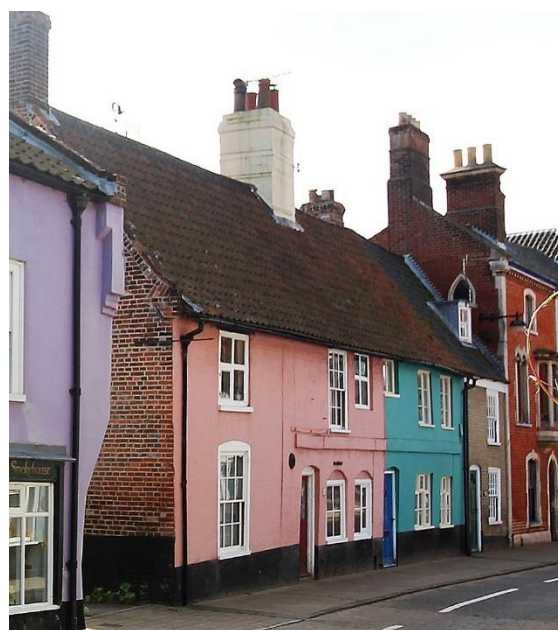
Nos.40-44 (even) Bridge Street

No.38 Bridge Street (local list). A substantial later nineteenth century red brick dwelling with stone dressings, dentilled eaves cornice and full height pilasters. Plate glass sashes and some later casements. Three storey, two bay principal façade. Arched doorcase with keystone and four panelled door. Simple semi-circular fanlight. Cantled stone oriel window above. Substantial red brick chimneystack. Forms part of a semi-detached pair with No.36.