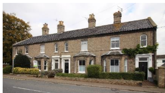
Nos.1-7 (Odd) St John's Road

Southend Terrace, Nos.1-7 (odd) St John's Road . A well-preserved gault brick terrace of 1893. Black pan tiled roof. Each house has a pilastered doorcase and a canted bay to the ground floor and at first floor level a strong course and two sash windows. The window above each doorcase is a narrow arched one. Original horned glass sashes