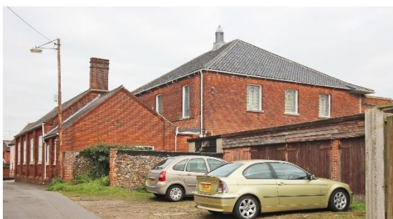
Rose Lane elevation of Emmanuel Church.