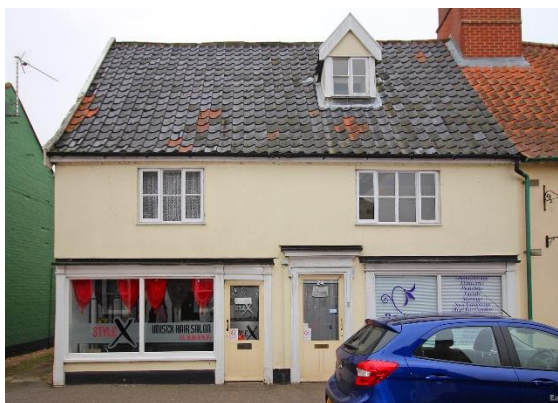
No.24 Upper Olland Street

Nos.22-24 (even) Upper Olland Street (grade II). A seventeenth century structure of two storeys and an attic. Steeply pitched red pan tiled roof containing a single gabled dormer to No.22, No.24 with a black pan tiled roof and a similar dormer. Rendered red brick to timber framed core, plinth. Massive red brick ridge stack rising from spine wall. No.22 with twentieth century casement windows and shop fascia. Dentilled eaves cornice. No.24 has casement windows at first floor level. Central late twentieth century glazed door within a wooden doorcase with an eared architrave. Good shop fronts to either side which are possibly of early nineteenth century date. Nos.2 to 10 (even), 14, 16, and Nos.20 to 24 (even) form a group.