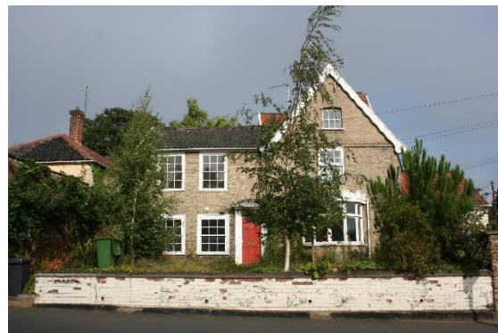
No.3 Staithe Road

No.3 Staithe Road (grade II). A detached house of later eighteenth, or early nineteenth century date. Of two storeys with a gabled attic lit by later windows. Suffolk yellow brick. Black pan tiled roof. Of three bays, the right-hand bay projecting slightly and having a gable. Twelve-light hornless flush-framed sash windows. Those to the ground floor having segmental arched lintels. Five-sided canted bay window with casements to ground floor of gabled bay. Six-panelled door with wooden case. Elliptical fanlight Side door in wing wall with elliptical arch. Subsidiary structures to the right, now separated from No.3 by the entrance to a housing development, a red brick boundary wall of nineteenth century date with stone capped square-section piers. Lower twentieth century section directly by street. Low painted brick retaining wall to front.