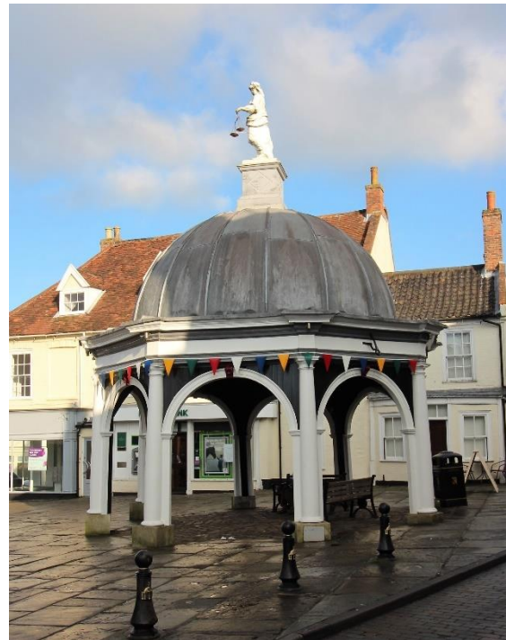
The Butter Cross, Market Place

For Aldeby House, No.1 Market Place see Nos.2-4 Broad Street