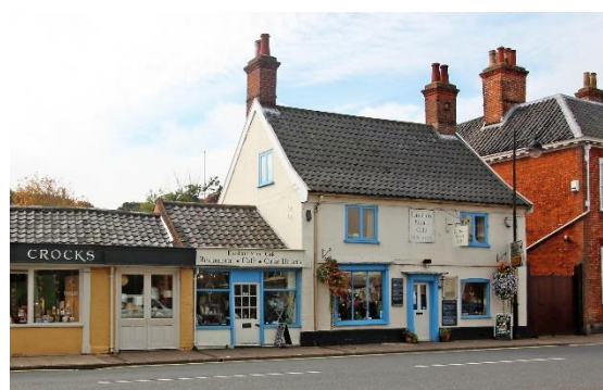
No.11-13 Earsham Street

Nos.9-11 (odd) Earsham Street (grade II). Probably of early nineteenth century date, and of a single storey with shallow pitched black pan tiled roofs. No.9 has an early nineteenth century wooden shop fascia with pilasters. No.11, nineteenth century wooden shop fascia with glazing bars and a central entrance. Nos.1 to 19 (odd) form a group. The rear section of the plot on which this building stands is within the scheduled area of the Castle complex.