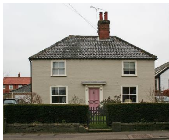
No.4 St John's Road

No.4 St John's Road (grade II) An early nineteenth century cottage with a symmetrical two storey façade of limewashed brick. Hipped black pan tiled roof and dentilled eaves cornice. Red brick ridge stack. Horned four-light plate-glass sashes within flush frames, cambered flat arches at ground floor, four-panelled door in case with console brackets and an enriched cornice. Subsidiary structures. Low red brick wall to front with the plinths of former gate piers. Probably later nineteenth century.