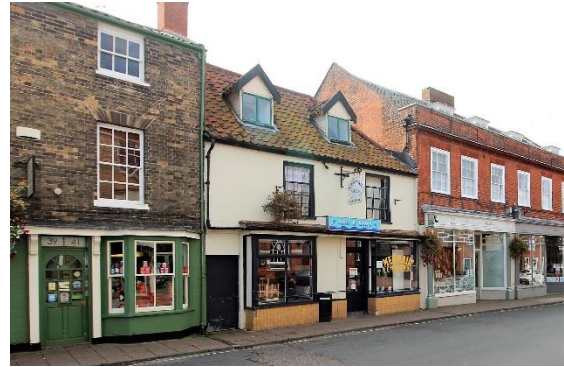
No.49 Earsham Street

The Folly, No.47 Earsham Street . Nineteenth century single storey structure of painted brick set well back from Earsham Street. Twentieth century additions not of interest. Close to the site of the Castle and within the scheduled area of the Castle complex.