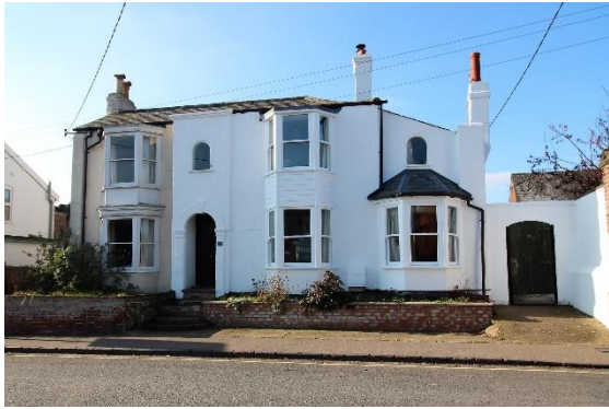
Nos.21-23 (Odd) Wingfield Street

Nos.21-23 (Odd) Wingfield Street and wall. A mid nineteenth century structure with the appearance, rendered brick with a Welsh slate roof. of once being a single villa, now two dwellings. No.21 retains much of its original appearance and has a canted bay with sash windows to Wingfield Street. The windows to No.23 have been replaced within the original openings. Central arched doorway with pronounced keystone within breakfront. Subsidiary Structures High nineteenth century painted brick wall with gate.