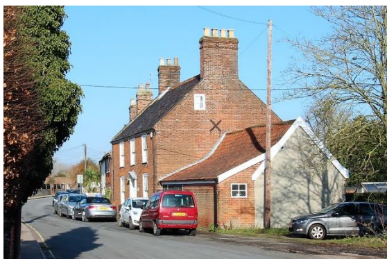
Wingfield House, No.14 Wingfield Street

See also No.67 Lower Olland Street (Ollands Character Area)