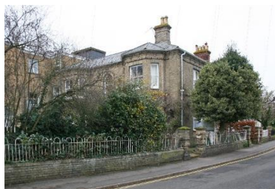
No.8 Flixton Road

with decorative ridge pieces. Mullioned and transomed timber casements with stone hood moulds. Bay window to ground floor of each house with a tile roof continued over door to form a porch. Wooden pillars flanking doors. Subsidiary Structures. Good boundary wall and gate piers of alternate gault and red brick layers c1900. Nos. 4 & 6 with decorative iron railings. The wall to No.2 has been rebuilt but the original piers are preserved. No.2 has a good red brick boundary wall to Rose Hall Gardens. The terrace occupies the site of the medieval chapel of St Mary Magdalene and is thus likely to be of archaeological value.