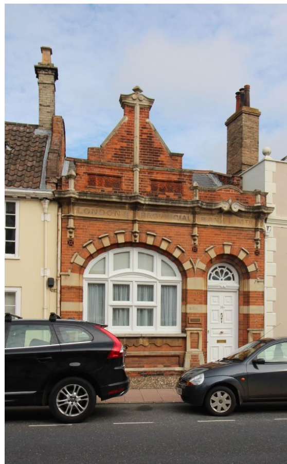
No.18a Earsham Street.

No.16 Earsham Street (grade II). A substantial seventeenth century townhouse, which is reputed to have been built in 1620. Three-storey, four-bay, stuccoed façade to Earsham Street with rusticated quoins and a parapet capped by ball finials. Moulded plaster plat band beneath second floor windows, moulded cope to parapet. Four original mullioned and transomed casements with stucco architraves at first floor level. Eight-panelled door, right of centre, in wood case with panelled reveals, pilasters and entablature flanked by twelve-light sashes. Black pan tile roof with gault brick stacks. Some original interior doors. Nb. C1900 photos show the house without the present second floor and parapet but with dormers set within the roof this part of the façade is however evident in c1930 views. Nos. 2 to 40 (even) form a group. Honeywood F, Morrow P & Reeve C, The Town Recorder, A History of Bungay in Photographs (Bungay, 1994) p148.