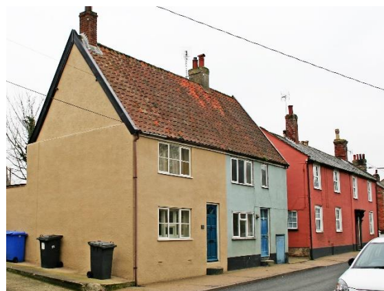
Nos.52 & 54 Lower Olland Street

No.48 Lower Olland Street. Four bay two storey house of possibly mid to late-eighteenth century date. Painted, and partially rendered red brick façades and a black pan tile roof. Dentilled eaves cornice. Doorcase with hood supported by decorative console brackets. Six-panelled door with rectangular fanlight above. Plinth. Late twentieth century uPVC windows in original openings. Cambered arched lintels to ground floor openings. Catslide roof over lower section to rear.