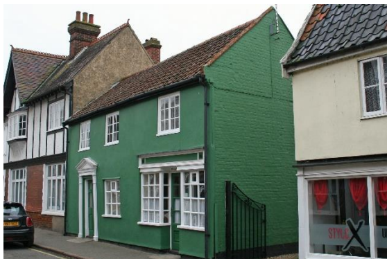
No.26 Upper Olland Street

No.26 Upper Olland Street . Probably of early nineteenth century date but much altered. Painted and rendered red brick. Red pan tiled roof. Three small pane casement windows to first floor. Late twentieth century pedimented doorcase and shop fascia. Whilst much of the external joinery has been replaced the openings correspond to those shown on early twentieth century photographs. The building has significant group value with neighbouring properties.