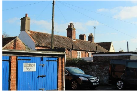
Nos.8 & 12 Turnstile Lane from Upper Olland Street

Nos.8 & 10 Turnstile Lane. The remaining section of what was once a courtyard of probably eight early nineteenth century dwellings. The surviving range appears now to form two houses but was probably originally four. Red brick, now partially rendered and with a red pan tiled roof. Dentilled brick eaves cornice. The remaining four cottages were demolished in the mid twentieth century.