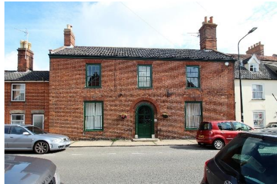
Cransford, No.20 Broad Street

No.18a Broad Street. Probably an early to mid-nineteenth century reworking of an earlier dwelling. Its Broad Street façade is rendered with a steeply pitched black pan tile roof. A single horned sash window to each floor with margin lights. Six panelled front door, with glazed upper panels. Gabled dormer with casement window and bargeboards. No.18a forms an important part of the setting of the grade II listed Nos.18 & 20 Broad Street.