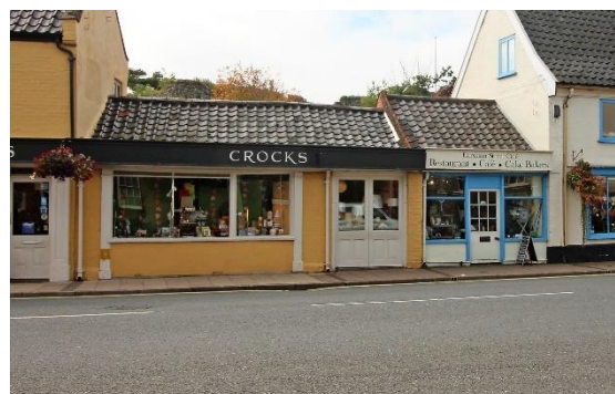
Nos.9-11 Earsham Street

No.7 Earsham Street (grade II). A house and shop of eighteenth and early nineteenth century date. Of two storeys and an attic and faced in painted brick. First floor platt band, plinth, black pan tiled roof. Two sash windows to each floor with glazing bars and flush frames, cambered arches to ground floor windows. Four-panelled door in stucco case with consoles. Modern shop fascia in small wing on right-hand end. Nos.1 to 19 (odd) form a group. The rear section of the plot on which this building stands is within the scheduled area of the Castle complex.