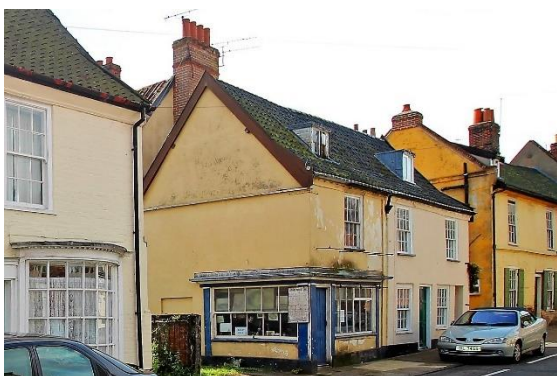
Nos.24 & 26 (even) Bridge Street

Nos.16-22 (even) Bridge Street (grade II). Three cottages, two within front range and No.22 at the rear. Early eighteenth century, of two storeys and an attic. Black pan tiled roof with a single flat roofed dormer to No.20. Colour-washed brick, with a moulded brick platt- band. Part with later applied projecting plinth. Nos.16-18, have their original sixteen-light hornless sashes at first floor level. To the ground floor centrally placed four panelled doors flanked by similar flush framed hornless sash windows with flat lintels. No.20 has two sixteen-light hornless sash windows to each floor. Those to the ground floor having panelled shutters. Centrally placed six-panelled door with near-flush frame. Scarring of former window openings with segmental heads visible in front wall to both ground and first floors of No.20. Lower range to the rear. Nos.2, 4, 6a & 6b, 12 to 20 (even), 24 to 34 (even) 40 to 44 (even), 48 and 50 form a group.