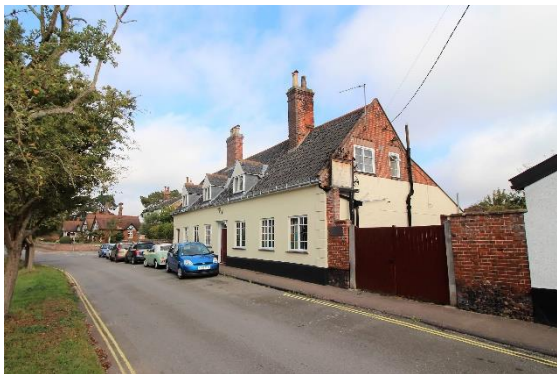
Cherry Tree House, Outney Road

Cherry Tree House, No.4 Outney Road and red brick boundary wall. A former public house, which was in use as such from at least the beginning of the nineteenth century, it closed in the mid twentieth century. Probably of mid eighteenth century date altered c1930. Single storey with attics, rendered red brick façade with quoins and a black pan tile roof. Eight bay street frontage with two doorways and six small paned metal casement windows set back beneath flat lintels. The window openings to the right of the central doorway are not shown on late nineteenth century photographs. Three gabled dormers with late twentieth century casements. Two substantial red brick ridge stacks. Good red brick wall to Outney Road frontage. Reeve C, Bungay Through Time (Stroud, 2009) p49.