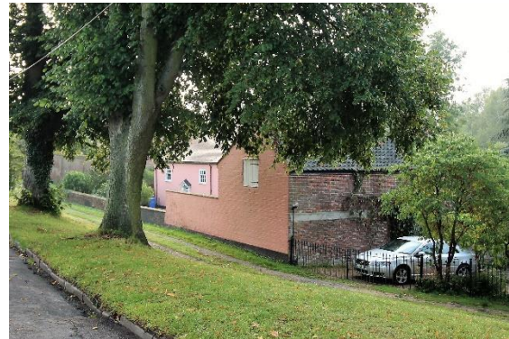
Outbuilding to Waveney Cottage, Outney Road

door in wooden case with reeded pilasters, fluted caps, radial bar fanlight and dentilled pediment. Lower range to rear at a right-angle with pan tiled roof. To its west a high rendered red brick wall, which is now painted linking the house to a contemporary stable or cart shed with a central arched opening and a hay loft at attic level. Single gabled bay to Outney Road with boarded taking-in door. Black pan tiled roof. Good red brick wall enclosing front courtyard.