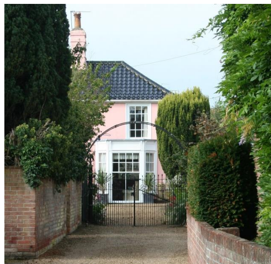
No.12 Trinity Street

panelled door with geometric glazing to rectangular fanlight. Doric fluted pilasters to wooded doorcase. No.10 and Nos 14 to 18 (even) form a group. Subsidiary Structures Low late twentieth century red brick boundary wall.