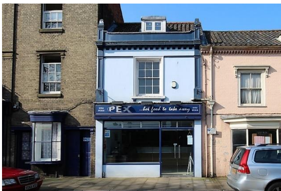
No.34 St Mary's Street

Nos.30-32 St Mary's Street. A mid nineteenth century re-fronting of an earlier structure. Its Suffolk white brick façade is now partially painted. Stone dressings. Black pan tiled roof. Canted nineteenth century wooden shop fronts. Four light plate-glass sashes to the first floor with corbelled hoods.