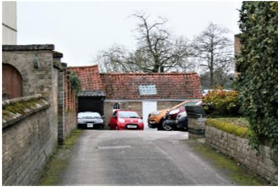
Outbuilding at No.8 Flixton Road