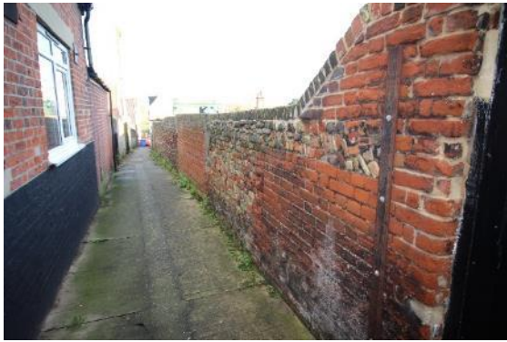
No.46 Broad Street walls to Stone Alley