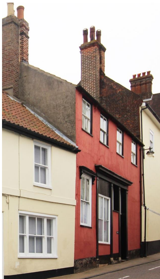
Nos.2 Bridge Street

Nos.2 Bridge Street (grade II). Formerly part of the Queen's Head Public House (see also No.3 Market Place) and probably of eighteenth, or early nineteenth century date. Painted stucco or imitation brick front of two storeys with a pan tiled roof. The first floor is lit by four, flush framed plate-glass sash windows. Later nineteenth century tall wooden former public house fascia with elongated pilasters. Part of the fascia now contains a twentieth century casement window. Nineteenth century flush-framed plate glass sash window to ground floor left, with hood supported on consoles. Twentieth century door. Tall red brick stack to left hand gable. The Queen's Head probably closed c1913. Nos.2, 4, 6a & 6b, 12 to 20 (even), 24 to 34 (even), 40 to 44 (even), 48 and 50 form a group. Honeywood F, Reeve C, & Reeve T, The Town Recorder, Five Centuries of Bungay at Play (Bungay, 2008) p 89 & 131.