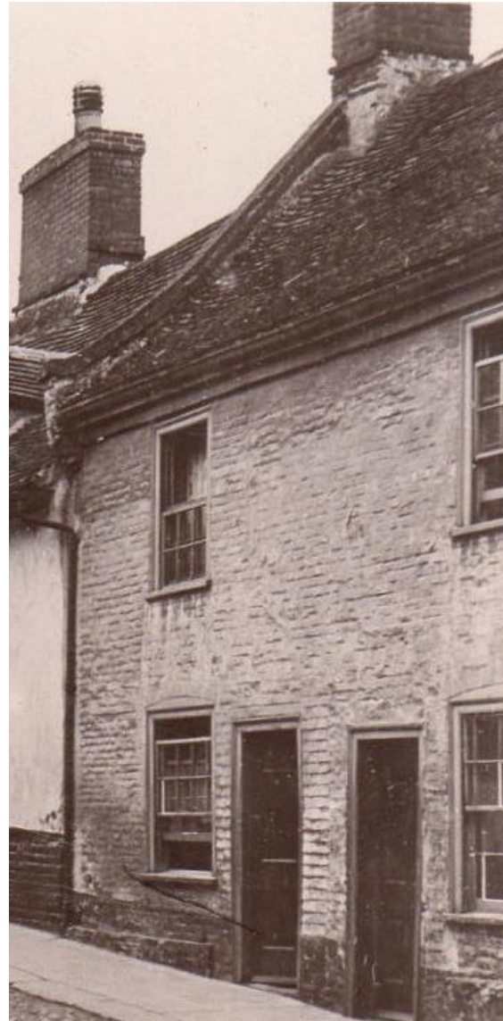
Nos.69-71 (odd), Earsham Street c1910

Nos.69-71 (odd), Earsham Street (grade II). House, formerly three cottages of eighteenth century date, two storey with a lime washed brick façade. Standing on the corner of Castle Lane. Considerably altered since present listing description drafted. Front range facing Earsham Street formerly two cottages with a third in the rear outshot. Earsham Street façade formerly with two small pane sash windows to each floor with flush frames cambered arched lintels to ground floor. Six panelled door in a flush frame, formerly with a similar door to its immediate left. Inserted window immediately above. Roof formerly plain tiled but now covered with red pan tiles. Gabled return elevation to Castle Lane with two sashes. Rear elevation and two storey gabled rear outshot (formerly a separate small cottage No.1 Castle Lane) also visible from Castle Lane. Nos 39, 41, 49, 51, 61 (odd) and Nos.65 to 73 (odd) form a group.