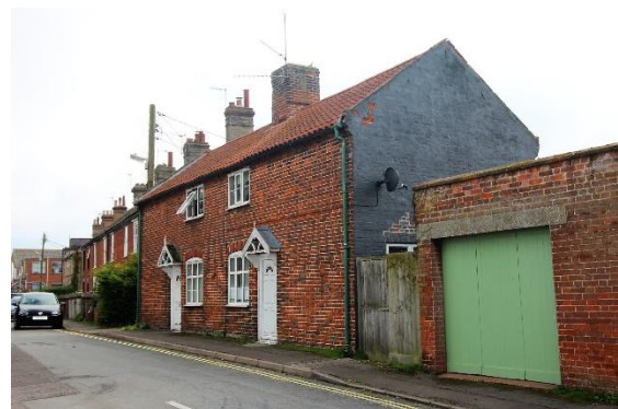
Nos.2-4 (even) Webster Street

St Edmunds Homes see Outney Road and No.6 Outney Road