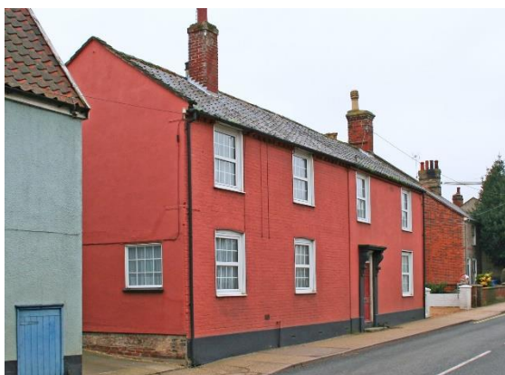
No.48 Lower Olland Street

'Laurel Villas', Nos.38-40 (even), Lower Olland Street. A semi-detached pair of cottages of 1893 built of red brick with blue brick embellishments and stone dressings. red pan tiled roof with central ridge stack rising from the spine wall. Four-pane horned plate-glass sash windows and partially glazed front doors. Dentilled eaves cornice, string course, and tile panel to centre. Single storey twentieth century additions to rear. Subsidiary Structures Contemporary low red brick boundary wall with square-section piers to Lower Olland Street and northern boundary.