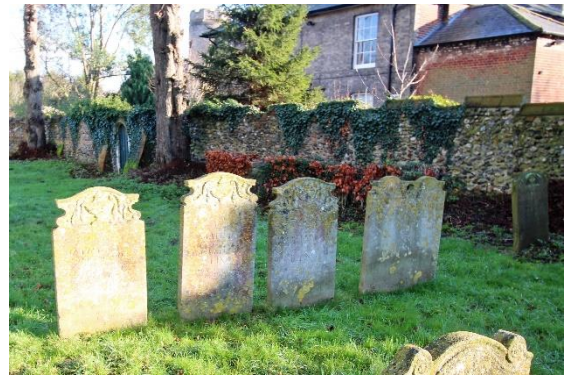
Wall to south side of St Mary's Churchyard