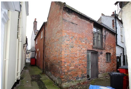
No. 7a Market Place

No. 7 Market Place (grade II). Early eighteenth century, of two storeys and an attic, two casement dormers within roof slope. Stucco. Market Place façade of two storeys flanked by pilasters. Red plain tile roof. Bowed oriel sash window at first floor level, with small pane sashes and a dentilled cornice. Mid nineteenth century wooden splayed bay shop front with a central entrance. Nos. 1 to 11 (odd), Nos. 11A, 13 and 17 to 21 (odd) form a group together with the Butter Cross.