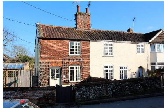
Nos.61-63 (odd) Staithe Road

Nos.1-23 (cons) The Maltings, Staithe Road. Former maltings of c1902 now apartments. Site shown as gardens on the 1892 Ordnance Survey map. Faced in painted red brick with an impressive asymmetrical fourteen bay principal façade divided by plain pilasters at first floor level. End bays gabled, and further three-bay section gabled towards centre. Steeply pitched Welsh slate roof with late twentieth century gabled dormers and roof lights. Late twentieth century window joinery of uniform design. Former taking-in doors to gables now balconied window openings. Low late twentieth century boundary wall.