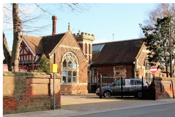
St Edmund's Roman Catholic Primary School

St Edmund's Churchyard Wall, St Mary's Street (grade II) Probably mediaeval, about 8ft high and up to 3ft thick, uncut flint.