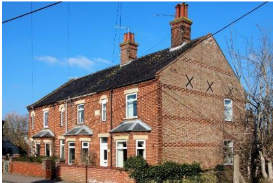
Nos.17-21 odd St John's Road

brick wall with square-section piers and decorative early twentieth century railings.