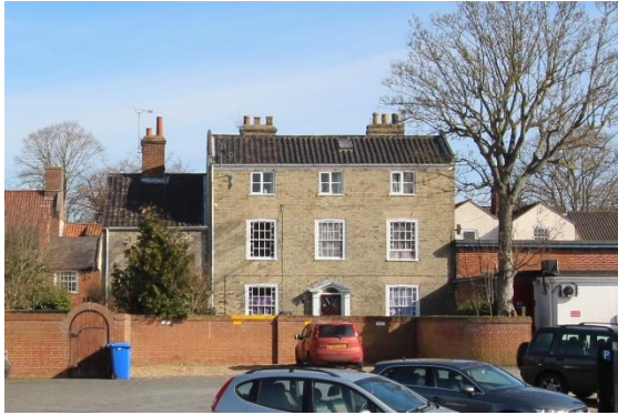
Nos.24-28 Priory Lane

Nos.24-28 (even) Priory Lane (grade II). A large, early-nineteenth century, detached house, which has been converted into three dwellings. In a sensitive location close to a scheduled ancient monument. Of three storeys, with a symmetrical Suffolk white brick façade of three bays. Return elevations red brick, black pan tiled roof. Sash windows with narrow margin lights and flush frames to first floor. Flat-arched lintels. Twentieth century casements to second floor. Two storey one bay wing with side entrances with twentieth century gabled porch to left. Six-panelled door with arched radial-bar fanlight within a wooden doorcase with pilasters and an open pediment. Subsidiary structures Late twentieth century red brick boundary wall and gate piers to Priory Lane not included.