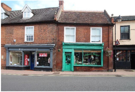
No.4a Earsham Street

No.4a Earsham Street. A structure of c1870 consisting of a shop with living accommodation above which replaced a timber-framed gabled building which is shown on early photographs. Of two storeys and two bays and faced in red brick with a red plain tile roof and terracotta ridge pieces. Southern gable with finials and dentilled cornice. Its present façade is radically different from that shown in Edwardian photographs, which show a central canted bay window at first floor level and a central doorway flanked by two small pane sashes below. Four light horned plate glass sashes at first floor level. Dentilled eaves cornice. Early to mid-twentieth century shop fascia, with late twentieth century partially glazed door inserted post 1977 within the original fascia. Reeve C, Bungay Through Time (Stroud, 2009) p38.