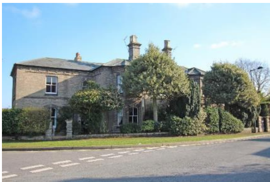
Nos.1 & 3 Flixton Road

Nos.1 & 3 Flixton Road, walls and gate piers. A semi-detached pair of houses prominently located at the junction of Bardolph and Flixton Roads. Also visible from Laburnum Road. Shown on the 1885 Ordnance survey map and probably dating from c1870. Gault brick with a Welsh slate roof. Decorative corbelled eaves cornice, pilasters, and two storey canted bay windows. Original plate glass sashes largely preserved. Subsidiary Structures Good contemporary gault brick gate piers and low boundary wall. Tall nineteenth century red brick wall to Laburnum Road.