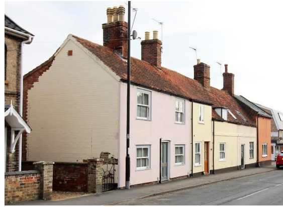
Nos.23-25 (odd) Staithe Road

Pretoria Villas, Nos.19-21 (odd) Staithe Road . Semi-detached pair of dwellings faced in white brick dated 1901. Canted wooden bay windows to the ground floor. Tripartite casement sash to first floor of No.19, first floor window to No.21 recently replaced. Dentilled plat band. Black pan tiled roof with substantial ridge stack to spine wall. No.21 has a gabled porch with bargeboards and a spear finial. Subsidiary Structures low nineteenth century wall to front and to side of No.21 the front wall being of gault brick the side wall of red.