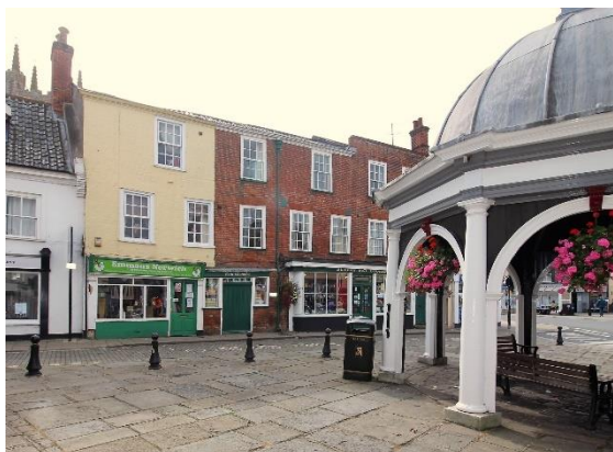
Nos.15-19 (odd) Market Place

No.13 Market Place. A mid-nineteenth century painted red brick structure with a parapeted gable to the Market Place. Four bay return elevation to Cross Street. Single horned plate-glass sash to first floor and shop fascia with pilasters below. Cross Street elevation of four narrow bays with a dentilled brick eaves cornice and a single central casement window with a shallow arched brick lintel to the first floor. Blocked doorway and window to ground floor left, and two twentieth century casement windows. All with shallow arched brick lintels. Single storey rear outshot containing a door and a casement window. Red pan tile roof. Forms an important part of the setting of neighbouring listed structures.