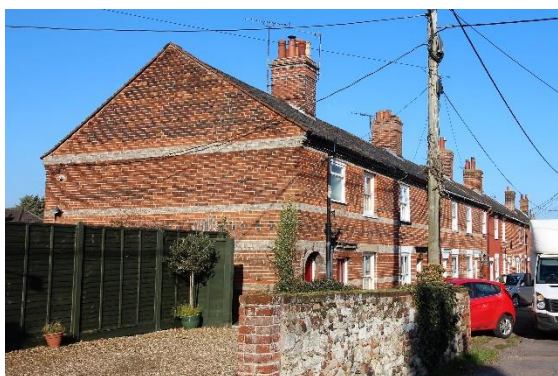
Nos.12-20 (even) Southend Road

Nos.6-10 (even) Southend Road. Mid to late nineteenth century red brick terrace with a black pan tiled roof. Central arched entrance to rear gardens. Nos.6 and 8 retain original horned sashes with margin lights. No.8 also retains a four-paneled front door. Other external joinery replaced but original openings preserved.