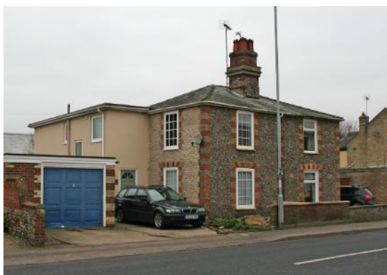
Nos.18 & 20 St John's Road

Nos.14 & 16 St John's Road. An early to mid-nineteenth century semi-detached pair of cottages. Suffolk white brick façade with a black pan tiled roof. Formerly symmetrical façade, No.16 now altered. No.14 retains a wooden doorcase with pilasters and a dentilled cornice. Late twentieth century partially glazed front door. Blind panel above doorcase. Late twentieth century casements within original openings. No.16 has had its front door replaced by a window and again has late twentieth century casements. Subsidiary Structures Low red brick boundary wall with glazed cap probably of early twentieth century date. Garage to No.16 not included.