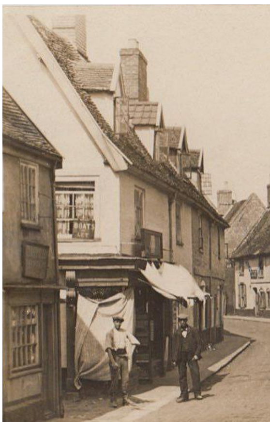
No.29 Bridge Street c1920