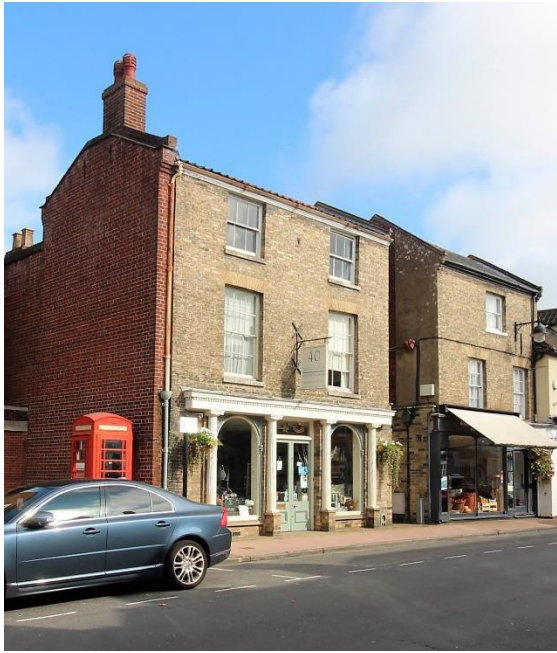
No.40 Earsham Street

No.40 Earsham Street (grade II). Probably of early nineteenth century date and built of red brick with a Suffolk white brick façade of three storeys and two bays, gauged flat arches and glazing bars to sash windows. The building's listing description describes the fine shop fascia as being of nineteenth century date. It has fluted Greek Doric three quarter radius columns below a wooden entablature, central entrance with fanlight with gold leaf figures, and arched window each side with ornamental spandrels. The fascia does not however, appear on late nineteenth century photographs of the building. Nos. 2 to 40 (even) form a group. Reeve C, Bungay Through Time (Stroud, 2009) p46.