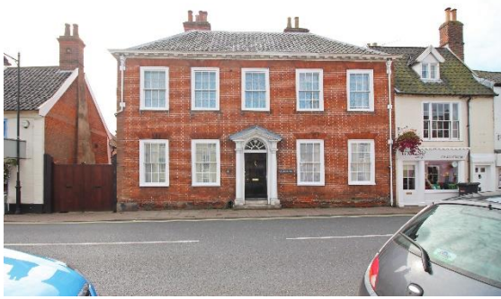
No.15 Earsham Street

No.15 Earsham Street (grade II). A substantial house with the date 1807 on its surviving original lead rainwater heads. Of two storeys and five bays with a distinguished symmetrical classical façade to Earsham Street. Red brick, plinth, and a wooden mutular cornice. Hipped black pan tile roof. Symmetrical five bay classical façade with twelve-light hornless sashes which are set within flush frames beneath wedge shaped brick lintels. Centrally placed six-panelled door, with panelled reveals to wooden case, arched radial bar fanlight, Doric columns and open pediment. Nos.1 to 19 (odd) form a group. The rear section of the plot on which this building stands is within the scheduled area of the Castle complex. Bettley, J, and Pevsner, N, The Buildings of England, Suffolk: East (London, 2015) p.154. Reeve C, Bungay Through Time (Stroud, 2009) p36.