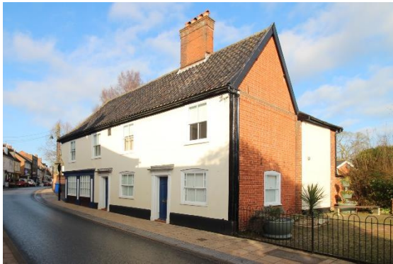
Nos.1-3 (odd), Lower Olland Street

Nos.1-3 (odd), Lower Olland Street (grade II). The former Angel public house, in use as such from the early nineteenth century, the pub closed in 2009. Seventeenth century timber-framed, now with a stuccoed, and largely early nineteenth century façade. lined and painted, coved cornice, black pan tiled roof covering. Four-bay principal façade with plate-glass sashes within flush frames. Two early nineteenth century six-panelled doors in wooden cases with mutular cornices. Former pub facia with small pane casements. Honeywood F, Reeve C, & Reeve T, The Town Recorder, Five Centuries of Bungay at Play (Bungay, 2008) p164.