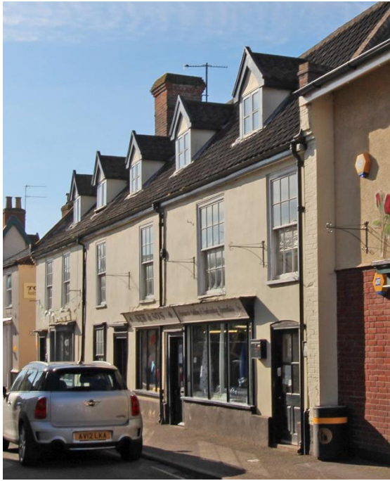
Nos.14-16 (even) Upper Olland Street

Nos.14-16 (even) Upper Olland Street (grade II). An early eighteenth century block of two storeys and an attic. Five identical gabled dormers with bargeboards and casement windows. Six-bay façade of painted stucco over a plinth; red pan tiled roof. Twelve-light hornless sashes within flush frames at first floor level. No.14, six-panelled door in wooden case with pilasters, mid-twentieth century wooden shop front right. No.16, small early nineteenth century shop window with cornice. Nos.2 to 10 (even), 14, 16, and Nos.20 to 24 (even) form a group.