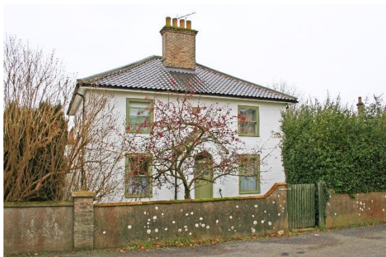
No.2 Bardolph Road

Henham Villa, No.2 Bardolph Road, boundary walls, and outbuilding. Early nineteenth century villa with later additions. Stuccoed with a hipped black pan tiled roof. Large gault brick central stack. Symmetrical façade with four-light, horned, plate-glass sashes. Central gabled c1900 porch. Large late twentieth century rear addition. Flanking walls to either side that to Laburnum Road concealing a single storey outbuilding. Subsidiary Structures Low partially rendered gault brick nineteenth century wall to Bardolph Road and red brick wall to Laburnum Road. Nineteenth century outbuilding with red brick rear wall, single storey with chimneystack to Bardolph Road elevation. Map evidence suggests this is a c1900 heated greenhouse. Honeywood F, Morrow P, & Reeve C, The Town Recorder, A History of Bungay in Photographs (Bungay, 1994) p188.