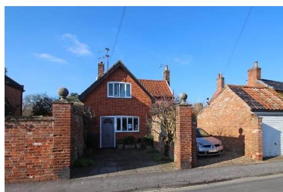
No.14 Trinity Street (Wharton Street elevation)

No.12 Trinity Street and boundary wall to rear. Substantial dwelling set back from the road. Probably early nineteenth century. Two storeys rendered facades with a hipped roof with later twentieth century replacement black pan tiles. Principal façade has moulded surrounds to windows and a canted bay window. Central ridge stack. Subsidiary Structures Red brick and cobble boundary wall to rear. Boundary walls to Trinity Street appear to be late twentieth century red brick structures.