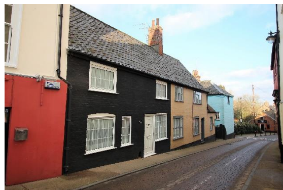
Nos.1 & 7 (Odd), Bridge Street

For Aldeby House, No.1 Market Place see Nos.2-4 Broad Street