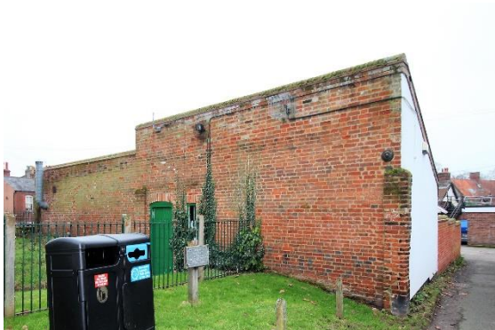
Jester's Shop, The Keep, Castle Orchard

Keeper's Cottage and boundary wall, Castle Orchard (standing on scheduled land). A nineteenth century cottage with extensive later twentieth century alterations and additions, built within the remains of the Castle complex and within the scheduled ancient monument. Its rear retaining wall is part of the Castle wall. Original cottage has rendered walls and a black pan tiled roof. Red brick ridge stack. Two storeys with a single storey wing. Twentieth century flat roofed porch. Return gable with twentieth century timber oriel window to first floor. Lower red pan tile roofed range to rear. Twentieth century casement windows. Subsidiary features. Good nineteenth century flint wall.