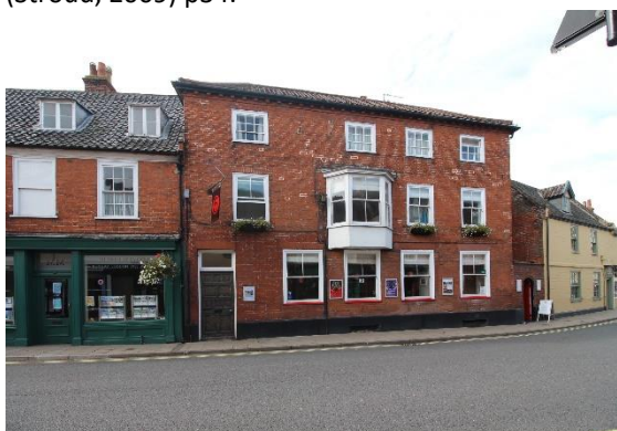
No.5 Earsham Street

Castle complex. Reeve C, Bungay Through Time (Stroud, 2009) p34.