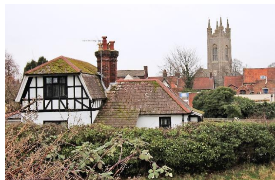
Castle Cottage, Castle Orchard

Outbuilding, The Keep, Castle Orchard. A small red brick and rubble outbuilding with a weatherboarded gable and a black and red pan tiled roof. Probably of mid nineteenth century date. Prominently located within the setting of the scheduled ancient monument.