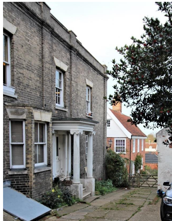
Nos.7 & 9 Trinity Street

No.7 Trinity Street and outbuilding (grade II). House and shop of c1830-40. Two storeys and an attic, with a slate mansard roof containing two dormers. Faced in gault brick with moulded a cornice, and a parapet with cope. Original shop front to Trinity Street façade with modern glazing, flanked by fluted Greek Doric columns, and entablature over which is "crinoline" balcony railing. Two plate-glass sashes above. Return elevation with house entrance. Central Ionic porch with twelve-light sash above flanked by pilasters. Cantd single storey bay to left. Further pilasters to corners and twelve light sashes to outer bays. Rear elevation to Borough Well Lane with pilasters and twelve light sash windows. Nos.1 to 19 (odd) form a group. Subsidiary features include a single storey painted red brick outbuilding with replaced red pan tile roof covering. Elevation to Trinity Street heavily altered in mid twentieth century. Bettley, J, and Pevsner,