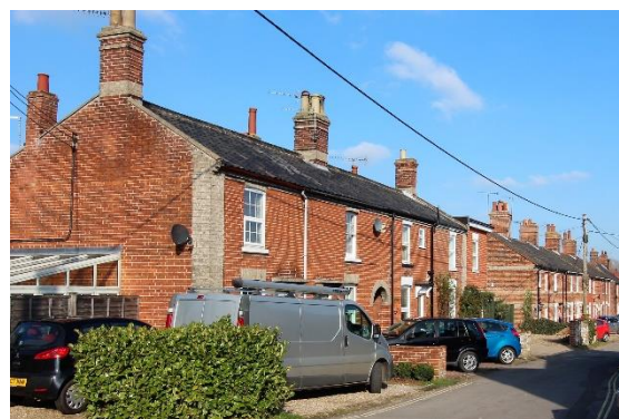
Nos.22-28 (even) Southend Road

bands below. Dentilled gault brick frieze above doorcase lintels. External joinery largely replaced but original openings preserved.