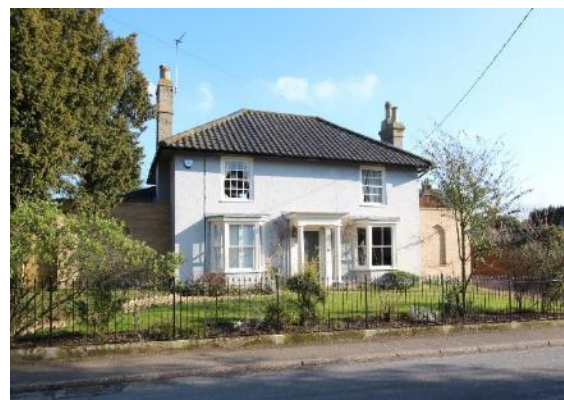
No.11 Flixton Road

No.9 Flixton Road (grade II). Early nineteenth century villa of two storeys. Faced in Suffolk yellow brick, with a hipped black pan tiled roof with wide overhanging eaves. Symmetrical façade divided into three bays with wide shallow brick panels and with wide connecting horizontal band at first floor level. Each panel has a horned plate-glass sash at its centre with a margin to take louvred and panelled shutters, now removed. Sashes, in flush frames, with glazing bars and small border panes at sides, flat arches. Single storey wings with blank panels. Six-panelled door with frieze and cornice, Wooden porch with square-section panelled columns, trellis screen either side. Nos.9 to 13 (odd) form a group.