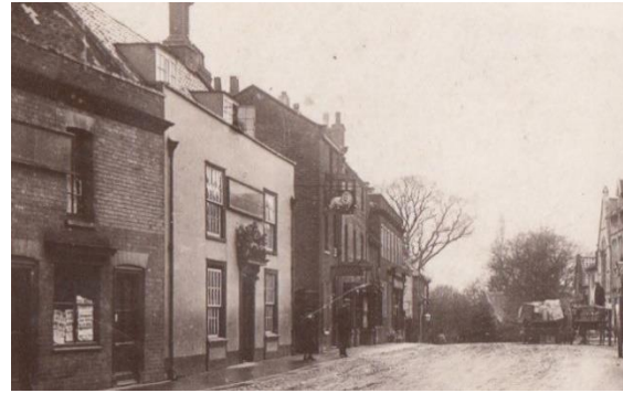
The Castle Inn, No.35 Earsham Street c1910

Small pane horned sash windows to the ground floor with similar hornless windows above. Six-panelled door, set within simple wooden doorcase with console brackets. Window above inserted in early to mid-twentieth century. Black pan tile roof with two large flat roofed dormers. Twin gabled return elevation, the front gable crowned by massive gault brick stack with two octagonal flues. Two, small late-twentieth century horned sashes to the front range, and three casements to lower rear range. Further red brick ridge stack of late nineteenth or early twentieth century date. A re-fronting of an early eighteenth century but much altered building. At the rear facing the Castle is a lower parallel range with a red pan tiled roof and nine light casement windows which dates from c1800.