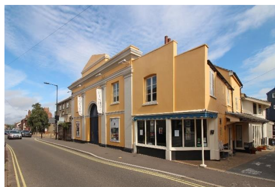
Fisher Theatre No.10 Broad Street

Nos. 6, 8 & 8a Broad Street (grade II). Of eighteenth-century date, No.8a is possibly a later addition. Two storey rendered street frontage, Nos. 6 & 8 having a black pan tile roof, the lower No.8a red pan tiles. Nos. 6 & 8 with three, twelve-light hornless sash windows at first floor level in flush frames with later lugged surrounds. No.8a has one casement at first floor level in a similar lugged surround. No.6 is flanked by two storey pilasters; square bay shop front. Smaller shop window to No.8 and partially glazed door in simple wooden surround. No.8A has an entrance with a modern glazed door in a narrow wooden case and a catslide roof to the rear.