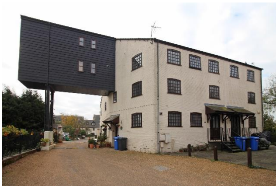
Nos.1-5 The Watermill, Staithe Road

Nos.51 & 53 Staithe Road. (grade II). Originally one early eighteenth century dwelling. Two storey, six bay façade, pebble dash on red brick. Platt band below first floor windows, plinth, and a coved cornice. Black pan tiled roof of steep pitch with overhanging eaves. Four-light sashes in flush frames, rendered flat arched lintels to ground floor windows. No.51, six-panelled door, with an eared architrave and a pediment. No.53, six-panelled door in a wood case with slender pilasters and a cornice. red brick chimney stacks. Subsidiary structures. Boundary walls appear to be later twentieth century red brick.