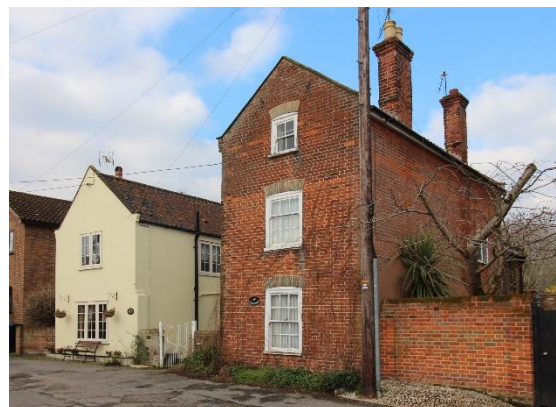
No.49 Staithe Road

Millers Cottage, No.47 Staithe Road. Detached dwelling with gable end to street probably dating from c1800. Two storeys. Rendered façade and red pan tiled roof. Late twentieth century casement windows. Red brick stack to western roof slope. Ground floor casement in gable replaces a door and a small sash window.