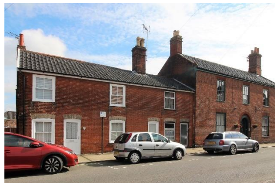
Nos.22, and 24 Broad Street

Cransford, No.20 Broad Street (grade II). An early to mid-nineteenth century dwelling with a symmetrical classical façade of two storeys and three bays. Faced in red brick, with a black pan tile roof. At the first-floor level are three flush frame twelve-light sash windows with wedge-shaped brick lintels. The ground floor windows are now plate-glass sashes with narrow margin lights. Central six-panelled arched front door recessed within a double brick arch. Reeded wooden architrave with roundels at the arch's springing point, surmounted by double arch, inner set back 4½ ins. Iron segmental fanlight window, to staircase at back, with radial bars. Seventeenth century wing to the east of two storeys and an attic, rendered, with a pan tile roof. Flush frame sash window at each floor now with centre and margin bars only, four-panel door with glazed upper panels. Later twentieth century two storey rear addition.