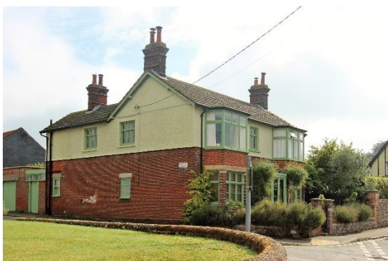
No.6 Outney Road

Cherry Tree House, No.4 Outney Road and red brick boundary wall. A former public house, which was in use as such from at least the beginning of the nineteenth century, it closed in the mid twentieth century. Probably of mid eighteenth century date altered c1930. Single storey with attics, rendered red brick façade with quoins and a black pan tile roof. Eight bay street frontage with two doorways and six small paned metal casement windows set back beneath flat lintels. The window openings to the right of the central doorway are not shown on late nineteenth century photographs. Three gabled dormers with late twentieth century casements. Two substantial red brick ridge stacks. Good red brick wall to Outney Road frontage. Reeve C, Bungay Through Time (Stroud, 2009) p49.