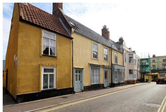
Nos. 6, 8 & 8a Broad Street

Nos. 6, 8 & 8a Broad Street (grade II). Of eighteenth-century date, No.8a is possibly a later addition. Two storey rendered street frontage, Nos. 6 & 8 having a black pan tile roof, the lower No.8a red pan tiles. Nos. 6 & 8 with three, twelve-light hornless sash windows at first floor level in flush frames with later lugged surrounds. No.8a has one casement at first floor level in a similar lugged surround. No.6 is flanked by two storey pilasters; square bay shop front. Smaller shop window to No.8 and partially glazed door in simple wooden surround. No.8A has an entrance with a modern glazed door in a narrow wooden case and a catslide roof to the rear.