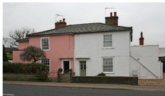
Nos.22 & 24 St John's Road

recently rebuilt. Stone rubble wall with red brick dressings separating Nos. 20 & 22, rear section of red brick. Late twentieth century garage to No.20 not included.