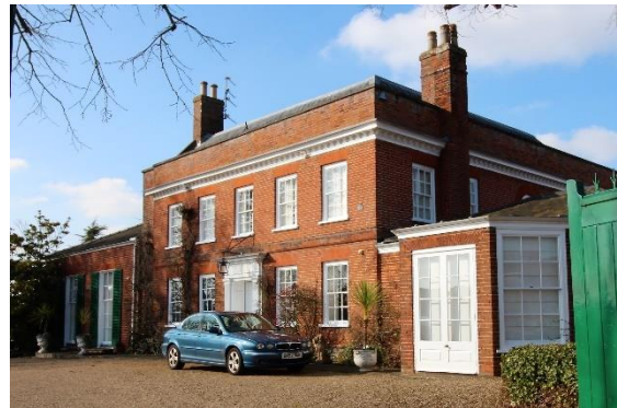
Rose Hall, No.52 Upper Olland Street

No.50 Upper Olland Street (grade II). Early eighteenth century, of two storeys, red brick, with a plinth. On the corner of Boyscott Lane. Black pan tiled roof covering to Upper Olland Street, red to Boyscott Lane. Upper Olland Street façade of three bays with a coved cornice. 2 windows, flush frame sash, with glazing bars, segmental arches at ground floor. Four-panelled door in wood case-with fanlight and fluted pilasters. Three bay return elevation with a hipped roof. Segmental arched lintels to sash windows. Central ground floor window a larger casement. Largely blind rear gable. Nos.30 to 34 (even), Emmanuel church and Nos.38 to 52 (even) form a group.