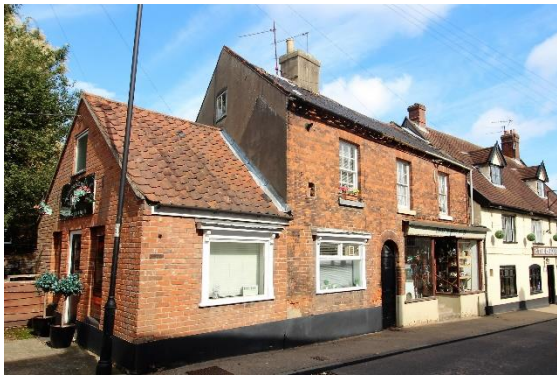
Nos.17-21 (odd) Bridge Street

twentieth century panelled doors with integral fanlights. No.7 retains two six-pane shop fronts which are possibly of mid nineteenth century date one beneath a segmental arched lintel. Single storey wing with a red pan tiled roof and a small pane casement window beneath a segmental arched lintel. Nos.1 to 7 (odd) form a group. Also Nos.1 to 5 (odd) form a group with Nos. 1 & 3 Nethergate Street.