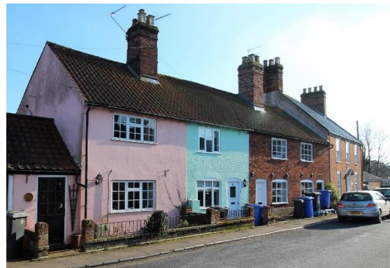
Nos.16-20 (even) Wingfield Street

Nos.5 to 11 (odd) and No.14 form a group. Subsidiary structures Red brick cart shed now garage range with boarded doors attached to right. Single storey. Red pan tiled roof possibly a re-front of an earlier structure. Reeve C, Bungay Through Time (Stroud, 2009) p88.