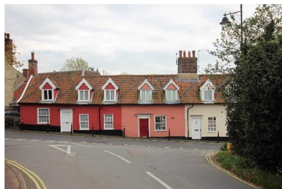
Nos.61, 65, & 67 Earsham Street from Outney Road.

Sashes with glazing bars and flush frames, cambered arches at first floor. Shop front, left, in wood case with reeded pilasters and enriched cornice. Return elevation to Nathan's Yard with decorative applied timber framing. Nos.39, 41, 49, 55 to 61 (odd) and Nos.65 to 73 (odd) form a group.