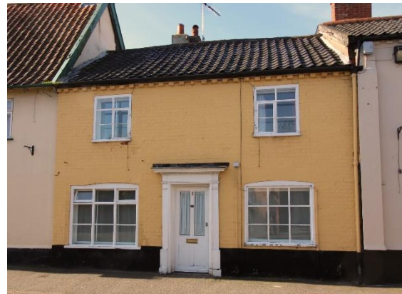
No.20 Upper Olland Street

No.18 Upper Olland Street. A mid nineteenth century shop on the southern corner of Rose Lane. Rendered and painted red brick with a black pan tiled roof. Dentilled eaves cornice, plinth. Upper Olland Street façade has a nineteenth century shop facia with reeded pilasters, containing a late twentieth century partially glazed door. Plate glass sashes with horns above. Rose Lane elevation with twentieth century casement windows. Rear gable also visible from Rose Lane, this has a canted bay window at ground floor level.