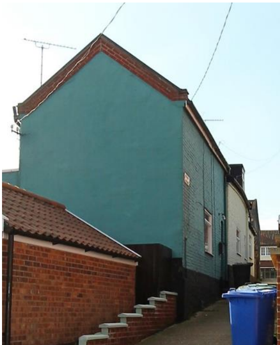
Rose Cottage and No.4 Stone Alley

Rose Cottage and No.4 Stone Alley. A semi-detached pair of small cottages of probably later eighteenth-century date, which were altered in the later twentieth century. They are of one and a half storeys, and faced in brick which is either painted or rendered. Late twentieth century casement windows. Pan tiled roof. Early twenty first century addition to No.4.