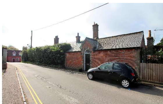
Outney Road elevation of Waveney House, No.56 Earsham Street

Early eighteenth century red brick walled garden fronting onto Outney Road, 14 to 18 feet high with brick on end sloping cope, and with panels formed by brick pier buttresses and stepped plinth or splayed base widening. Cope rounded on outer side above band with toothing. Nos. 54, 56, wing adjoining, walls and ancillary building together with the bridge over the river Waveney form a group.