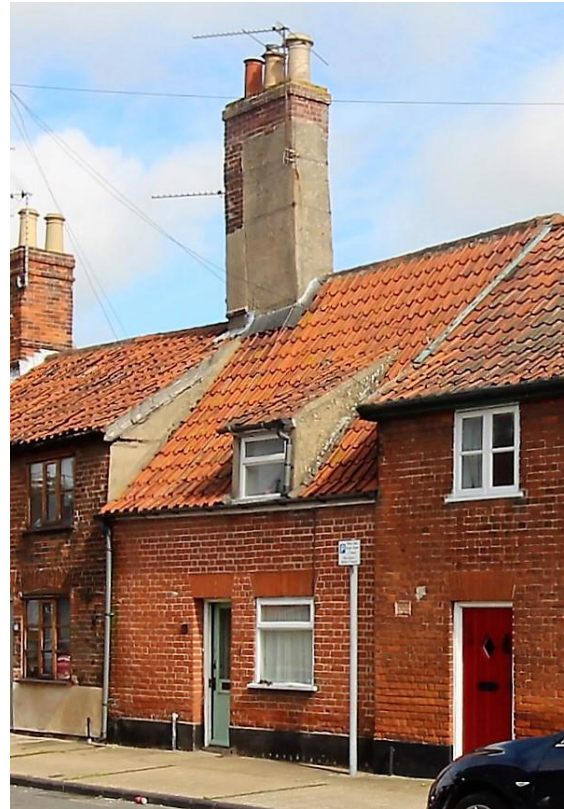
No.58 Broad Street

Nos.54 & 56 Broad Street A pair of cottages with early nineteenth century facades and steeply pitched red pan tile roofs. Shared central ridge stack. Possibly a re-fronting of an earlier structure. Casement windows. Those to No.56 are of late twentieth century date, however the first-floor window of No.54 may be earlier. Twentieth century front doors. Wedge shaped lintels to door and window openings. No.54 has a single storey late twentieth century addition to the rear and a rendered return elevation.