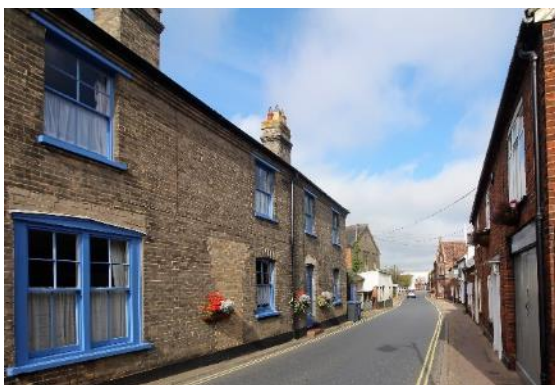
No.1 Chaucer Street

No.1 Chaucer Street. Attached to the rear of the grade II listed No.24 Earsham Street and shown as part of that structure on early Ordnance Survey maps. By 1969 it was shown on maps as a separate dwelling. It was possibly built as the postmaster's house for the former town post office at No.24 Earsham Street 1880. Gault brick façade to an