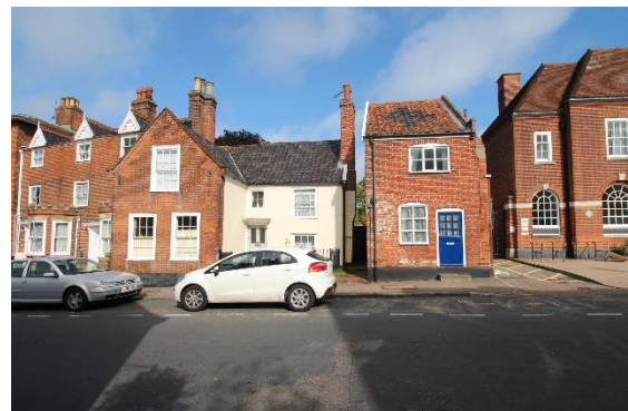
No.44 Earsham Street

No.42 Earsham Street. Built as a post office C1938-40 and attributed by The Buildings of England to David N Dyke. A good example of interwar classical design. Clad in red brick with stone dressings. Plain tile roof. Two storeys and five bays with three bay central breakfront. Arched openings with keystones to the ground floor. Central pair of panelled double doors beneath semi-circular fanlight. Flanking the doors are c1940 small pane metal casements. Small pane wooden sashes to first floor. The structure occupies the site of the former Bungay Grammar School which occupied the site from c1580 to c1925. Its forecourt undisturbed since the demolition of the Tudor school is possibly of considerable archaeological interest. Bettley, J, and Pevsner, N, The Buildings of England, Suffolk: East (London, 2015) p.154.