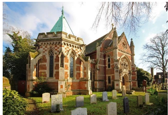
St Edmund's RC Church, St Mary's Street

Wall to south side of St Mary's Churchyard (grade II.) Eighteenth century and earlier mainly flint with red brick face on south side, moulded terra cotta, quasi battlemented cope. At each end, a square white brick pier with stone cap, west end pier with stone vase finial. Generally, about 8ft high.