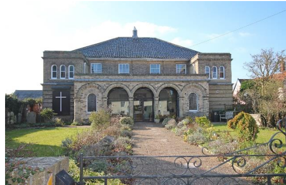
Emmanuel Church, Upper Olland Street

White House, No.32 Upper Olland Street (grade II). A detached late eighteenth century house with later nineteenth century alterations. Until c1885 the manse for the adjoining Congregational Chapel. Altered and extended for William Methuen late nineteenth century. Of two storeys with an attic lit by two casement dormers. Steeply pitched Welsh slate roof, tall red brick chimney stacks with drip bands to gables. Painted red brick with a stuccoed symmetrical three bay façade. Three mullioned and transomed casements at first floor level. Nineteenth century canted bays at ground floor level flanking a six-panelled door reset within a later nineteenth century wooden gabled porch with pilasters. Single storey wing to north. Pan tiled roof slope at rear. Nos.30 to 34 (even), Emmanuel church and Nos.38 to 52 (even) form a group. Honeywood F, Morrow P, & Reeve C, The Town Recorder, A History of Bungay in Photographs (Bungay, 1994) p24.