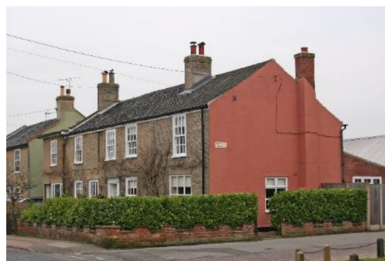
Nos. 10 & 12 St John's Road

No.4 St John's Road (grade II) An early nineteenth century cottage with a symmetrical two storey façade of limewashed brick. Hipped black pan tiled roof and dentilled eaves cornice. Red brick ridge stack. Horned four-light plate-glass sashes within flush frames, cambered flat arches at ground floor, four-panelled door in case with console brackets and an enriched cornice. Subsidiary structures. Low red brick wall to front with the plinths of former gate piers. Probably later nineteenth century.