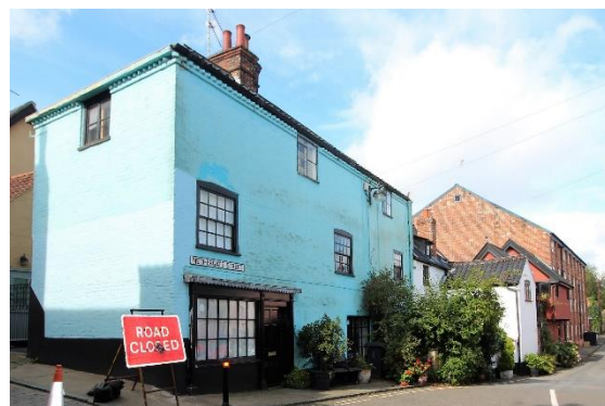
No.1 Nethergate Street

Nos.1 & 3 Nethergate Street. (grade II) On the corner of Bridge Street. No.1 is an eighteenth-century brick structure of three storeys. Limewashed with a black pan tiled roof which is hipped at its eastern end. Diagonal toothed eaves cornice. Casement windows to second floor with original leaded lights. Sixteen light hornless sashes to first floor beneath cambered lintels. Casement windows to ground floor. Good quality wooden former shop fascia with pilasters, glazing bars, and a six-panelled door near the corner with Bridge Street. No.3 (the lower section to the right). Black pan tiled roof with a single small flat roofed dormer. Projecting gabled wing and casement windows. Nos.1 & 3 form a group with Nos.1 to 5 (odd) Bridge Street