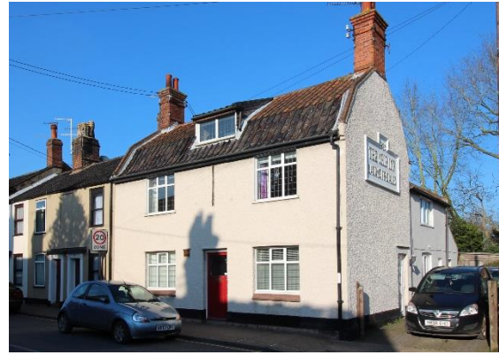
No.53 Lower Olland Street

Nos.47-51 (Odd) Lower Olland Street . Terrace of three early nineteenth century terraced houses of red brick, the façades now rendered and painted. Black pan tiled roof. Doorcases with pilasters identical to Nos.41-45. Window joinery now of late twentieth century date but original openings preserved.