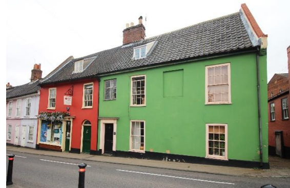
Nos.12-14 (even) Bridge Street.

missing. Four-light plate glass sashes to rear range fronting Borough Well Lane. Nos.6a & 6b were once the Green Dragon Public House and are shown as a public house on the 1885 Ordnance Survey map. The pub reputedly closed c1909. Nos.2, 4, 6a & 6b, 12 to 20 (even) 24 to 34 (even), 40 to 44 (even) 48 and 50 form a group. Reeve C, Bungay Through Time (Stroud, 2009) p57. Honeywood F, Reeve C, & Reeve T, The Town Recorder, Five Centuries of Bungay at Play (Bungay, 2008) p97 & 132.