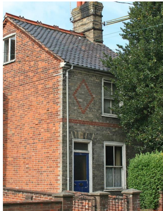
No.36 Lower Olland Street

Nos.30-34 (even) Lower Olland Street. A well-preserved row of three small terraced houses of mid-nineteenth century date. Red brick with a black pan tiled roof. Entrance to No.30 within a passage way accessed from a doorway at the far north of the Lower Olland Street elevation. Six-panelled door to No.32 with glazed upper lights. Late twentieth century panelled door to No.34. Horned sashes with margin lights and flush frames to ground and first floors. Ground floor openings with flat arched lintels.