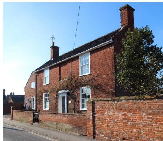
No.9 Wharton Street

Former Fire Station – see Lower Olland Street