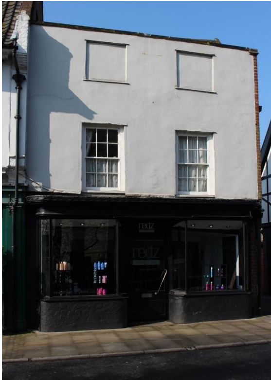
No.12 St Mary's Street

No.12 St Mary's Street (grade II) Later eighteenth century, three storey, red brick, with a stuccoed façade and a stone cope. Pan tiles. Good wooden shop fascia with a central door and rounded corners to the flanking bays, later twentieth century glazing. Two twelve-light hornless sashes at first floor level. Two blank panels to second floor. Flush frame sash window in gable on northern return elevation. Nos.2-22 (even) form a group.