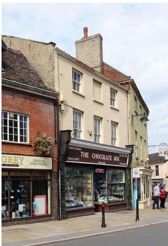
No.6 Market Place

No.6 Market Place. A mid nineteenth century shop with domestic accommodation above. Three storeys and three bays. Faced in gault brick with a painted façade. Nine light hornless sash windows to first and second floors. Second floor with blind central recess. Notable early twentieth century glazed tile shop fascia with deep green and chocolate coloured tiles and carved wooden brackets. Decorative brass pilasters to entrance. The rear section of the plot on which this building stands is within the scheduled area of the Castle complex. Honeywood F, Morrow P, & Reeve C The Town Recorder, A History of Bungay in Photographs (Bungay, 1994) p135.