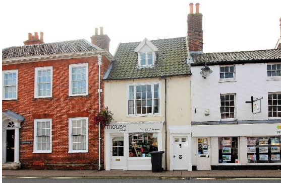
No.17 Earsham Street

No.15 Earsham Street (grade II). A substantial house with the date 1807 on its surviving original lead rainwater heads. Of two storeys and five bays with a distinguished symmetrical classical façade to Earsham Street. Red brick, plinth, and a wooden mutular cornice. Hipped black pan tile roof. Symmetrical five bay classical façade with twelve-light hornless sashes which are set within flush frames beneath wedge shaped brick lintels. Centrally placed six-panelled door, with panelled reveals to wooden case, arched radial bar fanlight, Doric columns and open pediment. Nos.1 to 19 (odd) form a group. The rear section of the plot on which this building stands is within the scheduled area of the Castle complex. Bettley, J, and Pevsner, N, The Buildings of England, Suffolk: East (London, 2015) p.154. Reeve C, Bungay Through Time (Stroud, 2009) p36.