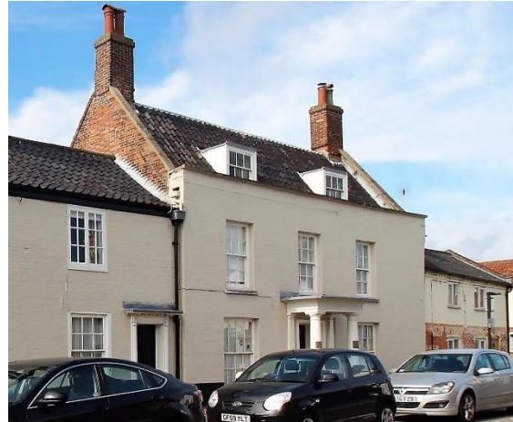
Cambridge House, No.19 Broad Street

small-paned casements in flush frames to the first floor. Twelve-light hornless sashes in flush frames to the ground floor, with flat arches. Two entrances with six-panelled doors, reeded pilasters and mutular cornices. Nos.15-19 form a group.