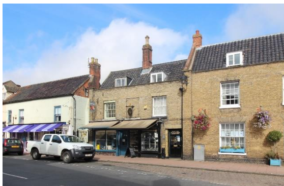
Nos.28-30 (even) Earsham Street

Recorder, A History of Bungay in Photographs (Bungay, 1994) p63.