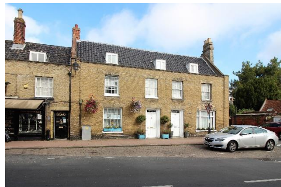
Nos.24-26 (even) Earsham Street

The western or Chaucer Street façade of No. 22 is of mid nineteenth century date and of gault brick with painted stone dressings. Dutch gable, and wooden shop fascia. The First floor has a centrally placed plate-glass sash window with a pediment supported on console brackets. Single storey red brick outbuilding with red pan tile roof to rear probably of early nineteenth century or earlier date. Nos. 2 to 40 (even) form a group.