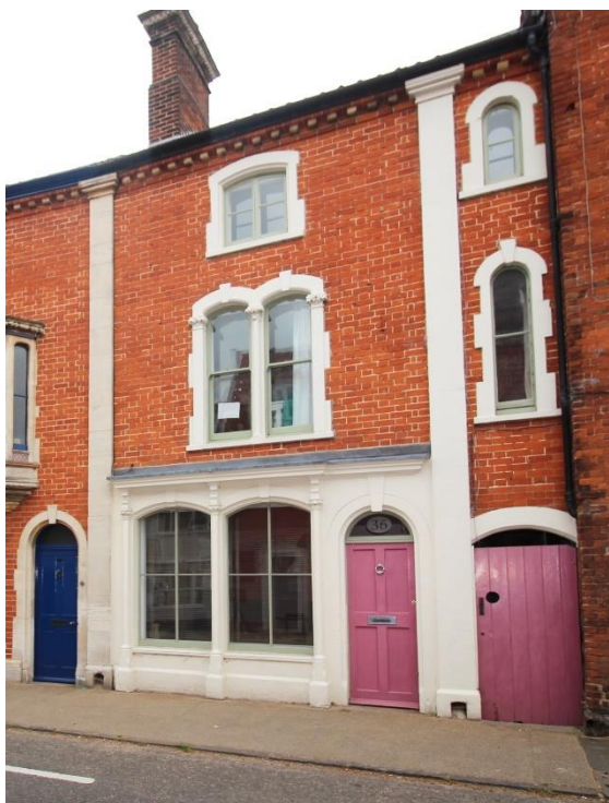
No.36 Bridge Street

No.36 Bridge Street (local list). A substantial later nineteenth century red brick former shop and dwelling with painted stone dressings, dentilled eaves cornice and full height pilasters. Plate glass sash windows. Three storey, two bay principal façade. Arched doorcase with keystone and four panelled door within rendered later nineteenth century former shop fascia. Simple semi-circular fanlight. Twin shallow arched windows to left with keystones beneath a corbelled cornice. Passage way with boarded door within shallow arched opening to right. Substantial red brick chimneystack. Forms part of a semi-detached pair with No.36.