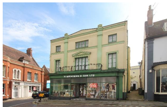
No.5 Market Place

England, Suffolk: East (London, 2015) p.157. Honeywood F, Reeve C, & Reeve T, The Town Recorder, Five Centuries of Bungay at Play (Bungay, 2008) p131.