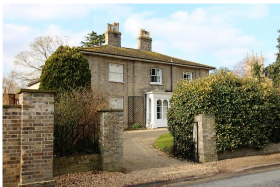
Trinity House, No.8 Trinity Street

western end. Red brick rear range. Subsidiary Structures Low brick boundary wall with iron railings.