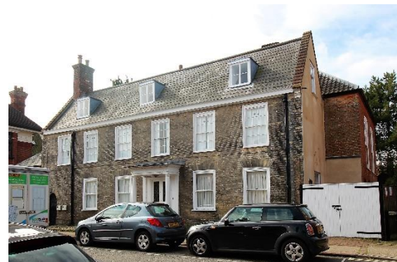
Charlotte House, Broad Street

Nos. 1 & 2 Bigod Flats, Broad Street. Probably of early to mid-nineteenth century date and built as stabling and outbuildings for properties on Earsham Street. White brick with a black pan tile roof and a rendered ground floor. Restrained neo-Tudor detailing including hood mould to doorway and flanking window. Casement windows, decorative eaves cornice and dentilled string course.