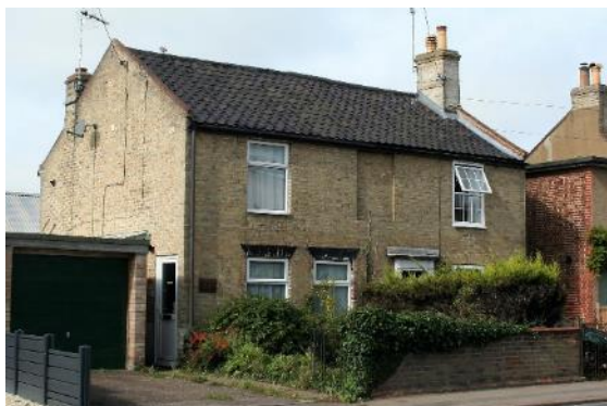
Nos.14 & 16 St John's Road

crenelated early twentieth century red brick boundary wall to the street. All other walls appear to be of late twentieth century date.