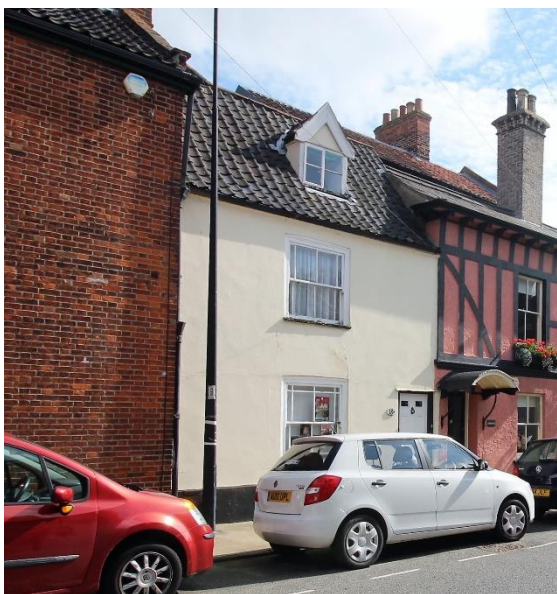
No.18a Broad Street

Long range of attached outbuildings backing onto Brandy Lane which are probably of early eighteenth century or earlier origins, although at least partially rebuilt. Painted red brick with red pan tile roofs. Range nearest Broad Street of two storeys with boarded taking-in door at first floor level. Twentieth century dormers. Central range of narrow red bricks with a steeply pitched red pan tile roof. Single storey with attic and elaborate tumble or diaper work to gable ends. Blocked taking-in door to gable facing Nethergate Street at attic level. Lean-to addition to garden side. At the Nethergate Street end is an extensive rebuilt structure now with a flat roof and blocked door and window openings to Brandy Lane and a large garage opening to Nethergate Street.