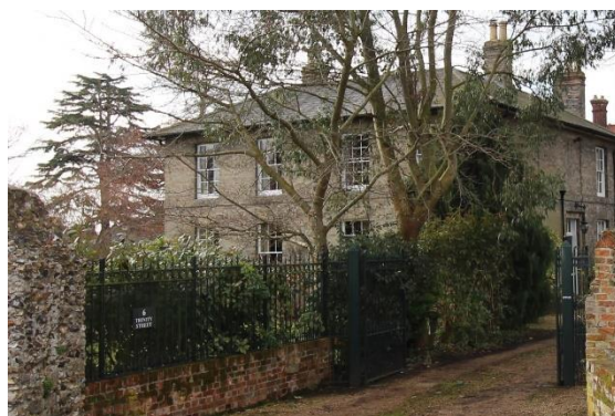
The Old Vicarage, No.6 Trinity Street

For Nos.2 & 4 (Even) including Owles Warehouse, see The Market Character Area.