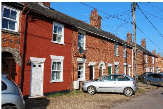
Nos.6-10 (even) Southend Road

Nos.2 & 4 Southend Road. A semi-detached pair of red brick cottages of mid nineteenth century date. Black pan tiled roof. Original door and window openings survive but external joinery replaced. Horned small pane sashes beneath rendered lintels. Door to No.4 boarded, that to No.2 two paneled. Blind return elevation. Garage to No.2 not included.