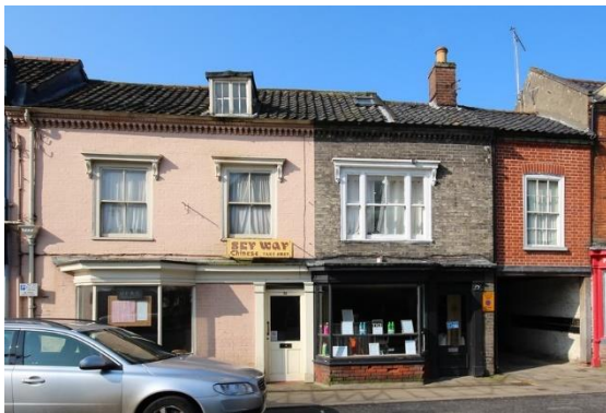
Nos.30-32 St Mary's Street

dormers. Red brick with a black pan tiled roof. No.20 has a shallow later nineteenth century canted splay bay at first floor level with centre glazing bars, and a cornice. Mid-twentieth century splayed shop front. No.22, two flush framed twelve-light sash windows at first floor level with glazing bars and cambered brick lintels. Early nineteenth century wooden shop front with pilasters. Rendered return gable with parapet. To the left a single-bay two storey wing with wide vehicle way under. Heavily repointed red brick. At first floor level a hornless twelve-light sash within a flush frame. Red brick single-storey outbuilding of possibly early nineteenth century date at rear of site close to Castle Orchard. Nos.2 to 22 (even) form a group.