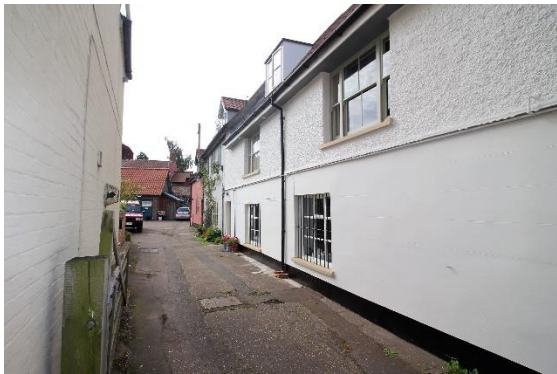
No.27 Earsham Street

Nos.23-25 Odd Earsham Street. A pair of altered c1800 cottages standing in a private courtyard to the rear of No.29. No.23 rendered and of a single storey with an attic lit by a gabled dormer. Late twentieth century window joinery. No.25, two storeys of painted brick with casement windows and a weatherboarded gabled dormer. The rear section of the plot on which this building stands is within the scheduled area of the Castle complex.