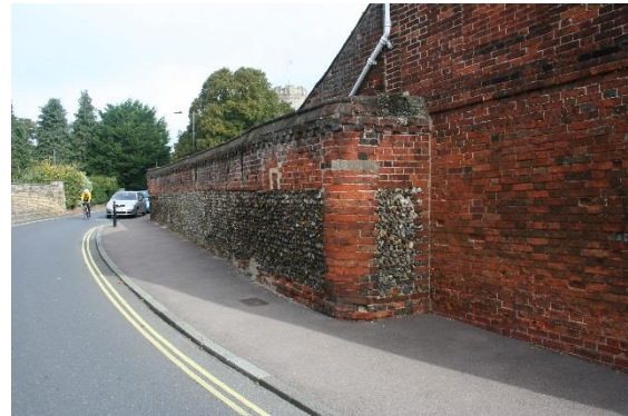
Wall of Garden to Trinity Hall, Trinity Street

brick with brick cope. Yellow brick pier with stone cap, west.