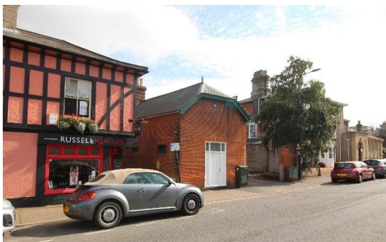
No.18a, Broad Street

Forecourt Wall to No.16 Broad Street (grade II). Early nineteenth century, curved on plan, yellow brick screen wall about eight feet high with stone cope and arched doorway, and with square pier with damaged stone finials.