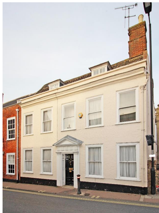
No.5 Trinity Street

Nos.1&3 Trinity Street (grade II). A pair of eighteenth-century houses with a unified seven bay two storey red brick façade to Trinity Street. Attic floor lit by dormers largely hidden behind parapet with a rendered cope. Pan tiled roof. Two false windows painted to look like sashes. Twelve-light hornless sash windows within flush frames, and beneath flat arches. Where windows have been replaced the replacements have horns. Lead rainwater heads. No.1 has a six-panelled door in wooden Doric case. No.3 with a six-panelled door, panelled reveals, fluted pilasters, frieze with swag enrichment and centre medallion head. Nos.1 to 19 (odd) form a group.