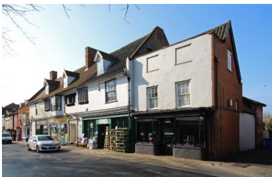
Nos.14-18 St Mary's Street

No.12 St Mary's Street (grade II) Later eighteenth century, three storey, red brick, with a stuccoed façade and a stone cope. Pan tiles. Good wooden shop fascia with a central door and rounded corners to the flanking bays, later twentieth century glazing. Two twelve-light hornless sashes at first floor level. Two blank panels to second floor. Flush frame sash window in gable on northern return elevation. Nos.2-22 (even) form a group.