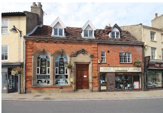
No.8 Market Place

No.6 Market Place. A mid nineteenth century shop with domestic accommodation above. Three storeys and three bays. Faced in gault brick with a painted façade. Nine light hornless sash windows to first and second floors. Second floor with blind central recess. Notable early twentieth century glazed tile shop fascia with deep green and chocolate coloured tiles and carved wooden brackets. Decorative brass pilasters to entrance. The rear section of the plot on which this building stands is within the scheduled area of the Castle complex. Honeywood F, Morrow P, & Reeve C The Town Recorder, A History of Bungay in Photographs (Bungay, 1994) p135.