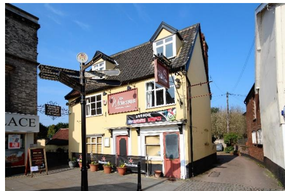
The White Swan, No.16 Market Place

No.14 Market Place (grade II) An early nineteenth century shop of three storeys, two, three-light casement windows at second floor level with flush frames. Two, three-light flush frame sash windows at first floor level. Stucco painted. Low pitched black pan tiled roof. Coupled mutules to eaves. Early nineteenth century shallow projecting splay ended wooden shop front running the full width of the ground floor, with central double doors and a mutular entablature. Red brick two storey rear range. Nos.2 to 16 (even) form a group. The rear section of the plot on which this building stands is within the scheduled area of the Castle complex.