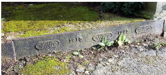
Stair to Nathan's Yard, Castle Lane

No.4 Castle Lane. Two storey red brick with pan tiled roof of both red and black pan tiles. Probably early to mid-nineteenth century but with late twentieth century casement windows. The central two bays probably represent the earliest surviving phase and have a single bay, two storey addition at either end. Ridge stack on former gable end. Forms part of the setting of a section of the scheduled Castle wall.