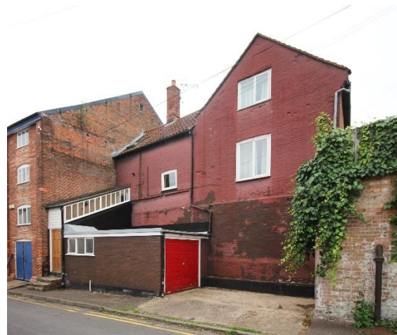
The Armoury, Nethergate Street

The Armoury, Nethergate Street. House of painted red brick with a red pan tiled roof. Probably of eighteenth-century date and formerly part of a maltings complex (see 1885 1:2,500 Ordnance Survey map). Also used as a regimental armoury for the 2 nd Volunteer Battalion Norfolk Regiment (see also No.12 Scales Street). Nethergate Street façade of two bays, the right-hand bay gabled. Large blocked arched opening visible behind twentieth century garage addition and scarring for blocked window above. Entrance door at first floor level approached by enclosed flight of steps. All present windows in Nethergate Street façade late twentieth century casements. Return elevation to the garden of the grade II Nos.12-16 Broad Street largely blind.