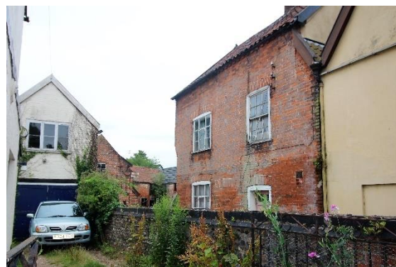
Rear range and outbuildings at No.26 Bridge Street

shop windows described in the listing description now replaced by small pane sashes. No.26, stuccoed, with a nineteenth century wooden shop fascia with pilasters retaining small glazed panelled windows. Panelled door. A single sixteen-light hornless sash above within a flush frame. Blocked doorway in gabled return elevation.