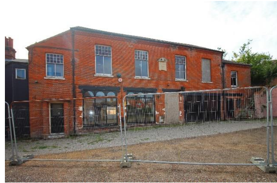
Odd Fellows Hall to the rear of No.2 Market Place

Two storey early to mid- nineteenth century red brick range to the rear, attached to which is a former Odd Fellows Hall of 1887. This is a two storey red brick structure with a hall at first floor level and cart sheds beneath. Horned sash windows to first floor. Black pan tile roof. Nos.2 to 16 (even) form a group. The walls to the rear of the plot are within the scheduled area of the Castle complex.