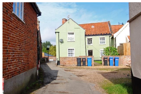
Nos.69-71 Earsham Street from Castle Lane, the wing on the left was formerly a separate cottage.