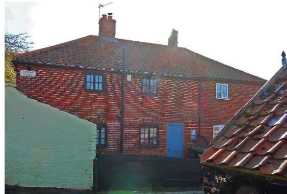
Nos.11 & 15 Quaves Lane

See also No.54 St Mary's Street and No.2 Upper Olland Street.