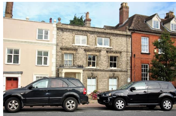
No.14 Earsham Street

No.14 Earsham Street (grade II). A substantial dwelling with seventeenth century origins. It is reputed to have been built in 1620 but is probably of c1660, and once formed part of a much larger dwelling which included No.16. Three storeys and three bays. Mid nineteenth century gault brick classical façade with low parapet and corner pilasters capped by finials. Red pan tile roof covering. Horned plate glass sashes to ground and first floors. Six-panelled door, panelled reveals, enriched consoles, key, and bed mould remains of original entablature. Mid nineteenth century porch with slender columns, entablature, and cast-iron ornament. Partially glazed in the late twentieth century. Low eighteenth century rear service range with mid twentieth century Crittall windows and nineteenth century addition. This range is rendered and has a red pan tiled roof. Interior; panelled room, right, with fluted pilasters and cornice. In 1933, thirty-five horse's skulls were found fixed in rows between the joists of the floor of this room, said to be a music room, placed there to improve its acoustics. (No. 16, adjoining originally part of this room; similar skulls found under corresponding room on opposite side of the house). Original staircase gone and many other features. Panelled room used as hairdressing saloon. Nos. 14 and 16 are two of the few buildings which survived the fire of 1688.