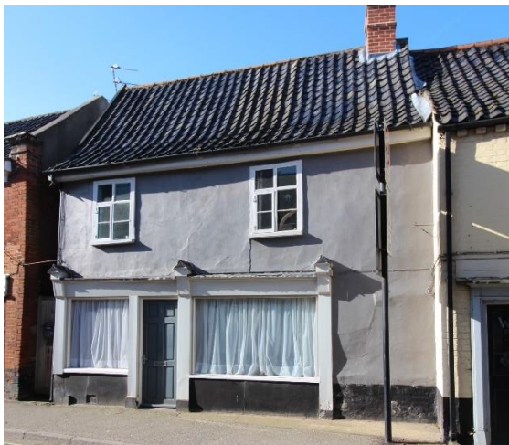
No.4 Upper Olland Street

No.2 Upper Olland Street (grade II). A seventeenth century structure with a nineteenth century façade of painted brick. Standing on the southern corner of Quaves Lane. Black pan tiled roof, dentilled eaves cornice, red brick chimney stack. First floor windows now plate-glass hornless sashes. Early nineteenth century wooden doorcase and shop fascia with pilasters and delicate entablature. Nos.2 to 10 (even), 14, 16 and Nos.20 to 24 (even) form a group. Honeywood F, Morrow P, & Reeve C, The Town Recorder, A History of Bungay in Photographs (Bungay, 1994) p185.