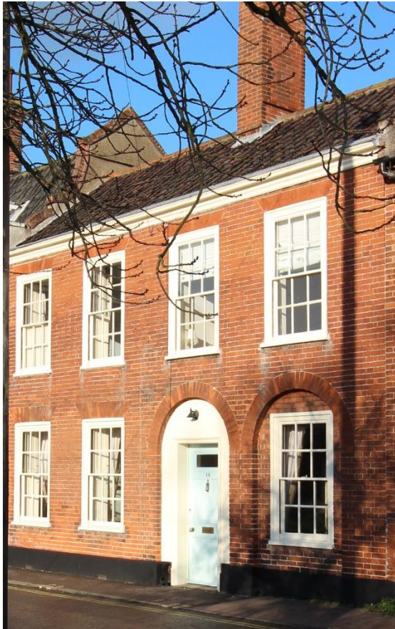
No.15 Trinity Street

No.15 Trinity Street (grade II). Late seventeenth century with eighteenth century red brick façade. Two storeys, red brick, wood cornice, black pan tiled roof. Twelve light hornless sashes in flush frames. Flat arched lintels. Pair of arched recesses under each right-hand window the left-hand one containing a five-panelled door, the right a twelve-light sash. Nos 1 to 19 (odd) form a group.