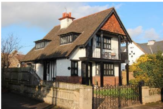
No.14 Scales Street

No.12 Scales Street. Former drill hall now car repair workshop. Probably designed and built by John Doe architect and builder of Bungay and dated 1906. Used primarily by the 2nd Volunteer Battalion Norfolk and 5 th Battalion Suffolk Regiments. Single storey red brick with Welsh slate roof formerly with tall leaded ventilator on ridge. Iron roof with tie rods. Gabled elevation to Scales Street with central circular former window with stone decoration in the form of four keystones. Mullioned and transomed wooden casement windows.