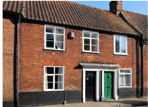
Nos.27 & 29 Upper Olland Street

cambered arches. No 25A has a wood reeded doorcase with roundels and a six-panelled door. No.25 to the right has a reeded doorcase with roundels and enriched canopy, and a twentieth century panelled door. Two gabled dormers. Formerly the Red Lion Public House. Honeywood F, Reeve C, & Reeve T, The Town Recorder, Five Centuries of Bungay at Play (Bungay, 2008) p155.