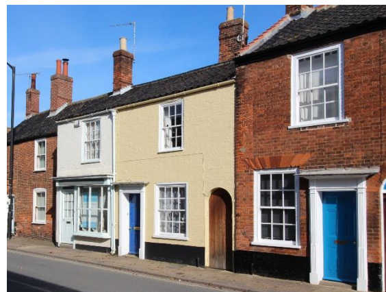
Nos.35-37 (odd) Lower Olland Street

Nos.31-33 (odd) Lower Olland Street. A pair of red brick terraced house of c1800 with a black pan tiled roof. Cambered arched lintels to window openings. External joinery replaced in the late twentieth century. Straight joint between the two properties.