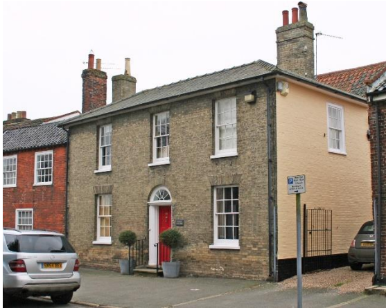
The Old Maltings, No.46 Upper Olland Street

dormers. Red brick with a plinth, black pan tiled roof. Nos.42 & 44 retain early sixteen-light hornless sashes. No. 40 now has plate glass sashes. Flat arched lintels to ground floor. Six-panelled doors in wooden cases with roundels and mutular cornices. Nos.30 to 34 (even), Emmanuel church and Nos.38 to 52 (even) form a group.