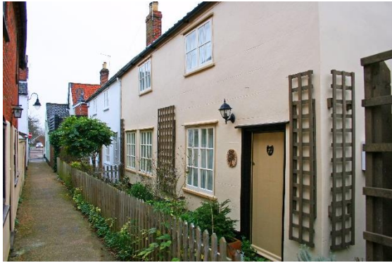
Nos.7 9 (Odd) Turnstile Lane

Nos.7-9 (Odd) Turnstile Lane. A terrace of four probably early nineteenth century cottages which were converted to two in the late twentieth century. Rendered façades with twelve-light casement windows and boarded doors. Red pan tiled roof, red brick ridge stacks.