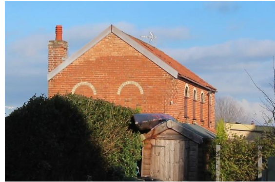
No.38 Broad Street

No.30 and 30A Broad Street (grade II). Eighteenth century house with nineteenth century shop fascia. Of two storeys, with a fairly steep red plain tile roof. Red brick, toothed eaves band. Red brick chimney stacks with drip-bands and capping to gable ends. At first floor level there are three, flush-framed, three-light wooden casement windows. A plinth and diaper of dark headers survive on the left-hand section. A single window opening with a twentieth century horned sash and a wedge-shaped lintel survives at ground floor level and a twentieth century six panelled door to No.30. No.30a has a partially glazed door of c1990. Late nineteenth century wide former shop front with pilasters and a central entrance. Door again of c1990. Two iron scroll brackets of former hanging signs at first floor level. Honeywood F, Morrow P & Reeve C, The Town Recorder, A History of Bungay in Photographs (Bungay, 1994) p152.