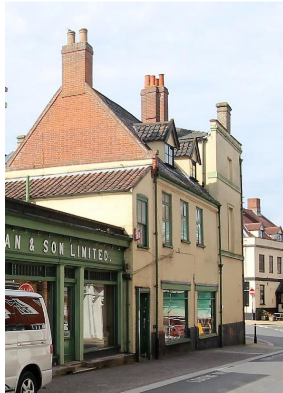
No.2 Trinity Street and No.5 Market Place.

No.2 Trinity Street (grade II). Seventeenth century and of two storeys with an attic lit by two gabled casement dormers. Limewashed brick, band cut away, plinth. Wooden cornice, black pan tiles, three first floor original mullioned and transomed casements. Six-panelled door in wing, left. Two late twentieth century plate glass shop windows to the ground floor. (See also No.5 Market Place).