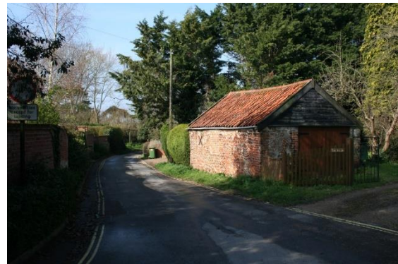
Outbuilding, The Keep, Castle Orchard

setting of the Castle ruins and directly abuts the scheduled monument.