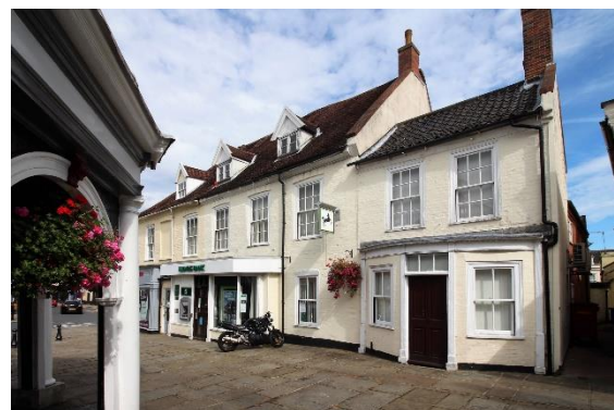
No. 11a Market Place

Nos. 9 & 11 Market Place (grade II). An early eighteenth century building on a prominent corner site. Of two storeys with attics which are lit by gabled sash dormers. Colour-washed brick. Red plain tile roof covering. Principal elevation of six bays and a return elevation of four. Flush framed twelve-light hornless sashes beneath rusticated cambered arches to first floor. Entrance door with fanlight and wood case. Mainly modern shop fronts. Originally one building. Essentially part of the old market. Nos. 1 to 11 (odd), Nos. 11A, 13 and Nos. 17 to 21 (odd) form a group together with the Butter Cross.