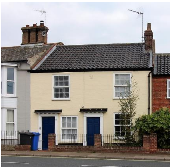
No.11 St John's Road

No.9 St John's Road. House of early to mid-nineteenth century date. Of painted red brick. Black pan tiled roof. Red brick stack of three linked grouped shafts to ridge. Two storey wooden canted bay window with four-pane plate-glass sashes. Doorcase with corbels. Twentieth century partially glazed door. Window above door with corbelled hood and pilastered frame.