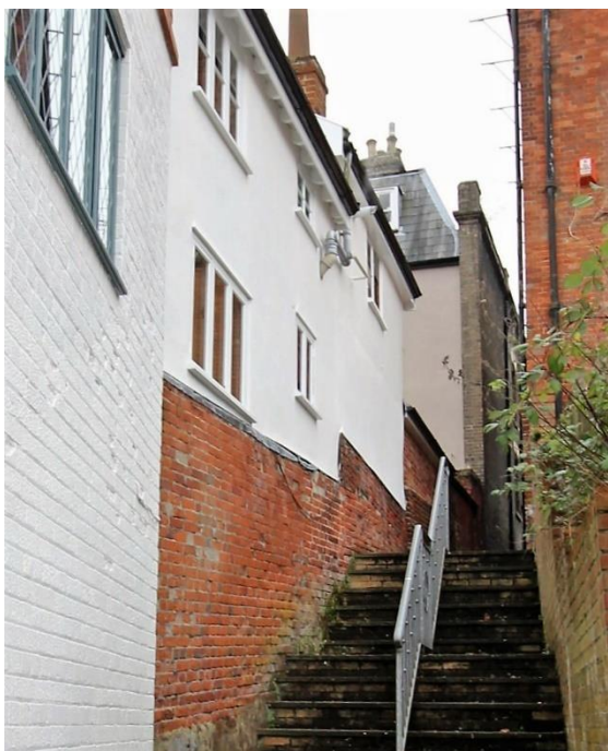
Borough Well Lane elevation of No.9 Trinity Street

No.9 Trinity Street. An altered eighteenth century detached dwelling standing at a right-angle to Trinity Street behind No.7. The house backs onto Borough Well Lane. Red brick with a partially rendered gable end. Sixteen-light sashes in heavy moulded frames. Three-bay two storey entrance façade with central doorway. Replaced red tile roof and central ridge stack. Rear elevation to Borough Well Lane with high basement storey. Red brick partially rendered with casement windows.