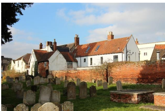
Churchyard elevation of Nos.2 & 4 Cross Street

Nos.2 & 4 Cross Street (grade II). Of later seventeenth century date with nineteenth century alterations. Of two storeys, with an attic lit by three gabled dormers. Roughcast on brick, with a coved cornice. Black pan tiled roof slope to Cross Street façade and red to the churchyard. Five mullioned and transomed casement windows at first floor level, and a near flush framed hornless sash window with glazing bars. No.2, has a late nineteenth century former pub fascia of wood with pilasters to the right-hand bay (former Crown Inn), its other shop fascia is probably a later twentieth century copy. No. 4, also has a late twentieth century shop front in the style of that of No.2. At the rear of No.2 a two-storey red brick eighteenth century range with a red pan tile roof and a single casement window at first floor level which abuts No.15 Market Place. The rear elevation which is visible from Saint Mary's Churchyard forms an important part of the setting of the grade I listed church. Honeywood F, Morrow P & Reeve C, The Town Recorder, A History of Bungay in Photographs (Bungay, 1994) p158. Honeywood F, Reeve C, & Reeve T, The Town Recorder, Five Centuries of Bungay at Play (Bungay, 2008) p141.