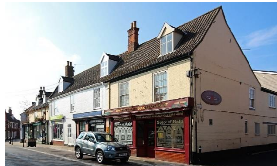
Nos.42-46 (even) St Mary's Street

Nos.36-38 (even) St Mary's Street. Early nineteenth century building of red brick, with a Suffolk white brick façade. Of three storeys and four-bays No.36 of one bay, No.38 of three with pilasters. Twelve-light hornless sash windows and a high parapet. Good possibly nineteenth century shop fascia with pilasters to No.38. Nineteenth century shop window to No.36.