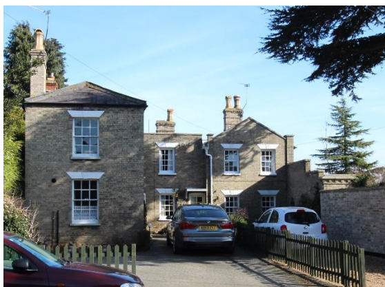
Nos.61 & 63 Lower Olland Street

Boundary wall to north of No.61 Lower Olland Street. A high gault brick mid nineteenth century boundary wall with panels and a stone cap. Curved sections flanking drive entrance at southern end.