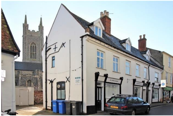
Nos.2 & 4 Cross Street

Nos.2 & 4 Cross Street (grade II). Of later seventeenth century date with nineteenth century alterations. Of two storeys, with an attic lit by three gabled dormers. Roughcast on brick, with a coved cornice. Black pan tiled roof slope to Cross Street façade and red to the churchyard. Five mullioned and transomed casement windows at first floor level, and a near flush framed hornless sash window with glazing bars. No.2, has a late nineteenth century former pub fascia of wood with pilasters to the right-hand bay (former Crown Inn), its other shop fascia is probably a later twentieth century copy. No. 4, also has a late twentieth century shop front in the style of that of No.2. At the rear of No.2 a two-storey red brick eighteenth century range with a red pan tile roof and a single casement window at first floor level which abuts No.15 Market Place. The rear elevation which is visible from Saint Mary's Churchyard forms an important part of the setting of the grade I listed church. Honeywood F, Morrow P & Reeve C, The Town Recorder, A History of Bungay in Photographs (Bungay, 1994) p158. Honeywood F, Reeve C, & Reeve T, The Town Recorder, Five Centuries of Bungay at Play (Bungay, 2008) p141.