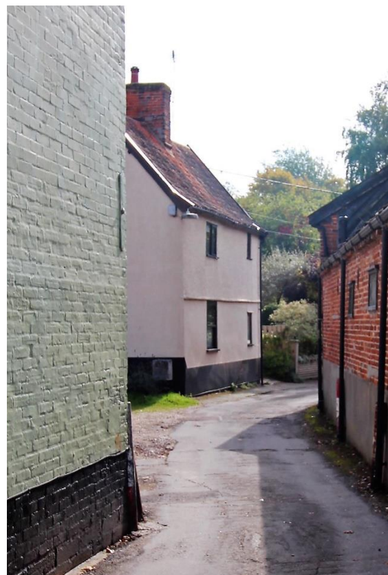
No.3 Castle Lane

For Scott House and garden walls see Earsham Street.