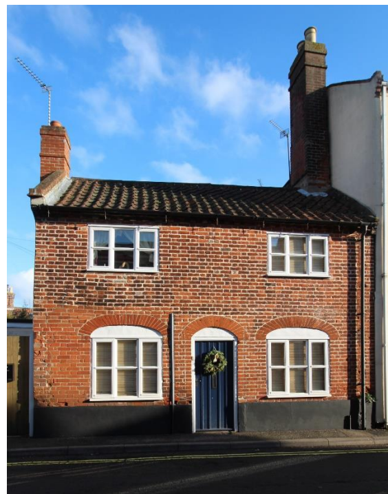
No.5 Upper Olland Street

No.3a early nineteenth century, two storey, red brick, shallow pitched red pan tiled roof. Flush Small pane casement at first floor level. Ground floor, flush frame sash, left, and shop front with glazing bars and wood case with channelled pilasters. Nos.1, 3, & 3a form a group with No.2 Lower Olland Street and No.56 St Mary's Street.