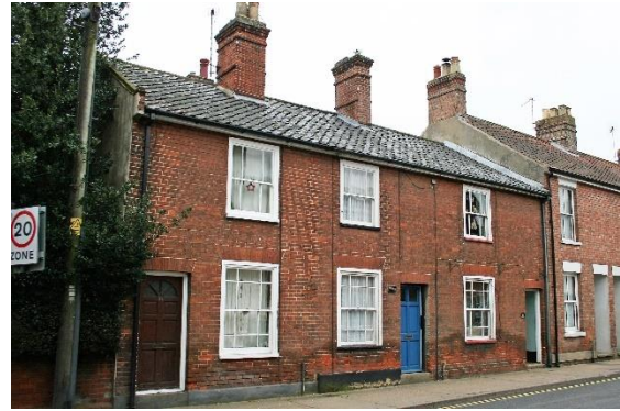
Nos.30-34 (even) Lower Olland Street.

Nos.18 &20 (even) Lower Olland Street. A semi-detached pair of early nineteenth century cottages. Red brick with a black pan tiled roof. Three bays wide with, at first floor level, a blind central panel flanked by sash windows. Twelve-light hornless sash window to first floor of No.18 probably the only original survival. The other windows are late twentieth century ones of varying designs. Six panelled front doors.