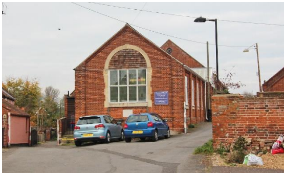
Lecture Hall, Rose Lane

Former Sunday School and lecture Hall, Rose Lane . Sunday School associated with Upper Olland Street Congregational Church built. 1867-69 to the designs of R.M. Marsden for Charles Stokes Carey. Red brick with gault brick dressings and pilasters. Traceried window in north gable and Twentieth century doorway. Return elevations with twelve-light hornless sashes and gault brick pilasters. Black pan tiled roof. Rear addition with wooden glazed roof and leaded coloured lights. Lecture rooms to rear of c1898 designed by JO Rees. Red brick with stone dressings. A prominently located structure at the junction with Rose Lane. Bettley, J, and Pevsner, N, The Buildings of England, Suffolk: East (London, 2015) p.151. Honeywood F, Morrow P, & Reeve C, The Town Recorder, A History of Bungay in Photographs (Bungay, 1994) p15 & p23.