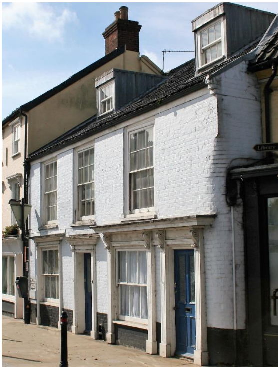
Nos.50-52 (even) St Mary's Street

No.48 St Mary's Street (grade II). Eighteenth century, of two storeys and an attic. Black pan tiled roof with two gabled dormers. Painted brick. Three-bay rendered façade with sixteen-light flush-framed sashes to the outer bays and a casement window to the centre. Coved cornice. Mid-nineteenth century shop front with cornice and consoles. Nos.42 to 56 (even) form a group.