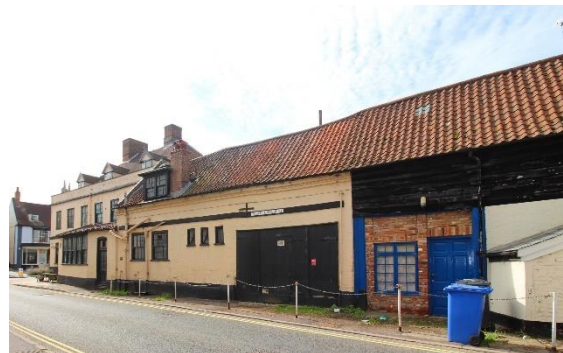
Broad Street façade of Nos.2a & 2b Earsham Street

Nos.2a & 2b Earsham Street. A pair of shops with a painted and rendered brick façade above a continuous early to mid-twentieth century shop facia. Rear elevation faces Broad Street. The shop front replaces sash windows shown on c1910 photographs, however the present shop facia was extant by mid 1920s. Formerly part of the Three Tuns and shown as part of the Inn on the 1905 1:2,500 Ordnance Survey map. Shown as separate premises on the 1927 1:2,500 map. Five hornless plate glass sashes at first floor level. Shallow pitched roof with twentieth century black tile roof. Moulded eaves cornice. Shallow pitched black pan tile roof. The listing status of this range is not entirely clear.