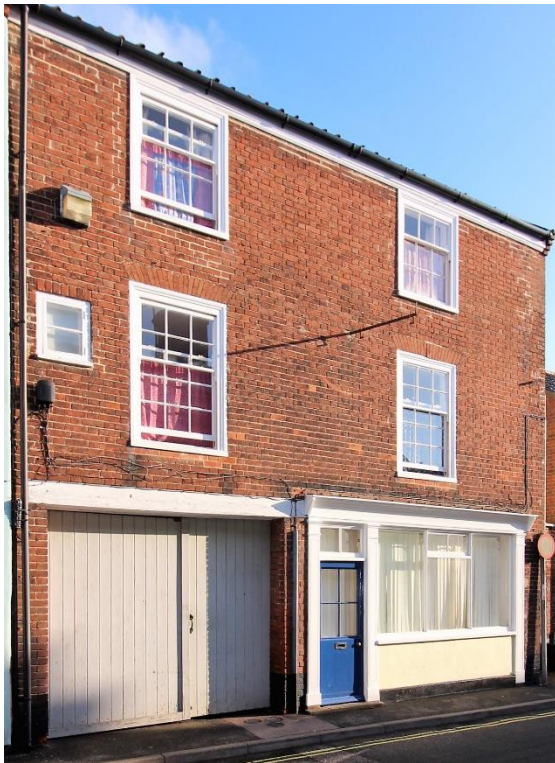
No.11 Upper Olland Street

Ground floor openings beneath segmental arched lintels. Large chimneystack to right-hand gable. Small rebuilt stack to left-hand gable.