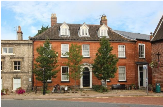
Earsham House, No.12, Earsham Street

Earsham House, No.12 Earsham Street including No.1a Broad Street (grade II). Eighteenth century two storey, attic, and basement, three pedimented dormers. Red brick, small wood cornice, modern tiles. Plinth. Five windows, sash, with glazing bars and flat arches. six-panel door in wood case with enriched pilasters, radial bar fanlight, consoles, and open pediment. Fine arts and crafts vernacular rear range of 1892 fronting onto Broad Street now part of the Council offices. Red brick with a hipped roof over wide projecting eaves. Fine oriel window at first floor level with mullions and a transom containing leaded lights. This housed a billiard room on the first floor and was designed by Bernard Smith with fittings by MFC Turpin and WB Simpson. The fine pargetted decoration is by Daymond and Son. Bettley, J, and Pevsner, N, The Buildings of England, Suffolk: East (London, 2015) p.154-155.