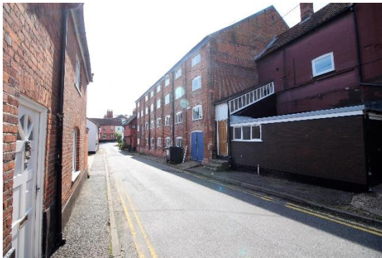
Former Maltings, Nethergate Street

Former Maltings, Nethergate Street. A former maltings of c1900 date, with elevations to Nethergate Street and a courtyard off Broad Street. A rebuilding of an earlier maltings complex. The present structure postdates the 1885 Ordnance Survey map but is shown on that of 1905. Four storeys to Nethergate Street and two to Broad Street. Red brick with a blue corrugated metal roof. Nethergate Street façade of seven bays divided by pilasters. Casement windows and boarded doors beneath cambered brick lintels. The Broad Street façade has similar casements and is also divided by pilasters.