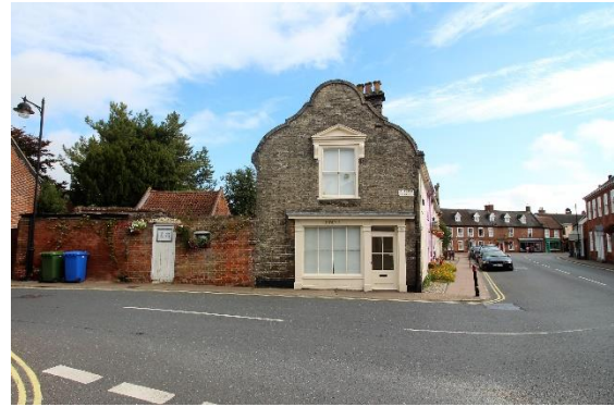
The Chaucer Street façade of No.22 Earsham Street

Nos.20-22 (even) Earsham Street and outbuilding to rear of No.22 (grade II). Part of the same structure as No 18. Probably of mid to late seventeenth century date, two storeys and an attic. Roof to No.22 covered with red plain tiles that to No.20 red pan tiles. These are separated by a partially rendered Dutch gable of possible seventeenth century date. Projecting eaves, and tall gault brick ridge stacks. No.20 with a single gabled dormer containing small pane casement windows. Painted stucco façade to Earsham Street. Six, twelve-light hornless sash windows at first floor level within flush frames. Mid to late nineteenth century horned plate-glass sashes to ground floor. Six-panelled door to No.20, with semi-circular fanlight the radial bars of which have been removed (see No.18). Set within doorcase with open pediment supported on brackets.