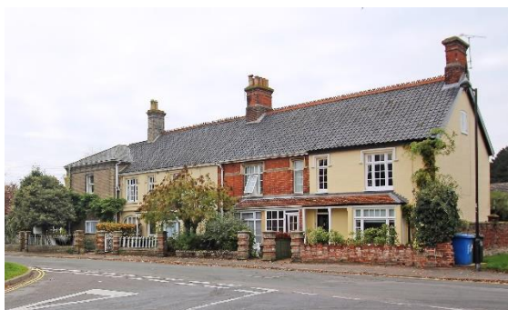
Nos.2-6 (even) Flixton Road

Nos.2-6 (even) Flixton Road and boundary walls. Terrace of three substantial houses c1900, attached to the rear of the larger and slightly earlier No.8. Red brick with stone dressings. Black pan tile roof