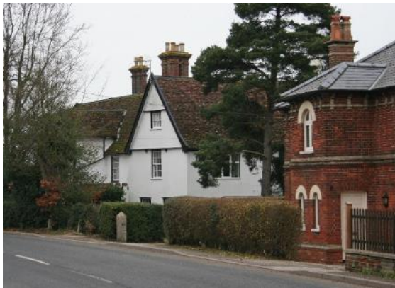
'The Ollands' No.51, & 'The Gables' No.53 St John's Road

Belle Vue Villas Nos.17-21 odd St John's Road. Terrace dated 1909, of red brick within stone dressings. Black pan tiled roof. Canted bay windows to ground floor. Narrow arched windows above door openings. Twentieth century casements within original window openings. Partially glazed front doors. No.17 has late twentieth century porch on return elevation which is faced in Fletton brick with decorative red brick bands. Subsidiary Structures. Low red brick garden walls with stone capped square section piers and decorative iron gates.