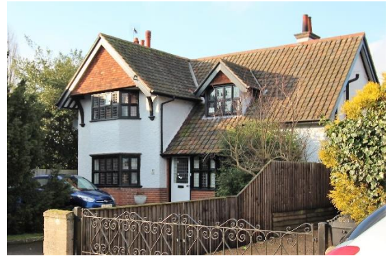
No.16 Scales Street

Bedford House No.14 Scales Street and front garden wall (local list). Early twentieth century detached villa designed and built by John Doe. Inventive free Arts and Crafts Tudor vernacular style. Red brick and rough cast elevations. Wooden mullioned and transomed windows with leaded lights. Scales Street elevation gabled with plain tile hung apex which projects and is supported on a full height wooden veranda. Late twentieth century pan tiled roof with original flat roofed dormers. Subsidiary Structures Low contemporary concrete garden wall to Street frontage with balustrade. Bettley, J, and Pevsner, N, The Buildings of England, Suffolk: East (London, 2015) p.155.