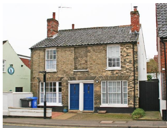
Nos. 6&8 Lower Olland Street

No.4 Lower Olland Street. Two cottages, latterly house and shop. Red brick with a steeply pitched black pan tiled roof. Possibly late eighteenth century. Well preserved later nineteenth century shop fascia to southern end of a single bay. Two centrally opening casements to first floor which are possibly of nineteenth century date flanking a central blind recess. Southern return elevation partially rendered with replaced windows. Door and widow openings to ground floor with cambered brick lintels. Ground floor window at northern end now a late twentieth century four pane casement. Northern elevation rendered. Single storey rear range.