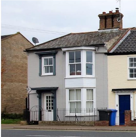
No.9 St John's Road

preserved to first floor. The sashes to the canted bays also appear to be original. Partially glazed four panelled doors and doorcases with decorative corbels. Subsidiary Features Low gault brick boundary wall to street formerly with cast iron spear type railings and hooped cast iron gates.