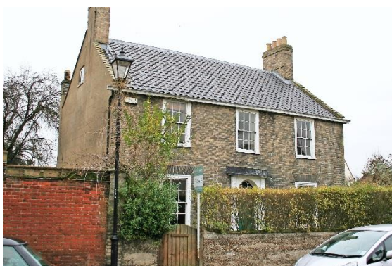
No.34 Upper Olland Street

No.34 Upper Olland Street (grade II). An early nineteenth century detached villa with a symmetrical classical entrance façade of three bays. Of two storeys with attics lit from within the gabled return elevations. Suffolk white brick façade with a mutular cornice, and a black pan tiled roof. Rear elevation red brick, side elevations rendered. Three twelve-light hornless sashes within flush frames at first floor level. Two further twelve-light sashes with flat arched lintels flanking the doorcase. Six-panelled entrance door with arched patterned fanlight in an enriched wooden case. Northern return elevation highly visible from chapel graveyard. Rear elevation with nineteenth century casements beneath cambered lintels. Subsidiary Structures Screen walls to the left and right at a right-angle, each seven feet high with a stone cope, with a side door and blank panel respectively, square section piers. Low brick wall to front. Nos.30 to 34 (even), Emmanuel church and Nos.38 to 52 (even) form a group.