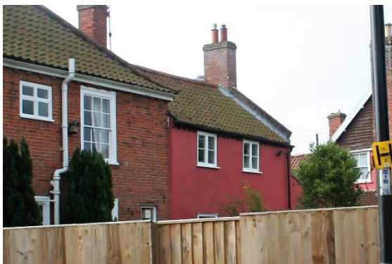
No.18a Trinity Street

No.16, 18a, & 18b Trinity Street (grade II). On the corner of Wharton Street. Two eighteenth century houses of two storeys with attics lit by three gabled dormers. Three-bay façade to Trinity Street. Twelve-light hornless sashes in flush frames, those to the ground floor with flat arched lintels. Red pan tiled roof. Six-panelled doors in wooden cases with dentilled cornices. No.16 has its entrance on the northern (return) elevation. This has three twelve-light hornless sashes in flush frames at first floor level and two similar below. Large nineteenth century casement to ground floor north-east corner. Nos.10 and Nos.14 to 18 (even) form a group. Nos.14 to 18 form a group with Nos.9, 11A & 11 Wharton Street.