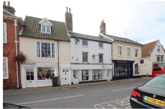
No.19 Earsham Street

No.17 Earsham Street (grade II) Early eighteenth century, two storey and attic, gabled dormer, pantiles. Brick, painted. three-light sash window with flush frame and glazing bars. Early nineteenth century shop front with pilasters, modillion cornice (covered), and modern glazing. Separate six-panelled door in wood case. Nos.1 to 19 (odd) form a group. The rear section of the plot on which this building stands is within the scheduled area of the Castle complex.