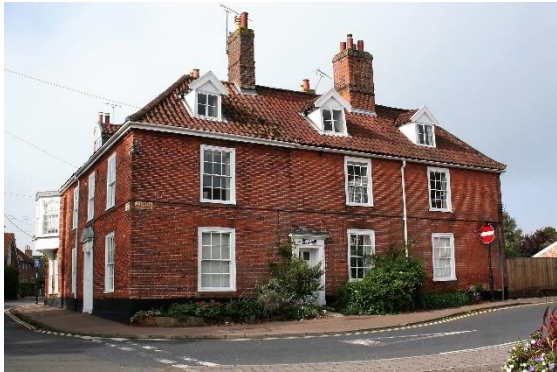
Nos.16 &18 Trinity Street

Wharton Street. Altered first floor sash windows. No.10 and Nos.14 to 18 (even) form a group. Nos.14 to 18 (even) form a group with Nos.9, 11A, 11 Wharton Street.