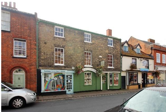
Nos.39 & 41 (odd), Earsham Street

Nos.39 & 41 (odd), Earsham Street (grade II). Early nineteenth century façade of Suffolk white brick. Of three storeys and three bays. At first floor level three twelve-light hornless sashes beneath wedge shaped lintels. Pan tiled roof. No.39 modern shop front. Central window, ground floor, with glazing bars, in wide panel with segmental arch. No. 41, four-panel door in wood case with consoles, canted bay window with plate glass sashes to right. Rear elevation of two storeys with red pan tiled roof slope. Nos.39, 41, 49, 51, 5, to 61 (odd) and Nos.65 to 73 (odd) form a group. The rear section of the plot on which this building stands is within the scheduled area of the Castle complex.