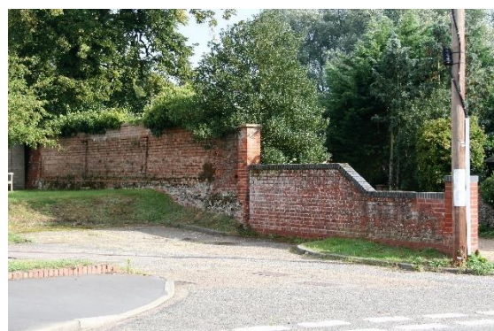
Boundary wall No.3 Staithe Road

No.3 Staithe Road (grade II). A detached house of later eighteenth, or early nineteenth century date. Of two storeys with a gabled attic lit by later windows. Suffolk yellow brick. Black pan tiled roof. Of three bays, the right-hand bay projecting slightly and having a gable. Twelve-light hornless flush-framed sash windows. Those to the ground floor having segmental arched lintels. Five-sided canted bay window with casements to ground floor of gabled bay. Six-panelled door with wooden case. Elliptical fanlight Side door in wing wall with elliptical arch. Subsidiary structures to the right, now separated from No.3 by the entrance to a housing development, a red brick boundary wall of nineteenth century date with stone capped square-section piers. Lower twentieth century section directly by street. Low painted brick retaining wall to front.