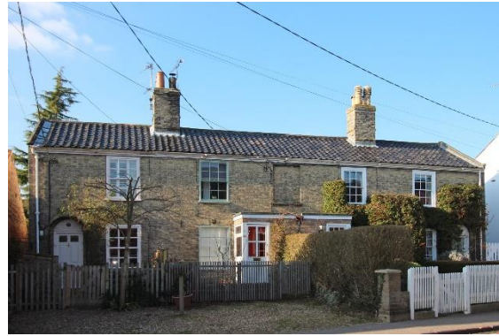
Nos.5-11 (Odd) Wingfield Street

No.3 Wingfield Street, outbuilding, and boundary wall. A detached villa of c1900 with earlier outbuilding to rear. The outbuilding is shown on the 1885 1:2,500 map, the villa not till that of 1905. Villa red brick with stone dressings and a plain tile roof. Plate-glass sash windows in flush frames. Canted bay windows to ground floor with carved stone lintels to windows and keystones. Gabled wooden porch containing a six-panelled door. Subsidiary structures Attached red brick outbuilding with red pan tiled roof to rear, partially built over stone boundary wall. C1900 red brick dwarf wall and piers to front with decorative railings. Twentieth century flat-roofed garage addition not of significance.