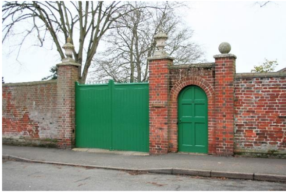
Front Wall of garden to Rose Hall

Front Wall of garden to Rose Hall, No.52 Upper Olland Street (grade II). A later eighteenth century, 7 ft high wall of red brick, with a moulded cope of terra cotta rising to 10 ft on return, with tall square brick piers, one with stone ball on cap, and a pair of stone gadrooned vases on caps, north. Nos.30 to 34 (even), Emmanuel Church and Nos.38 to 52 (even) form a group.