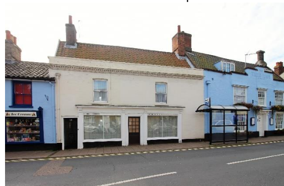
No.33 Earsham Street

No.31 Earsham Street. A mid nineteenth century symmetrical painted brick façade with two, horned, plate-glass sashes at first floor level. Black pan tile roof with gault brick ridge stack. Central partially glazed door flanked by shop facias. Historic photos show the building with small pane sashes to the first floor and ground floor left, the ground floor window having a wedge-shaped lintel. The rear section of the plot on which this building stands is within the scheduled area of the Castle complex.