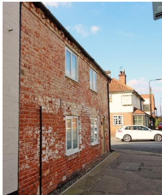
No.21 Broad Street

Cambridge House, No.19 Broad Street (grade II). Later eighteenth century façade of two storeys and three bays, with an attic lit by twin flat roofed dormers with sashes. Black pan tile roof covering with red brick stacks rising from the gable ends. Symmetrical classical façade of painted red brick with a high parapet. Three twelve light hornless sashes at first floor level beneath wedge shaped lintels. Centrally placed six-panelled front door with a wooden architrave and panelled reveals. Wooden Doric porch with an enriched entablature. Nos.15-19 form a group.