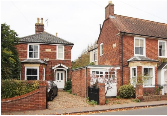
No.1 Wingfield Street

No.1 Wingfield Street. Detached villa of c1900. Red brick with a black glazed pan tiled roof. Stone dressings. Horned sash windows and partially glazed four-panelled door. Twentieth century wooden porch. Canted bay window to western bay of ground floor.