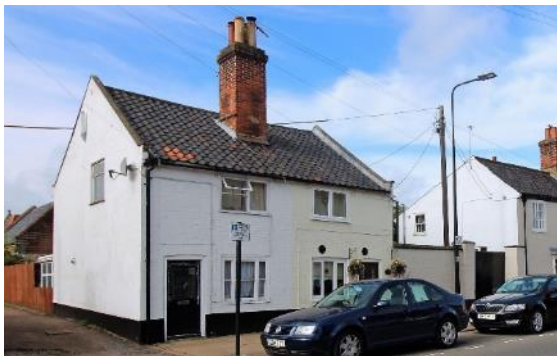
Nos.11-13 (odd) Broad Street

No.1a Broad Street see Earsham House No.12 Earsham Street.