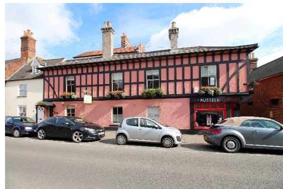
Oxnead, No.18 Broad Street

No.18a, Broad Street. Stable and coach house of later nineteenth century date. Latterly public library and now a dwelling. Not shown on the 1885 1:2,500 Ordnance Survey map, but on that of 1905. It replaces an earlier structure and was originally built to serve the house now known as 12-18 (even) Broad Street. Red brick with a Welsh slate roof. Four-light casement windows beneath shallow arched brick lintels. Boarded doors. Now converted to domestic use. Two storeys, single bay elevation to Broad Street and four bay return elevation to Brandy Lane. Garden wall earlier incorporated within Brandy Lane elevation. Further contemporary single storey red brick range to the rear. Lean-to garage addition of late twentieth century date. Possibly a curtilage structure to the grade II listed Nos.12-18 (even) Broad Street.