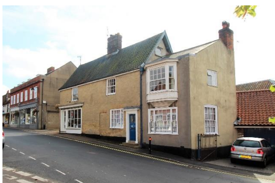
Nos.57 -59 (odd) Earsham Street

Cameron House and The Old Ironworks, Nathans Yard, Earsham Street. Remains of former Rumsby's Waveney Ironworks (closed 1966) now dwellings. The ironworks was originally established by the Cameron family in the early nineteenth century. Mid and later nineteenth century with substantial later twentieth century alterations and additions. Red pan tile roof. At the rear a flint and stone rubble structure with red brick quoins and a hipped red pan tiled roof. The Old Ironworks is largely formed from a later nineteenth century red brick former workshop range. Now partially painted, arched window openings with blue brick lintels and dentilled brick eaves cornice. Late twentieth century replicas of the original iron framed casements. Weatherboarded return elevations. Former vehicle entrance to building now infilled with boarding and containing a twentieth century six-panelled door. Narrower stone rubble section to rear. This complex partially stands within the area of the scheduled Castle earthworks and contains a section of Castle wall. It is visible from Castle Lane.