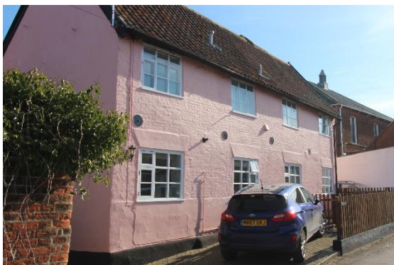
Nos.5 & 9 Rose Lane

Nos. 5 & 9 Rose Lane. A pair of cottages of late eighteenth century date, which are now a single dwelling. Painted red brick with mullioned and transomed casement windows and a red pan tiled roof. Ground floor windows have rendered flat-arched lintels. Blocked doorway. Rendered northern return elevation. Substantial rendered rear range with a red pan tiled roof with a red brick ridge stack and single storey lean-tos.