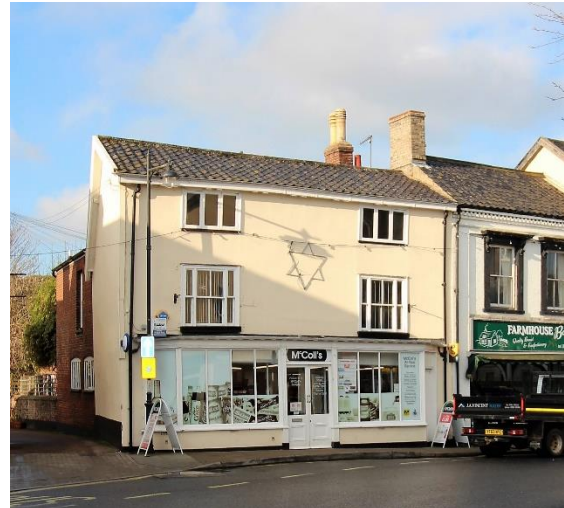
No.14 Market Place

No.12 Market Place. Former public house, now a shop, front range probably of mid-nineteenth century date. Painted brick with a black pan tile roof. Gault brick stack. Dentilled brick eaves cornice plain pilasters and heavy classical surrounds to first floor windows. Four-light horned sashes. Twentieth century shop fascia. The Bell Inn closed c1920. The building plays an important and positive role within the setting of the grade II listed Nos.10 & 14 Market Place. The rear section of the plot on which this building stands is within the scheduled area of the Castle complex. Reeve C, Bungay Through Time (Stroud, 2009) p11. Honeywood F, Reeve C, & Reeve T, The Town Recorder, Five Centuries of Bungay at Play (Bungay, 2008) p144.