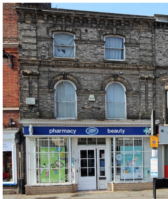
No.4 St Mary's Street

No.2 St Mary's Street. A red brick house and shop of c1800, re-fronted and partially rebuilt in Suffolk white brick c1870 probably to the designs of William Oldham Chambers of Lowestoft who designed the adjacent façade to the south. Three storey white brick façade of two bays, with canted bay to first-floor left. Horned plate-glass sashes. Parapet with dentilled cornice. Late twentieth century shop fascia. Early nineteenth century red brick range to rear with hornless sashes. Some windows with glazing bars removed. Taller two bay mid-nineteenth century red brick addition with plate-glass sashes. Flat-arched lintels and stone sills. Hipped roof with overhanging eaves. Return elevation rendered.