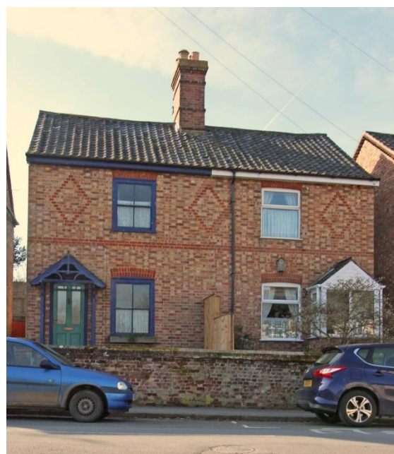
Nos.38-40 (even) Staithe Road

Alexandra Cottages, Nos.34-36 (even) Staithe Road . A semi-detached pair of houses of 1901. Alternate Fletton and red brick façade with elaborate red brick dressings. Black pan tiled roof and central ridge stack to spine wall. Replacement windows in original openings. Twentieth century porches. A relatively early use of Fletton brick. Nineteenth century red brick boundary wall to Staithe Rd.