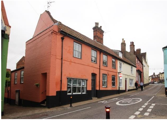
Nos. 4, No. 6a, & 6b Bridge Street

Nos. 4, No. 6a & 6b Bridge Street and garden walls to rear. (grade II). Standing on the corner of Borough Well Lane and probably of early eighteenth century date. Of two storeys and an attic, with a low two storey rear range facing Borough Well Lane. Rendered and painted with a platt band below the first-floor windows. Four-light plate glass sashes with horns to the first floor. One gabled dormer to No.4 within a replaced red pan tiled roof. No.4 is shown with a shop fascia to the ground floor right on c1920 photographs, but this has been replaced by a tripartite sash. To the left of the four-panelled front door is a relatively recent four-light horned sash, in a segmental arched opening. A small central window at first floor level is also shown on early photographs. To the rear of No.4 is a red brick range with an elevation facing a yard off Trinity Street. This has a black pan tiled roof to Borough Well Lane and a red pan tiled roof to its other faces. A late nineteenth century wooden oriel window is set within the end wall at first floor level. Below this window there was evidently a further recently demolished single storey projection