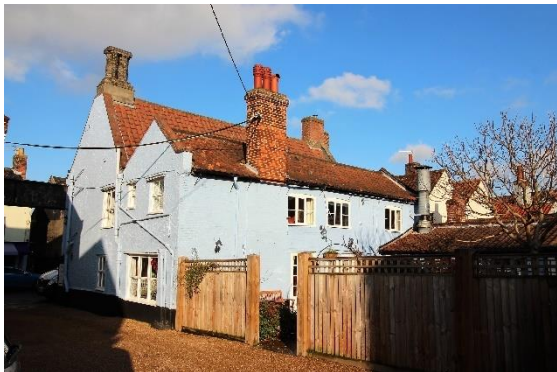
Rear range of The Castle Inn, No.35 Earsham Street

The Castle Inn, No.35 Earsham Street. Public house, formerly known as the White Lion. Reputedly an inn since the seventeenth century or earlier. Early nineteenth century roughcast rendered brick façade which is capped by a parapet which has been reduced in height, and an early to mid-twentieth century stepped pediment surmounted by a stone lion.