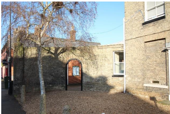
Forecourt Wall to No.16 Broad Street

Forecourt Wall to No.16 Broad Street (grade II). Early nineteenth century, curved on plan, yellow brick screen wall about eight feet high with stone cope and arched doorway, and with square pier with damaged stone finials.