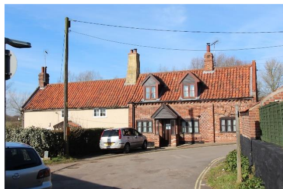
Nos.27 & 28 Quaves Lane

Nos.11 & 15 Quaves Lane with outbuilding and boundary wall to No.11 . A pair of semi-detached houses which were built in the early to mid-nineteenth century as three cottages, Nos.11& 13 are now combined. Red brick with a hipped red pan tiled roof. Two storeys with a single storey nineteenth century lean-to to the north-east (No.11). The east wall to Castle Lane is tarred. Late twentieth century timber doors and casement windows in original openings. Subsidiary Structures Low painted boundary wall to Quaves Lane elevation of No.11 which appears to be of nineteenth century date. Twentieth century wall to No.15.