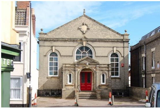
Former Wesleyan Methodist Chapel, Trinity Street

Moulded cornice and parapet. Black pan tiled roof. Symmetrical façade of five bays. Windows now later nineteenth century horned plate-glass sashes. Original flush frames with flat-arched lintels. Eight-panelled front door in a wooden case with fluted Doric pilasters, panelled reveals, triglyphs and a fret dentilled pediment. Gabled cross-wing containing fine staircase to rear. Twentieth century flat-roofed addition. Nos.1 to 19 (odd) form a group.