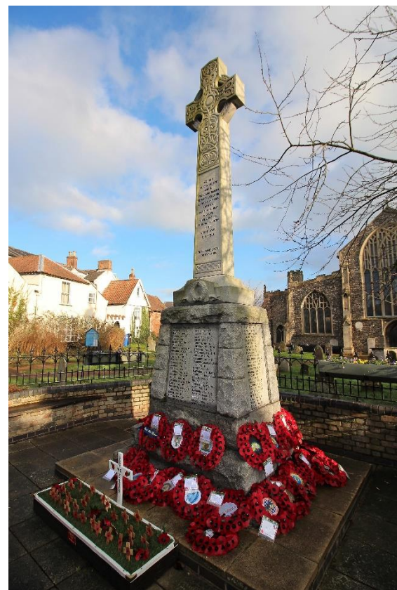
War Memorial, St Mary's Street

Pier with urn adjacent to K6 telephone box, St Mary's Churchyard. Probably a curtilage structure to St Mary's Church. Probably of early nineteenth century date. A square section Suffolk white brick pier with a stone cap and an urn. Painted plinth and lower section. A similar pier at the southern end of the churchyard is individually listed at grade II. A similar pier also once existed on Trinity Street but only its base now survives.