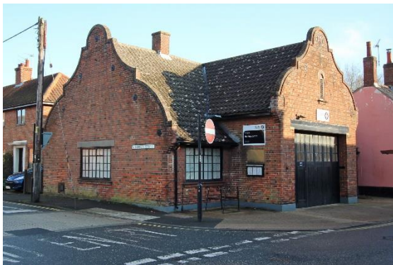
No.29 Lower Olland Street

Nos.1-3 (odd), Lower Olland Street (grade II). The former Angel public house, in use as such from the early nineteenth century, the pub closed in 2009. Seventeenth century timber-framed, now with a stuccoed, and largely early nineteenth century façade. lined and painted, coved cornice, black pan tiled roof covering. Four-bay principal façade with plate-glass sashes within flush frames. Two early nineteenth century six-panelled doors in wooden cases with mutular cornices. Former pub facia with small pane casements. Honeywood F, Reeve C, & Reeve T, The Town Recorder, Five Centuries of Bungay at Play (Bungay, 2008) p164.