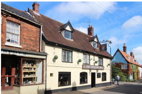
Chequers Inn, No. 23 Bridge Street

Nos.17-21 (odd) Bridge Street (grade II). No.19 early seventeenth century and later, with a nineteenth century public house façade. Now shop and dwelling. Of two storeys, faced in red brick and with a black pan tile roof covering to the main block. Single storey wing to left with red pan tile roof. Rendered ridge stack. Three hornless twelve-light sashes to the first floor with flat arched lintels and stone sills. Arched passage opening with six-panelled door with wood tympanum above matching the door. Mid twentieth century shop fascia to No 21. Two small twentieth century casements to ground floor, left. In the late nineteenth and early twentieth centuries at least part of the structure was the Beaconsfield Arms Public House. Nos.17, 21 & 23 form a group.