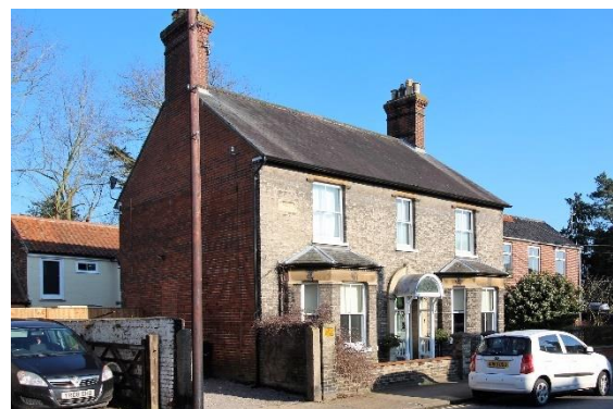
No.55 Lower Olland Street

No.53 Lower Olland Street . The former Ship Inn. A public house from 1791 or earlier, renovated and rendered 1923 when the fenestration was also altered. Closed 1980s. Red pan tiled gambrel roof with a single flat roofed dormer. Roughcast façades with leaded casement windows to first floor. Ground floor windows have had the leaded panes removed. Central partially glazed front door. Lower rear range possibly of early nineteenth century date. Red pan tiled roof. Casement windows. Honeywood F, Reeve C, & Reeve T, The Town Recorder, Five Centuries of Bungay at Play (Bungay, 2008) p166-167.