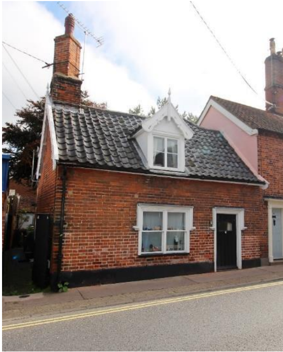
No.6 Chaucer Street

No.6 Chaucer Street. A small red brick structure externally of early to mid-nineteenth century appearance but possibly a re-casing of an earlier structure. Red brick with painted stone dressings and a black pan tile roof. Street frontage range of a single storey and attics, substantial largely nineteenth century rear range of two storeys. Hood moulds to window and door openings, gabled dormer to attic with elaborate bargeboards. External joinery largely replaced. Tall brick chimneystack to left-hand gable. In the nineteenth century the Two Brewers Public House.