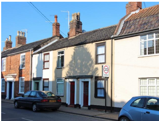
Nos.47-51 (Odd) Lower Olland Street

Nos.41-45 (Odd) Lower Olland Street (grade II). Later eighteenth or early nineteenth century, of two storeys, red brick, black pan tiled roof. Six bay façade with replaced sash windows within flush frames to each floor. Flat arched lintels to ground floor. Nos.41 and 43 have six-panelled doors in wooden cases with pilasters. No.45, a six-panelled door within an altered wooden doorcase with Doric pilasters. Blind recess above. Arched passage between Nos.41 and 43,