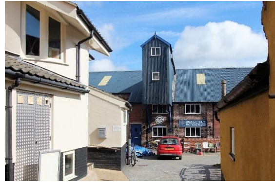
Broad Street façade of the Former Maltings, Nethergate Street

Former Maltings, Nethergate Street. A former maltings of c1900 date, with elevations to Nethergate Street and a courtyard off Broad Street. A rebuilding of an earlier maltings complex. The present structure postdates the 1885 Ordnance Survey map but is shown on that of 1905. Four storeys to Nethergate Street and two to Broad Street. Red brick with a blue corrugated metal roof. Nethergate Street façade of seven bays divided by pilasters. Casement windows and boarded doors beneath cambered brick lintels. The Broad Street façade has similar casements and is also divided by pilasters.