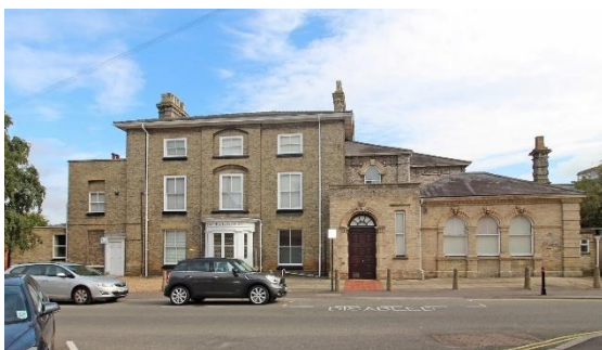
Nos.12-16 (even) Broad Street

Boundary wall to The Armoury. Mid nineteenth century gault brick wall with decorative panels between rusticated pilasters. Dentilled cornice and projecting plinth. Flanks the Broad Street garden entrance to The Armoury. For 'The Armoury' itself, see No.10a Nethergate Street.