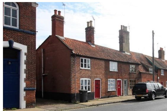
Nos.60-64 (even) Broad Street

No.58 Broad Street. A single storey cottage with a red brick façade and a red pan tile roof. Probably of mid to late eighteenth century date. The external joinery is now largely of late twentieth century date. Wedge-shaped lintels to door and window. Central rendered dormer with late twentieth century casement lighting attic. Massive red brick chimney stack.