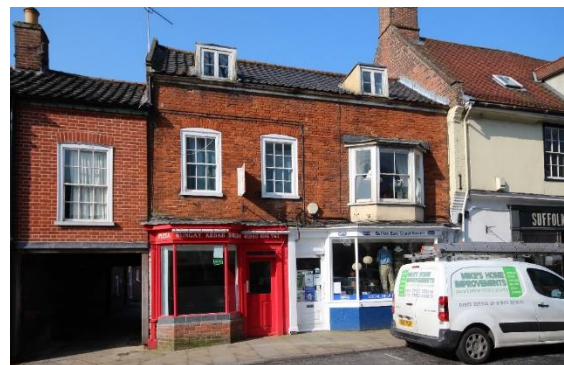
Nos.20-22 St Mary's Street

Nos.20-22 St Mary's Street and outbuilding to rear (grade II). Eighteenth century, of two storeys and an attic which is lit by two flat-roofed casement