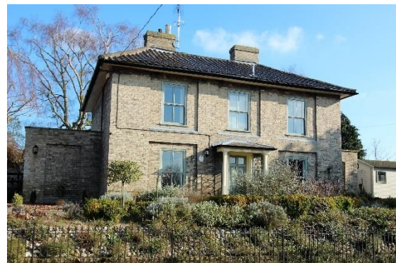
No.9 Flixton Road

roof and decorative tile ridge pieces. Entrance façade to north of three bays with central gabled porch and hornless sash windows. Flixton Road elevation with corner pilasters and pediment with a terracotta raking cornice. Hornless twelve-light sash windows with moulded brick surrounds with pilasters and stone corbels. No.7 of painted brick with a pan tiled roof. Casement windows to first floor. Wooden veranda with hipped pan tiled roof and fretwork frieze containing a canted bay window with sashes and shutters. Subsidiary Structures. Low nineteenth century red brick wall with a moulded gault brick cap and gault brick piers.