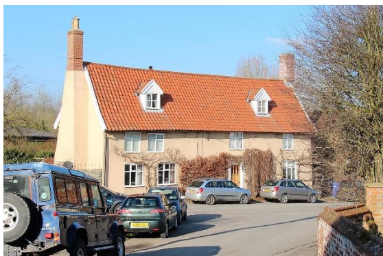
No.45 Staithe Road

Staithe Business Suite, Staithe Road. A later nineteenth century gault brick faced industrial structure which is now converted to offices. Shown on the 1885 Ordnance Survey map. Rendered return elevation. Hipped Welsh slate roof with overhanging eaves. Two louvered ventilators to ridge. Largely symmetrical façade with late twentieth century casement windows within original openings. Twin central doors with former taking-in doors above. Late twentieth century industrial structure to rear not of interest. Blocked doorway to left-hand outer bay. An important part of the setting of the grade II listed No.45 Staithe Road. Twentieth century addition to left not of interest.