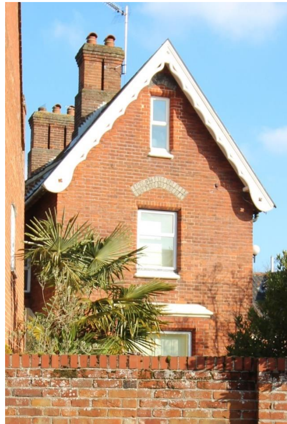
No.15 Upper Olland Street

No.13 Upper Olland Street. Detached villa of later nineteenth century date. Red brick with a black pan tiled roof. Two bay two storey façade with four pane plate-glass sashes to the first floor. Cantled bay window to ground floor and partially glazed front door within doorcase with pilasters.