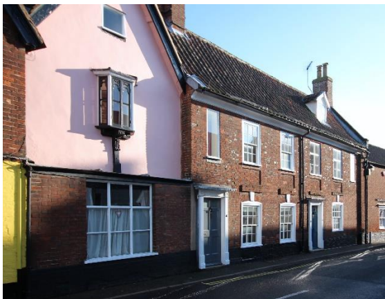
No.1 & No.3 Upper Olland Street

Ashby House, No.1 & Nos.3 & 3a Upper Olland Street, (grade II) Early eighteenth century, of two storeys and an attic. One gabled dormer to No.3a. No.1 has a gabled end bay which is partially rendered. Eighteenth century of two storeys and an attic, one gabled dormer and gabled section to left. No.1 incorporates an older timber-framed structure of which one fully-moulded beamed and joisted ceiling remains in an excellent state of preservation. Gabled section stuccoed. Remainder red brick, plaster core cornice. Black pan tiled roof. interrupted brick band below first floor windows. Four windows in flush frames (two sash and two mullion transom casements) at first floor level, also half window left and half panel right, segmental arches at ground floor with stucco keys. Two six-panelled doors, in wooden cases with pilasters,