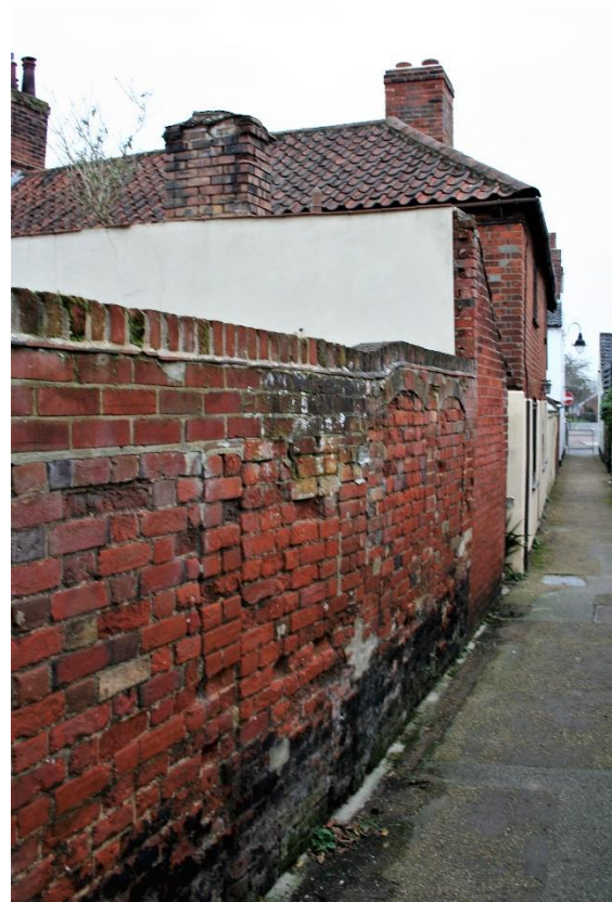
Wall to west of No.8

Outbuilding and Wall to west of No.8. Red brick boundary wall on the north side of Turnstile Lane, incorporating the remains of a partially demolished former cottage. Probably of early nineteenth century date. The structure was partially demolished after the publication of the 1970 Ordnance Survey map.