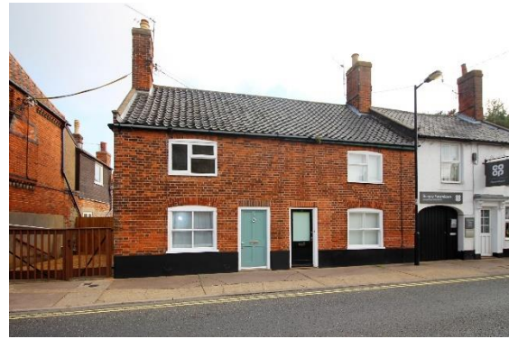
Nos. 14 & 16 Chaucer Street

No.12 Chaucer Street. A mid nineteenth century dwelling, now (2017) offices. Painted red brick with a black pan tile roof. Two storeys and two bays with a cart entrance to the rear yard in the left-hand bay. Window joinery replaced in the early twenty first century. Doorcase with panelled pilasters and scrolled corbels. Door within a later twentieth century partially glazed one.