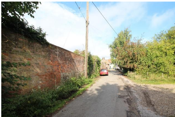
Scott House, garden walls to Castle Lane

Fronting onto Castle Lane the walls are largely of red brick and probably of mid nineteenth century date.