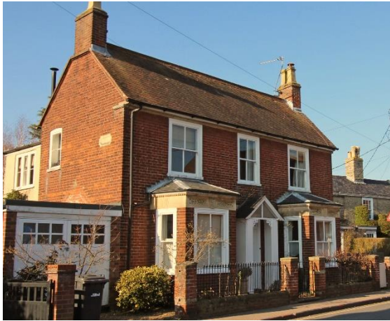
No.3 Wingfield Street

No.1 Wingfield Street. Detached villa of c1900. Red brick with a black glazed pan tiled roof. Stone dressings. Horned sash windows and partially glazed four-panelled door. Twentieth century wooden porch. Canted bay window to western bay of ground floor.