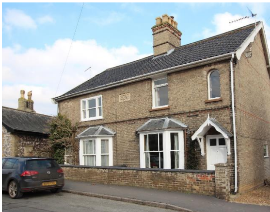
Pretoria Villas, Nos.19-21 (odd) Staithe Road

Dreyers Almshouses, Nos.9-17 (odd) Staithe Road (grade II). Single storey alms house block of 1848 faced in square knapped flint with gault brick dressings. Endowed by Eliza Dreyer for the widows of poor tradesmen. Seven-bay façade with gabled porches, outer bays gabled and slightly projecting. Gothic casement windows with three pointed lights. Octagonal shafts to chimneys with capping and drip moulded bases. Plinth. Near-flush-frame doors with cambered arches. Inscribed stone tablets in flank gables with date. Roof of octagonal Welsh slates, bargeboards with spear finials. Further gabled porches to return elevations.