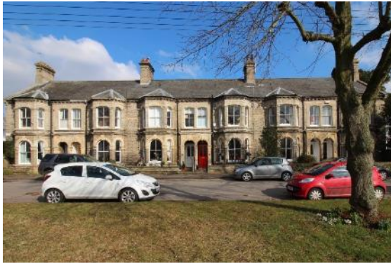
Waveney Terrace, Nos.24-34 Outney Road

Waveney Terrace, Nos.24-34 (even). Outney Road with boundary walls. A terrace of six substantial houses in three mirrored pairs of c1881. Shown on the 1885 1:2,500 Ordnance Survey map. Red brick with a gault brick façade and stone dressings. Welsh slate roof and corbelled eaves cornice. Each house is of two bays, one with a full height canted bay window. The other containing an arched porch with a pronounced key stone. Four-light plate glass sash above. Four panelled doors with glazed arched upper lights. Horned plate glass sashes. Late nineteenth century low gault brick boundary wall with square section gault brick gate piers. Decorative iron railings and gates now removed. Glazed tile paths to front doors of a geometric design. Red brick rear boundary walls and rear elevation. A good example of a speculatively built later nineteenth century terrace retaining the bulk of its original features and joinery. Honeywood F, Morrow P & Reeve C, The Town Recorder, A History of Bungay in Photographs (Bungay, 1994) p143.