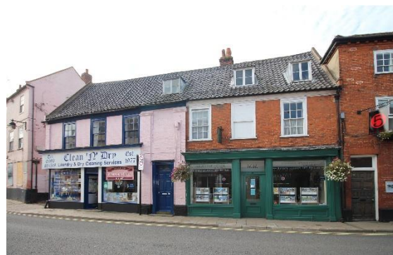
Nos.1-3 Earsham Street

Nos.1-3 Earsham Street (grade II). An eighteenth-century house, now converted to shops. Of two storeys and an attic, with three dormers set within a black pan tiled roof. Red brick, with a coved cornice. A pair of two storey brick pilasters with stucco caps flank the central entrance, with a blank panel above at first floor level. Six twelve-light sashes with flush frames. Central six-panelled door (No.1) with lozenge fanlight and case with reeded architrave and roundels. Twentieth century shop fascia to No.1, and an early nineteenth century wood shop front, to No.3 with a central entrance and pilasters. The section to the left of the door is a later addition to the original fascia. Nos.1 to 19 (odd) form a group. The rear section of the plot on which this building stands is within the scheduled area of the