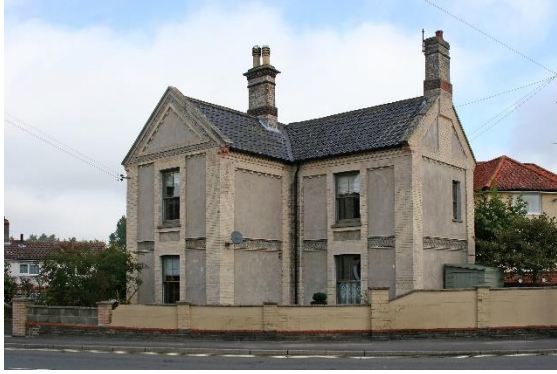
No. 71 Staithe Road

No. 71 Staithe Road. A substantial mid- nineteenth century classical villa of a bold and inventive design.