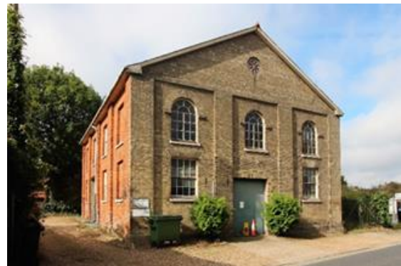
The Old Chapel (Former Bethesda Chapel)

otherwise red brick structure; Welsh slate roof. Bay window to left hand house now removed and original front door opening blocked. Present front door formed from a former window. Otherwise late nineteenth century joinery largely intact. An important part of the setting and history of the GII listed No.24 Earsham Street. Reeve C, Bungay Through Time (Stroud, 2009) p53. Honeywood F, Morrow P & Reeve C, The Town Recorder, A History of Bungay in Photographs (Bungay, 1994) p149.