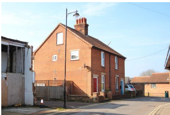
Nos.5-7 (odd) Priory Lane

Nos.24-28 (even) Priory Lane (grade II). A large, early-nineteenth century, detached house, which has been converted into three dwellings. In a sensitive location close to a scheduled ancient monument. Of three storeys, with a symmetrical Suffolk white brick façade of three bays. Return elevations red brick, black pan tiled roof. Sash windows with narrow margin lights and flush frames to first floor. Flat-arched lintels. Twentieth century casements to second floor. Two storey one bay wing with side entrances with twentieth century gabled porch to left. Six-panelled door with arched radial-bar fanlight within a wooden doorcase with pilasters and an open pediment. Subsidiary structures Late twentieth century red brick boundary wall and gate piers to Priory Lane not included.