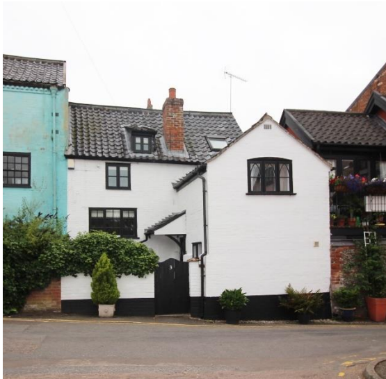
No.3 Nethergate Street