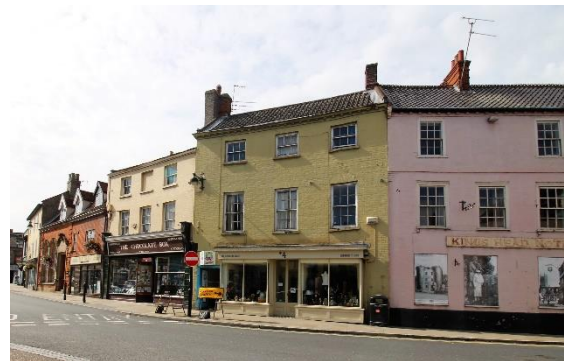
No.4 Market Place

No.4 Market Place (grade II). Early nineteenth century, with a Market Place façade of three storeys and three bays. Hornless sash windows to first and second floors with flat arched lintels. Slightly projecting wooden shop fascia with a central entrance Glazing bars to shop fascia shown on early twentieth century photos now removed. Brick, limewashed. Wide passage under, left, with a four-panelled door. Pan tiled roof, brick toothed eaves band. Nos, 2 to 16 (even) form a group. The rear section of the plot is within the scheduled area of the Castle complex. Reeve C, Bungay Through Time (Stroud, 2009) p14.