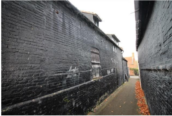
Brandy Lane elevation of No.18 Broad Street

building which has been a wine merchants for a long period are extensive barrel-vaulted cellars of considerable age. Subsidiary Structures Good red brick serpentine wall to the rear, probably of early nineteenth century date with later buttresses.