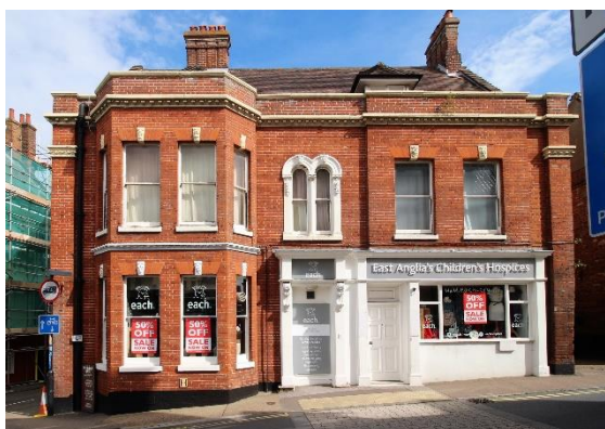
No.3 Market Place

No.3 Market Place (grade II). Former Queen's Head Inn, altered to form bank and manager's house in the late nineteenth century, now shops. Late seventeenth or early eighteenth century with a later nineteenth century red brick façade. The Buildings of England suggests an original building date of 1698. Of two storeys and attics. Market Place façade of three bays with corner pilasters and a parapet. Left hand bay with a two-storey canted bay window. Plate-glass sashes with gauged flat arches and ornamental keystones. Hipped machine tile roof, with two hipped dormer casements. Former bank entrance to ground floor right (records from 1871) Central entrance to former residence, six-panelled door with stucco case with consoles. Foliate cornice below parapet with stone cope. Western return elevation to Bridge Street, is of eighteenth century date, stuccoed and painted. Two flush framed sash windows at ground and first floors with glazing bars. Casement window in gable. Nos. 1 to 11 (odd), Nos. 11A, 13 and 17 to 21 (odd) form a group together with the butter cross. Bettley, J, and Pevsner, N, The Buildings of