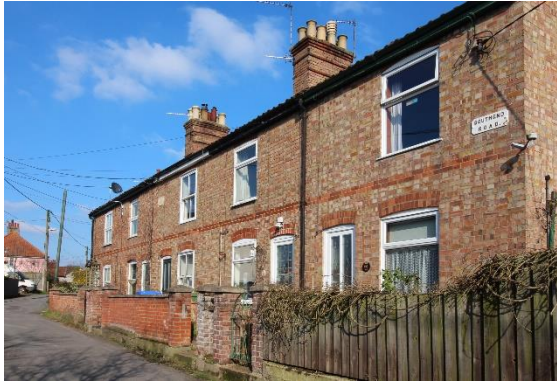
Sunnyside Cottages, Nos.55-63 (odd) Southend Road

with centrally placed doors flanked by casement windows. Doors set back beneath flat arched lintels. Nos. 51 & 53 appear to retain their original casement windows. Shown on the 1885 1:2,500 Ordnance Survey map. No.47 has a later twentieth century flat roofed garage addition.