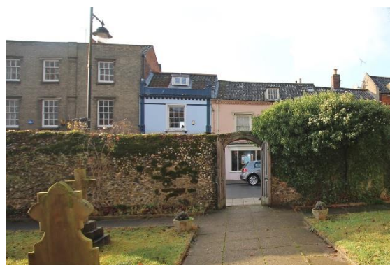
St Edmund's Churchyard Wall, St Mary's Street

mullioned surrounds. Two and three-light mullioned and transom windows to ground floor with leaded lights. Entrance under stone arch to right side of projecting gable. Side has similar paired and triple sashes and a projecting gable. Interior contains a corridor leading directly across the whole ground floor from entrance to sacristy of church (qv), to which the presbytery is linked. Together with the church, the Church of St Mary (including the remains of the Benedictine Convent) (qv), and walls in both churchyards (qv) the presbytery forms a very significant group in the centre of Bungay.