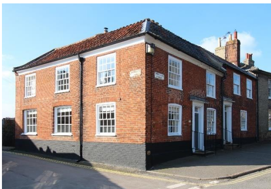
Nos.48 & 50 Upper Olland Street

The Old Maltings, No.46 Upper Olland Street (grade II). An eighteenth century house with a symmetrical early nineteenth century Suffolk white brick façade. Two storeys and three bays with a hipped Welsh slate roof and projecting eaves. White brick chimney stacks. Twelve-light hornless sashes with flat arched lintels. Six-panelled front door with Greek fluted Doric one quarter radius columns to the reveals, below an arched radial-bar fanlight. Return elevation of painted red brick with a single flush framed sash window to the first floor. Pan tiled portion at rear. Nos.30 to 34 (even), Emmanuel church and Nos.38 to 52 (even) form a group.