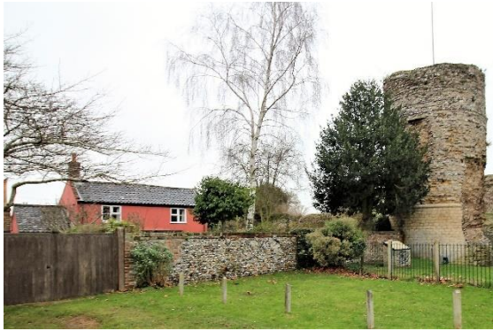
Keeper's Cottage, Castle Orchard

Keeper's Cottage and boundary wall, Castle Orchard (standing on scheduled land). A nineteenth century cottage with extensive later twentieth century alterations and additions, built within the remains of the Castle complex and within the scheduled ancient monument. Its rear retaining wall is part of the Castle wall. Original cottage has rendered walls and a black pan tiled roof. Red brick ridge stack. Two storeys with a single storey wing. Twentieth century flat roofed porch. Return gable with twentieth century timber oriel window to first floor. Lower red pan tile roofed range to rear. Twentieth century casement windows. Subsidiary features. Good nineteenth century flint wall.