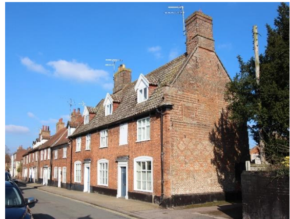
No.31-35 (Odd) Upper Olland Street

Nos.27 & 29 Upper Olland Street (grade II) Eighteenth century pair of cottages of two storeys and an attic. Red brick with a red pan tiled roof. Three-bay façade, with paired front doors to the centre under one enriched cornice. Late twentieth century panelled front doors. Nineteenth century casements to No.27, late twentieth century ones to No.29. Nos.21 to 37 (odd) form a group