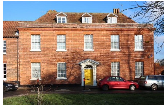
No.19 Trinity Street

hornless sashes to the outer bays. Six-panelled door in wooden case with panelled reveals, eared architrave, frieze, and cornice. Lozenged fanlight. Slightly recessed two storey wing to the right, including painted dummy window at ground floor and brickwork with dark headers. Nos.1 to 19 (odd) form a group.