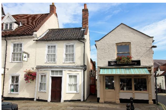
No.13 Market Place

No.13 Market Place. A mid-nineteenth century painted red brick structure with a parapeted gable to the Market Place. Four bay return elevation to Cross Street. Single horned plate-glass sash to first floor and shop fascia with pilasters below. Cross Street elevation of four narrow bays with a dentilled brick eaves cornice and a single central casement window with a shallow arched brick lintel to the first floor. Blocked doorway and window to ground floor left, and two twentieth century casement windows. All with shallow arched brick lintels. Single storey rear outshot containing a door and a casement window. Red pan tile roof. Forms an important part of the setting of neighbouring listed structures.