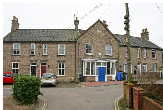
Nos.33-41 (Odd) Southend Road

Nos.9 & 11 Southend Road. A semi-detached pair of mid-nineteenth century houses. Principal façade of red and blue brick with painted stone dressings and quoins. Shallow pitched Welsh slate roof with deep overhang to eaves. Neo-Norman arched doorcases with quarter pilasters and dog tooth frieze. Original arched six-paneled doors. No.11 retains its four-pane horned sashes. No.9 with casement windows and shutters. Substantial twentieth century additions to the rear.