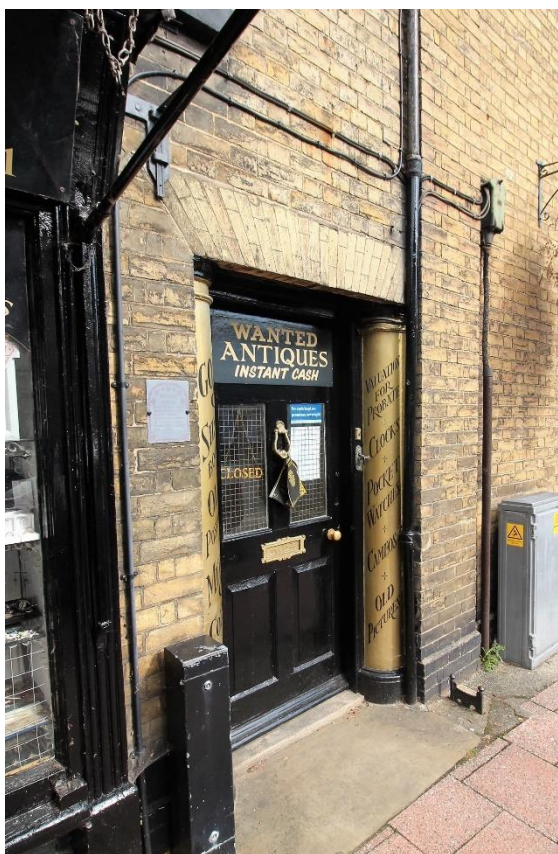
Doorcase No.28 Earsham Street

Nos.28-30 (even) Earsham Street (grade II). Mainly of seventeenth century date but with an early to mid-nineteenth century façade. Of two storeys and an attic. Two dormers with original leaded casements. Suffolk yellow brick front. Pan tiles. Two windows and blank centre panel, sash, with glazing bars and flat arches. Partially glazed six-panelled door flanked by one quarter radius Doric columns in reveals, beneath a flat arch. Wooden shop fascia, the left-hand section only being evident on early twentieth century photographs. Nos.2 to 40 (even) form a group.