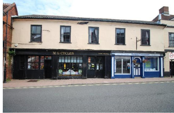
Nos.2a & 2b Earsham Street

Nineteenth and early twentieth century photographs show this flanked by three twelve pane sashes to each side, similar to those surviving above. Mid twentieth century pub facias now partially occupy the ground floor. Three bay Market Place façade with remodelled ground floor. This formerly had a central entrance door in a surround with fluted ionic columns flanked by windows with carved surrounds with pilasters. Interior: barrel vaulted ceiling with original plaster enrichments and cornice, well with date 1540 and old cellars dating from the earlier building which was destroyed in the 1688 fire. Nos.2 to 40 (even) form a group. Bettley, J, and Pevsner, N, The Buildings of England, Suffolk: East (London, 2015) p.154. Honeywood F, Morrow P & Reeve C, The Town Recorder, A History of Bungay in Photographs (Bungay, 1994) p62& 201. Reeve C, Bungay Through Time (Stroud, 2009) p18.