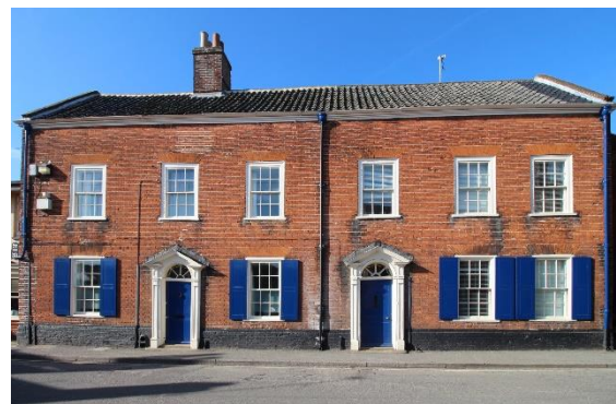
Nos.8-10 (even) Upper Olland Street

No.6 Upper Olland Street (grade II). Early eighteenth century, two storey, red brick. Black pan tiled roof, tumbled gables, and a coved cornice. Full height corner pilasters with moulded caps. Two bay street façade with hornless twelve-light sash windows to the first floor within flush frames. Late twentieth century shop front. Nos.2 to 10 (even) Nos.14, 16 and Nos.20 to 24 (even) form a group