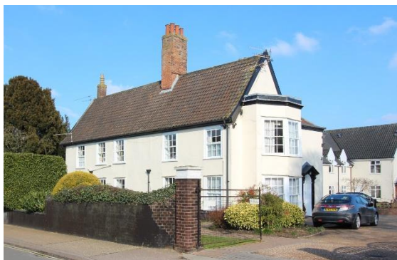
The Old Vicarage, No.37 Upper Olland Street

Brick pilasters with moulded caps and bases. Brick lozenge pattern on end wall, and two earlier window openings filled in. Letters RR in wrought iron ties on gable. Eight bay façade with two blank panels, and six casements in flush frames, ground floor windows with segmental arches. No.31, four-panelled door. Nos.33 and 35, 6-panel doors in wood cases. Nos.21 to 37 (odd) form a group.