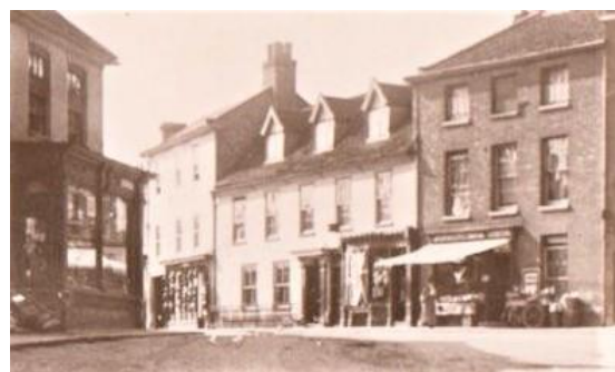
No.8 Market Place before re-fronting, a view of c1900

No.8 Market Place. Former bank and shop. c1900 red brick classical façade with stone dressings to an earlier structure. 1880s photos show a stuccoed early to mid-eighteenth century building of similar proportions on this site. Red plain tile roof with a row of three gabled dormers with bargeboards and casement windows. Rusticated red brick pilasters. Full height arched windows to left-hand section with heavy moulded surrounds and pronounced keystones. Doorcase with similar surround with robustly carved scrolled keystone. Right-hand section with small pane metal casement windows to first floor and late twentieth century shop fascia. The rear section of the plot on which this building stands is within the scheduled area of the Castle complex. Honeywood F, Morrow P, & Reeve C, The Town Recorder, A History of Bungay in Photographs (Bungay, 1994) p135.