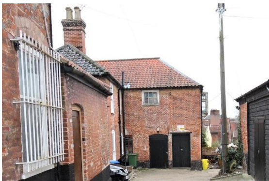
Rear range of No.4 Bridge Street from Trinity Street

Nos. 4, No. 6a & 6b Bridge Street and garden walls to rear. (grade II). Standing on the corner of Borough Well Lane and probably of early eighteenth century date. Of two storeys and an attic, with a low two storey rear range facing Borough Well Lane. Rendered and painted with a platt band below the first-floor windows. Four-light plate glass sashes with horns to the first floor. One gabled dormer to No.4 within a replaced red pan tiled roof. No.4 is shown with a shop fascia to the ground floor right on c1920 photographs, but this has been replaced by a tripartite sash. To the left of the four-panelled front door is a relatively recent four-light horned sash, in a segmental arched opening. A small central window at first floor level is also shown on early photographs. To the rear of No.4 is a red brick range with an elevation facing a yard off Trinity Street. This has a black pan tiled roof to Borough Well Lane and a red pan tiled roof to its other faces. A late nineteenth century wooden oriel window is set within the end wall at first floor level. Below this window there was evidently a further recently demolished single storey projection