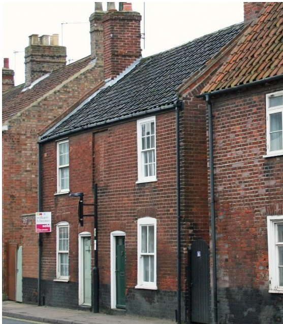
Nos.18 &20 (even) Lower Olland Street

eighteenth-century range at the southern corner of Turnstile Lane. Red brick, now partially rendered, with a red pan tiled roof. Dentilled brick eaves cornice. Turnstile Lane elevation gabled and rendered with largely late twentieth century casement windows. Four-panelled door. Blocked door opening in northern end of Lower Olland Street elevation. Poor quality late twentieth century windows in original openings. No.12 with twelve-light hornless sashes beneath flat arched lintels. Four-panelled door with a single, nineteenth century casement window above. No.14 has a nineteenth century wooden casement at first floor level and one sixteen-light sash. Four-panelled door. Cambered brick lintels. No.16 now entered from southern return elevation but with blocked opening on Lower Olland Street façade. Cambered brick lintel to ground floor window. Late twentieth century casement to ground floor and possibly nineteenth century casement above.