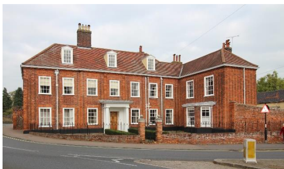
Trinity Hall, No.1 Staithe Road

Trinity Hall, No.1 Staithe Road (grade II*). An early eighteenth century house with later additions and alterations. Of two storeys with attics lit by three pedimented dormers. Brown brick with red dressings including a toothed cornice (wood ogee-moulded lead-lined gutter) and a plinth. Plain tiled roof. Later projecting range to right with shallow bay window to ground floor and twelve-light sashes above. The principal range has a seven-bay entrance façade with a three-bay breakfront. The central first floor window is flanked by brick pilasters. Twelve-light hornless sash windows, with flush frames and flat arched lintels. Brick aprons under ground floor windows. Six-panelled door in a wooden case with panelled reveals and a mutular Greek Doric porch of c1830. Trinity Hall with its ancillary building, entrance piers and walls form a group. Bettley, J, and Pevsner, N, The Buildings of England, Suffolk: East (London, 2015) p.157.