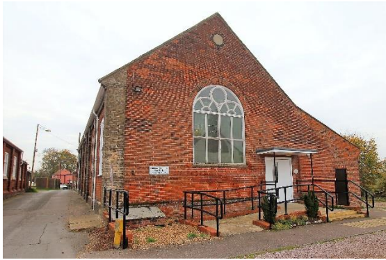
Former Sunday School, Rose Lane

Former Sunday School and lecture Hall, Rose Lane . Sunday School associated with Upper Olland Street Congregational Church built. 1867-69 to the designs of R.M. Marsden for Charles Stokes Carey. Red brick with gault brick dressings and pilasters. Traceried window in north gable and Twentieth century doorway. Return elevations with twelve-light hornless sashes and gault brick pilasters. Black pan tiled roof. Rear addition with wooden glazed roof and leaded coloured lights. Lecture rooms to rear of c1898 designed by JO Rees. Red brick with stone dressings. A prominently located structure at the junction with Rose Lane. Bettley, J, and Pevsner, N, The Buildings of England, Suffolk: East (London, 2015) p.151. Honeywood F, Morrow P, & Reeve C, The Town Recorder, A History of Bungay in Photographs (Bungay, 1994) p15 & p23.