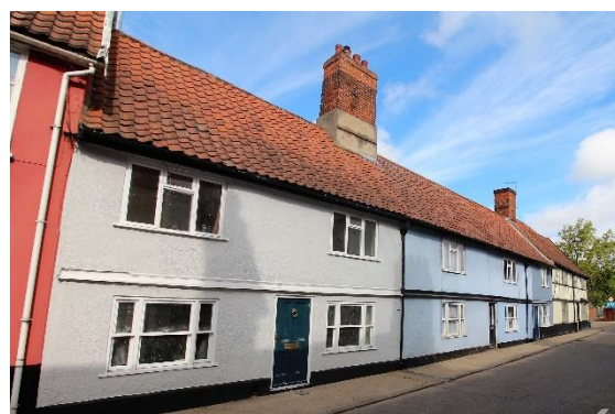
Nos. 39-43 (odd) Bridge Street