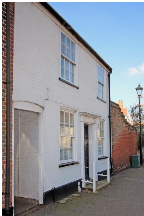
No.38 Upper Olland Street

No.34 Upper Olland Street (grade II). An early nineteenth century detached villa with a symmetrical classical entrance façade of three bays. Of two storeys with attics lit from within the gabled return elevations. Suffolk white brick façade with a mutular cornice, and a black pan tiled roof. Rear elevation red brick, side elevations rendered. Three twelve-light hornless sashes within flush frames at first floor level. Two further twelve-light sashes with flat arched lintels flanking the doorcase. Six-panelled entrance door with arched patterned fanlight in an enriched wooden case. Northern return elevation highly visible from chapel graveyard. Rear elevation with nineteenth century casements beneath cambered lintels. Subsidiary Structures Screen walls to the left and right at a right-angle, each seven feet high with a stone cope, with a side door and blank panel respectively, square section piers. Low brick wall to front. Nos.30 to 34 (even), Emmanuel church and Nos.38 to 52 (even) form a group.