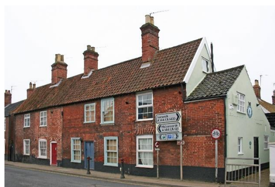
Nos.10-16 (even) Lower Olland Street

Nos.6&8 Lower Olland Street. A semi-detached early to mid-nineteenth century pair of houses with a gault brick façade and rendered red brick return elevations. Black pan tiled roof. Red brick chimney stacks. Three bay façade, with central blind panel flanked by twelve-light hornless sashes at first floor level. Paired four panelled front doors beneath a continuous flat-arched lintel. Wide tripartite hornless sashes to outer bays.