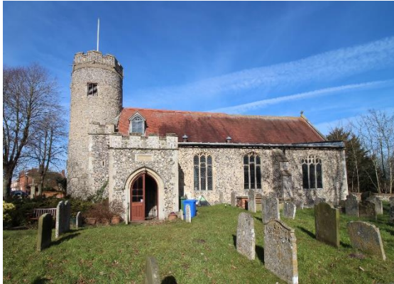
Holy Trinity Church, Trinity Street

Outbuildings to rear of No.19 Trinity Street (grade II) Eighteenth century, including former stables, red brick, pan tiles, wind vane, L-shaped on plan, of a single storey, part with loft. Nos.1 to 19 (odd) form a group.