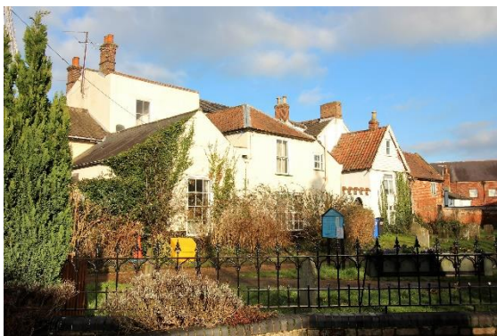
Saint Mary's Churchyard elevation of Nos.15-21(odd) Market Place including entrance to No.19a

Wall to rear of No.23 Market Place -see Saint Mary's Street