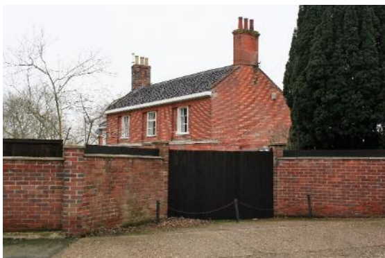
No.14 Flixton Road

Nos.10 & 12 Flixton Road and boundary walls. A semi-detached pair of late nineteenth century gault brick villas. Map evidence suggests that they were constructed between 1885 and 1905. Black pan tiled roof with decorative ridge pieces. Single storey canted bay windows to ground floor. Doors within arched recessed porches. No.12 has its original plate glass horned sashes. The windows to No.10 have been replaced with casements. Subsidiary Structures Notable stepped gault brick wall of c1890 to south side of No.12. Similar though less decorative wall to north of No.10. red brick wall with gault brick piers to Flixton Road. Gault brick gateway with arched door opening to north side of No.10. red brick garden walls to rear.