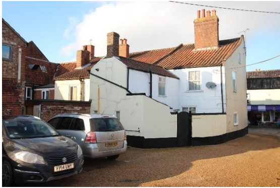
Rear elevation of No.37 Earsham Street