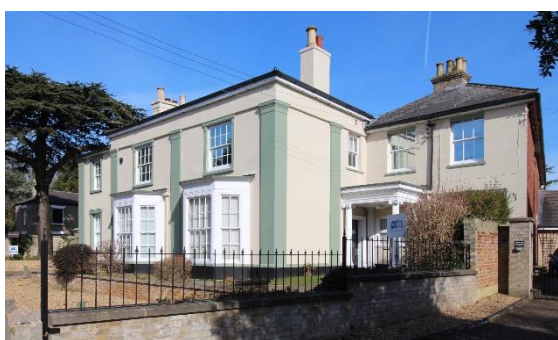
Dunelm House, No.65 Lower Olland Street

Nos.61 & 63 Lower Olland Street. A semi-detached pair of houses of mid nineteenth century date. Possibly originally one villa but map evidence suggests it has been divided since at least 1905. Two storeys. L-shaped, No.61 within projecting range at northern end with a hipped Welsh slate roof. Good Doric doorcase. Twelve-light hornless sashes beneath painted stone flat-arched lintels with rusticated panels. No.63 has parapet hiding roof and gable to southern bays. Twelve-light hornless sashes. Subsidiary Structures. Tall mid nineteenth century gault brick wall springing from entrance façade of No.63.