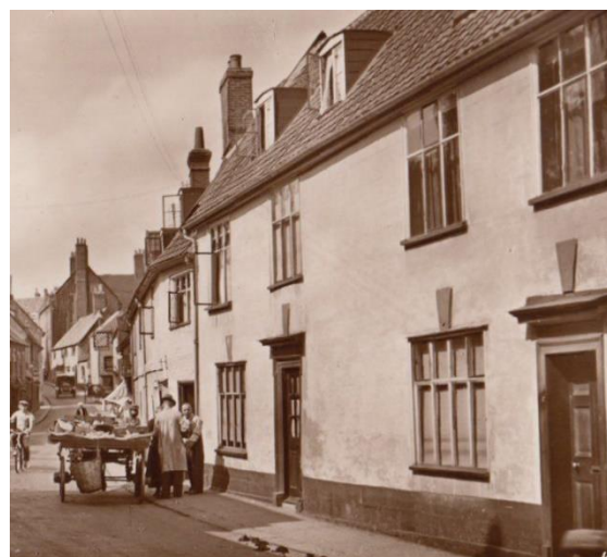
Nos. 35-37 (odd) Bridge Street c1925

Nos.35-37 (odd) Bridge Street (grade II) Early eighteenth century, of two storeys with an attic lit by four flat roofed dormers. Red pan tiled roof and substantial central red brick ridge stack rising from party wall. Stucco on brick, lined as ashlar. The first floor has early nineteenth century casements, of six lights, in flush frames. Flat heads formerly with keys to two eight-light ground floor windows. Inserted four-light casement to right of doorway within No.35. Part glazed door to No.35 eared architrave, pulvinate frieze and dentil cornice. Modern door to No.37 in wooden case with architrave frieze and cornice. Nos.29 to 45 (odd) form a group.