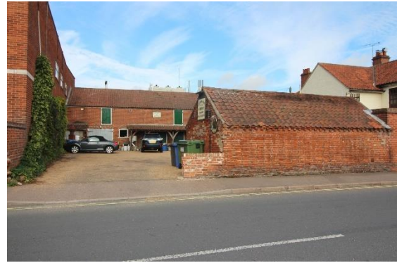
Outbuildings at The Green Dragon Public House

The Green Dragon Public House and outbuildings to rear, No.29 Broad Street and Popson Street. A purpose-built public house of c1926, replacing an earlier inn. Formerly known as the Horse and Groom. Restrained 'arts and crafts' vernacular style. Much of the building's original external detailing has survived including its external joinery and leaded windows. The pub is faced in red brick with pebble dashed first floor, and a hipped red pan tile roof. Wooden casement windows divided by mullions and a transom and with small leaded panes to the ground floor. The first-floor windows are similar but do not have a transom. Fine decorative rainwater heads. Subsidiary Structures To the rear are two much earlier outbuildings. Fronting Popson Street is a single storey red brick outbuilding of c1800 with a red pan tile roof and a dentilled brick eaves cornice. This is a survival from a range of out buildings shown on late nineteenth century Ordnance Survey maps. To the rear of the yard a two-storey red brick stable range with boarded doors and a red pan tile roof. Probably of early nineteenth century date, its ground floor openings show signs of alteration and a number of the original brick lintels have been replaced.