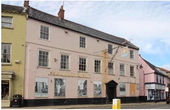
No.2 Market Place

No.2 Market Place and former Odd Fellows Hall to rear (grade II). An early eighteenth century former coaching inn which was until 2015 known as the Kings Head Hotel. It consists of two parallel ranges with a long rear wing facing a courtyard. The Market Place façade is of early eighteenth century date, and of three storeys and seven bays. Of red brick, with a plinth and a dentilled brick eaves cornice. Black pan tiles to roof and a single red brick ridge stack. Seven hornless twelve-light sash windows at first floor level with flush frames and flat arched lintels. Four similar windows to the second floor and six to the ground floor. Off-centre Six-panelled door in wooden Doric case with pilasters, a keyed architrave and a pediment. Return elevation with twin gables. Rear elevation with twelve-light hornless sashes to first and second floors.