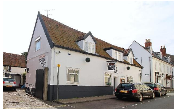
No.6 Cross Street

No.6 Cross Street and outbuilding (grade II). Former Jolly Butchers Public House; closed early twentieth century. Of early seventeenth century date, and of a single storey with attics. Timber framed and plastered. Replaced red pan tile roof covering with two gabled, and one flat roofed dormer; the latter of later twentieth century date. Later twentieth century door and casement windows. To the rear a detached former stable and cart shed probably of early nineteenth century date. Painted brick with a red pan tile roof. The building reputedly suffered bomb damage in World War Two. Honeywood F, Morrow P & Reeve C, The Town Recorder, A History of Bungay in Photographs (Bungay, 1994) p158. Honeywood F, Reeve C, & Reeve T, The Town Recorder, Five Centuries of Bungay at Play (Bungay, 2008) p140. Honeywood F, Reeve C, & Reeve T, The Town Recorder, Five Centuries of Bungay at Play (Bungay, 2008) p91-92 & 139.