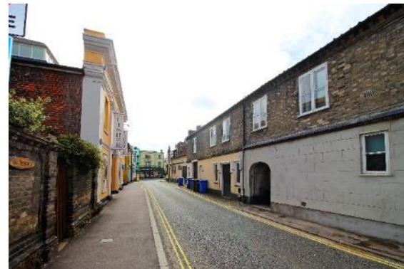
Nos. 1 & 2 Bigod Flats, Broad Street

For the Three Tuns Inn see Earsham Street. For the Council Offices see Earsham House, No.12 Earsham Street, See also Nos.8-12 Earsham Street.