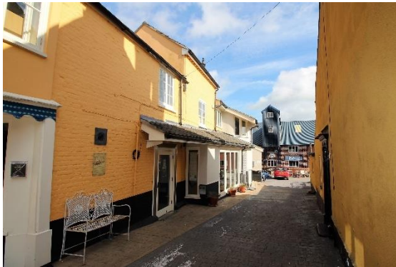
Fisher Theatre, return elevation

The Buildings of England, Suffolk: East (London, 2015) p.153-154.