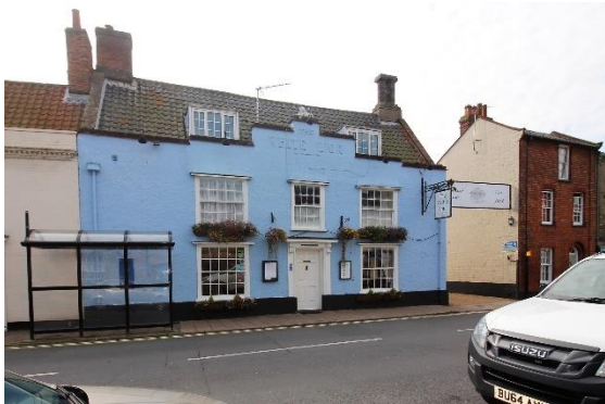
The Castle Inn, No.35 Earsham Street

beneath cambered arches. Possibly the public house known as the Butchers Arms listed in the 1909 town rates book. The rear section of the plot on which this building stands is within the scheduled area of the Castle complex.