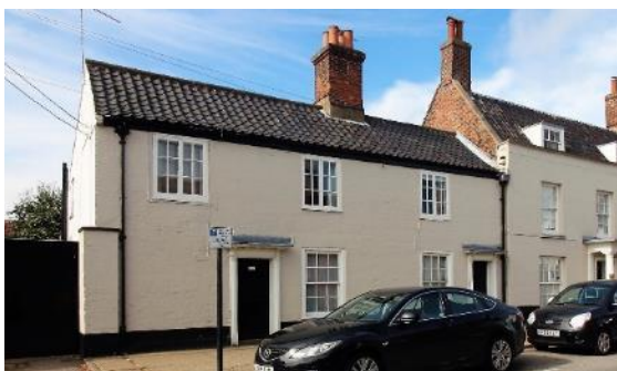
Nos.15-17 (odd) Broad Street

Nos.11-13 (odd) Broad Street Semi-detached pair of two storey cottages of c1800 date. Black pan-tiled roof covering, patched with red pan tiles. Large central red brick chimneystack rising from spine wall between the cottages. Dentilled brick eaves cornice. Late twentieth century casements to first floor and sashes below. Front doors both late twentieth century. Attached to the rear of No.13 is a substantial two storey red brick outbuilding of probably early nineteenth century date. This pair of cottages make a strong positive contribution to the setting of the grade II listed Nos.17-19 (Odd).