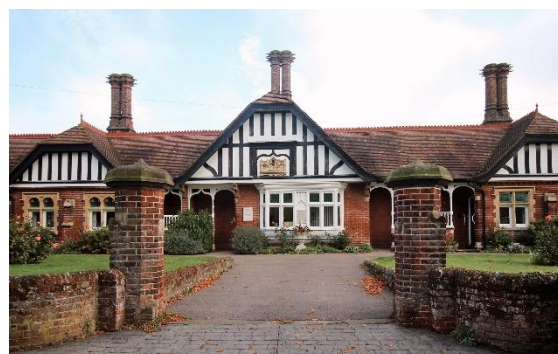
Gate piers and central block of St Edmund's Homes, Outney Road

St Edmund's Homes, gate piers and boundary walls, Nos.8-22 (even) Outney Road. Alms houses of 1895 designed by F.E. Banham and donated by Frederic Smith. Set back from the road within mature landscaped grounds. Symmetrical, vernacular revival style with applied timber framing to the otherwise red brick shell. Of a single story with a plain tile roof and tall paired octagonal shafts to the red brick chimney stacks. Five barge-boarded gables the middle three half-hipped. Windows either two-light stone hood moulded mullions, with casements within, or mullioned and transomed wooden frames. Individual front doors set back within decorative painted wooden verandas with balustrades. Stone quoins to corners. Gabled return elevation of a single bay to Webster Street. Rear elevations significantly altered c1960 possibly by Raymond Erith. Low red brick wall to Outney Road and Webster Street with octagonal gate piers and semi-circular cap. Tall red brick wall to the rear. Bettley, J, and Pevsner, N, The Buildings of England, Suffolk: East (London, 2015) p.155. Archer L, Raymond Erith Architect (Burford, 1985) p151.