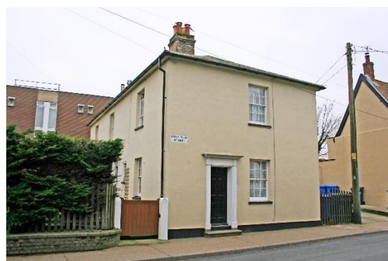
Nos.58 & 60 Lower Olland Street

Nos.52 & 54 Lower Olland Street (grade II). An early seventeenth century dwelling now altered and subdivided. Of two storeys and an attic, timber-framed and plastered with a plinth. Steeply pitched red pan tiled roof. Later twentieth century casement windows and doors. Old photographs show that it was thatched until c1920. Return elevations blind. Nos.46, 48, 52, 58 and No.60 form a group