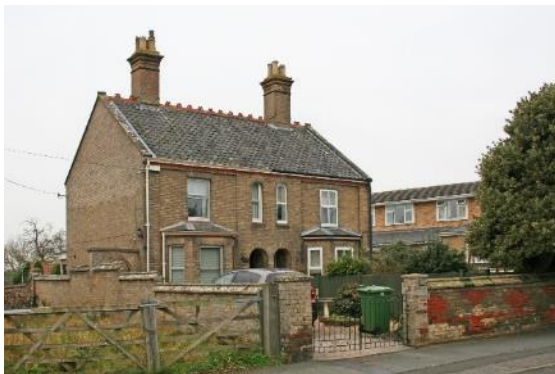
Nos.10 & 12 Flixton Road

Nos.10 & 12 Flixton Road and boundary walls. A semi-detached pair of late nineteenth century gault brick villas. Map evidence suggests that they were constructed between 1885 and 1905. Black pan tiled roof with decorative ridge pieces. Single storey canted bay windows to ground floor. Doors within arched recessed porches. No.12 has its original plate glass horned sashes. The windows to No.10 have been replaced with casements. Subsidiary Structures Notable stepped gault brick wall of c1890 to south side of No.12. Similar though less decorative wall to north of No.10. red brick wall with gault brick piers to Flixton Road. Gault brick gateway with arched door opening to north side of No.10. red brick garden walls to rear.