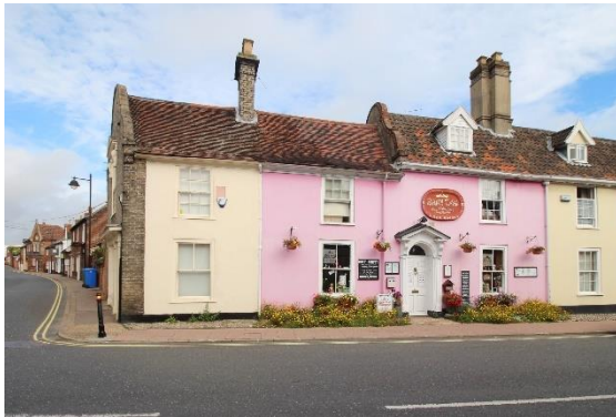
Nos.20-22 (even) Earsham Street

No.18 Earsham Street (grade II). Part of the same structure as Nos.20 & 22 (even). Of mid to late Seventeenth century date, and of two storeys with an attic. Red pan tile roof covering with two gabled dormers. Gault brick chimneystacks, that shared with No.20 partially rendered. Painted stucco, façade to Earsham Street. Twelve light hornless sashes within flush frames. Two Dutch gables. Six-panelled door with semi-circular radial fanlight, set within a doorcase with panelled reveals, pilasters, and an open pediment. Nos. 2 to 40 (even) form a group.