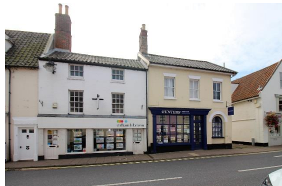
No.21 Earsham Street

No.19 Earsham Street (grade II). Probably of later eighteenth or early nineteenth century date. Painted brick façade of three storeys and two bays. Twelve-light sash windows with glazing bars and gauged flat arches, at first floor level. Six-light sashes above. Shallow pitched pan tile roof, tall red brick ridge stack. Late twentieth century shop front. Nos.1 to 19 (odd) form a group. The rear section of the plot on which this building stands is within the scheduled area of the Castle complex.