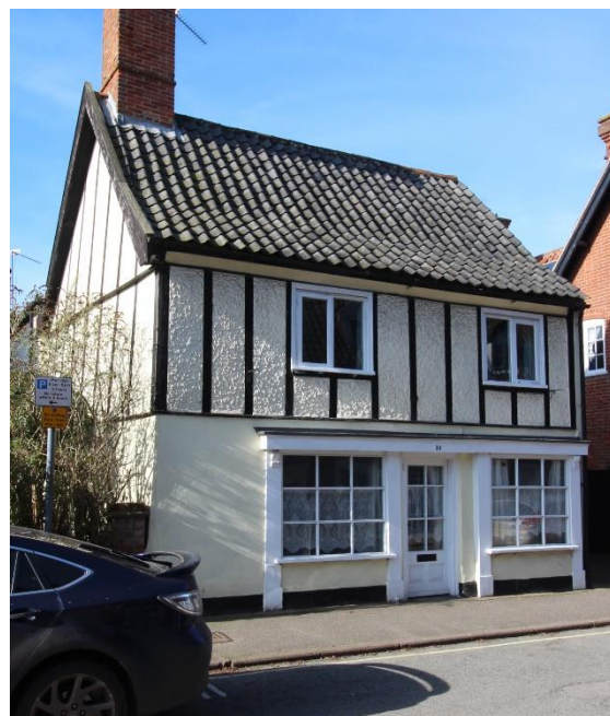
No.30 Upper Olland Street

No.28 Upper Olland Street . A purpose- built public house of c1913 on the site of an earlier inn. Formerly the Rose and Crown, it closed c1970 and is now a dwelling. Vernacular revival style, with unaltered façade. Red brick with a roughcast rendered first floor and applied decorative half-timbering. Plain tile roof with decorative pierced ridge pieces. Overhanging eaves and simple wooden bargeboards. Three substantial mullioned and transomed windows to ground floor in painted stone surrounds. Painted stone doorcase. Oriel window within gable at first floor level and two wooden casements with mullions. Plaster inn sign with a rose and a crown set within name panel. Honeywood F, Reeve C, & Reeve T, The Town Recorder, Five Centuries of Bungay at Play (Bungay, 2008) p100-101 & 156-7.