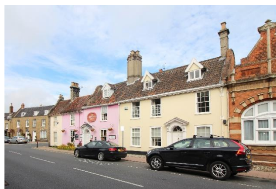
No.18 Earsham Street

No.18a Earsham Street. Former bank c1890, now a dwelling. Built for the London and Provincial Bank Limited. Faced in red brick with elaborate stone dressings and decorative terracotta panels, much original joinery. Of a single storey and two bays, doorway to right in arched opening with fine radial fanlight and panelled door. Large casement window in arched opening to left hand bay. Parapet and Dutch gable. Welsh slate roof. Many late nineteenth century features preserved within. Bettley, J, and Pevsner, N, The Buildings of England, Suffolk: East (London, 2015) p.154.