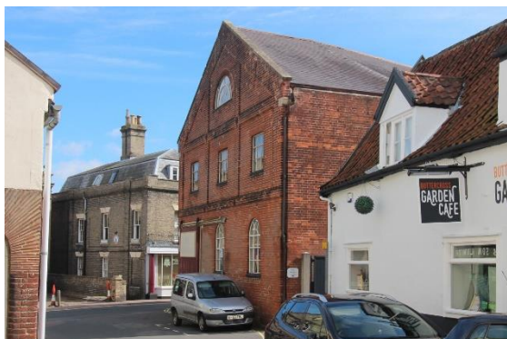
Owles Warehouse, Cross Street elevation.

to first floor. Linked to No.2 Trinity Street by a single storey flat-roofed range which based on photographic evidence probably pre-dates the two-storey section. Mid-twentieth century shop fascia with pilasters and projecting boxed cornice. Bombed c1940 and partially rebuilt late 1940s. A comparatively rare and unaltered example of its kind for Suffolk. (See also No.2 Trinity Street and 5 Market Place). Reeve C, Bungay Through Time (Stroud, 2009) p9.