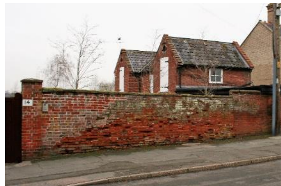
Stable at No.14 Flixton Road

The Red House, No.14 Flixton Road, stable and boundary walls. (grade II). Late-eighteenth century villa, facing south with return elevation to Flixton Road. Two storeys, red brick with an enriched wood cornice. First floor band, plinth, black pan tiles. Symmetrical three bay façade with sash windows beneath cambered flat arches. Louvred and panelled shutters. Sash windows, with glazing bars, set back in recesses to take shutters at first floor level with arches over the recesses. Three-light windows with glazing bars at ground floor level of the same width as the recesses over. Four-panelled door in wood case with panelled reveals. Formerly with porch. Subsidiary structures. Good nineteenth century stable range to rear. Red brick with a black pan tiled roof. Two storeys, the outer bays breaking forward and with gables. Boarded doors to ground and first floors and an oculus within each gable. Good red brick boundary wall to Flixton Road frontage of rear yard. The southern part of the wall fronting the garden appears to have been rebuilt. Nineteenth century red brick wall to northern return boundary.