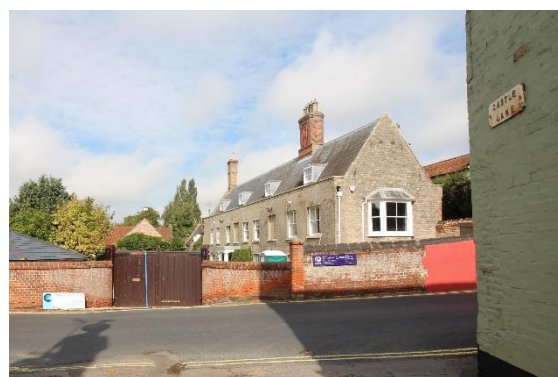
Waveney House, No.56 Earsham Street