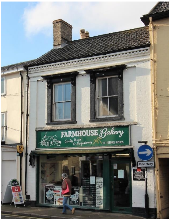
No.12 Market Place

limewashed, three twelve-light hornless sashes at second floor level with flush frames. The first floor windows have had their glazing bars removed. Stuccoed flat arched lintels with keys. Wide cart opening to left. Early nineteenth century wooden shop front, to right with slender reeded pilasters and entablature. Low pitched pan tiled roof. Long two storey rear range of c1800. Red brick with a red pan tiled roof, possibly originally a warehouse. Nos. 2 to 16 (even) form a group. The rear section of the plot on which this building stands is within the scheduled area of the Castle complex. Honeywood F, Reeve C, & Reeve T, The Town Recorder, Five Centuries of Bungay at Play (Bungay, 2008) p144.