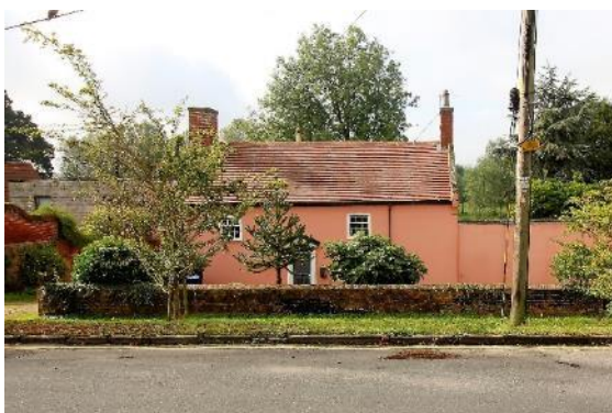
Waveney Cottage, Outney Road

Waveney Terrace, Nos.24-34 (even). Outney Road with boundary walls. A terrace of six substantial houses in three mirrored pairs of c1881. Shown on the 1885 1:2,500 Ordnance Survey map. Red brick with a gault brick façade and stone dressings. Welsh slate roof and corbelled eaves cornice. Each house is of two bays, one with a full height canted bay window. The other containing an arched porch with a pronounced key stone. Four-light plate glass sash above. Four panelled doors with glazed arched upper lights. Horned plate glass sashes. Late nineteenth century low gault brick boundary wall with square section gault brick gate piers. Decorative iron railings and gates now removed. Glazed tile paths to front doors of a geometric design. Red brick rear boundary walls and rear elevation. A good example of a speculatively built later nineteenth century terrace retaining the bulk of its original features and joinery. Honeywood F, Morrow P & Reeve C, The Town Recorder, A History of Bungay in Photographs (Bungay, 1994) p143.