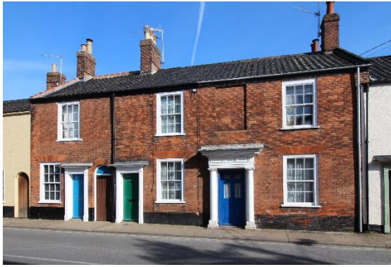
Nos.41-45 (Odd) Lower Olland Street

Nos.41-45 (Odd) Lower Olland Street (grade II). Later eighteenth or early nineteenth century, of two storeys, red brick, black pan tiled roof. Six bay façade with replaced sash windows within flush frames to each floor. Flat arched lintels to ground floor. Nos.41 and 43 have six-panelled doors in wooden cases with pilasters. No.45, a six-panelled door within an altered wooden doorcase with Doric pilasters. Blind recess above. Arched passage between Nos.41 and 43,