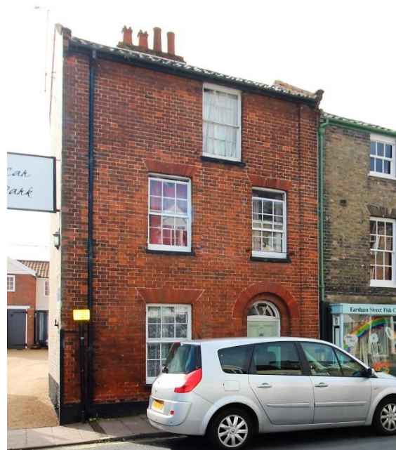
No.37 Earsham Street

The rear section of the plot on which this building stands is within the scheduled area of the Castle complex.