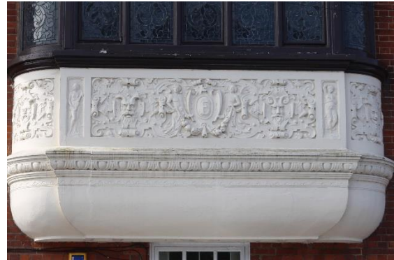
Pargetted decoration, Billiard Room wing, Earsham House, No.12, Earsham Street