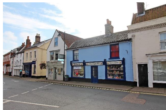
No.31 Earsham Street

No.31 Earsham Street. A mid nineteenth century symmetrical painted brick façade with two, horned, plate-glass sashes at first floor level. Black pan tile roof with gault brick ridge stack. Central partially glazed door flanked by shop facias. Historic photos show the building with small pane sashes to the first floor and ground floor left, the ground floor window having a wedge-shaped lintel. The rear section of the plot on which this building stands is within the scheduled area of the Castle complex.