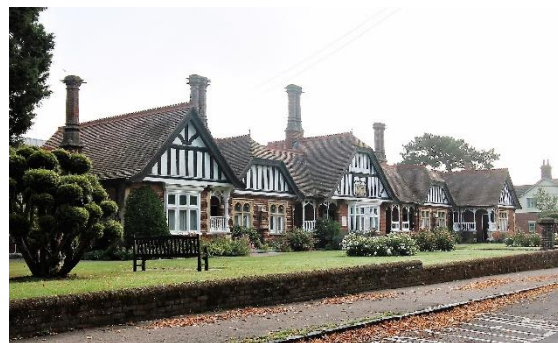
St Edmund's Homes, Outney Road

well-designed late twentieth century iron railings. Twentieth century flat roofed garage facing Webster Street not included.