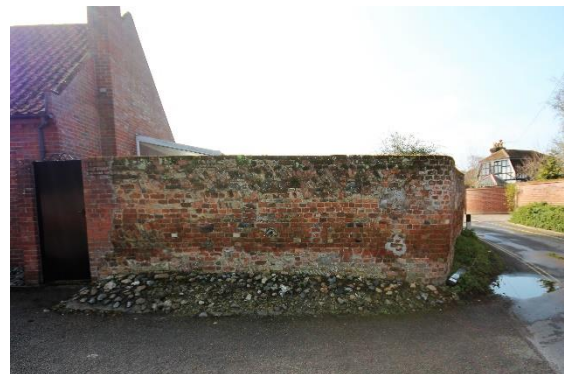
Boundary Wall, Clover Corner, Castle Orchard

The Fleece Hotel, Nos.8-10 (even) St Mary's Street and Inn yard walls (grade II). Early seventeenth century with a later eighteenth century red brick façade, which was rendered and had applied decorative timber-framing added c1920. Ground floor cement rendering in imitation of red brick. Main block has a three storey, three bay principal façade with hornless sixteen-light sashes within flush frames to the first and second floors. Tripartite sashes to ground floor. Painted wooden doorcase with Doric \frac{1}{2} columns and an unusual bed mould to the cornice. Six-panelled door. Black pan tiles to front face of roof, red to rear face. Left-hand wing formerly with shop front now tripartite sashes. At first floor level a long casement window with leaded lights. Small gable of c1920. Rear elevation also with applied timber-framing. Red brick rear range with red tile roof. Interior: evidence of timber-frame construction, oak corner cupboard and original doors. Nos.6 to 22 (even) form a group. Subsidiary structures. The inn yard at the rear (entered from Castle Orchard) is surrounded by red brick walls of primarily nineteenth century date. Some earlier sections which appear to have originally been part of structures. Twentieth century weatherboarded outbuilding. (See also Clover Corner, Castle Orchard) Honeywood F, Reeve C, & Reeve T, The Town Recorder, Five Centuries of Bungay at Play (Bungay, 2008) p148-149.