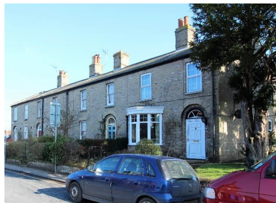
Nos.38-44 (even) Wingfield Street

Nos.16-20 (even) Wingfield Street. An early nineteenth century red brick terrace, which is now partially painted. Red pan tiled roof and dentilled brick eaves cornice. Casement windows, those to Nos.16 & 18 possibly original. Those to the ground floor beneath segmental arched lintels. Six-panelled doors to Nos.16 & 18. No.20 with a partially glazed door. A further house in the terrace No.22 has been heavily altered and is therefore not worthy of inclusion. Nos.16-20 contribute positively to the setting of the grade II No.14.