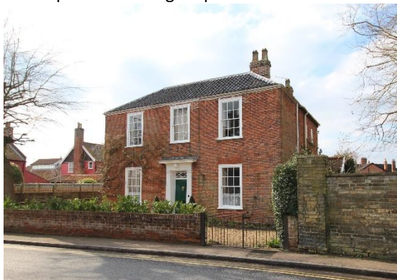
No.10 Trinity Street

Trinity House, No.8 Trinity Street and boundary wall to front. (grade II). An early to mid-nineteenth century villa of two storeys. Faced in Suffolk white brick. Hipped roof with a wide eave's soffit, now covered in late twentieth century machine tiles. Entrance façade of three bays with wide pilasters close to the outer corners. The central bay projects slightly and the windows of the outer bays set in shallow panels. Three hornless sash windows with narrow margin lights to first floor. Flat arched lintels and painted stone sills. Six-panelled door with arched radial-bar fanlight. Doric porch with exaggerated entasis to columns, and an enriched entablature. Porch enclosed at later date with glazed screen and doors. Subsidiary Structures include a nineteenth century Low white brick wall to Trinity Street with twentieth century railings. Four square- section gate piers.