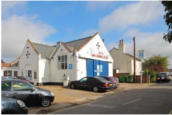
No.12 Scales Street

No.12 Scales Street. Former drill hall now car repair workshop. Probably designed and built by John Doe architect and builder of Bungay and dated 1906. Used primarily by the 2nd Volunteer Battalion Norfolk and 5 th Battalion Suffolk Regiments. Single storey red brick with Welsh slate roof formerly with tall leaded ventilator on ridge. Iron roof with tie rods. Gabled elevation to Scales Street with central circular former window with stone decoration in the form of four keystones. Mullioned and transomed wooden casement windows.