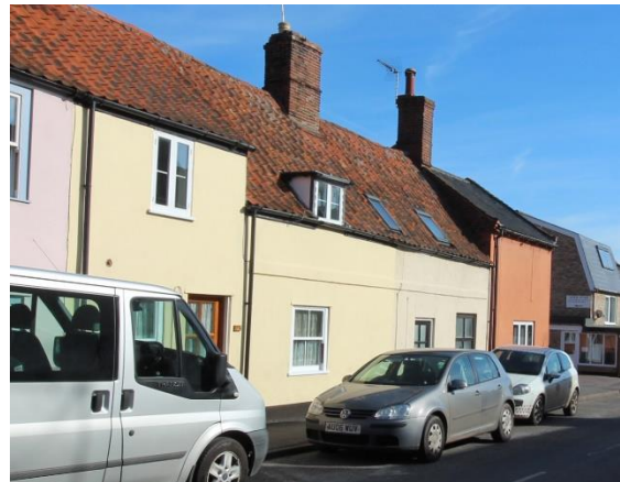
Nos.27 -29 (odd) Staithe Road

Nos.23-25 (odd) Staithe Road . Small rendered pair of cottages of c1800 forming an important part of the setting of the grade II listed. No.23 with central four-panelled door flanked by horned sashes. No.25. Horned sash to ground floor and twentieth century top-lit boarded front door. Twentieth century casement above in earlier opening. Red pan tiled roof. No.23 extended to rear.