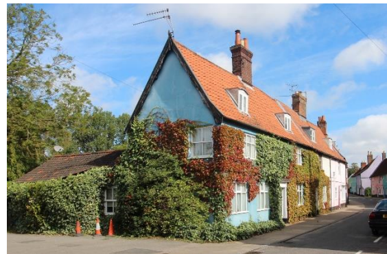
No. 29 Bridge Street

floor band, plinth. Three flush framed casement windows at first floor level. Segmental arched lintels to two casements flanking the front door. Six-panelled door with near-flush frame. The right-hand has later twentieth century door and window openings inserted following the demolition of the adjoining cottage in the mid twentieth century. Catslide roof to rear. Nos.17, 21, & 23 form a group. Honeywood F, Morrow P & Reeve C, The Town Recorder, A History of Bungay in Photographs (Bungay, 1994) p156. Reeve C, Bungay Through Time (Stroud, 2009) p58-59.