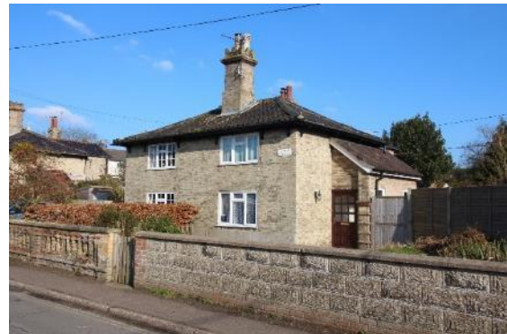
Nos.21 & 23 Flixton Road

Nos.21 & 23 Flixton Road. A semi-detached pair of cottages of probably mid-nineteenth century date. Faced in gault brick with a hipped black pan tiled roof and overhanging eaves. Central brick stack rising from former spine wall. Window openings remodelled to hold casements in late twentieth century. Included here primarily for its group value. Subsidiary Structures Low mid-nineteenth century white brick wall with red brick bands and brick balustrade. Wall to side of No.21 rebuilt in later twentieth century and not of interest. Single storey nineteenth century red brick outbuilding to rear.