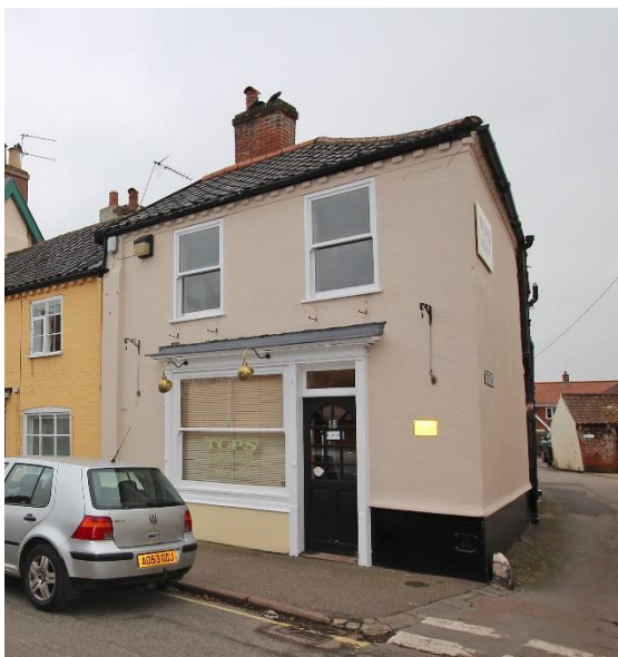
No.18 Upper Olland Street

Nos.14-16 (even) Upper Olland Street (grade II). An early eighteenth century block of two storeys and an attic. Five identical gabled dormers with bargeboards and casement windows. Six-bay façade of painted stucco over a plinth; red pan tiled roof. Twelve-light hornless sashes within flush frames at first floor level. No.14, six-panelled door in wooden case with pilasters, mid-twentieth century wooden shop front right. No.16, small early nineteenth century shop window with cornice. Nos.2 to 10 (even), 14, 16, and Nos.20 to 24 (even) form a group.