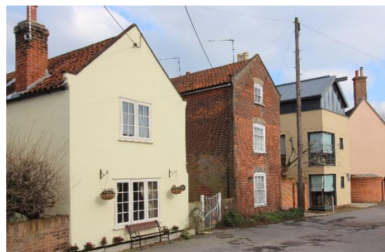
No.47 Staithe Road

workmanship, and in general the Inn is free from modernisation. Seventeenth century bolecion moulded mantel. Honeywood F, Reeve C, & Reeve T, The Town Recorder, Five Centuries of Bungay at Play (Bungay, 2008) p104-106 & 168-169.