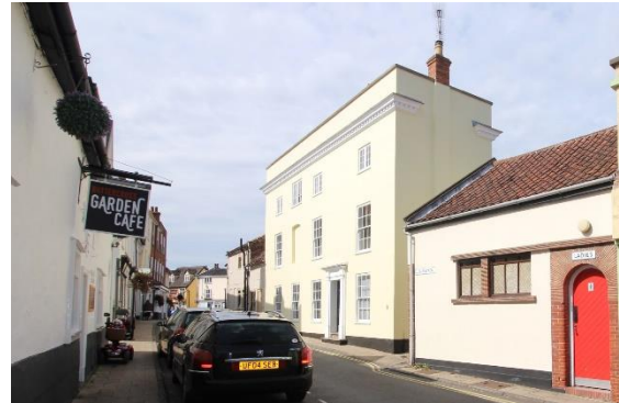
Nos.1-3 Cross Street

See also No.12 Market Place & 2a Trinity Street