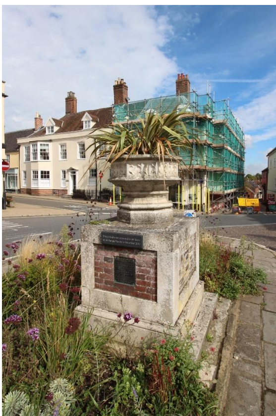
Memorial in Market Place

Wall to rear of No.23 Market Place -see Saint Mary's Street