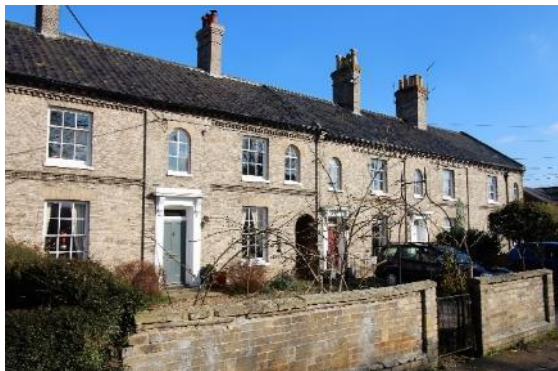
Nos.1-9 (Odd) Laburnum Road

See also No.2 Bardolph Road and boundary walls, Nos.1 &3 Flixton Road, and No.28 Southend Road.