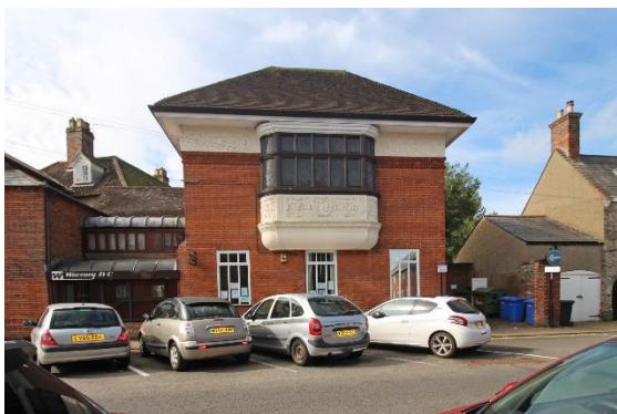
Billiard Room wing, Earsham House, No.12, Earsham Street

Earsham House, No.12 Earsham Street including No.1a Broad Street (grade II). Eighteenth century two storey, attic, and basement, three pedimented dormers. Red brick, small wood cornice, modern tiles. Plinth. Five windows, sash, with glazing bars and flat arches. six-panel door in wood case with enriched pilasters, radial bar fanlight, consoles, and open pediment. Fine arts and crafts vernacular rear range of 1892 fronting onto Broad Street now part of the Council offices. Red brick with a hipped roof over wide projecting eaves. Fine oriel window at first floor level with mullions and a transom containing leaded lights. This housed a billiard room on the first floor and was designed by Bernard Smith with fittings by MFC Turpin and WB Simpson. The fine pargetted decoration is by Daymond and Son. Bettley, J, and Pevsner, N, The Buildings of England, Suffolk: East (London, 2015) p.154-155.