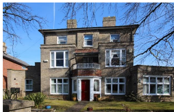
No.67 Lower Olland Street

occupies the site of a former conservatory. To the right a later recessed bay with an Ionic porch. Door with glazed upper panels. In the nineteenth century the home of the Walker family owners of the Staithe Maltings. Honeywood F, Morrow P, & Reeve C, The Town Recorder, A History of Bungay in Photographs (Bungay, 1994) p104.