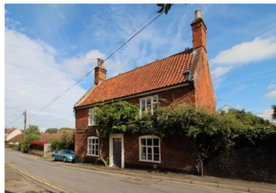
No. 18 Nethergate Street

No.16 Nethergate Street. A detached red brick dwelling of early nineteenth century date. Formerly two houses. Black pan tiled roof with decorative ridge pieces. Tall decorative ridge stacks. Late twentieth century six-panelled door and casement windows within original openings. Flat-arched brick lintels. Late twentieth century flat roofed addition to right and rear.