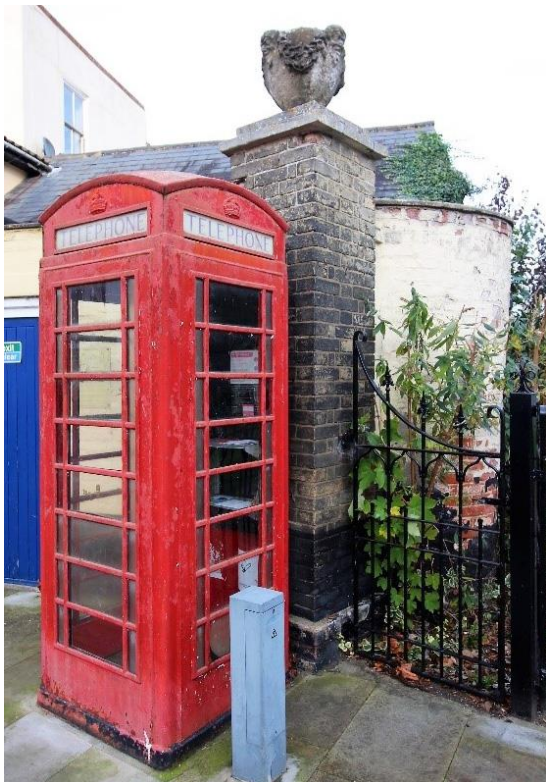
K6 telephone box and pier, St Mary's Street

K6 Telephone Box, St Mary's Street. The K6 designed by Giles Gilbert Scott was introduced in 1935 to commemorate the silver jubilee of King George V. It was a smaller version of the earlier K2 and went on to be installed prolifically around the country.