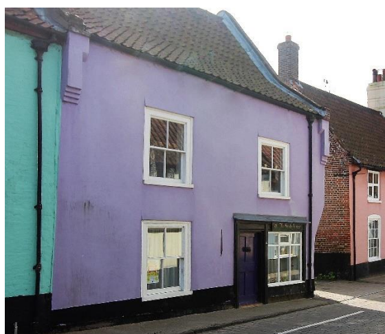
The Smokehouse, No.48 Bridge Street

Nos.40-44 (even) Bridge Street (grade II). A row of three cottages, Nos.42-44 the former Kings Arms Inn and recorded as such in the seventeenth century (closed c1910). Seventeenth century with later alterations, partially re-fronted. Of two storeys and attics. No.40 with black pan tile roof covering, Nos.42-44 red. No.40, is of two storeys and attics and has an early nineteenth century white brick façade with gauged flat arched lintels. A single, late twentieth century flush frame sash window with glazing bars to each floor and late twentieth century front door with original cambered lintel. Flat roofed dormer in roof slope above. Nos.42 and 44 rendered. No.42 with flush frame casement windows. Ground floor openings to No.44 recessed beneath cambered brick arched lintels. One four-light sash and one casement. Twelve-light hornless sash and small casement above. No. 42 has a later twentieth century six-panelled door, No.44 a partially glazed four-panelled door. Nos. 2, 4, 6A, 12 to 20 (even), 24 to 34 (even) 40 to 44 (even), 48 and 50 form a group. Honeywood F, Reeve C, & Reeve T, The Town Recorder, Five Centuries of Bungay at Play (Bungay, 2008) p136-137.