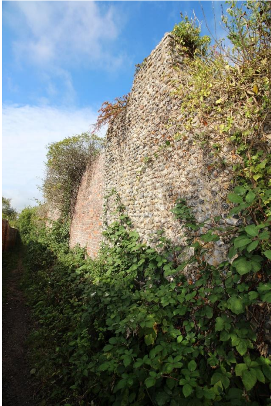
Garden wall of c1839, grounds of Scott House, Earsham Street

Fronting onto Castle Lane the walls are largely of red brick and probably of mid nineteenth century date.