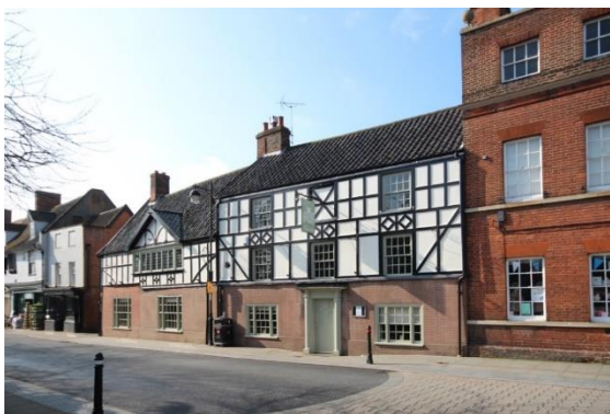
The Fleece Hotel, St Mary's Street

No.6 St Mary's Street and garden walls to rear (grade II). A substantial late eighteenth century townhouse. Of three storeys. Five-bay symmetrical principal façade of red brick with stone dressings. Central breakfront of a single bay, plinth, ground and first floor sill bands. The central breakfront has an open pediment at second floor level above a Venetian window with sashes. Open-pedimented doorcase with Doric \frac{3}{4} radius columns, triglyphs, and an arched fanlight. Six-panelled door. Twelve-light hornless sashes to ground and first floors, six-light to second floor. Flat-arched lintels. Stone mouldings to cornice at second floor level. Stone cope with four stone ball finials. Fine mid-nineteenth century wooden office window to ground floor right of classical design, with consoles and an entablature. Central glazed entrance with arched door. Rendered rear range with twelve-light sashes. Subsidiary Structures. Good late eighteenth century red brick walls surrounding former rear garden. Nos.2 to 22 (even) form a group. Bettley, J, and Pevsner, N, The Buildings of England, Suffolk: East (London, 2015) p.157.