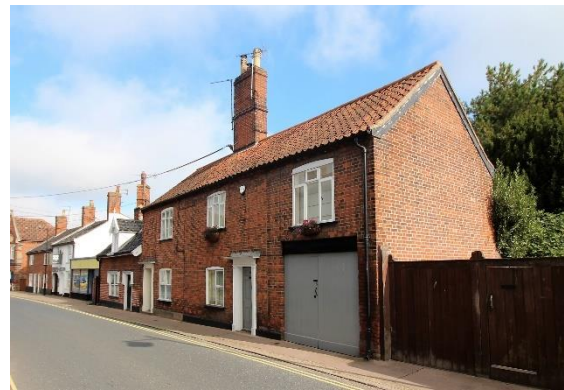
Nos.2 & 4 (even) Chaucer Street

See also No.22 Earsham Street its walls and outbuildings