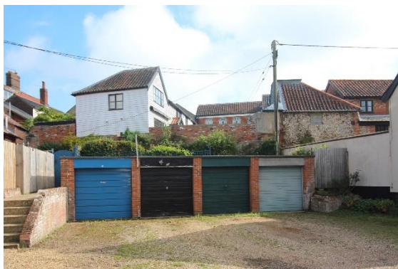
The Old Ironworks, Nathans Yard,

p.154. Reeve C, Bungay Through Time (Stroud, 2009) p45.