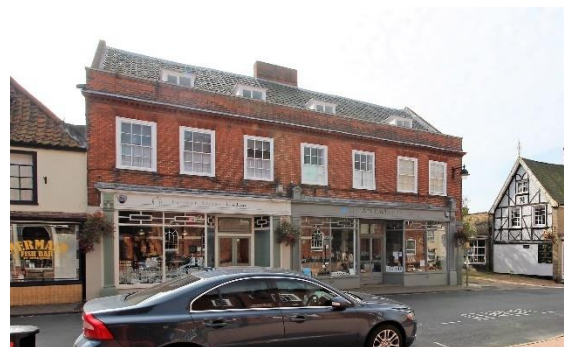
Nos.51-55 (Odd) Earsham Street

No.49 Earsham Street (grade II). Next to No 41. Probably of early eighteenth century date, and of two storeys and an attic. First floor stuccoed, lined and painted and containing two flush frame sash windows with glazing bars. Red pan tiled roof containing two gabled dormers with late twentieth century casement windows. Passage under left with a six-panelled door. Twin square bayed shop front. Nos.39, 41, 49, 55 to 61 (odd) and Nos.65 to 73 (odd) form a group. The rear section of the plot on which this building stands is within the scheduled area of the Castle complex.