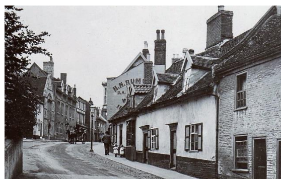
Nos.61, 65, & 67 Earsham Street c1920.

Nos.61-67 (odd), Earsham Street (grade II). A picturesque terrace of three single storey cottages with attics, formerly four dwellings. Red pan tile roof with black pan tile insets forming a decorative geometric pattern. Seven gabled dormers with decorative bargeboards on the Earsham Street roof face containing mostly late twentieth century casement windows. Edwardian views show only three dormers at that time. Of timber framed construction but faced in painted plaster. Twelve-light sash windows with glazing bars and flush frames. Nos.61, 65 and 67, have wood doorcases. No.61, a six-panelled door, the rest have twentieth century four-panelled doors. Nos.39, 41, 49, 51, 61 (odd) and Nos.65 to 73 (odd) form a group.