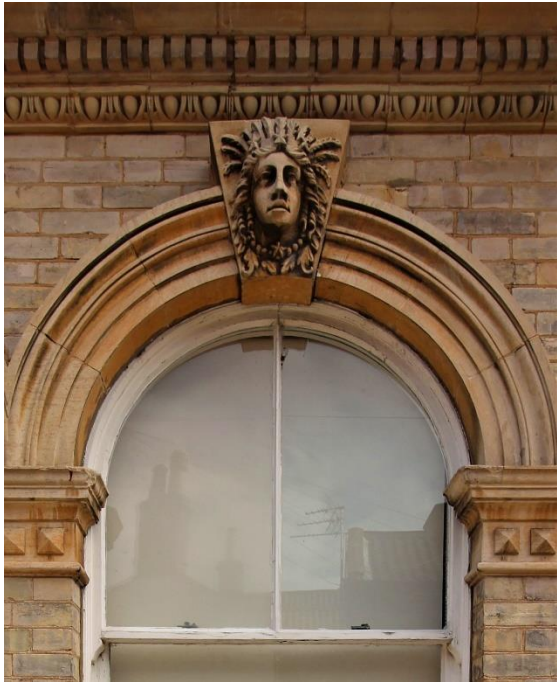
Detail of former banking hall, Nos.12-16 (even) Broad Street