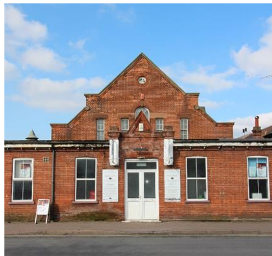
The Chaucer Club

For the Green Dragon Inn and its outbuildings see Broad Street.