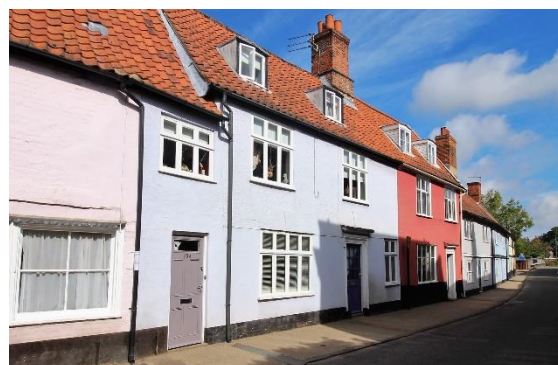
Nos. 35-37 (odd) Bridge Street

Nos.31-33 (odd) Bridge Street (grade II). Seventeenth century, and of two storeys with an attic. Two flat roofed dormers with centrally opening casements, within a red pan tiled roof. Brick colour-washed, with platt band. First floor has two early mullioned and transomed casements with flush frames which the statutory list describes as being 'original' to the present facade. Twenty-light hornless sash window to ground floor of No.31. Other ground floor windows now casements but all retain segmental arched lintels. Mid twentieth century door with oval light to No.31, twentieth century boarded door to No.33, both set within flush frames. Small nineteenth century former shop window to No.33. Nos.29 to 45 (odd) form a group.