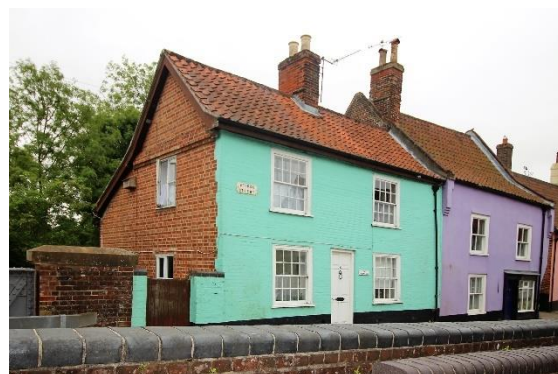
The Hermitage, No.50 Bridge Street

black pitch finish, small casement windows above. Pan tiled roof patched in various colours. Highly visible from the river side footpath. Reeve C, Bungay Through Time (Stroud, 2009) p61.