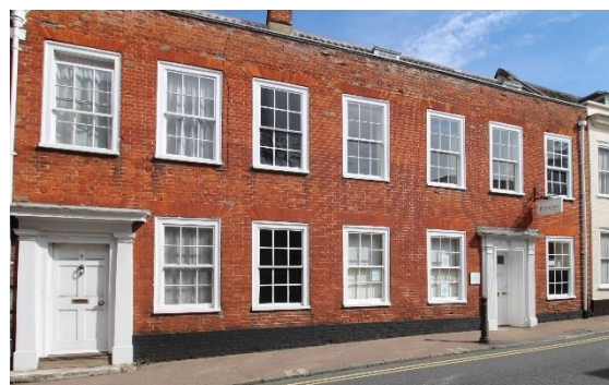
Nos.1&3 Trinity Street

Nos.1&3 Trinity Street (grade II). A pair of eighteenth-century houses with a unified seven bay two storey red brick façade to Trinity Street. Attic floor lit by dormers largely hidden behind parapet with a rendered cope. Pan tiled roof. Two false windows painted to look like sashes. Twelve-light hornless sash windows within flush frames, and beneath flat arches. Where windows have been replaced the replacements have horns. Lead rainwater heads. No.1 has a six-panelled door in wooden Doric case. No.3 with a six-panelled door, panelled reveals, fluted pilasters, frieze with swag enrichment and centre medallion head. Nos.1 to 19 (odd) form a group.