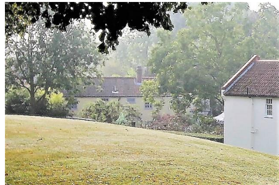
No.9 Outney Road

No.9 Outney Road. A later eighteenth century cottage of two storeys and three bays with a red pan tile roof, massively extended in the mid to late twentieth century on site of single storey range of outbuildings. Rendered façades, and external joinery largely replaced. The section between Outney Road and the central ridge brick ridge stack is all an addition to the original cottage. A further small cottage once stood immediately in front. Honeywood F, Morrow P, & Reeve C, The Town Recorder, A History of Bungay in Photographs (Bungay, 1994) p142.