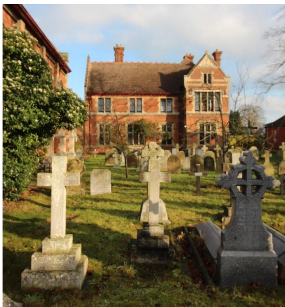
St Edmund's Presbytery, No.1 St Mary's Street