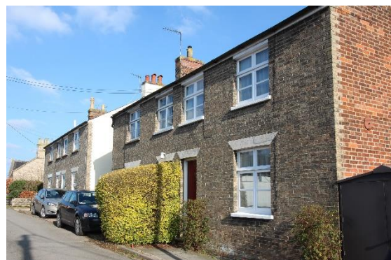
Nos.47-53 (Odd) Southend Road

Windsor Terrace Nos.33-41 (Odd) Southend Road. A terrace of 1896 faced in gault brick with black pan tiles to the front roof slope and red to the rear. Decorative eaves cornice. The central section, a former shop, breaks forward slightly and is gabled; it terminates views along Laburnum Road. The original shop windows to either side of the entrance have been partially preserved. Late twentieth century glazed porch added between former shop windows. Within the flanking wings are mirrored pairs of cottages. Many of the sash windows to these have been replaced with casements. Honeywood F, Morrow P, & Reeve C, The Town Recorder, A History of Bungay in Photographs (Bungay, 1994) p180.