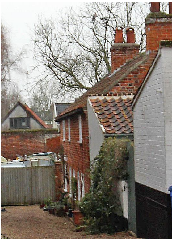
Nos.8-12 (even), Nethergate Street

Nos.8-12 (even), Nethergate Street A terrace of three c1800 cottages standing at a right-angle to the road within an alley to the rear of Nos.4 & 6. Built of red brick with a red pan tiled roof containing sloping roofed dormers with casement windows. Stack to gable at Nethergate Street end and one central ridge stack. Small pane casement windows beneath cambered brick lintels. Doors with similar lintels.