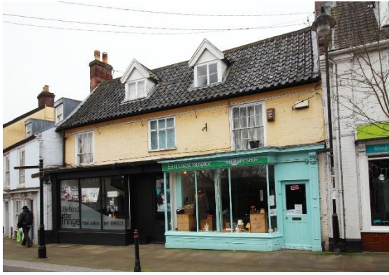
No.48 St Mary's Street

No.48 St Mary's Street (grade II). Eighteenth century, of two storeys and an attic. Black pan tiled roof with two gabled dormers. Painted brick. Three-bay rendered façade with sixteen-light flush-framed sashes to the outer bays and a casement window to the centre. Coved cornice. Mid-nineteenth century shop front with cornice and consoles. Nos.42 to 56 (even) form a group.