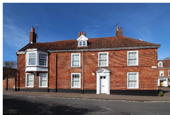
Nos.11 and 11a Wharton Street

The Hollyhocks No.9 Wharton Street and Garden Wall. A two-storey red brick house of c1820 with a black pan tiled roof. Symmetrical three bay façade with a blind recess above the doorcase. Six-panelled front door. Twelve-light hornless sashes in flush frames. Gabled return elevations largely blind. Low red brick garden wall with taller return section.