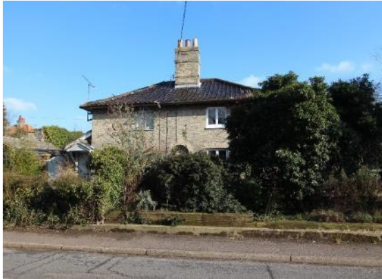
Autumn Cottage, No.13 Flixton Road

No.11 Flixton Road (grade II). An early nineteenth century two storey, Suffolk yellow brick, villa, grey-washed. Hipped black pan tiled roof and wide eaves. Two sixteen-light hornless sash windows with flush frames, at first floor level. Two canted and sashed bays to ground floor. Small wings with blank arched panels. Six-panelled door. Wooden Doric porch. Nos.9 to 13 (odd) form a group.