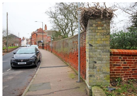
Wall of Garden to Trinity Hall, Trinity Street with pier of Holy Trinity Churchyard walls

No.19 Trinity Street (grade II) A later eighteenth-century façade to a late seventeenth century structure. Two storeys with an attic lit by three hipped casement dormers, red plain tiles at front, pan tiles at back. Parapet with stone cope, and a moulded brick dentilled cornice. Symmetrical five bay façade to Trinity Street. To the first floor five twelve-light hornless sash windows with flat arched lintels. Central first floor window lintel with a shaped soffit. Five-panelled door, with an elliptical fanlight with curved bars, panelled pilasters, consoles, and an open pediment. Windows to older portion are either sashes in flush frames, or mullion transomed leaded casements. Coved cornice. Lower two-storey wing, two windows, corbelled brick cornice, pan tiles, cambered arches. Interior: some original mantels and wood arched panelled screen. Nos.1 to 19 (odd) form a group. A number of the subsidiary features at No.19 are separately listed. Bettley, J, and Pevsner, N, The Buildings of England, Suffolk: East (London, 2015) p.157.