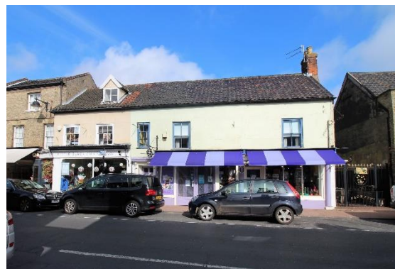
Nos.32-36 (even) Earsham Street

Nos.32-36 (even) Earsham Street (grade II). Eighteenth century two storey and attic, one gabled dormer. Stucco on brick, lined and painted. Pantiles. Five windows, sash, some with glazing bars and flush frames. Fine early nineteenth century wooden shop fascia with three Doric columns and entablature, modern glass. Smaller modern shop front, left. Nos. 2-40 (even) form a group. Reeve C, Bungay Through Time (Stroud, 2009) p44.