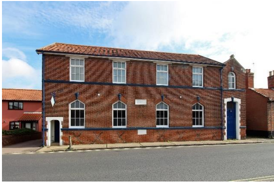
Former Saint Mary's Parish Rooms, Broad Street

Former Saint Mary's Parish Rooms, Broad Street. Former parish rooms and Sunday School built in 1882, but in a highly conservative style. Formerly with a Church of England Sunday School to the ground floor, and a mission hall above. Reputedly used as a soup kitchen in the two World Wars. Red brick with a shallow pitched red pan tile roof with blue tile stripes. Overhanging eaves with bargeboards to return elevations. Five bay, two storey, principal façade in a restrained gothic style. Painted stone dressings. Cambered brick arched windows to ground floor with painted stone rusticated keystones. Casement windows replaced with PVCu. Principal entrance in gabled bay to right with arched window at first floor level. Painted stone sill bands, with date stone below that to the ground floor. Closed c1939 and later a store and retail premises. Marked as a shoe factory on the 1969 Ordnance Survey map. Saint Mary's Church itself was declared redundant in 1977. Honeywood F, Morrow P & Reeve C, The Town Recorder, A History of Bungay in Photographs (Bungay, 1994) p14.