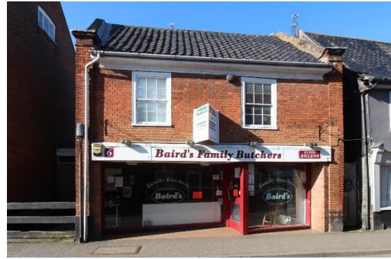
No.6 Upper Olland Street

No.4 Upper Olland Street (grade II). Eighteenth century, of two storeys with a painted stucco façade. Two flush framed mullioned and transomed casements at first floor level. The shop fascia is not of nineteenth century date as suggested in the listing as it does not correspond to that in c1900 photographs. Six-panelled door. Black pan tiled roof. Nos.2 to 10 to late-(even), No.14, 16 and Nos.20 to 24 (even) form a group. Honeywood F, Morrow P, & Reeve C, The Town Recorder, A History of Bungay in Photographs (Bungay, 1994) p185.