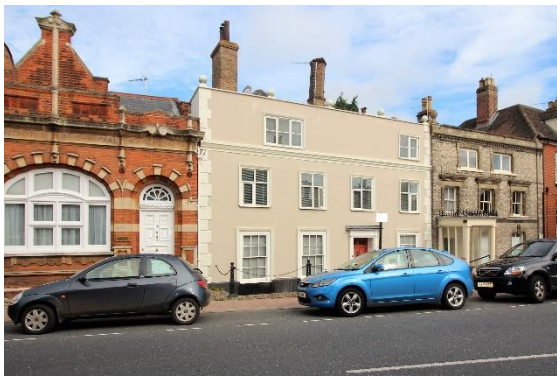
No.16 Earsham Street

No.16 Earsham Street (grade II). A substantial seventeenth century townhouse, which is reputed to have been built in 1620. Three-storey, four-bay, stuccoed façade to Earsham Street with rusticated quoins and a parapet capped by ball finials. Moulded plaster plat band beneath second floor windows, moulded cope to parapet. Four original mullioned and transomed casements with stucco architraves at first floor level. Eight-panelled door, right of centre, in wood case with panelled reveals, pilasters and entablature flanked by twelve-light sashes. Black pan tile roof with gault brick stacks. Some original interior doors. Nb. C1900 photos show the house without the present second floor and parapet but with dormers set within the roof this part of the façade is however evident in c1930 views. Nos. 2 to 40 (even) form a group. Honeywood F, Morrow P & Reeve C, The Town Recorder, A History of Bungay in Photographs (Bungay, 1994) p148.