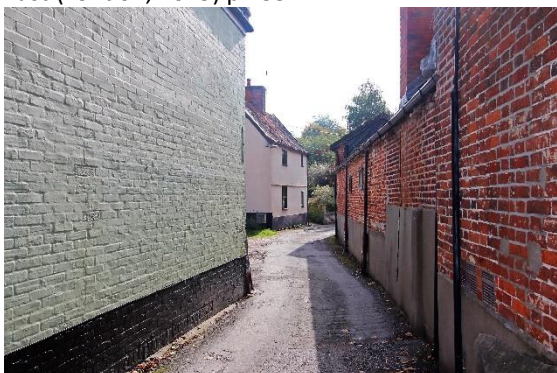
Castle Lane showing the outbuildings to Scott House on the right.