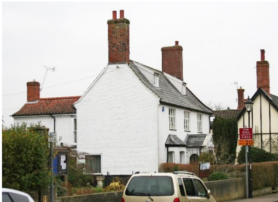
White House, No.32 Upper Olland Street

applied half-timbering, steeply pitched black pan tiled roof, cove cornice, two late twentieth century casements at first floor level. The ground floor detailing recorded in the statutory list has now gone including the doorcase, shop fascia and casement window. Late twentieth century shop fascia. Thin red brick at base of chimney shaft. Twin gabled northern return elevation. Early casement within front gable. Nos.30 to 34 (even), Emmanuel church and Nos.38 to 52 (even) form a group.