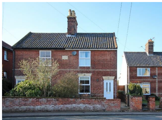
Nos.48-52 (even) Staithe Road

Nos.42-44 (even) Staithe Road. A pair of detached houses of Fletton brick c1904-10. No.42 has a Fletton and red brick façade to Staithe Road, red brick dressings, and replacement casement windows within original openings. A relatively early use of Fletton brick. No.44 with a gault brick elevation to Staithe Road with red brick dressings. Horned sash windows, and a partially glazed four-panelled front door. Gabled wooden lattice porch. Gault brick chimney stack with red brick dressings. Fletton brick gable end. Good quality late twentieth century addition to rear. Replaced pan tile roof coverings. C1900 red brick boundary wall to Staithe Road.