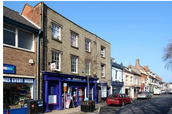
Nos.36-38 (even) St Mary's Street

twentieth century shop front. Red pan tiled roof with casement dormer.