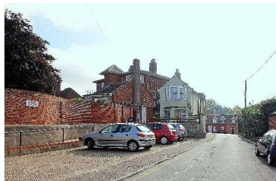
Outney Road elevation and serpentine wall of St Mary's House, No.54, Earsham Street

Eight-panelled door in wooden case with fluted Doric pilasters triglyphs and fret dentil cornice. Wing, to left partly seventeenth century. House built by Giles Borrett. Good early nineteenth century red brick serpentine wall fronting Outney Road. Nos. 54, 56, wing adjoining, walls, and ancillary building together with the bridge over the river Waveney form a group. Bettley, J, and Pevsner, N, The Buildings of England, Suffolk: East (London, 2015) p.154. Reeve C, Bungay Through Time (Stroud, 2009) p41.