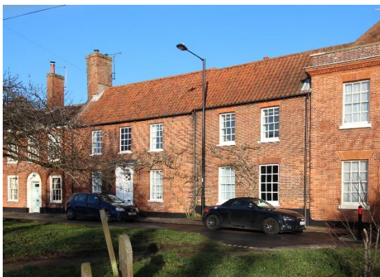
No.17 Trinity Street

No.15 Trinity Street (grade II). Late seventeenth century with eighteenth century red brick façade. Two storeys, red brick, wood cornice, black pan tiled roof. Twelve light hornless sashes in flush frames. Flat arched lintels. Pair of arched recesses under each right-hand window the left-hand one containing a five-panelled door, the right a twelve-light sash. Nos 1 to 19 (odd) form a group.