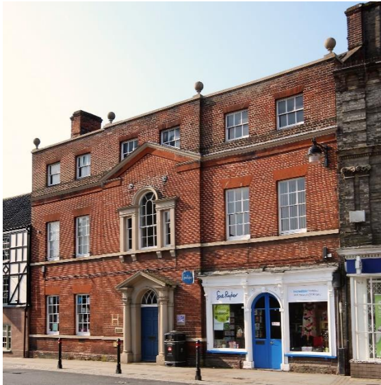
No.6 St Mary's Street

No.6 St Mary's Street and garden walls to rear (grade II). A substantial late eighteenth century townhouse. Of three storeys. Five-bay symmetrical principal façade of red brick with stone dressings. Central breakfront of a single bay, plinth, ground and first floor sill bands. The central breakfront has an open pediment at second floor level above a Venetian window with sashes. Open-pedimented doorcase with Doric \frac{3}{4} radius columns, triglyphs, and an arched fanlight. Six-panelled door. Twelve-light hornless sashes to ground and first floors, six-light to second floor. Flat-arched lintels. Stone mouldings to cornice at second floor level. Stone cope with four stone ball finials. Fine mid-nineteenth century wooden office window to ground floor right of classical design, with consoles and an entablature. Central glazed entrance with arched door. Rendered rear range with twelve-light sashes. Subsidiary Structures. Good late eighteenth century red brick walls surrounding former rear garden. Nos.2 to 22 (even) form a group. Bettley, J, and Pevsner, N, The Buildings of England, Suffolk: East (London, 2015) p.157.