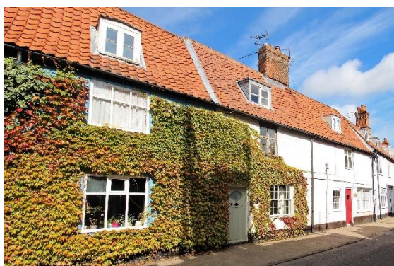
Nos. 31-33 (odd) Bridge Street

Nos.31-33 (odd) Bridge Street (grade II). Seventeenth century, and of two storeys with an attic. Two flat roofed dormers with centrally opening casements, within a red pan tiled roof. Brick colour-washed, with platt band. First floor has two early mullioned and transomed casements with flush frames which the statutory list describes as being 'original' to the present facade. Twenty-light hornless sash window to ground floor of No.31. Other ground floor windows now casements but all retain segmental arched lintels. Mid twentieth century door with oval light to No.31, twentieth century boarded door to No.33, both set within flush frames. Small nineteenth century former shop window to No.33. Nos.29 to 45 (odd) form a group.