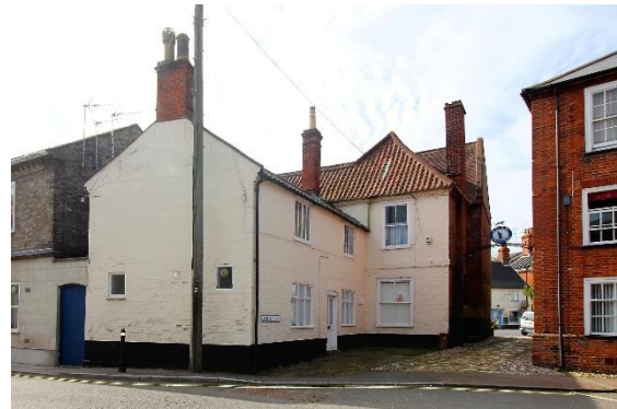
No.8 Earsham Street from Broad Street

fanlight, 3/4 columns triglyphs and open pediment. The rear range of No.8 is painted and is visible from both Broad Street and Cork Bricks. It is slightly lower in height and has a symmetrical façade to Cork Bricks with a central doorway. Black pan tiled roof, dentilled brick eaves cornice and casement windows. Nos.2 to 40 (even) form a group. Bettley, J, and Pevsner, N, The Buildings of England, Suffolk: East (London, 2015) p.154.