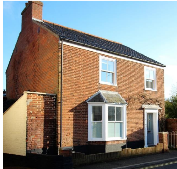
No.13 Upper Olland Street

No.11 Upper Olland Street. A former public house now converted to flats. Probably of early nineteenth century date. In use as The Queen Public House in the nineteenth and early twentieth centuries. Red brick. Twelve-light hornless sash windows to first floor in flush frames with flat-arched lintels. Nine-light hornless sashes to second floor. Small inserted late twentieth century casement at first floor level. Large yard opening with boarded door to ground floor and a later nineteenth century public house fascia with panelled pilasters. Return elevation to Turnstile Lane partially rendered. Two storey rear wing with casement windows. Honeywood F, Reeve C, & Reeve T, The Town Recorder, Five Centuries of Bungay at Play (Bungay, 2008) p152-153.