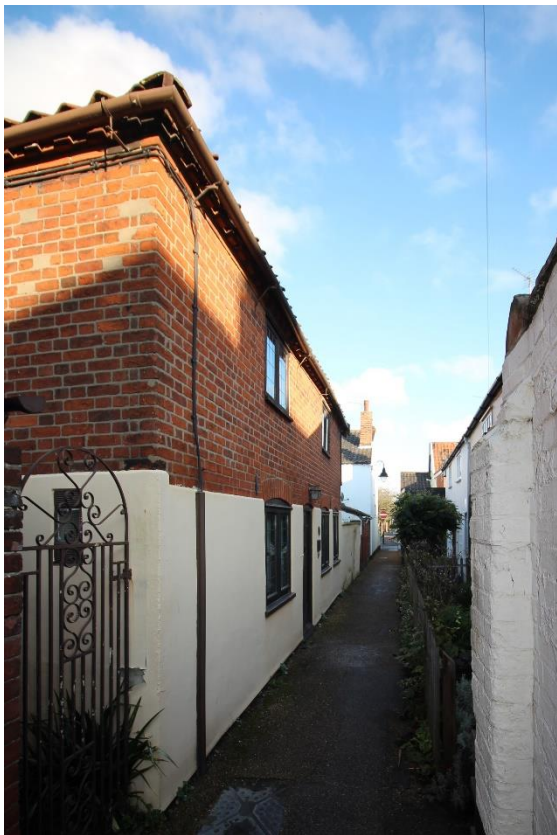
Nos.8 & 10 Turnstile Lane

Nos.7-9 (Odd) Turnstile Lane. A terrace of four probably early nineteenth century cottages which were converted to two in the late twentieth century. Rendered façades with twelve-light casement windows and boarded doors. Red pan tiled roof, red brick ridge stacks.