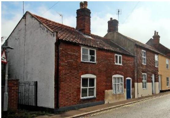
No.28 Chaucer Street

stack on return elevation of a highly decorative design. Left hand bay has cart entrance into a central courtyard. Lower late twentieth century rear range faced in red brick with a weatherboarded first floor. Bettley, J, and Pevsner, N, The Buildings of England, Suffolk: East (London, 2015) p.155. Honeywood F, Morrow P & Reeve C, The Town Recorder, A History of Bungay in Photographs (Bungay, 1994) p149.