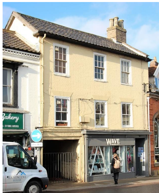
No.10 Market Place

No.10 Market Place (grade II). Probably of early nineteenth century date, with a three storey and three bay façade to the Market Place, brick,