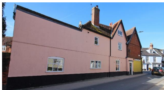
No.2 Lower Olland Street

No.2 Lower Olland Street (grade II). Early seventeenth century. This building interlocks with Nos.1 and 3 Upper Olland Street, qv, and incorporates part of a sixteenth century structure. Of two storeys and an attic. Tiles and pan tiles. Mock half timberwork painted on cement rendering. three-light casement window within gable, two-light casement at first floor level, mullioned and transomed casement to ground floor. Six-panelled door (entrance under left of No.56 St Mary's Street) with architrave convex frieze and cornice. 2'storey wing, left, brick, painted, includes small casement at each floor. No.2 forms part of a group with No.56 St Mary's Street and Nos. 1, 3 & 3a Upper Olland Street. Subsidiary structures. Fine panelled red brick garden wall to south fronting onto Lower Olland Street. Dentilled cornice beneath semi-circular brick cap. Blue brick embellishments.