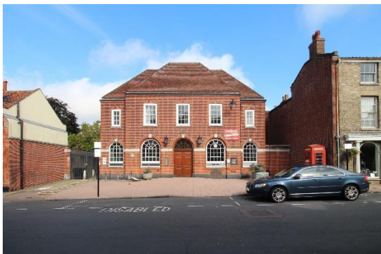
No.42 Earsham Street

K6 Telephone Box outside No.42 Earsham Street (grade II). Telephone kiosk. Type K6. Designed 1935 by Sir Giles Gilbert Scott and made by various contractors. Cast iron. Square kiosk with a domed roof. Unperforated crowns to top panels and margin glazing to the windows and door.