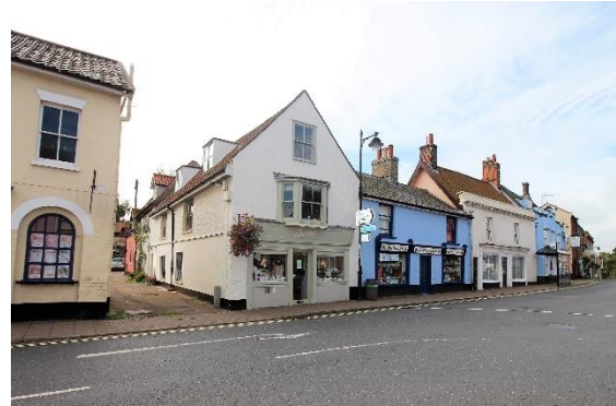
No.29 Earsham Street

Recorder, A History of Bungay in Photographs (Bungay, 1994) p147.