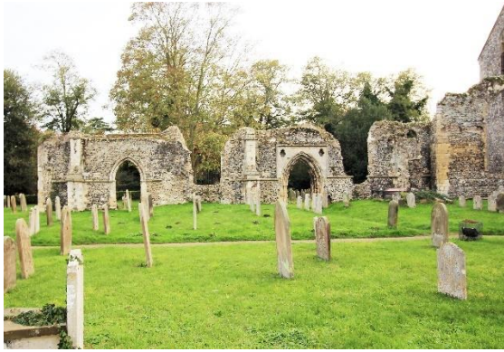
Benedictine Abbey Ruins, St Mary's Street