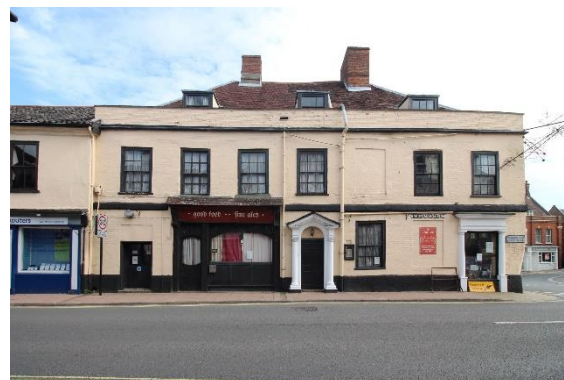
The Three Tuns, No.2 Earsham Street

The Three Tuns Inn, No.2 Earsham Street (grade II). A seventeenth century structure of two storeys and an attic, occupying an island site with façades to Earsham Street, Broad Street and Market Place. The large wing to the left was in retail use by early