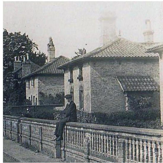
Nos.17 & 19 Flixton Road c1920

former spine wall. No.17 retains four-pane plate glass sashes, the window joinery to No.19 has however been replaced with casements. Late twentieth century glazed addition. Lean-to side porch to No.19. Subsidiary Structures: Low mid-nineteenth century white brick wall with red brick bands and brick balustrade. Honeywood F, Morrow P, & Reeve C, The Town Recorder, A History of Bungay in Photographs (Bungay, 1994) p190.