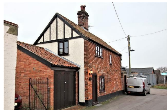
The Bakery, Rose Lane

Boundary wall to Santallen, Rose Lane. A red brick and stone rubble boundary wall of nineteenth century date fronting Rose Lane. Santallen itself is a late twentieth century house which does not contribute positively to the Conservation Area.