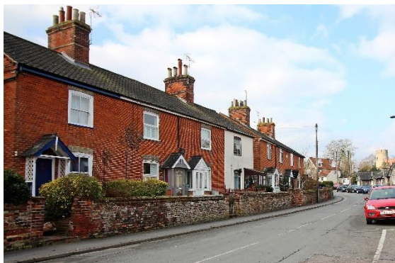
Nos.12-28 (even) Staithe Road

Kimberley Terrace Nos.12-28 (even) Staithe Road . Two terraces of red brick cottages of c1902. Gault brick cambered lintels to ground floor windows. Black pan tiled roof. Most external joinery replaced but original openings preserved. Contemporary red brick boundary wall to Staithe Road.