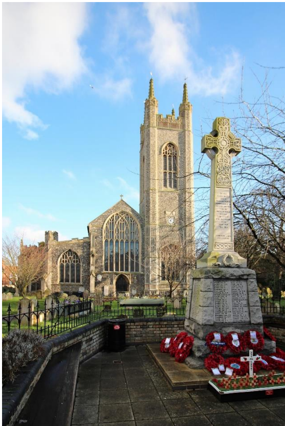
St Mary' Church, St Mary's Street

St Mary' Church and Benedictine Abbey Ruins, St Mary's Street (grade I). A former parish church, closed 1977, and now redundant. Originally this was the Church of the Holy Cross, attached to a Benedictine nunnery, the ruins of which partially survive to the east side of the church. The nunnery was dissolved and partially dismantled at The Reformation and then badly damaged in the fire of 1688. Nave, aisle and porch primarily fifteenth century. The late fifteenth century tower is arguably the dominant feature in the townscape. Its parapet and battlements are of 1702. Octagonal buttresses carried above the parapet as pinnacles. Fire damaged 1688, internally refitted and south aisle re-roofed, as dated on a rafter, in 1699. Church