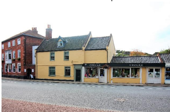
No.7-9 Earsham Street

No.5 Earsham Street (grade II). An early nineteenth century red brick structure with a hipped pan tile roof. Slightly projecting plinth. Brick toothed cornice. Four windows sash with flush frames and flat arches. Three-light sashed wooden canted bay to the first floor flanked by four-pane plate-glass sashes. Nine-light sashes to second floor windows. Modified plate-glass sashes to ground floor. Later twentieth century panelled door with fanlight and flat arch. Former garden entrance to right now leading into a c2010 top-lit single storey addition. Nos.1 to 19 (odd) form a group. The rear section of the plot on which this building stands is within the scheduled area of the Castle complex.