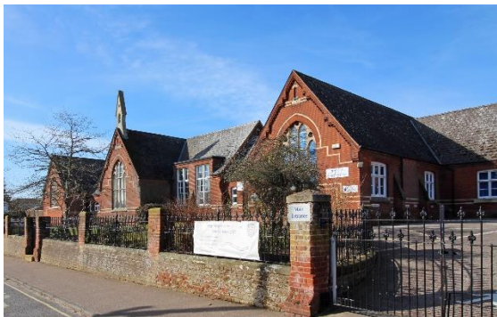
Bungay Primary School, Wingfield Street

Nos.21-23 (Odd) Wingfield Street and wall. A mid nineteenth century structure with the appearance, rendered brick with a Welsh slate roof. of once being a single villa, now two dwellings. No.21 retains much of its original appearance and has a canted bay with sash windows to Wingfield Street. The windows to No.23 have been replaced within the original openings. Central arched doorway with pronounced keystone within breakfront. Subsidiary Structures High nineteenth century painted brick wall with gate.