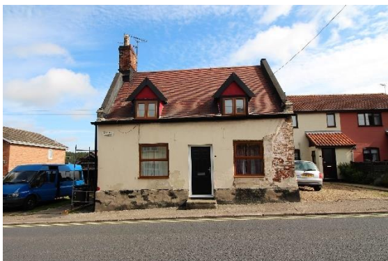
No.86 Broad Street

Former Saint Mary's Parish Rooms, Broad Street. Former parish rooms and Sunday School built in 1882, but in a highly conservative style. Formerly with a Church of England Sunday School to the ground floor, and a mission hall above. Reputedly used as a soup kitchen in the two World Wars. Red brick with a shallow pitched red pan tile roof with blue tile stripes. Overhanging eaves with bargeboards to return elevations. Five bay, two storey, principal façade in a restrained gothic style. Painted stone dressings. Cambered brick arched windows to ground floor with painted stone rusticated keystones. Casement windows replaced with PVCu. Principal entrance in gabled bay to right with arched window at first floor level. Painted stone sill bands, with date stone below that to the ground floor. Closed c1939 and later a store and retail premises. Marked as a shoe factory on the 1969 Ordnance Survey map. Saint Mary's Church itself was declared redundant in 1977. Honeywood F, Morrow P & Reeve C, The Town Recorder, A History of Bungay in Photographs (Bungay, 1994) p14.