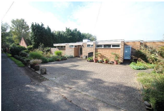
Willow Fen, Castle Lane

See Scott House, Earsham Street (Market Character Area) for garden walls, outbuildings, and folly tower on southern side of Castle Lane. See Market Character Area for Nos. 1-4 and the steps to Nathan's Yard. For No.1 Castle Lane see rear wing of Nos.69-71 (Odd) Earsham Street