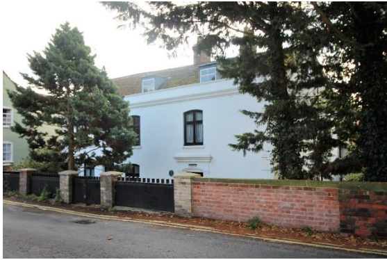
Scott House, No.73 Earsham Street