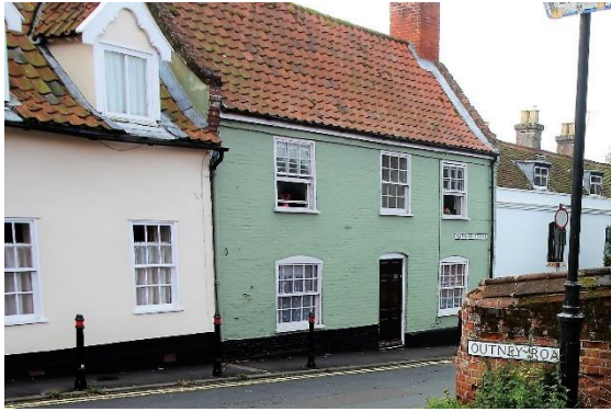
Nos.69-71 (odd), Earsham Street

Nos.69-71 (odd), Earsham Street (grade II). House, formerly three cottages of eighteenth century date, two storey with a lime washed brick façade. Standing on the corner of Castle Lane. Considerably altered since present listing description drafted. Front range facing Earsham Street formerly two cottages with a third in the rear outshot. Earsham Street façade formerly with two small pane sash windows to each floor with flush frames cambered arched lintels to ground floor. Six panelled door in a flush frame, formerly with a similar door to its immediate left. Inserted window immediately above. Roof formerly plain tiled but now covered with red pan tiles. Gabled return elevation to Castle Lane with two sashes. Rear elevation and two storey gabled rear outshot (formerly a separate small cottage No.1 Castle Lane) also visible from Castle Lane. Nos 39, 41, 49, 51, 61 (odd) and Nos.65 to 73 (odd) form a group.