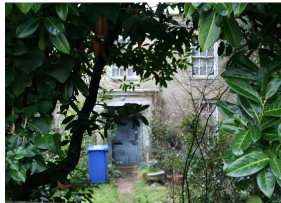
No.16 Flixton Road

No.16 Flixton Road and outbuildings (grade II). Early nineteenth century villa of Suffolk white brick built as the miller's house for a now demolished smock mill. Two storeys with a Welsh slate roof. Band below, parapet with a stone cope. Symmetrical