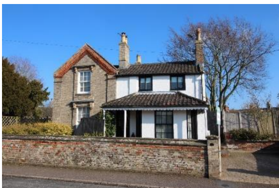
No.5-7 Flixton Road

Nos.1 & 3 Flixton Road, walls and gate piers. A semi-detached pair of houses prominently located at the junction of Bardolph and Flixton Roads. Also visible from Laburnum Road. Shown on the 1885 Ordnance survey map and probably dating from c1870. Gault brick with a Welsh slate roof. Decorative corbelled eaves cornice, pilasters, and two storey canted bay windows. Original plate glass sashes largely preserved. Subsidiary Structures Good contemporary gault brick gate piers and low boundary wall. Tall nineteenth century red brick wall to Laburnum Road.