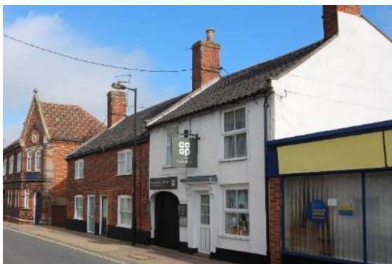
No.12 Chaucer Street

No.6 Chaucer Street. A small red brick structure externally of early to mid-nineteenth century appearance but possibly a re-casing of an earlier structure. Red brick with painted stone dressings and a black pan tile roof. Street frontage range of a single storey and attics, substantial largely nineteenth century rear range of two storeys. Hood moulds to window and door openings, gabled dormer to attic with elaborate bargeboards. External joinery largely replaced. Tall brick chimneystack to left-hand gable. In the nineteenth century the Two Brewers Public House.