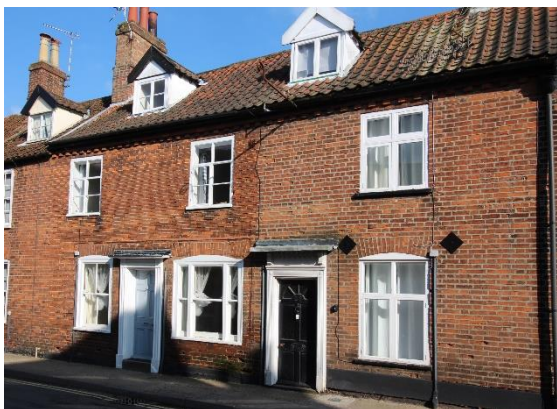
Nos.25 & 25a Upper Olland Street

Nos.21 & 23 Upper Olland Street (grade II) Eighteenth century double fronted structure. No.21 having its entrance in the north elevation. No.21 rendered with a pedimented doorcase and semi-circular radial fanlight. Partially glazed four-panelled door. Two dormers with shallow curved pediments and casement windows. Hornless twelve-light sashes. No.23 in the western or Upper Olland Street elevation. Eighteenth century. No.23 of two storeys and an attic with a single gabled dormer. Red brick with a red pan tiled roof. A single flush framed hornless twelve-light sash to each floor and a six-panelled door within wooden case with a mutular cornice. Nos.21 to 37 (odd) form a group. Subsidiary Structures No.21 has early twentieth century red brick boundary walls to its garden with square section piers.