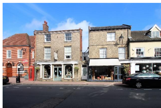
Nos.38-40 Earsham Street and telephone box

Nos.32-36 (even) Earsham Street (grade II). Eighteenth century two storey and attic, one gabled dormer. Stucco on brick, lined and painted. Pantiles. Five windows, sash, some with glazing bars and flush frames. Fine early nineteenth century wooden shop fascia with three Doric columns and entablature, modern glass. Smaller modern shop front, left. Nos. 2-40 (even) form a group. Reeve C, Bungay Through Time (Stroud, 2009) p44.