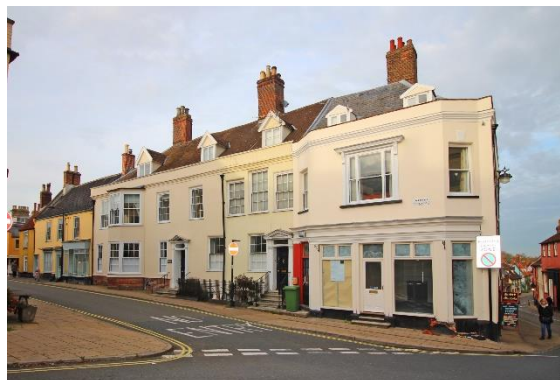
Nos.2 & 4 Broad Street with No.1 Market Place

For the former maltings adjacent to the Fisher Theatre see Nethergate Street