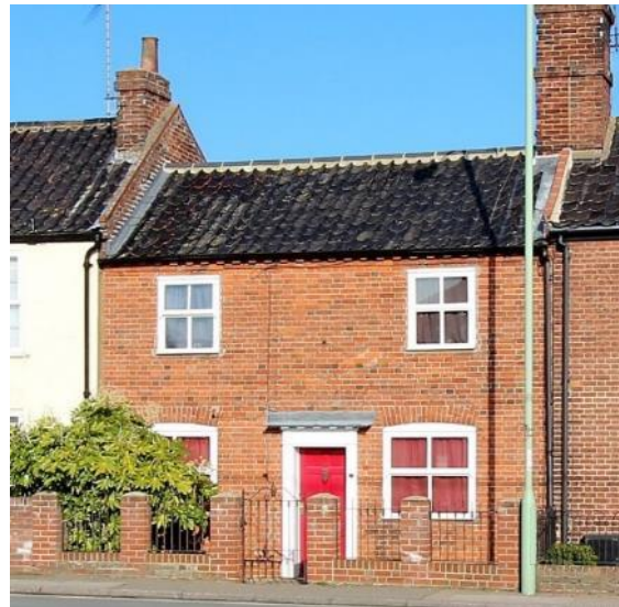
No.13 St John's Road

pilasters and six panelled doors. Late twentieth century casement windows within original openings with flat-arched lintels. Red brick stack to southern gable.