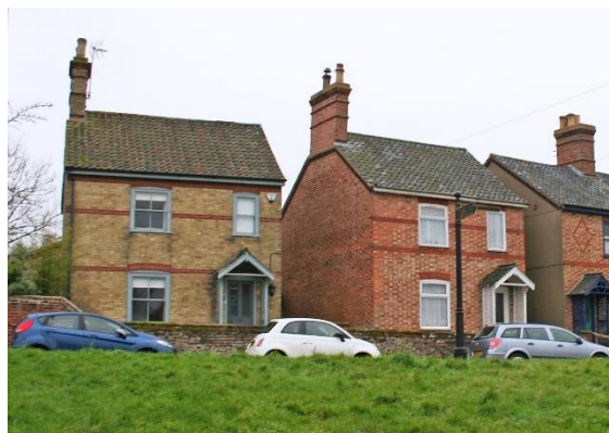
Nos.42-44 (even) Staithe Road

pan tiled roof and central ridge stack to spine wall. C1900 red brick boundary wall to Staithe Road. A relatively early use of Fletton brick.