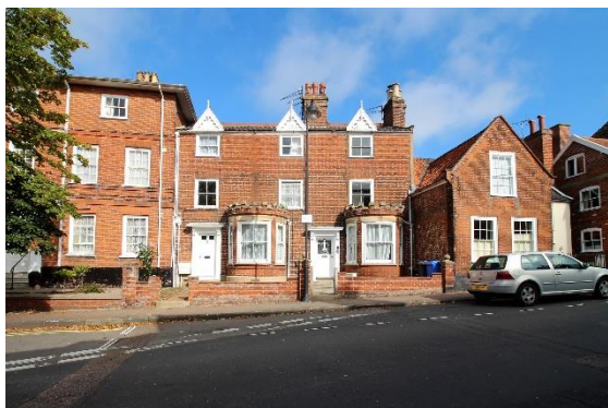
Nos.50-52 (even) Earsham Street

gable with tumbled foot. Flush frame sash window with glazing bars. Entrance at angle with fielded lower panel to door.