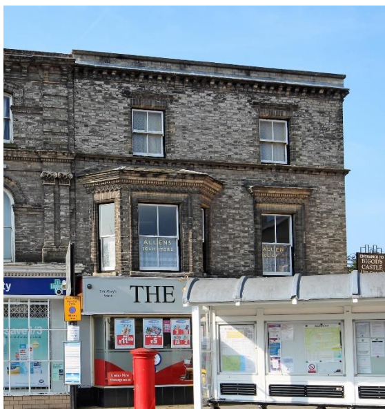
No.2 St Mary's Street

No.2 St Mary's Street. A red brick house and shop of c1800, re-fronted and partially rebuilt in Suffolk white brick c1870 probably to the designs of William Oldham Chambers of Lowestoft who designed the adjacent façade to the south. Three storey white brick façade of two bays, with canted bay to first-floor left. Horned plate-glass sashes. Parapet with dentilled cornice. Late twentieth century shop fascia. Early nineteenth century red brick range to rear with hornless sashes. Some windows with glazing bars removed. Taller two bay mid-nineteenth century red brick addition with plate-glass sashes. Flat-arched lintels and stone sills. Hipped roof with overhanging eaves. Return elevation rendered.