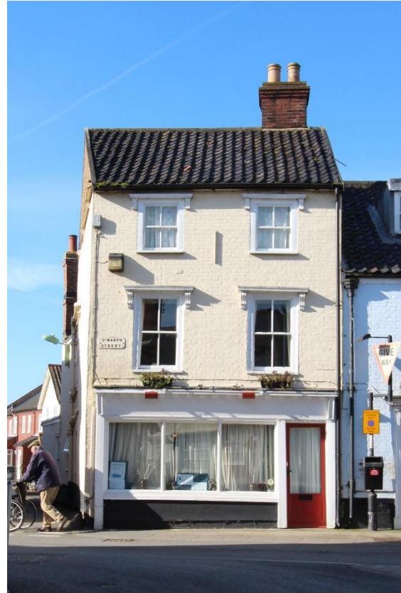
No.54 St Mary's Street

nineteenth and early twentieth centuries. The earliest reference to its dates from 1823 and the pub is believed to have closed c1912. Honeywood F, Reeve C, & Reeve T, The Town Recorder, Five Centuries of Bungay at Play (Bungay, 2008) p151.