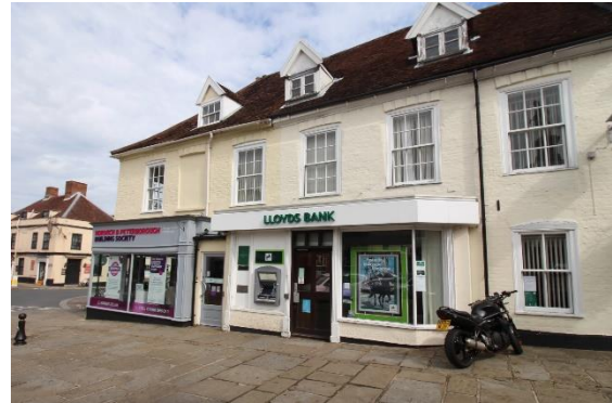
Nos. 9 & 11 Market Place

No. 7a Market Place . Former outbuilding now a dwelling, probably of early nineteenth century date. Red and blue bricks. Two storeys. Original openings retained on ground floor. Shallow arched brick lintels. First floor opening probably an enlarged former taking-in door. Blind gabled return elevation.