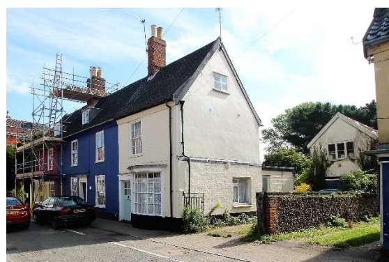
Nos.28-32 (even) Bridge Street

Substantial rear range with red brick façade, which was possibly originally a separate dwelling. Two storeys with a two-bay principal façade facing towards the river. Casement windows beneath cambered brick lintels, one hornless twelve-light sash at first floor level. Blocked door opening to ground floor centre. Good group of probably early nineteenth century red brick outbuildings in yard to the rear of No.26 including gabled cart shed with loft above. Red pan tiled roofs some now missing. Last used as an abattoir. Nos.2, 4, 6A, 12 to 20 (even), 24 to 34 (even) 40 to 44 (even), 48 and 50 form a group.