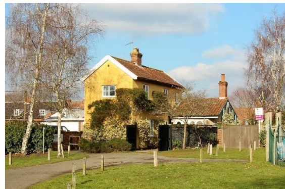
Castle, Cottage, Castle Yard, Castle Orchard

Originally the outer bailey comprised a substantial earthwork bank and external ditch which formed a rectangular enclosure extending to the south of the outer castle ditch. Buildings constructed on the eastern side of the outer bailey have obliterated any surface remains but on the west side the earthworks survive up to around 2.5m high. This area is known as Castle Hills and is an integral component of the early castle defences. Bettley, J, and Pevsner, N, The Buildings of England, Suffolk: East (London, 2015) p.151-153.