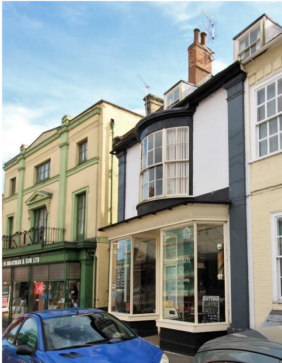
No. 7 Market Place

No. 7 Market Place (grade II). Early eighteenth century, of two storeys and an attic, two casement dormers within roof slope. Stucco. Market Place façade of two storeys flanked by pilasters. Red plain tile roof. Bowed oriel sash window at first floor level, with small pane sashes and a dentilled cornice. Mid nineteenth century wooden splayed bay shop front with a central entrance. Nos. 1 to 11 (odd), Nos. 11A, 13 and 17 to 21 (odd) form a group together with the Butter Cross.