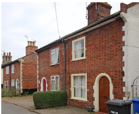
Nos.9 & 11 Southend Road

No.7 Southend Road. A mid-nineteenth century cottage which forms part of a semi-detached pair with the much altered No.5 (not included). Red and blue brick with painted stone dressings and quoins. Shallow pitched Welsh slate roof with deep overhang to eaves. Neo-Norman arched doorcase. Six-paneled door. Pointed arched windows divided by central splayed mullion.