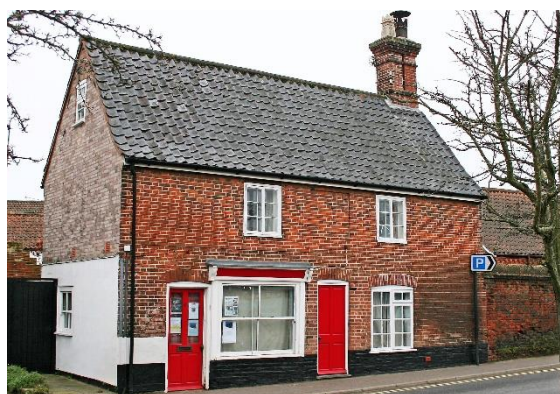
No.4 Lower Olland Street

No.2 Lower Olland Street (grade II). Early seventeenth century. This building interlocks with Nos.1 and 3 Upper Olland Street, qv, and incorporates part of a sixteenth century structure. Of two storeys and an attic. Tiles and pan tiles. Mock half timberwork painted on cement rendering. three-light casement window within gable, two-light casement at first floor level, mullioned and transomed casement to ground floor. Six-panelled door (entrance under left of No.56 St Mary's Street) with architrave convex frieze and cornice. 2'storey wing, left, brick, painted, includes small casement at each floor. No.2 forms part of a group with No.56 St Mary's Street and Nos. 1, 3 & 3a Upper Olland Street. Subsidiary structures. Fine panelled red brick garden wall to south fronting onto Lower Olland Street. Dentilled cornice beneath semi-circular brick cap. Blue brick embellishments.