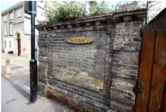
Boundary wall to The Armoury, Broad Street

Boundary wall to The Armoury. Mid nineteenth century gault brick wall with decorative panels between rusticated pilasters. Dentilled cornice and projecting plinth. Flanks the Broad Street garden entrance to The Armoury. For 'The Armoury' itself, see No.10a Nethergate Street.