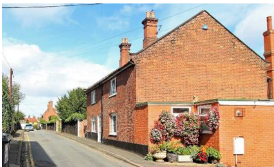
No. 16 Nethergate Street

Nos.8-12 (even), Nethergate Street A terrace of three c1800 cottages standing at a right-angle to the road within an alley to the rear of Nos.4 & 6. Built of red brick with a red pan tiled roof containing sloping roofed dormers with casement windows. Stack to gable at Nethergate Street end and one central ridge stack. Small pane casement windows beneath cambered brick lintels. Doors with similar lintels.