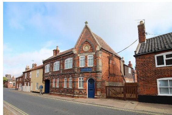
Masonic Rooms, Nos.18-22 Chaucer Street

Nos. 14 & 16 Chaucer Street. An early to mid-nineteenth century semi-detached pair of cottages. Of red brick with a shallow pitched black pan tile roof. Red brick stacks rising from gable ends. Replacement casement windows beneath shallow arched brick lintels. Brick lintels to doors possibly replaced. Four-panelled door to No.16. No.14 has a late twentieth century partially glazed front door.