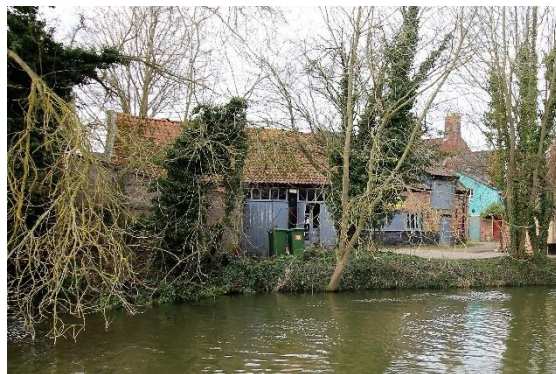
Outbuilding in Wharf Yard, Bridge Street

Outbuilding in Wharf Yard, Bridge Street Nineteenth century workshop range on the western side of Wharf Yard. Of one and a half storeys and built in red brick, the lower section tiled, red pan tile roof. Boarded doors. Boarded taking-in door to loft space and large central doors to river. Gabled return elevation to Bridge Street with first floor casement window. Single storey projecting range at southern end with corrugated roof. Probably a curtilage structure to the grade II listed No.48 Bridge Street.