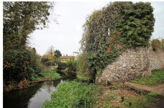
Folly tower, grounds of Scott House, Earsham Street

The extensive gardens of Scott House lay between Castle Lane and the River Waveney to the south and south-west of the house and onto the far bank of the river. The southern- most section beyond the bridleway from Castle Lane to the river has been developed for housing, fine garden walls and a folly tower however survive within the northern section. The gardens are open to the river with a low retaining wall separating the lawn from the water. On the Castle Lane side of the garden is a high boundary wall. The Buildings of England mentions a rockery created in 1844 by John Scott from stones taken from Bungay Priory. Within the gardens a later twentieth century wooden footbridge crosses the river to a wooded section of the house's grounds.