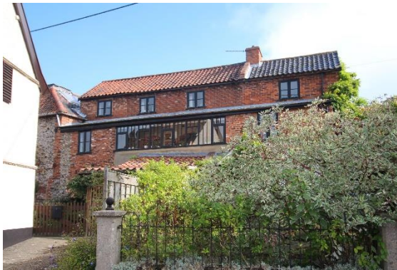
No.4 Castle Lane

pitched red pan tiled roof. Possibly of mid eighteenth century origins. Plat band above ground floor windows. Central red brick ridge stack. Dentilled eaves cornice. Entrance in gabled eastern return elevation. Four-panelled door with glazed upper lights. Western return elevation blind. Plain wooden bargeboards. Flat roofed single storey rear addition on site of earlier range shown on historic Ordnance Survey maps. Later twentieth century wooden casement windows. Group value with the grade II listed Nos.69-73 (odd) Earsham Street.