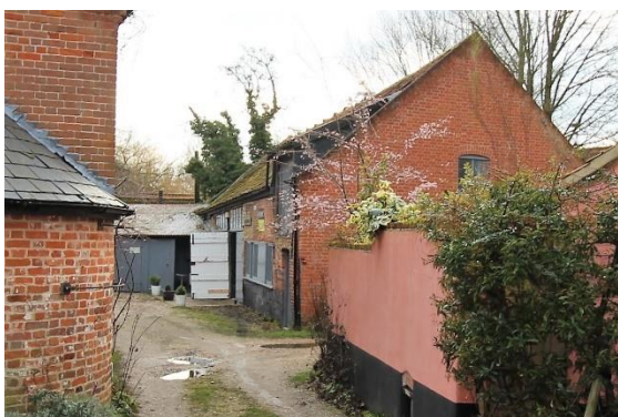
Outbuilding in Wharf Yard, Bridge Street

For the Smoke House located directly behind No.48 Bridge Street see No.48 Bridge Street.