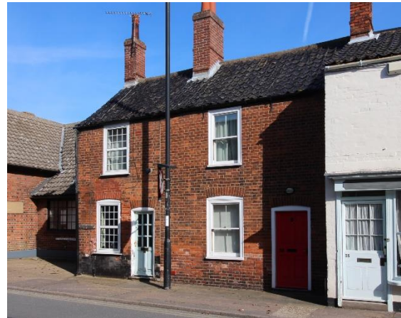
Nos.31-33 (odd) Lower Olland Street

No.29 Lower Olland Street. Former fire station built in 1930, of red brick over a concrete plinth. Single storey with decorative Dutch gables to return elevations and central section of entrance façade. Black concrete pan tile roof. Concrete lintels and small pane metal framed casement windows. Original top lit folding doors. A stylish and externally little altered piece of interwar design. According to research by Christopher Reeve the architect was Frederick J Meen of Beccles, the contractors Bedwell of Bungay and the cost £800. Honeywood F, Morrow P & Reeve C, The Town Recorder, A History of Bungay in Photographs (Bungay, 1994) p69.