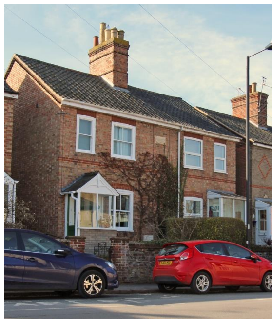
Alexandra Cottages, Nos.34-36 (even) Staithe Road

Nos.30-32 (even) Staithe Road. Semi-detached pair of houses constructed between 1892 and 1905. Gault brick façade with red brick dressings to otherwise red brick structure. Replacement windows in original openings. Black pan tiled roof. Nineteenth century red brick boundary wall to Staithe Rd.