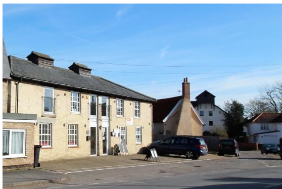
Staithe Business Suite, Staithe Road

setting of the grade II listed No.27. Subsidiary Structures Twentieth century garage not included.