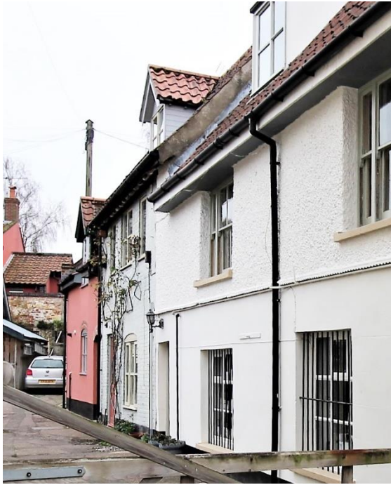
Nos.23-27 (odd) Earsham Street

Nos.23-25 Odd Earsham Street. A pair of altered c1800 cottages standing in a private courtyard to the rear of No.29. No.23 rendered and of a single storey with an attic lit by a gabled dormer. Late twentieth century window joinery. No.25, two storeys of painted brick with casement windows and a weatherboarded gabled dormer. The rear section of the plot on which this building stands is within the scheduled area of the Castle complex.