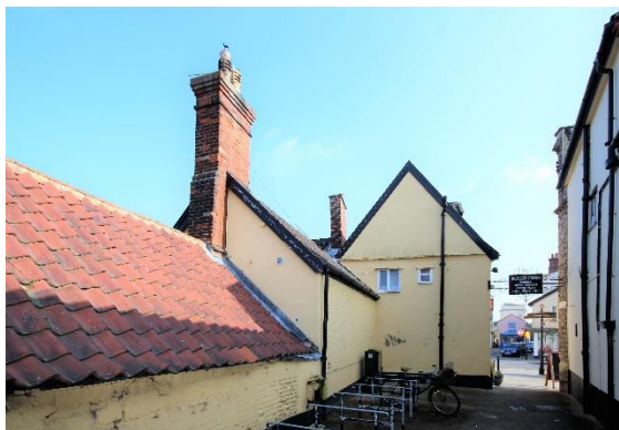
The White Swan, No.16 Market Place

roof. Honeywood F, Reeve C, & Reeve T, The Town Recorder, Five Centuries of Bungay at Play (Bungay, 2008) p146-147. . Honeywood F, Reeve C, & Reeve T, The Town Recorder, Five Centuries of Bungay at Play (Bungay, 2008) p95 & 143-147.