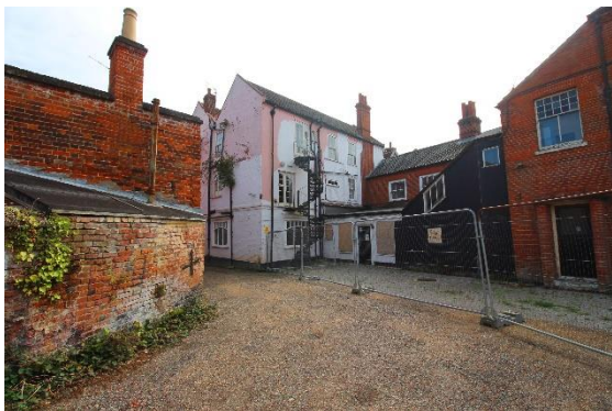
Courtyard façade, No.2 Market Place

No.2 Market Place and former Odd Fellows Hall to rear (grade II). An early eighteenth century former coaching inn which was until 2015 known as the Kings Head Hotel. It consists of two parallel ranges with a long rear wing facing a courtyard. The Market Place façade is of early eighteenth century date, and of three storeys and seven bays. Of red brick, with a plinth and a dentilled brick eaves cornice. Black pan tiles to roof and a single red brick ridge stack. Seven hornless twelve-light sash windows at first floor level with flush frames and flat arched lintels. Four similar windows to the second floor and six to the ground floor. Off-centre Six-panelled door in wooden Doric case with pilasters, a keyed architrave and a pediment. Return elevation with twin gables. Rear elevation with twelve-light hornless sashes to first and second floors.