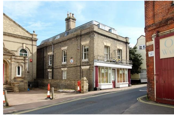
No.7 Trinity Street

Former Wesleyan Methodist Chapel, Trinity Street and boundary wall to Borough Well Lane. Former Wesleyan Methodist Chapel with basement schoolrooms built 1836, re-fronted and refitted 1904. Repaired after 1940 bomb damage, in 1948. Closed 1976, when some fittings were removed to Emmanuel Church. Façades to Trinity Street and Borough Well Lane which are well preserved and retain the bulk of their original joinery and stained glass. Its Trinity Street façade terminates views along Cross Street. Pedimented gault brick façade to Trinity Street of three bays with corner pilasters capped by ball finials. Three arched casement windows with pronounced keystones. Pedimented projecting single storey porch. Elevation to Borough Well Lane of an additional storey and faced in red brick. Tall nineteenth century gault brick boundary wall to Borough Well Lane of considerable townscape value. Red brick retaining walls to rear of lesser interest. Honeywood F, Morrow P, & Reeve C, The Town Recorder, A History of Bungay in Photographs (Bungay, 1994) p17 & 27. Bettley, J, and Pevsner, N, The Buildings of England, Suffolk: East (London, 2015) p.157.