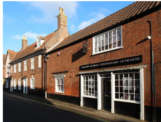
Nos.1-3a (Odd) Upper Olland Street

roundels, and a mutular cornice. Interior: fine enriched early eighteenth century mantel and cupboard with enrichment and 1/4 domed head with shell ornament.