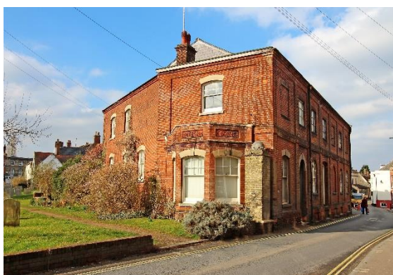
Trinity Street elevation of Owle's Warehouse

Owles Warehouse, including No.4 Trinity Street. Warehouse with attached house of red brick, with a Welsh slate roof. On the corner of Cross Street and Trinity Street. Built c1890 it replaced a large c1730 townhouse. Three bay gabled façade to Cross Street with a Diocletian widow to the gable. Seven bay façade to Trinity Street divided by pilasters rising from a plinth. Platt band above ground floor windows and heavy cornice. Windows and doors set beneath arched lintels, those to the house dressed in stone. House has principal elevation facing out over the churchyard. Four bays with splayed corner to Trinity Street with a canted bay window. A well-preserved industrial building of unusual design. Honeywood F, Morrow P & Reeve C, The Town Recorder, A History of Bungay in Photographs (Bungay, 1994) p159.