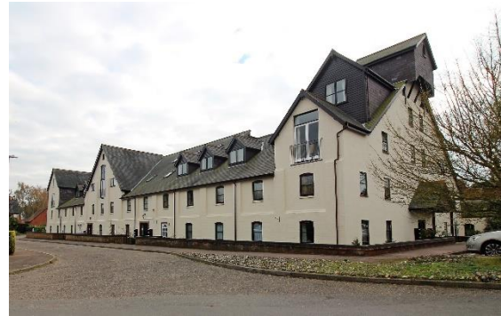
Nos.1-23 (cons) The Maltings, Staithe Road

Nos.1-5 The Watermill, Staithe Road. Former provinder (or animal feed) mill of 1902 built for the Marston family, closed c1956 and now converted to apartments. Wheel and machinery removed. Its watercourses have been partially filled in and turfed over. Painted brick and weatherboarding. Twentieth century wooden casement windows. The site has long been occupied by water powered mills, the previous one being destroyed by fire c1900.