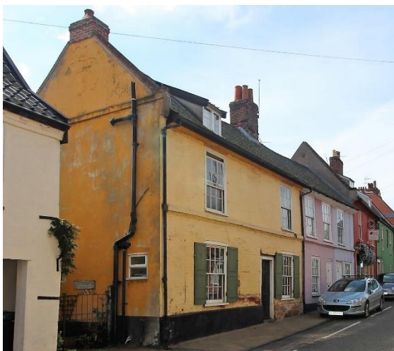
Nos.18-22 (even) Bridge Street

Nos.16-22 (even) Bridge Street (grade II). Three cottages, two within front range and No.22 at the rear. Early eighteenth century, of two storeys and an attic. Black pan tiled roof with a single flat roofed dormer to No.20. Colour-washed brick, with a moulded brick platt- band. Part with later applied projecting plinth. Nos.16-18, have their original sixteen-light hornless sashes at first floor level. To the ground floor centrally placed four panelled doors flanked by similar flush framed hornless sash windows with flat lintels. No.20 has two sixteen-light hornless sash windows to each floor. Those to the ground floor having panelled shutters. Centrally placed six-panelled door with near-flush frame. Scarring of former window openings with segmental heads visible in front wall to both ground and first floors of No.20. Lower range to the rear. Nos.2, 4, 6a & 6b, 12 to 20 (even), 24 to 34 (even) 40 to 44 (even), 48 and 50 form a group.