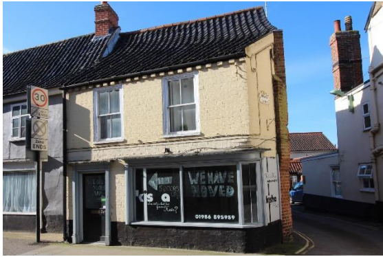
No.2 Upper Olland Street

No.2 Upper Olland Street (grade II). A seventeenth century structure with a nineteenth century façade of painted brick. Standing on the southern corner of Quaves Lane. Black pan tiled roof, dentilled eaves cornice, red brick chimney stack. First floor windows now plate-glass hornless sashes. Early nineteenth century wooden doorcase and shop fascia with pilasters and delicate entablature. Nos.2 to 10 (even), 14, 16 and Nos.20 to 24 (even) form a group. Honeywood F, Morrow P, & Reeve C, The Town Recorder, A History of Bungay in Photographs (Bungay, 1994) p185.