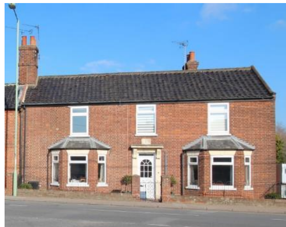
No.15 St John's Road

No.13 St John's Road. A red brick early to mid-nineteenth century cottage with a black pan tiled roof. Three bay two storey façade with central door. Doorcase with pilasters. Late twentieth century casement windows in original openings. Late twentieth century boundary wall to street not included. Prominently located at the termination of Bardolph Road.