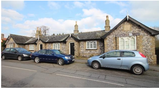
Dreyers Almshouses, Nos.9-17 (odd) Staithe Road

Dreyers Almshouses, Nos.9-17 (odd) Staithe Road (grade II). Single storey alms house block of 1848 faced in square knapped flint with gault brick dressings. Endowed by Eliza Dreyer for the widows of poor tradesmen. Seven-bay façade with gabled porches, outer bays gabled and slightly projecting. Gothic casement windows with three pointed lights. Octagonal shafts to chimneys with capping and drip moulded bases. Plinth. Near-flush-frame doors with cambered arches. Inscribed stone tablets in flank gables with date. Roof of octagonal Welsh slates, bargeboards with spear finials. Further gabled porches to return elevations.