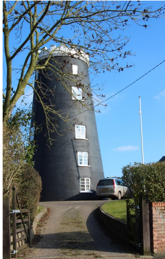
Tower Mill, Tower Mill Road

Tower Mill, Tower Mill Road (grade II). A former wind powered corn mill of c1830. The mill was in use until c1918 but its boat shaped cap, sails, fantail, and top storey were reputedly removed soon after. Now converted into a dwelling. Now a five-storey circular tower with c1924 crenellations, painted brown brick. Formerly linked to the adjoining single storey red brick engine house by a drive belt enclosed in a boarded wooden frame. Subsidiary Structures Later nineteenth century single storey red brick engine house now converted to a dwelling. This provided auxiliary power to the mill.