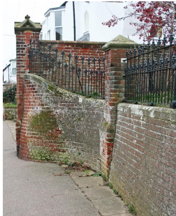
Detail of boundary wall Bungay Primary School, Wingfield Street

1914 (Kindred, Ipswich, 1991) p155. Honeywood F, Morrow P & Reeve C, The Town Recorder, A History of Bungay in Photographs (Bungay, 1994) p99-100, & 105.