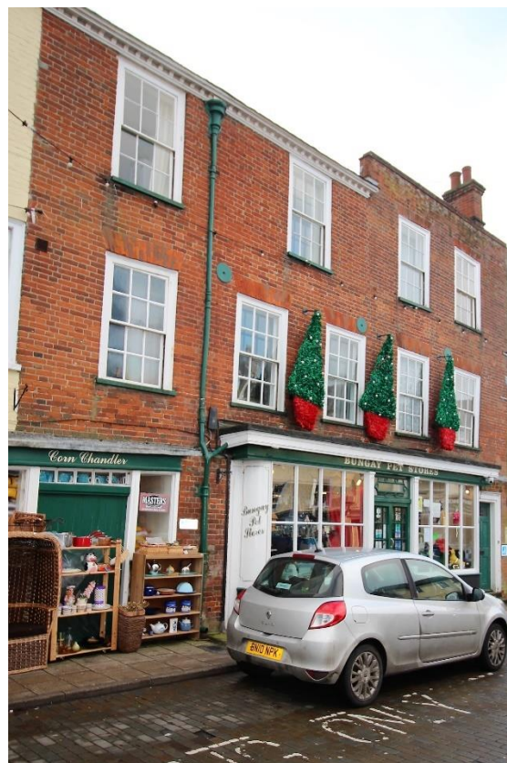
Nos.17-21 (Odd) Market Place

pilasters and entablature. Nineteenth century glazing bars, except to patterned fanlight. No.15 is described in the listing entry but its numbering is incorrect.