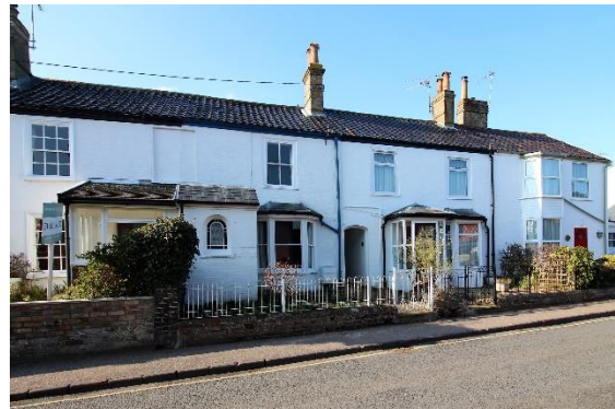
Nos.13-19 (Odd) Wingfield Street

Nos.5-11 (Odd) Wingfield Street (grade II). An early nineteenth century two storey terrace. Suffolk yellow brick, black pan tiles. Central blind panel at first floor level flanked by twelve-light hornless sashes within flush frames, flat arches at ground floor. Six-panelled doors in solid frames, set back in reveals, with blank tympana and arches. Nos.5 to 11 (odd) and No.14 form a group.