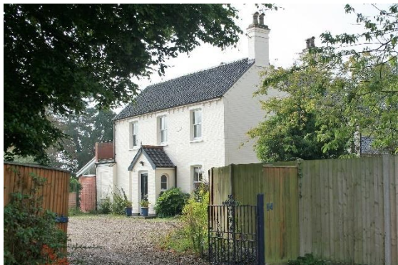
No.14 Wharton Street

garden wall to No.11a. Bettley, J, and Pevsner, N, The Buildings of England, Suffolk: East (London, 2015) p.157. Honeywood F, Morrow P & Reeve C, The Town Recorder, A History of Bungay in Photographs (Bungay, 1994) p109. Reeve C, Bungay Through Time (Stroud, 2009) p65.