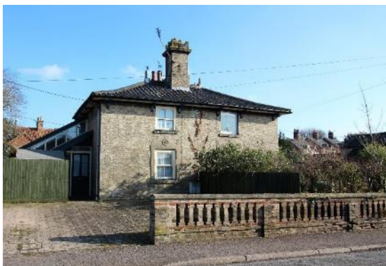
Nos.17 & 19 Flixton Road

Autumn Cottage, No.13 Flixton Road (grade II). A pair of semi-detached cottages; now converted to a single dwelling. Early nineteenth century. Symmetrical two storey, and three-bay principal façade with a hipped black pan tile roof. Central white brick stack rising from former spine wall and façades of Suffolk white brick. Eaves soffit. Two windows, casements in reveals with flat- arches. Plain door, left, in reveals with flat arch. Central arched blank panel at ground floor. Former entrance (to former No.15) filled in. Nos.9 to 13 (odd) form a group.