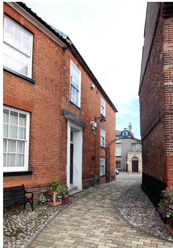
No.10 Earsham Street

No.10 Earsham Street. A red brick two and three storey structure of mid to late eighteenth century date formerly part of the service range of the grade II listed No.12 Earsham Street. Simple wooden doorcase and hornless sash windows. The listed status of this range is not clear.