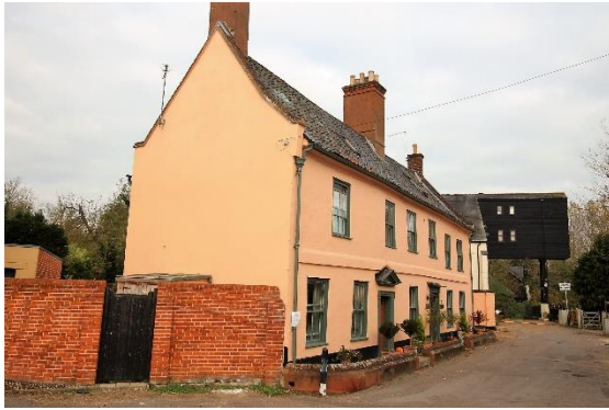
Nos.51 & 53 Staithe Road

Nos.51 & 53 Staithe Road. (grade II). Originally one early eighteenth century dwelling. Two storey, six bay façade, pebble dash on red brick. Platt band below first floor windows, plinth, and a coved cornice. Black pan tiled roof of steep pitch with overhanging eaves. Four-light sashes in flush frames, rendered flat arched lintels to ground floor windows. No.51, six-panelled door, with an eared architrave and a pediment. No.53, six-panelled door in a wood case with slender pilasters and a cornice. red brick chimney stacks. Subsidiary structures. Boundary walls appear to be later twentieth century red brick.