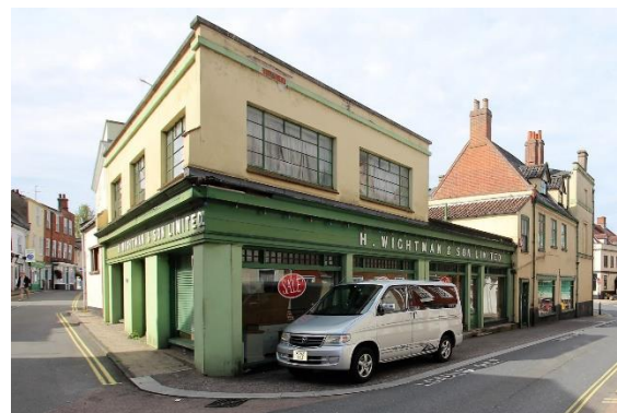
Nos.2 & 2a Trinity Street with No.5 Market Place in the distance

No.2 Trinity Street (grade II). Seventeenth century and of two storeys with an attic lit by two gabled casement dormers. Limewashed brick, band cut away, plinth. Wooden cornice, black pan tiles, three first floor original mullioned and transomed casements. Six-panelled door in wing, left. Two late twentieth century plate glass shop windows to the ground floor. (See also No.5 Market Place).