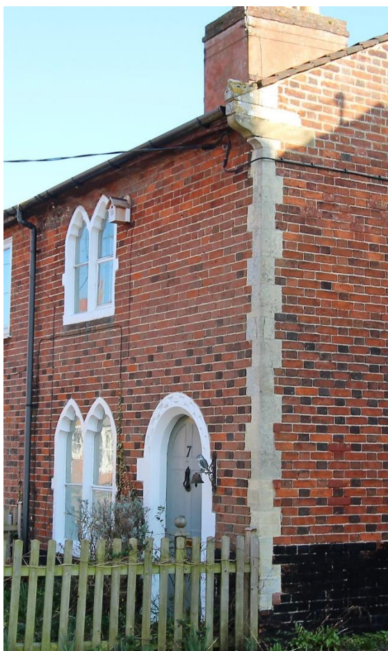
No.7 Southend Road

No.7 Southend Road. A mid-nineteenth century cottage which forms part of a semi-detached pair with the much altered No.5 (not included). Red and blue brick with painted stone dressings and quoins. Shallow pitched Welsh slate roof with deep overhang to eaves. Neo-Norman arched doorcase. Six-paneled door. Pointed arched windows divided by central splayed mullion.