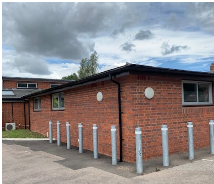
Framlingham Medical Centre Extension