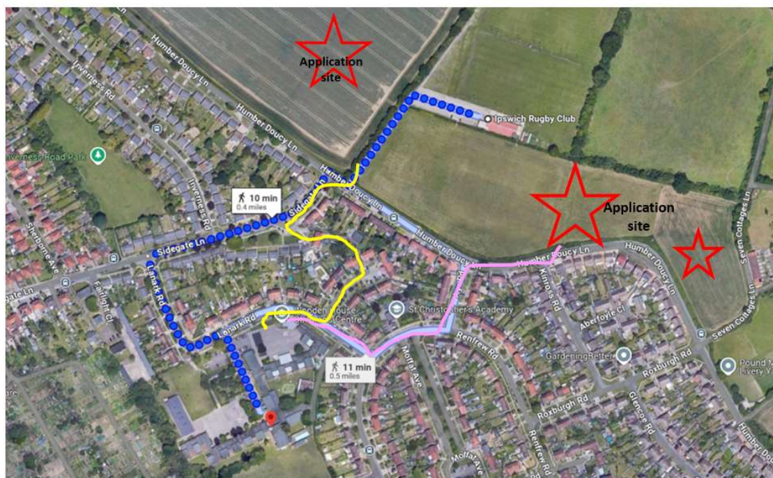
Walking routes from application site- Key Destination Rushmere Hall Primary School

We assume that the Inspector would wish to walk these, initially unaccompanied, but with the potential to return to specific parts of the routes in the light of any discussion on off-site measures at the Inquiry.