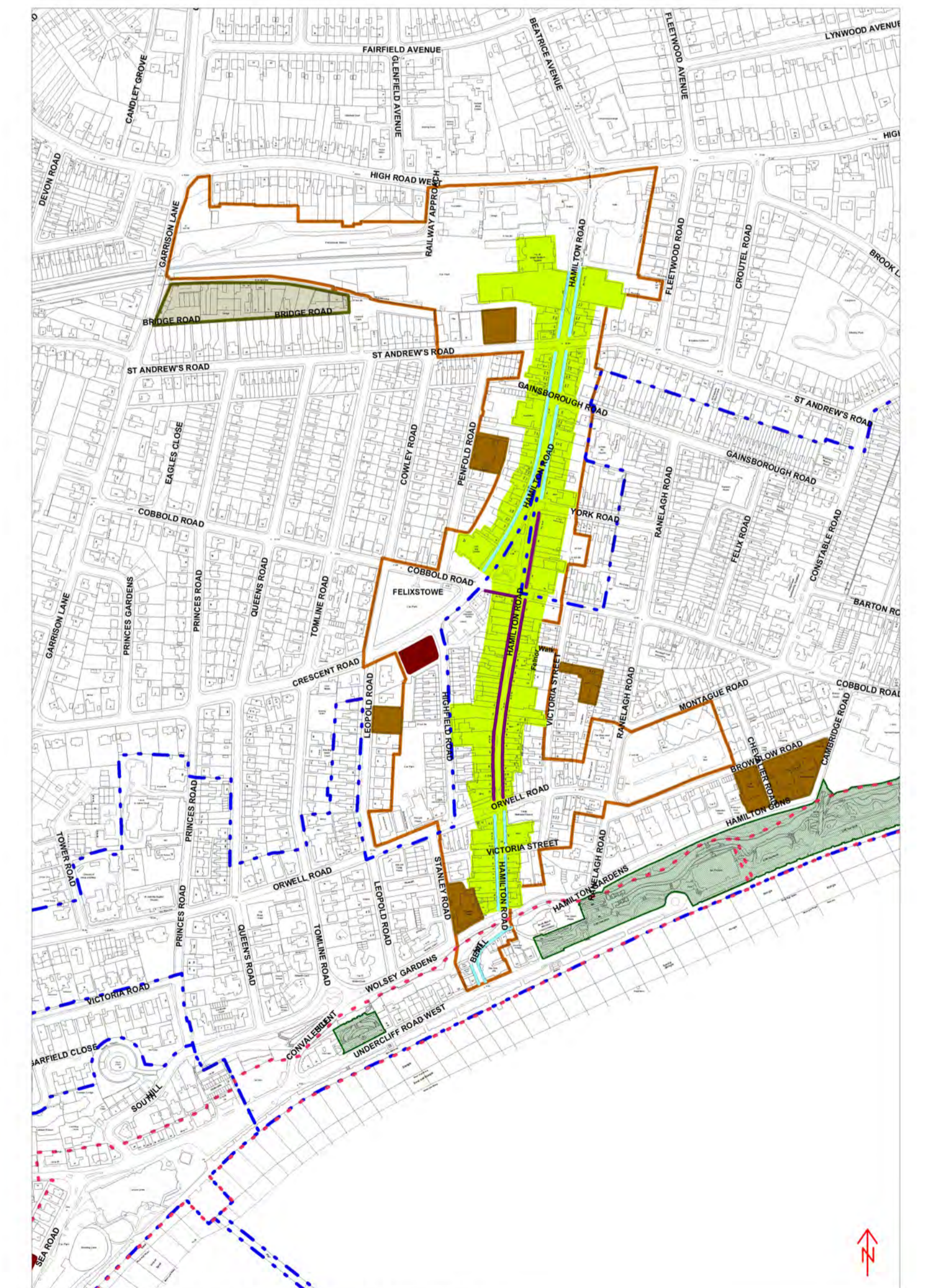
Town Centre Inset Map - not to scale

On 1 st April 2019, East Suffolk Council was created by parliamentary order, covering the former districts of Suffolk Coastal District Council and Waveney District Council. The Local Government (Boundary Changes) Regulations 2018 (part 7) state that any plans, schemes, statements or strategies prepared by the predecessor council should be treated as if it had been prepared and, if so required, published by the successor council. Therefore this document applies to the part of the East Suffolk Council area formerly covered by the Suffolk Coastal District until such time that it is replaced.