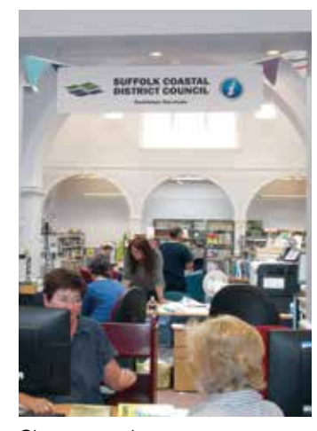
Share your views

Now, the councils are asking everyone in the two districts to tell them what they think, as part of an engagement campaign which is running until December 12th.