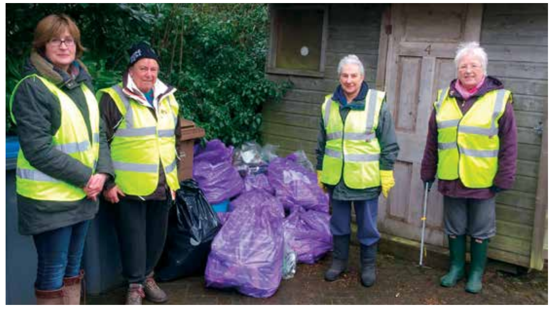
Well done to all our winners including the Kirton & Falkenham WI

The 'Love East Suffolk' litter pick scheme designed to encourage more community groups to get involved in taking care for their environment, has been hailed a success.