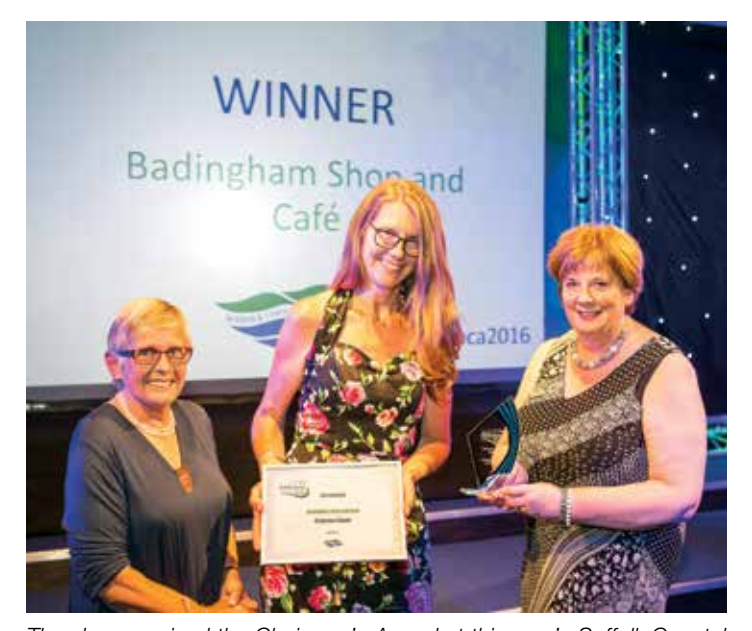
The shop received the Chairman's Award at this year's Suffolk Coastal Business & Community Awards

The Badingham community celebrated the opening of their new shop and café in June – a project which benefitted from Suffolk Coastal's Enabling