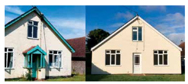
The Housing Team have been working with the owner of this property to help bring his home back into use

Grants of up to £10,000 are also available to help owners of empty properties carry out essential repairs