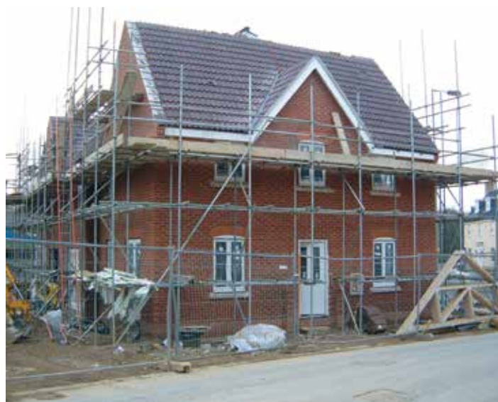
Suffolk Coastal have allocated £1.6.8M to building affordable homes

"This is a complex area where, even when we do our part by giving developers planning permission, we cannot force them to build. So many affordable homes are not built, despite our best efforts."