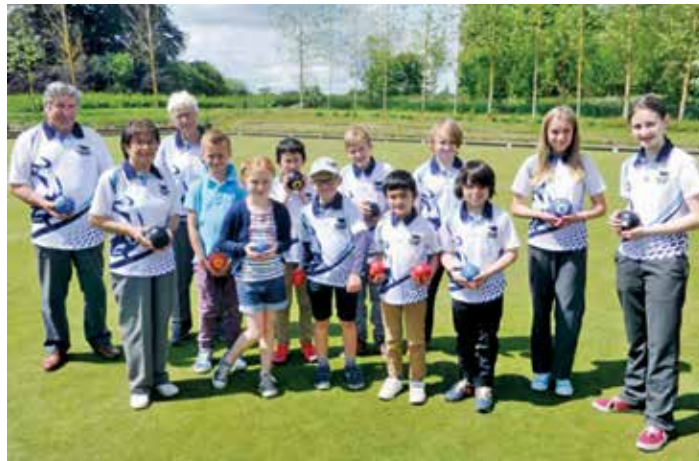
Some of Yoxford Bowls Club's junior members