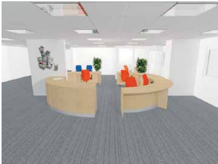
An artist's impression of the new Customer Services in Woodbridge Library

The development will incorporate a new shared helpdesk for library and council staff, a new private interview room and a quieter dedicated area for