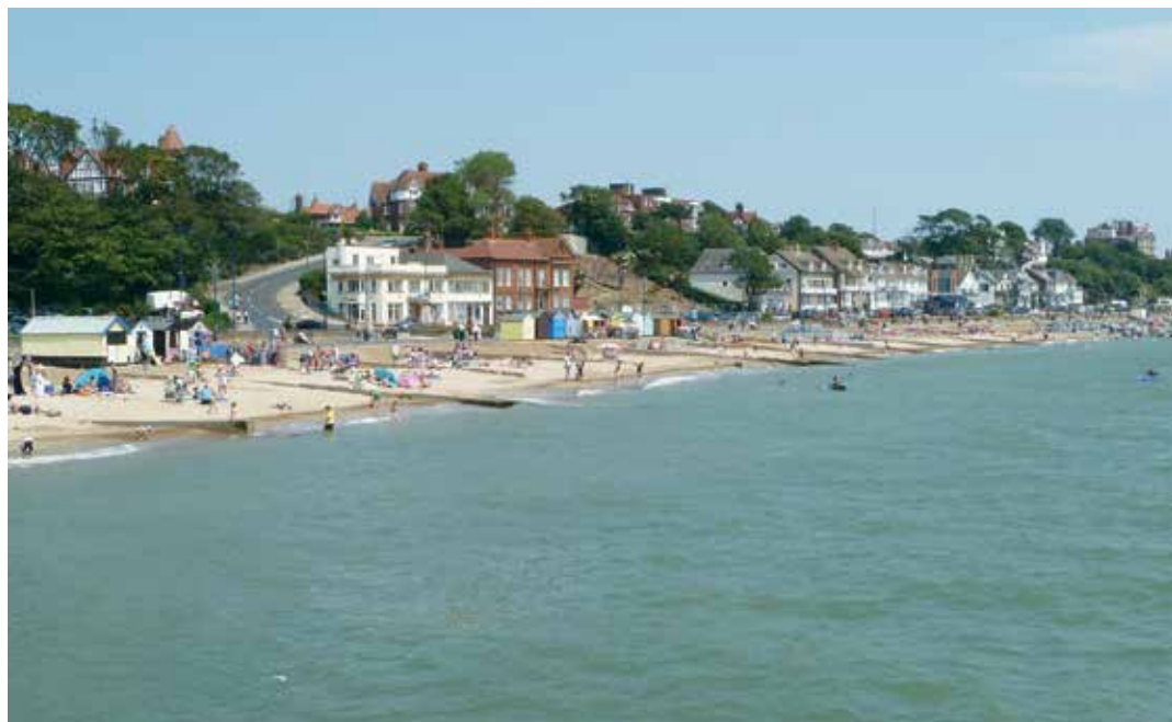
Coastal Community Teams across East Suffolk are celebrating this boost in funding.