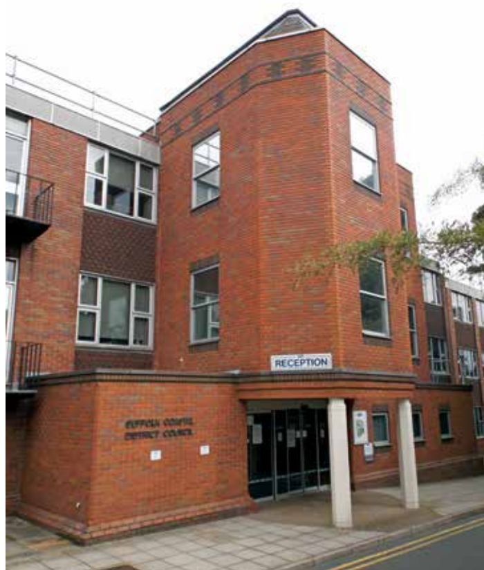
Suffolk Coastal will be moving out of its Melton Hill offices later in the year

The plan is to create about 70 new homes on this site, of which about 33% will be affordable homes. The company intends to start its planning and design process immediately. This will include engaging in a 12-week community consultation process to inform the layout and design proposals.