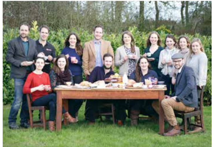
Young Producers Group - Image courtesy of Keiko Oikawa

The children's viewing sculpture at Snape Maltings entitled 'Myriad' is now closer to becoming a