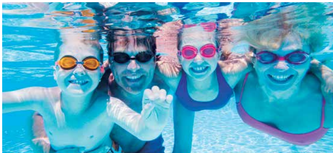
Thank you to all who came along to the open day in January!

People also had the chance to try out activities such as bowls and group workout sessions.