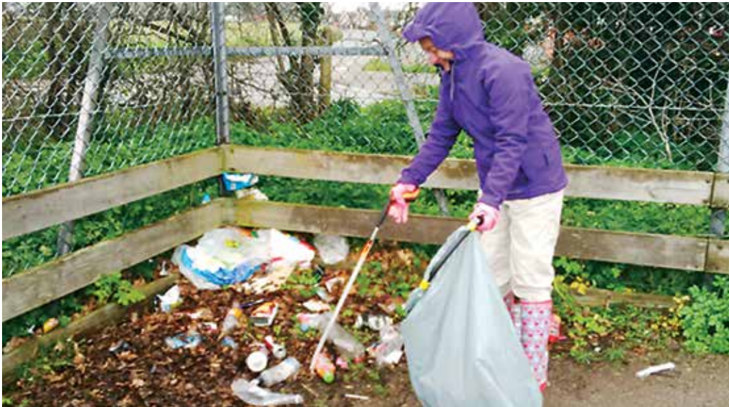
Volunteers play a big part in helping to look after our environment

People across East Suffolk will this spring be rewarded for showing love for the environment we live in.