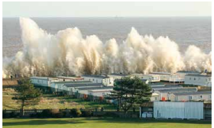
BERT can help businesses better prepare for events like flooding

If you would like to find out more about BERT and how it can support your business visit: www.getbusiness-