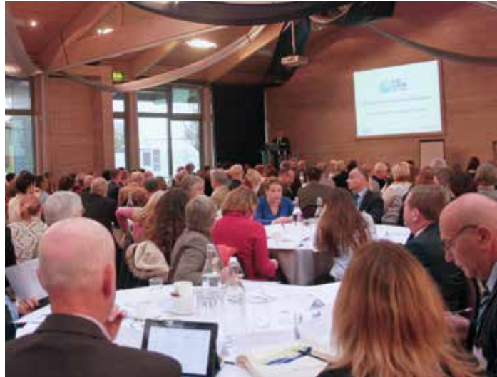
Delegates at the the East Suffolk Partnership forum in November 2015

The aim of the conference is to help build better partnership working in East Suffolk, allowing the delegates the opportunity to meet members of the East Suffolk Partnership Board, hear about progress in developing a collaborative