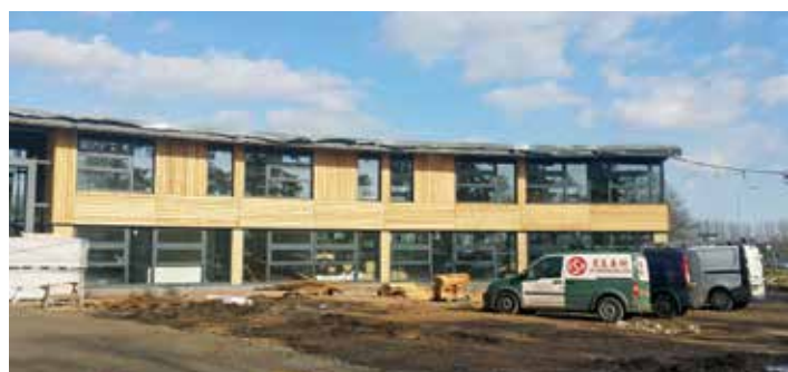
Work is progressing well at Suffolk Coastal's new offices

The work to build Suffolk Coastal's new headquarters, opposite Melton railway station, is progressing well.