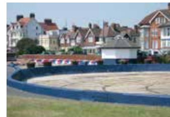
The boating lake in July 2014

"I'm pleased that the works will soon bring this site in line with a number of newly completed projects in Felixstowe and will further help to boost tourism in the town.