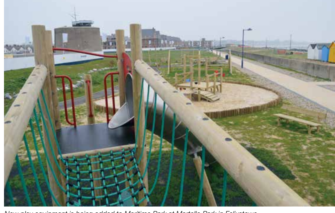
New play equipment is being added to Maritime Park at Martello Park in Felixstowe

This additional equipment is designed to complement the existing play area at Martello Park, but will also include specialist equipment to allow more inclusive play for mixed abilities, including wheelchair accessible equipment.