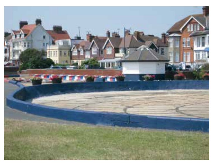
The boating lake in July 2014

An outdoor events area has been proposed for the area behind Felixstowe's Leisure Centre.