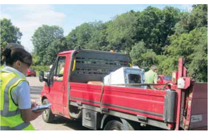
Operation Tip-Off in 2014

Local authorities across Suffolk continue to work with the Police to carry out inspections of vehicles as part of "Operation Tip-Off" to check any trader who transports is registered to do so with the Environment Agency.