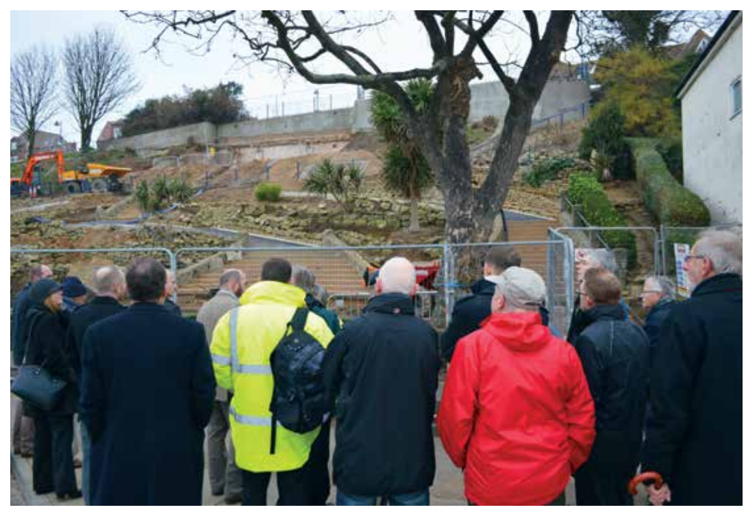
Tour of site on 4 December 2014

When Suffolk Coastal District Council consulted the people of Felixstowe in 2007, they identified the restoration of the Seafront