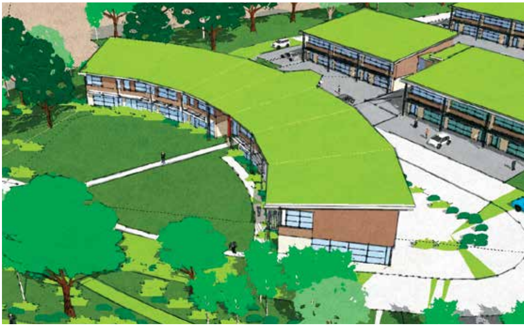
An artists impression of Suffolk Coastal's new headquarters

Now the contract is agreed, Suffolk Coastal's Melton Hill site will be put on the market, allowing the council to move into the new building late in 2016.