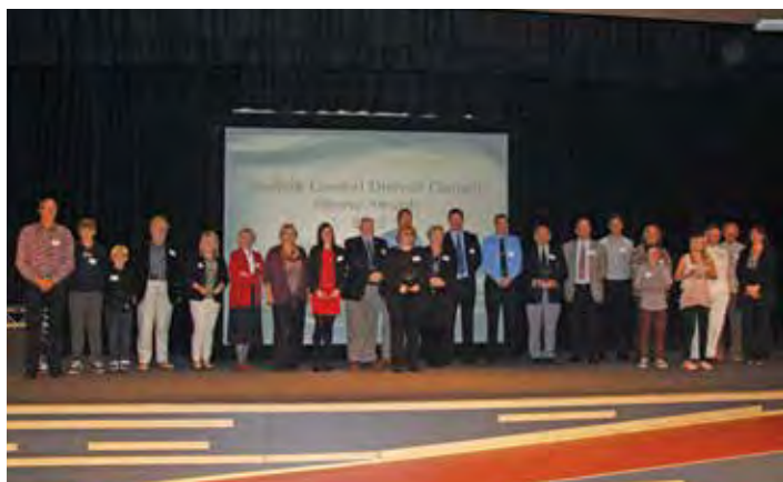
Some of the 2012 Sports Awards' winners

The sixth annual Suffolk Coastal Sport Awards ceremony saw nine winners on a night celebrating achievement from across the district.