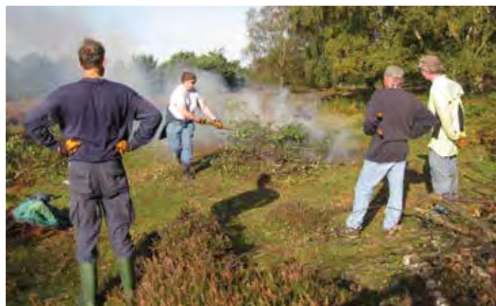
Volunteers working at Sutton Heath

The efforts of volunteers working through the winter has been praised for helping to keep some of the district's environmental jewels accessible to the public.