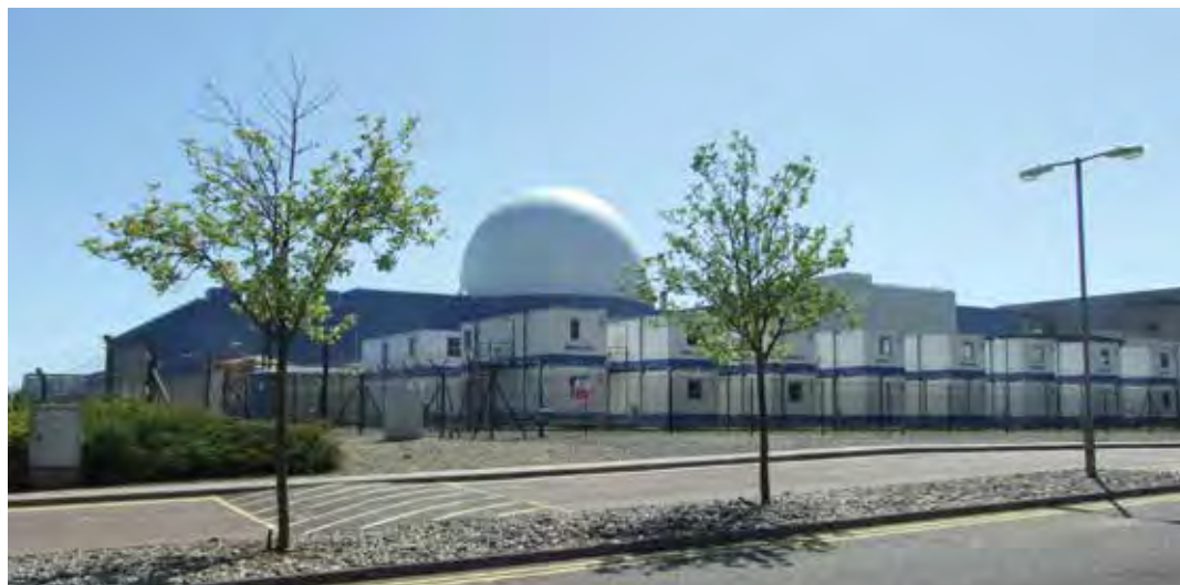
Sizewell C must blend in even better with the local environment than Sizewell B

"This is a golden opportunity for EDF to put in place measures that will help preserve our unique environment and power the drive for more local jobs and better infrastructure and transport services. We will insist that EDF fully takes on its role in making our district and Suffolk an even better place to live, work or play. All in all, EDF has a lot to do in order to get our unconditional