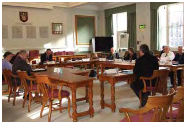
The Scrutiny Committee may have a smaller council to review

"I am proud that the majority could see the logic of putting in place a more business-like structure that could maintain and probably strengthen the links between councillors and their constituents. It once again shows we are ready to take tough decisions to make us more efficient and effective, as well as saving