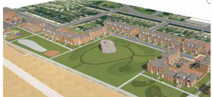
Artist's impression of the new Bloor plans for the South Seafront

In all, 97 three bedroom homes will be built, and 30 two bedroom flats, of which 13