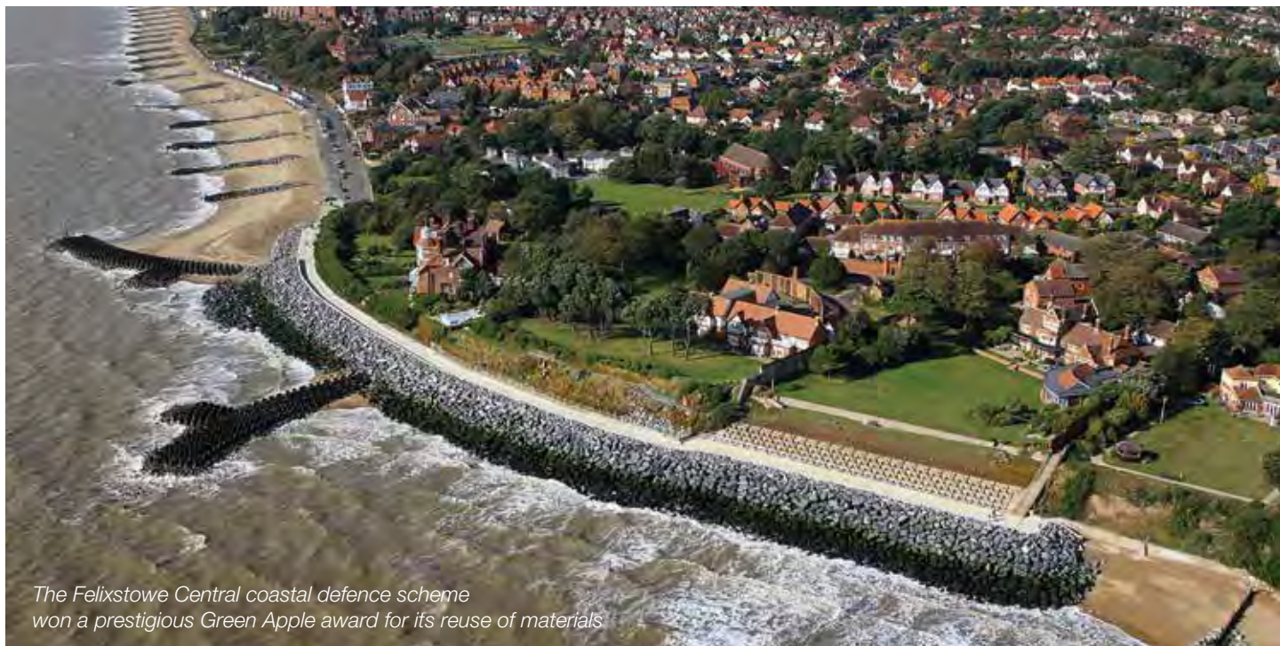
The Felixstowe Central coastal defence scheme won a prestigious Green Apple award for its reuse of materials