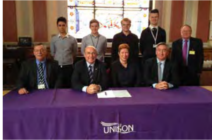
The two Council Leaders and apprentices were at agreement signing

signed an apprenticeship agreement with UNISON which confirms they will work in partnership to promote