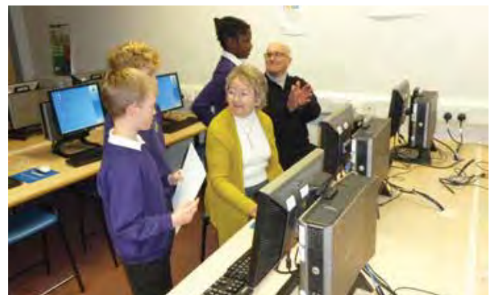
Children from Woodbridge Primary School help the silver surfers

information about the Silver Surfers scheme or to try and join one of the sessions can contact Gavin Lodge from AgeUK on 01473 298686.