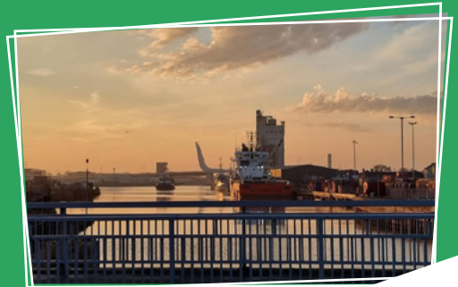
Photo competition winners capture beauty of East Suffolk!