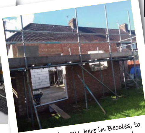
Work is underway here in Beccles, to adapt a three-bedroom property and add an extension for a tenant with particular physical requirements