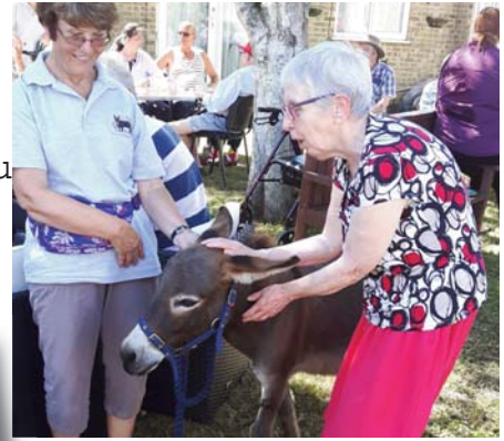
Two miniature donkeys, Alfie and Rubik from Miniature Donkeys for Wellbeing - made a special visit to Jubilee Court!