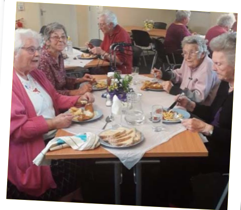
We own and manage 13 sheltered housing schemes, all with communal facilities. Last night was fish and chip night at Olland Court!

For more information about the service we provide and our ambitions for the future of housing in East Suffolk, take a look at our Housing Strategy. The