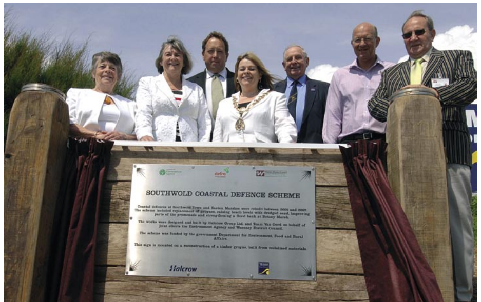
Members of Waveney District Council and Southwold Town Council celebrate the completion of the town's coastal protection scheme.

"I would like to thank the project team for their professionalism and commitment and our gratitude also goes to those active individuals within the local community for their contributions. I would also like to acknowledge the support of the wider community who endured some inconvenience and disruption during the construction period in a spirit of tolerance and co-operation."