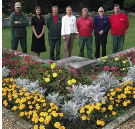
Members of the WDC Parks Team and the Oulton Broad In Bloom Committee at Nicholas Everitt Park.

Bungay, Lowestoft and Oulton Broad were the three entrants from Waveney and scooped seven awards between them. Bungay was awarded the Silver Gilt award (high standard, potential for gold) in the 'Towns' category and Oulton Broad gained a Silver award. Lowestoft achieved a Silver Award in the 'Coastal Resort' category. St Andrews Church Garden was the winner of the special award for the 'Best Community Project.'