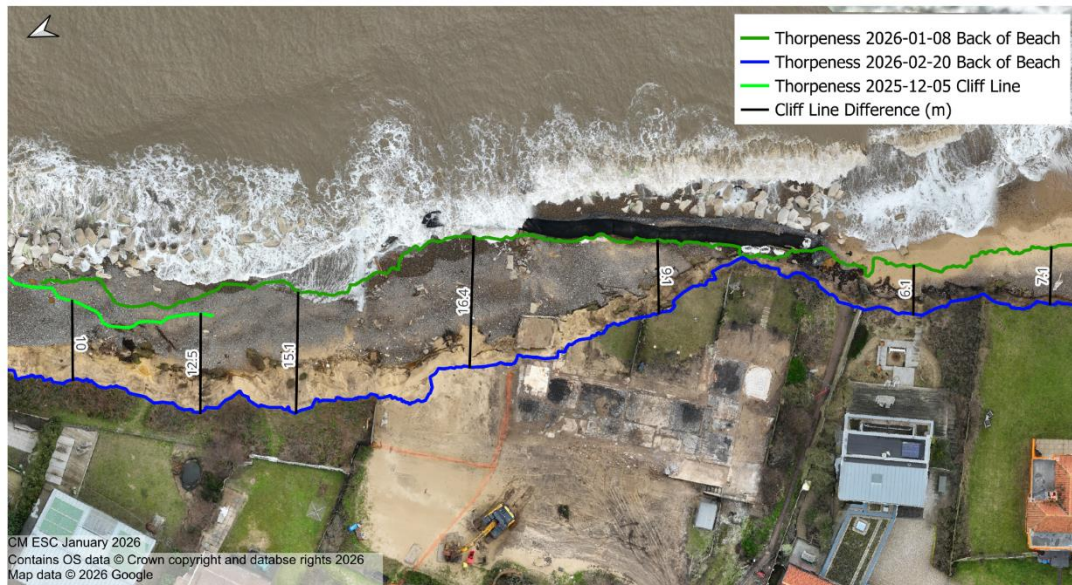
Thorpeness Back of Beach Line Difference December 2025 - February 2026