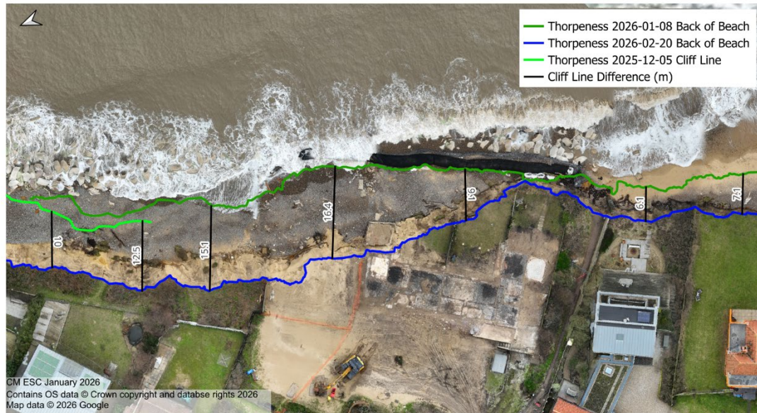
Thorpeness Back of Beach Line Difference December 2025 - February 2026